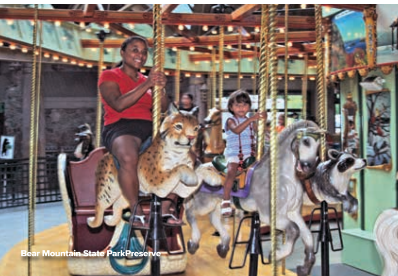
Bear Mountain State Park Preserve