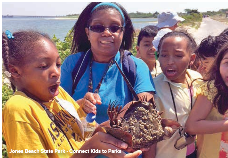
Jones Beach State Park - Connect Kids to Parks

New York also continues its to extend free State Park day-use entry to all fourth-grade students through acceptance of the Every-Kid-in-a-Park pass. Together, these programs have served nearly 100,000 New York youth in just two years.