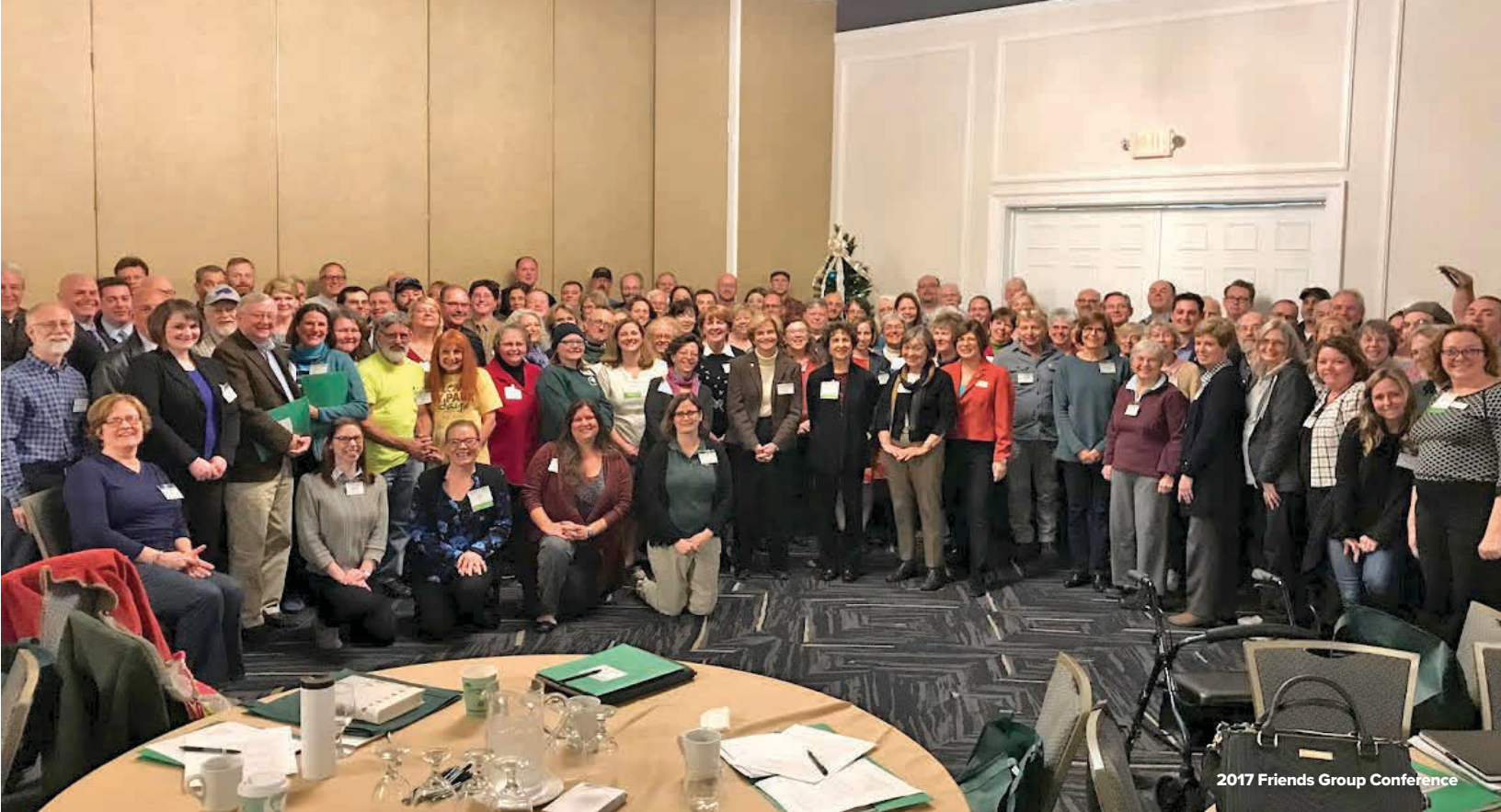
2017 Friends Group Conference

To leverage the grassroots support for State Parks, Governor Andrew M. Cuomo created the Park and Trail Partnership Grant Program in 2016. Funded through the Environmental Protection Fund, 20 partner organizations received $450,000 in 2017 to advance their work to raise private funds for capital projects; perform maintenance tasks; provide educational programming; and promote public use through hosting special events. Grants will be matched by over $200,000 in private and local funding. In December, Parks & Trails, New York and State Parks hosted a statewide conference of Friends Groups, with nearly 50 groups participating in a weekend of workshops and conversation on how to strengthen their organizations and the partnership with State Parks.