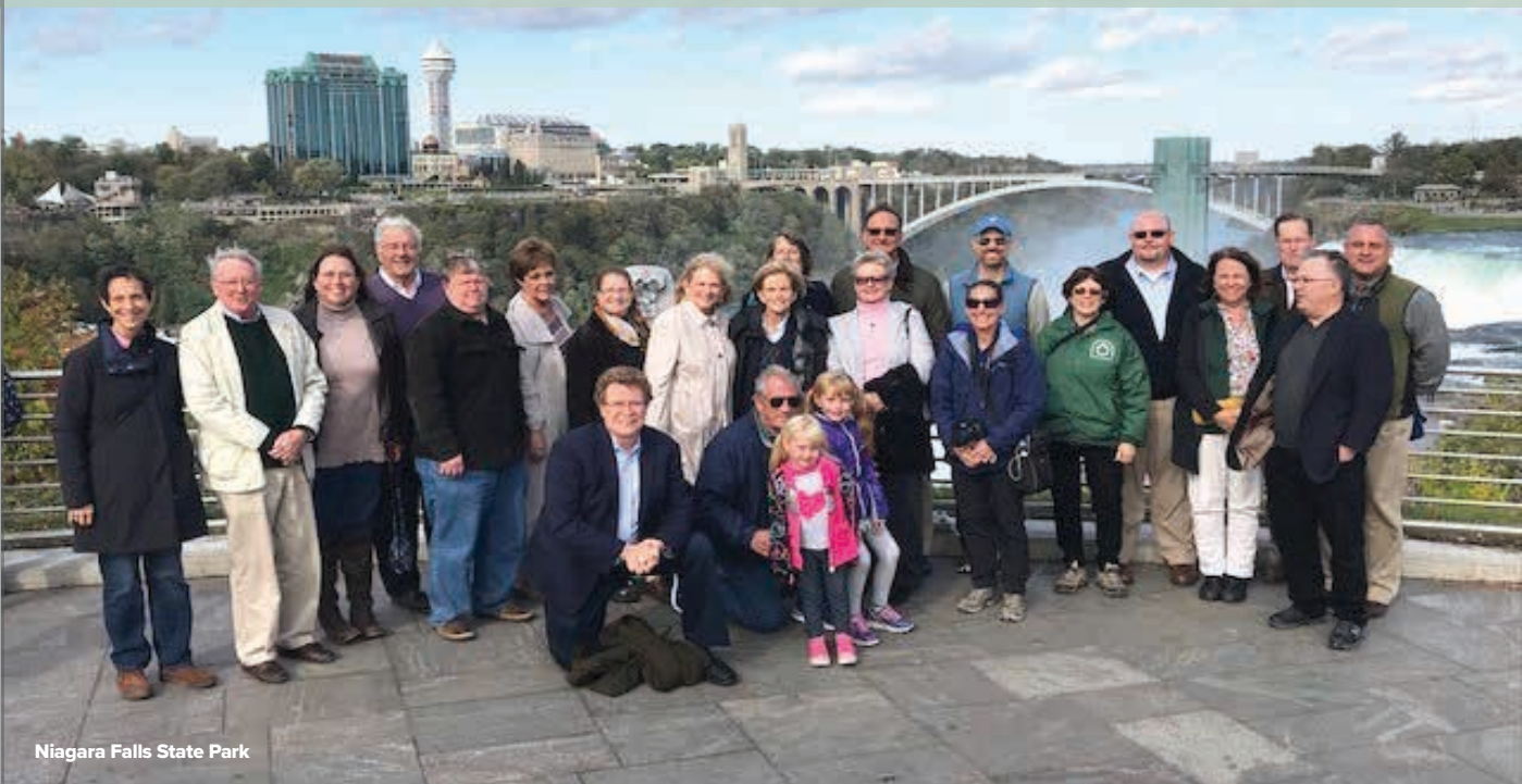
Niagara Falls State Park