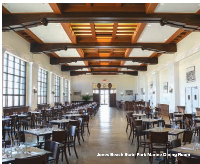
Jones Beach State Park Marine Dining Room