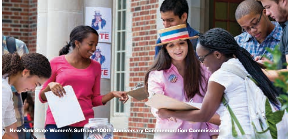
New York State Women's Suffrage 100th Anniversary Commemoration Commission