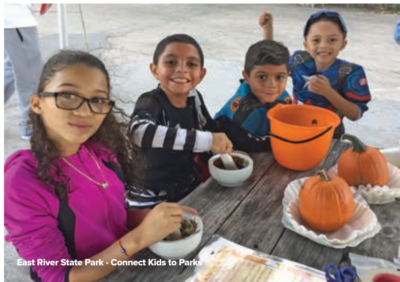
East River State Park - Connect Kids to Parks