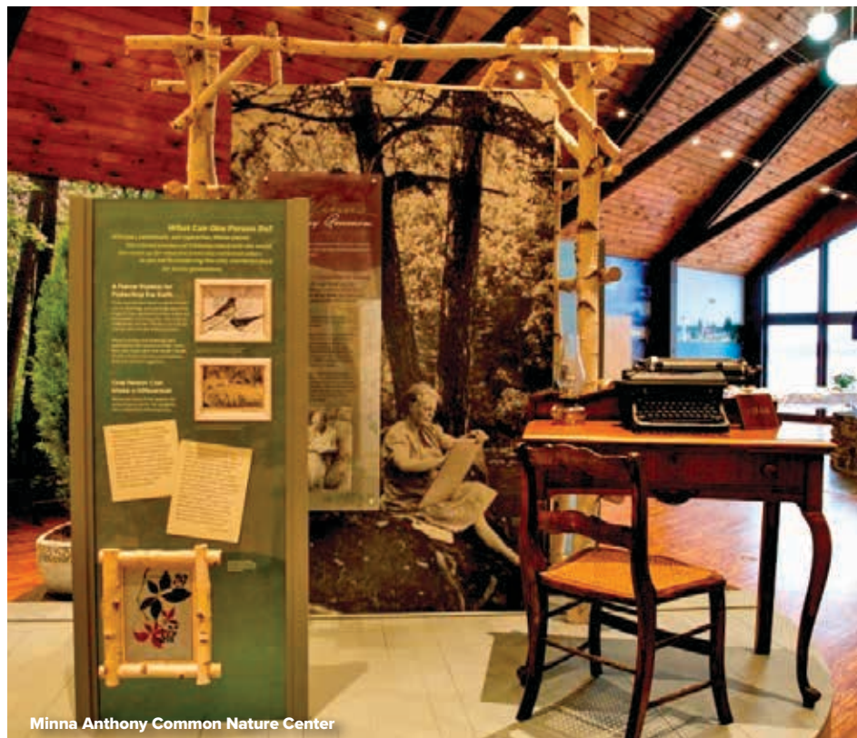
Minna Anthony Common Nature Center