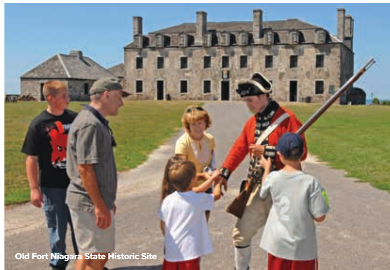
Old Fort Niagara State Historic Site