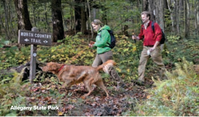
Allegany State Park