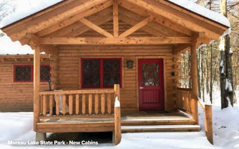
Moreau Lake State Park - New Cabins