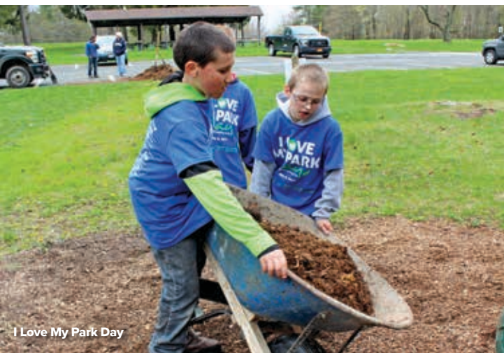
I Love My Park Day