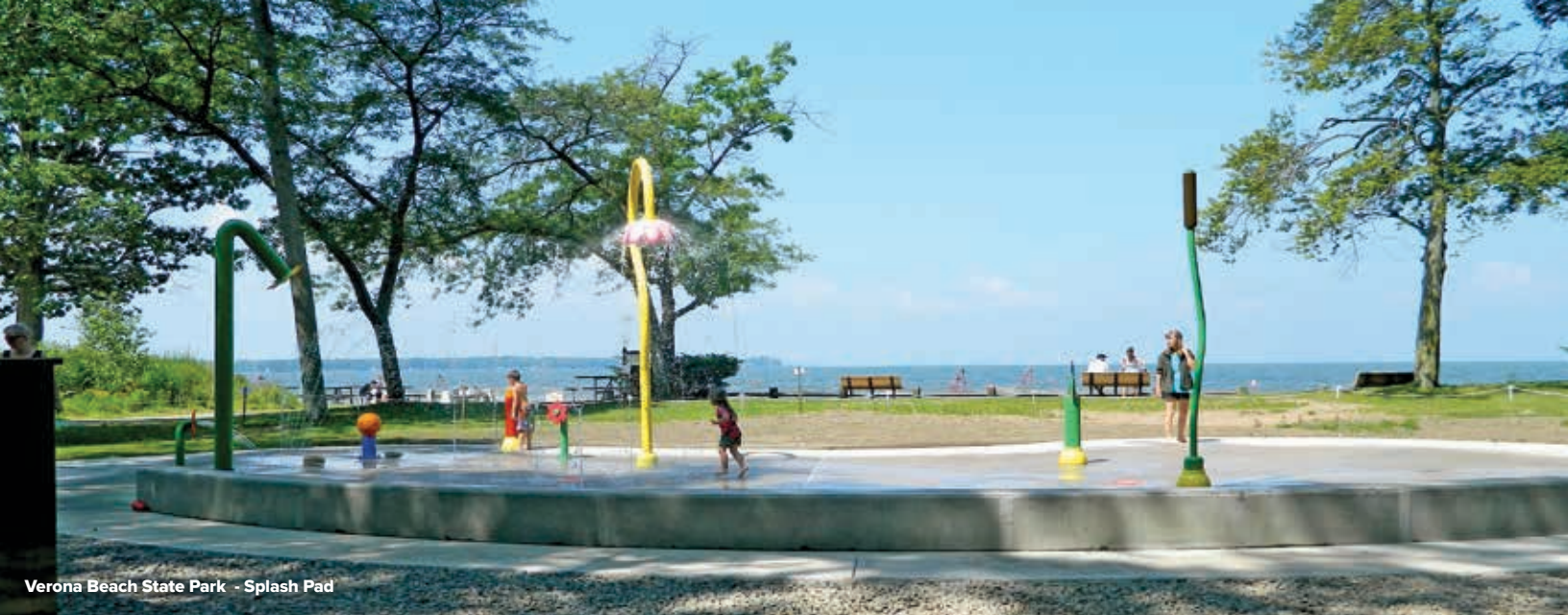
Verona Beach State Park - Splash Pad