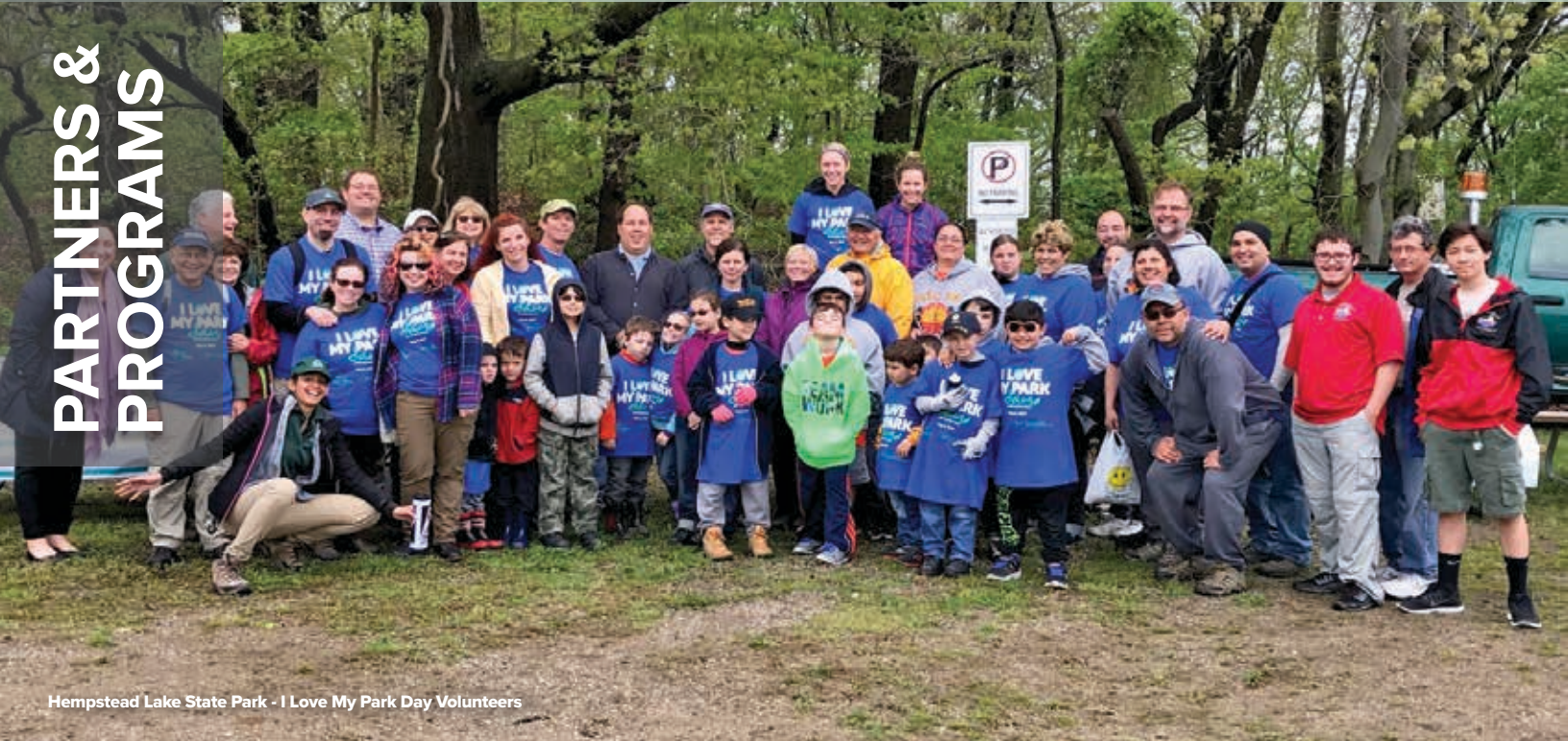
Hempstead Lake State Park - I Love My Park Day Volunteers