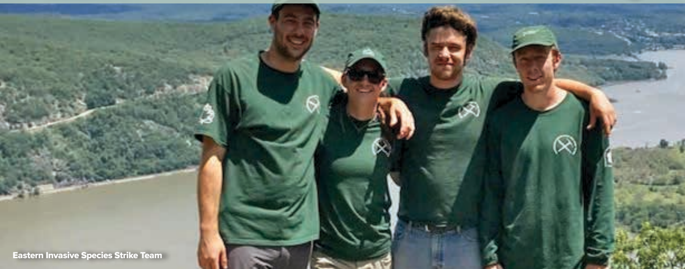
Eastern Invasive Species Strike Team