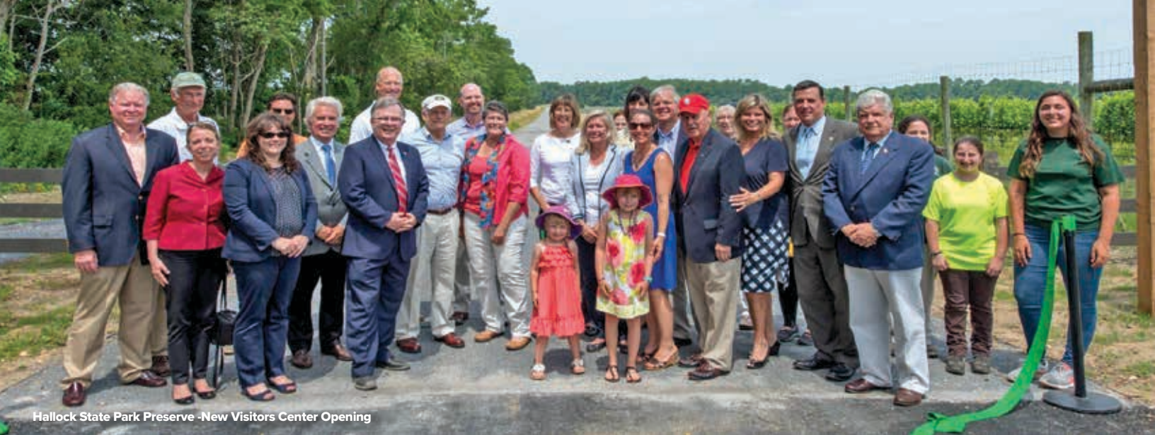
Hallock State Park Preserve -New Visitors Center Opening