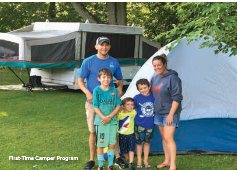
First-Time Camper Program

In 2017, 500 foster families received free State Park camping gift cards and Empire Passes, affording them the opportunity to enjoy state parks and outdoor recreation together. The Foster Family Park Access program is a partnership with the Office of Children and Family Services and was announced as part of Foster Care Appreciation Month last spring and we launched the First-Time Camper Program in partnership with the Department of Environmental Conservation which offered free camping to 40 families at select parks over eight summer weekends. The new campers were provided with a family tent, sleeping bags, sleeping pads, camp chairs, lantern, and even firewood. A Camping Ambassador met families at the campsite and help them get camp set up with a camping 101 lesson. Campers also had the opportunity to learn from experts how to fish, hike, bird watch, paddle and more, all while having fun and making memories that last forever.