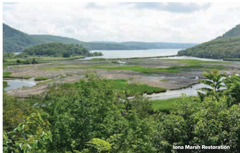
Iona Marsh Restoration