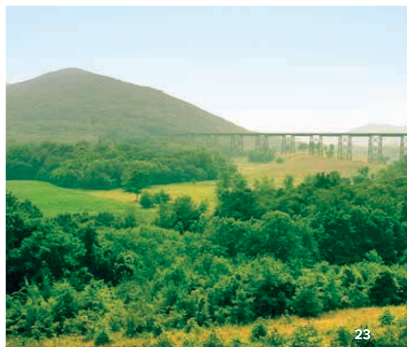
Schunnemunk State Park