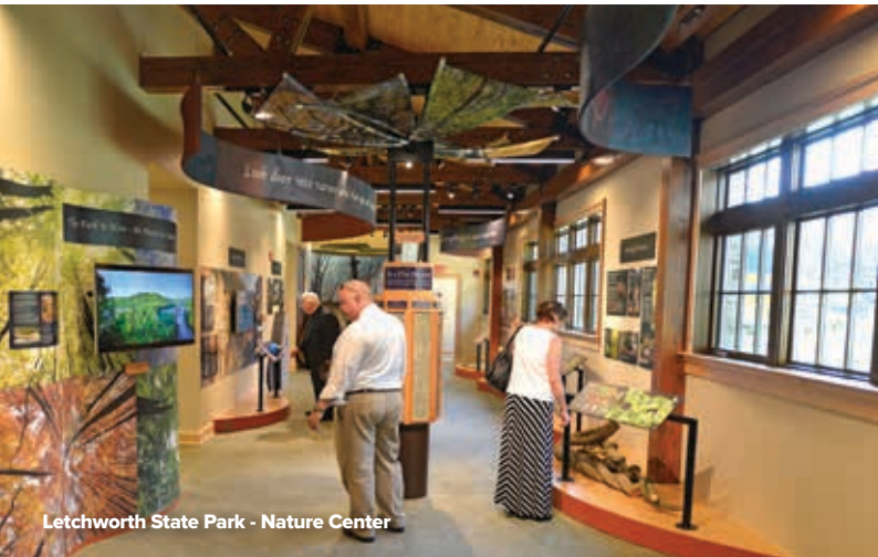
Letchworth State Park - Nature Center