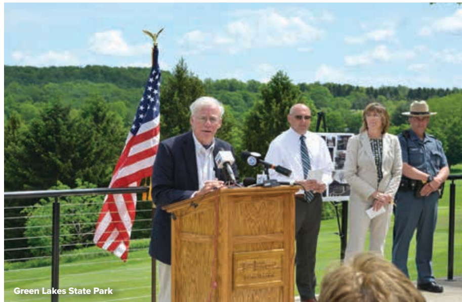
Green Lakes State Park

Construction began this year on a new environmental education center at Green Lakes State Park. The project is the next phase of a $16.9 million transformation of Central New York’s most-visited State Park. New York State Parks is converting a deteriorated 1940s boat house on Green Lake into an environmental education center and related improvements. The historic boathouse will be moved back from the water’s edge, where it is exposed to flooding, and renovated. The new center will include new indoor classroom/multipurpose space, kitchenette and restrooms as well as an outdoor classroom, lakefront boardwalk and canoe/kayak landing, new boat rental booth and storage racks, and a fishing pier. Other major improvements completed at the park include renovation of the golf course clubhouse, Pine Woods Campground, and park entrance.