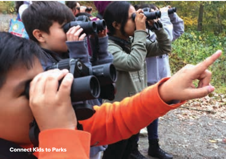
Connect Kids to Parks