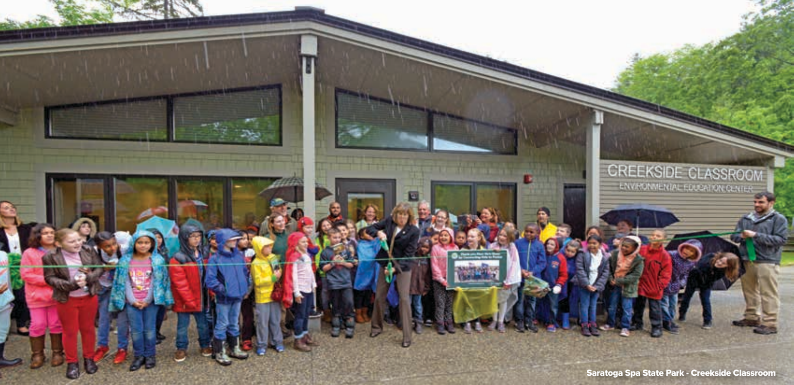
Saratoga Spa State Park - Creekside Classroom