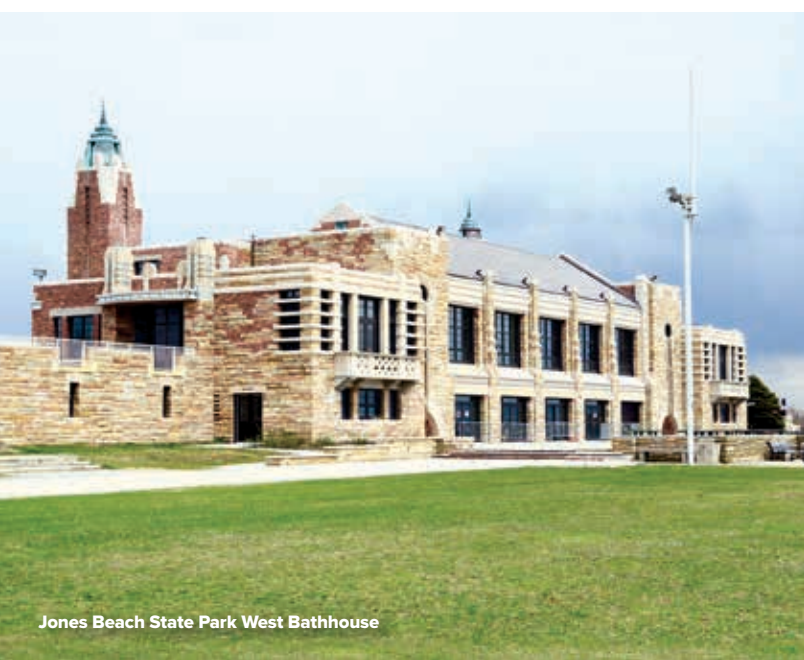
Jones Beach State Park West Bathhouse