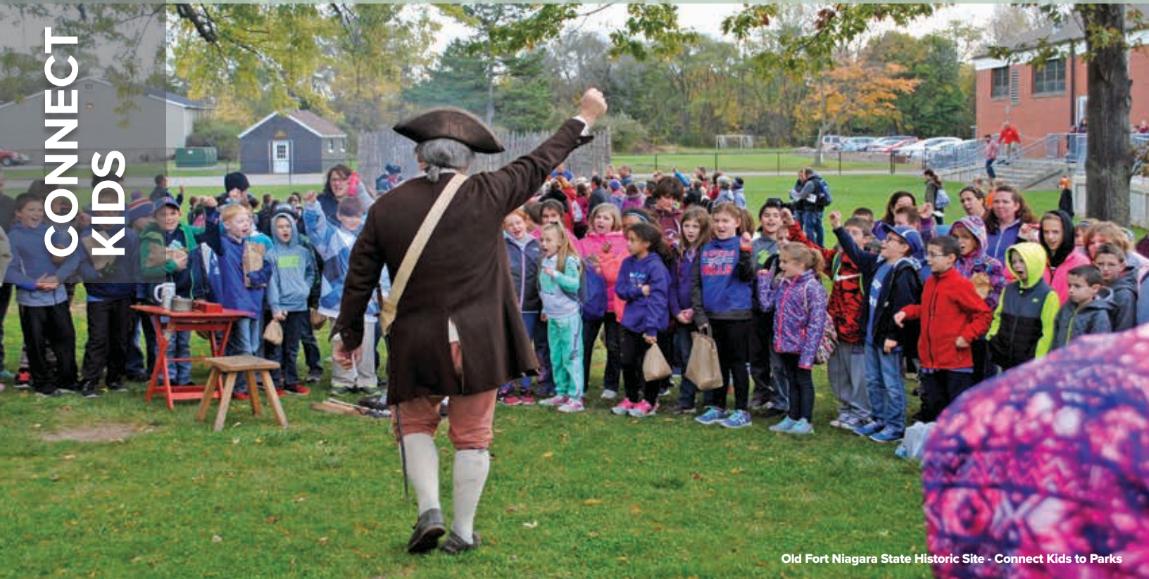
Old Fort Niagara State Historic Site - Connect Kids to Parks

In 2017, New York State launched the “Connect Kids to Parks” program to enhance educational and recreational opportunities for schoolchildren and help promote parks and historic places in every corner of the state. The program has four main goals: