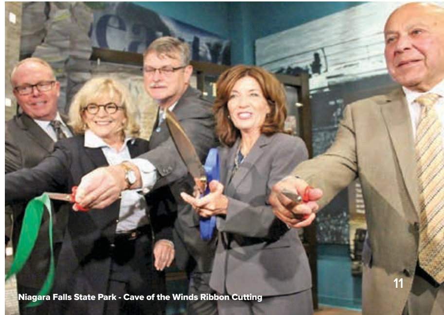
Niagara Falls State Park - Cave of the Winds Ribbon Cutting