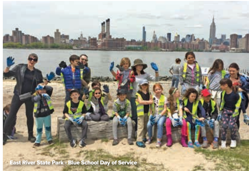
East River State Park - Blue School Day of Service

*The term "State Park system" as used in this report refers to New York's 250 state parks, historic sites, recreational trails and boat launch sites.