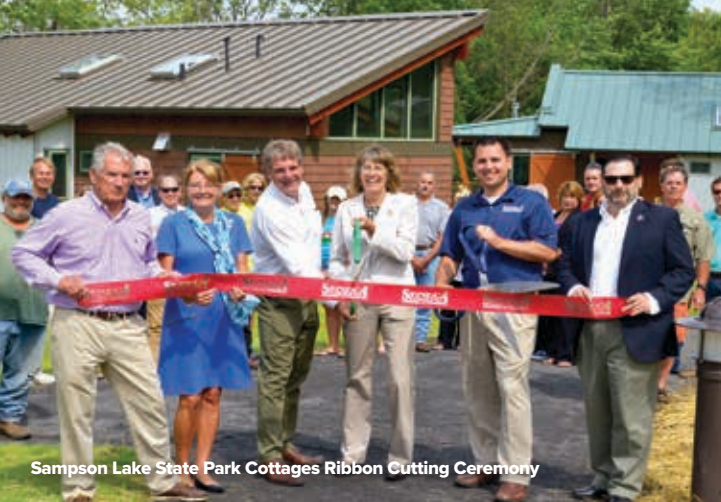
Sampson Lake State Park Cottages Ribbon Cutting Ceremony

Wherever state parks and historic sites have threatened or actual boundary (or certain visual or toxic) encroachments we will mobilize and form plans to stop them.