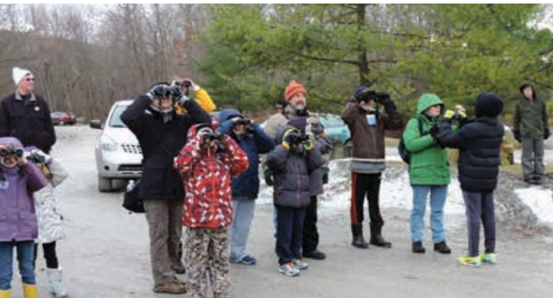
Friends of Fahnstock State Park - Winterfest Audubon

continue to be an integral part of the success of the state park system. Over 90 friends' groups provide funding and volunteers for park and historic site programs, events and special projects.