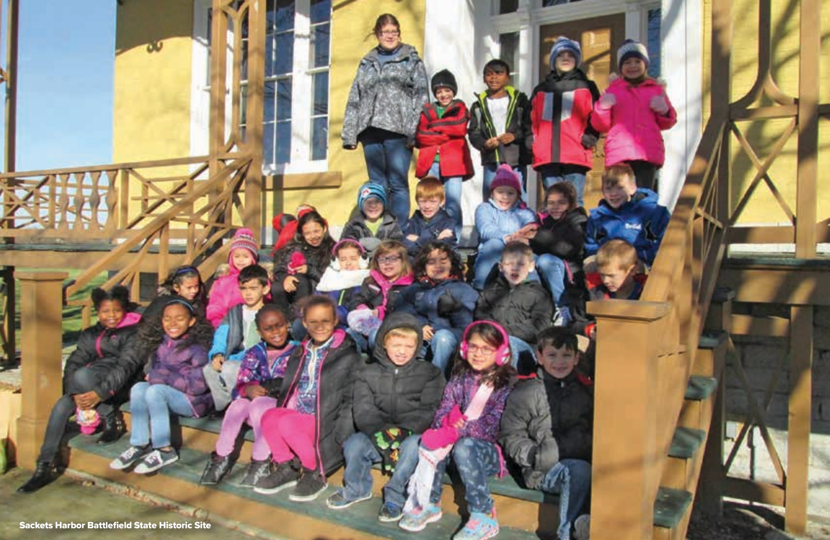
Sackets Harbor Battlefield State Historic Site