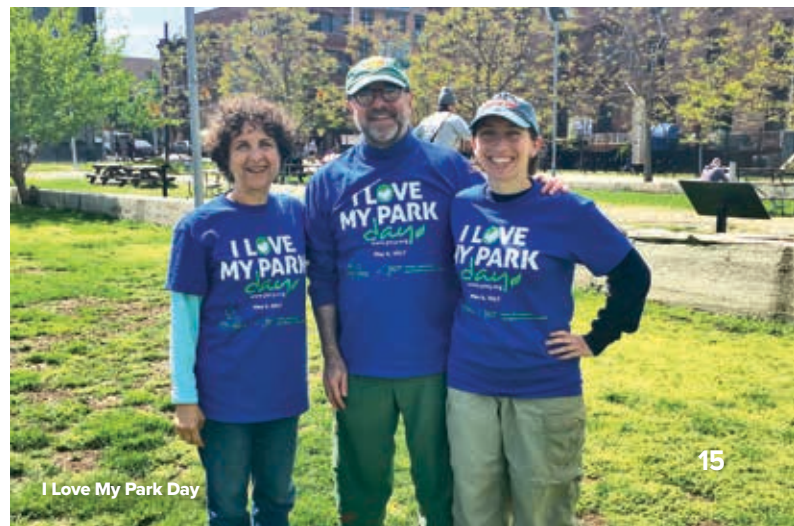
I Love My Park Day