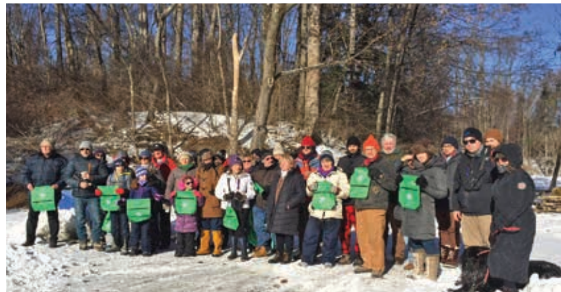
First Day Hikes - Taconic State Park