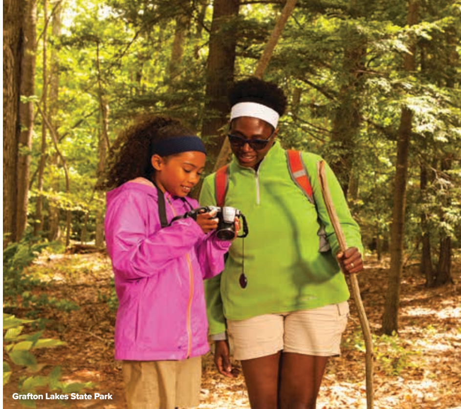
Grafton Lakes State Park