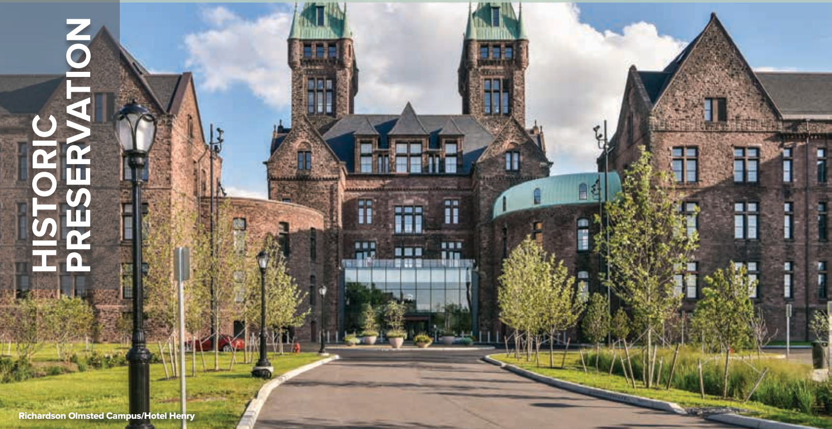
Richardson Olmsted Campus/Hotel Henry