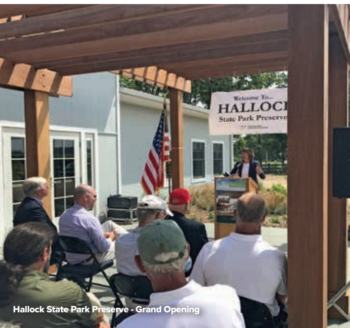
Hallock State Park Preserve - Grand Opening