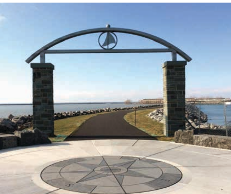
Buffalo Harbor State Park

At Minnewaska State Park , a partnership with the Open Space Institute continues to advance work on the new visitor center that will help the park accommodate the growing number of visitors to the stunning park. Construction and fundraising efforts also continue to restore the network of Carriage Roads in the park. At Rockland Lake State Park, construction is nearing completion of the newly renovated north pool. This renovation includes a zero-entry pool for increased accessibility, a new slide and spray pad area for younger children. Renovation is underway of the bathhouse and office complex adjacent to the north pool. The addition of 400 acres to Schunnemunk State Park in Orange County will expand year-round trail-based recreation and protect natural habitat in the Hudson Valley. The property was purchased from the Open Space Institute. Now at more than 3,300 acres, Schunnemunk State Park offers ridge-top views of the Hudson Highlands to the east, and the Shawangunks and Catskills to the west. The new parcel will expand the region's recreational trail network, preserve scenic views and protect the area from overdevelopment.