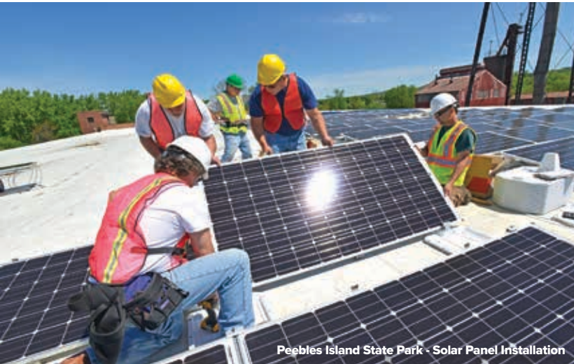
Peebles Island State Park - Solar Panel Installation