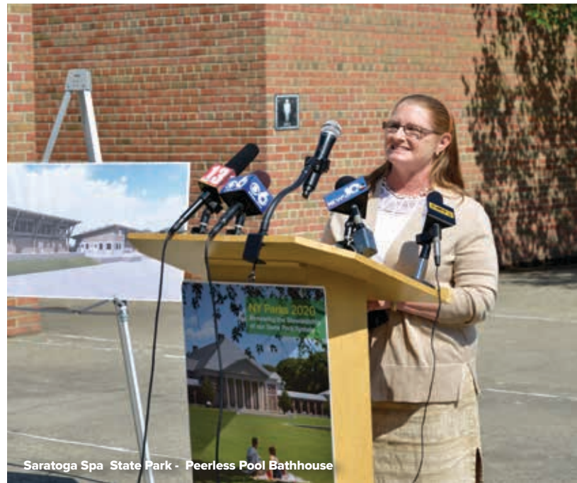
Saratoga Spa State Park - Peerless Pool Bathhouse

The Walkway Over the Hudson State Historic Park will soon have welcome centers on each end of the linear park to welcome the millions of people who visit this tourist destination annually. The visitor centers will orient visitors not just to the park but to the Hudson Valley region, connecting them to the many state parks, historic sites and other attractions in this part of the state. At Bannerman Island , in Hudson Highlands State Park Preserve a volunteer