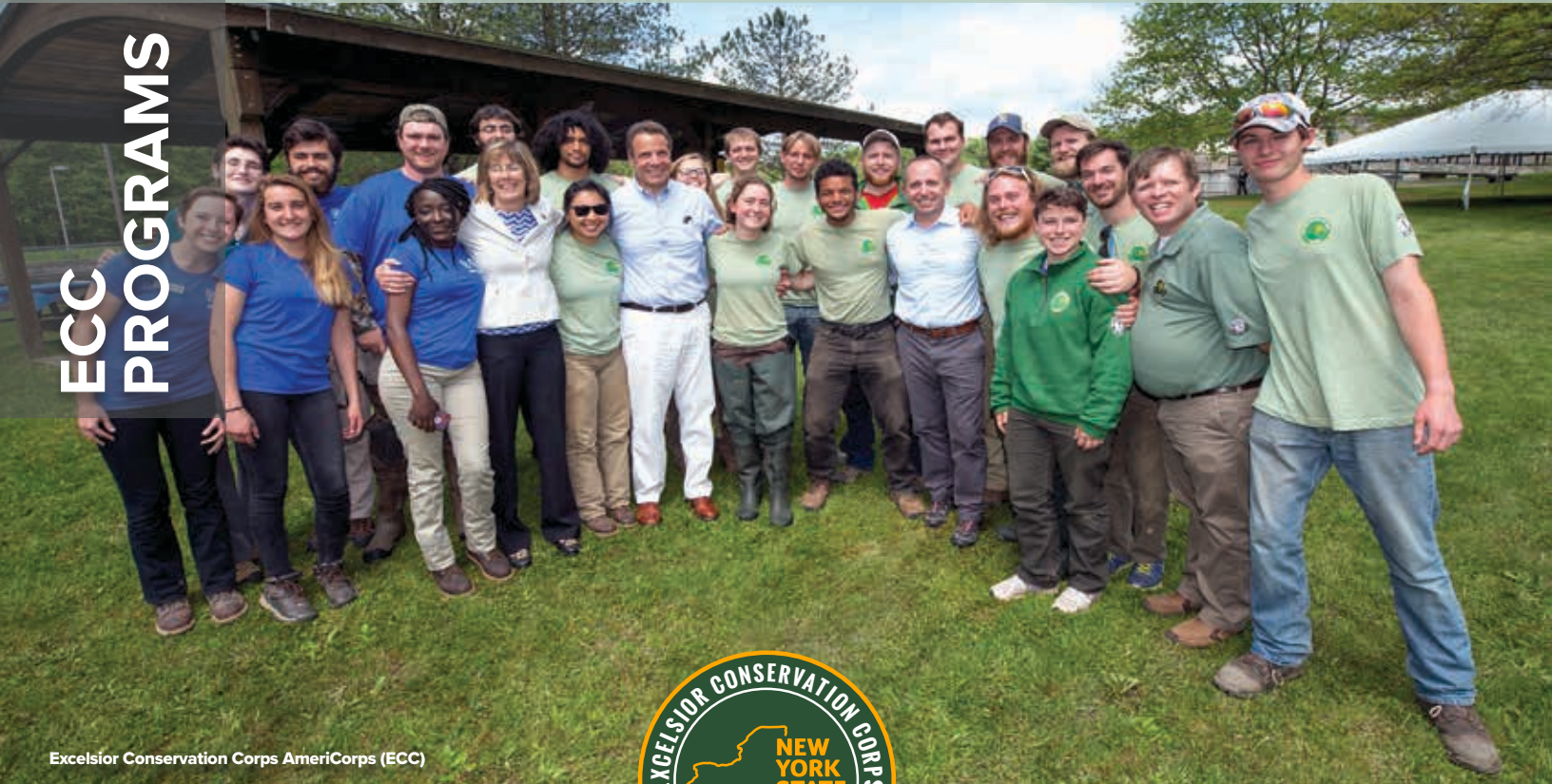
Excelsior Conservation Corps AmeriCorps (ECC)