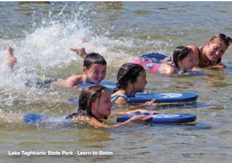
Lake Taghkanic State Park - Learn-to-Swim

The New York State Parks Learn-to-Swim Program continued for a fifth year in 2017 at more than 30 parks across the state, teaching thousands of youth to swim. The program was featured in the New York Times as a model of innovative efforts in NYS to address the racial disparity in swimming ability. Learn-to-Swim continues to be supported through a partnership with the New York State Department of Health, the American Red Cross, the National Swimming Pool Foundation and the Northeast Spa and Pool Foundation.