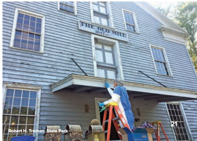
Robert H. Treman State Park