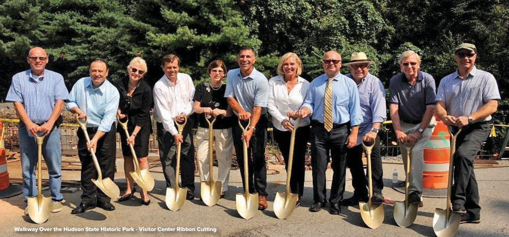
Walkway Over the Hudson State Historic Park - Visitor Center Ribbon Cutting