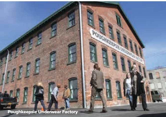
Poughkeepsie Underwear Factory