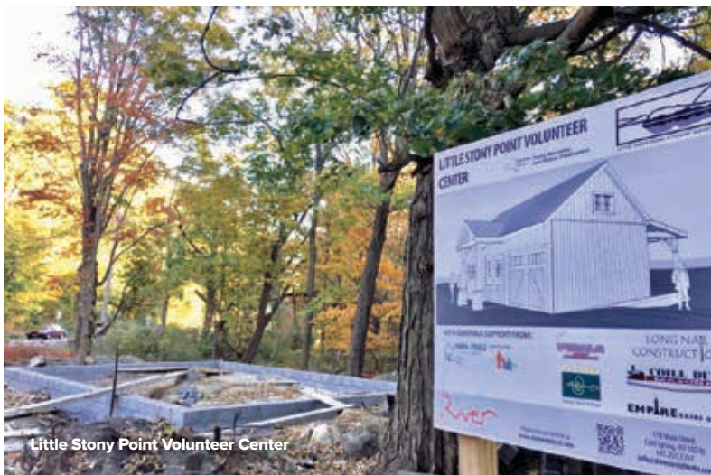
Little Stony Point Volunteer Center

The Open Space Institute (OSI), through its Alliance for New York State Parks program, is leveraging public investments by raising private funds and enhancing park projects to make them more welcoming, engaging and exciting. Examples of successful OSI campaigns include: Carriage Road Restoration at Minnewaska State Park Preserve; a renovated Canopus Lake beach complex at Fahnestock State Park; the new Humphrey Nature Center at Letchworth State Park and the new Thacher Park Center at John Boyd Thacher State Park.