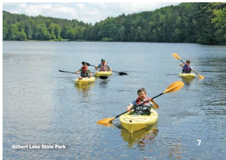
Gilbert Lake State Park