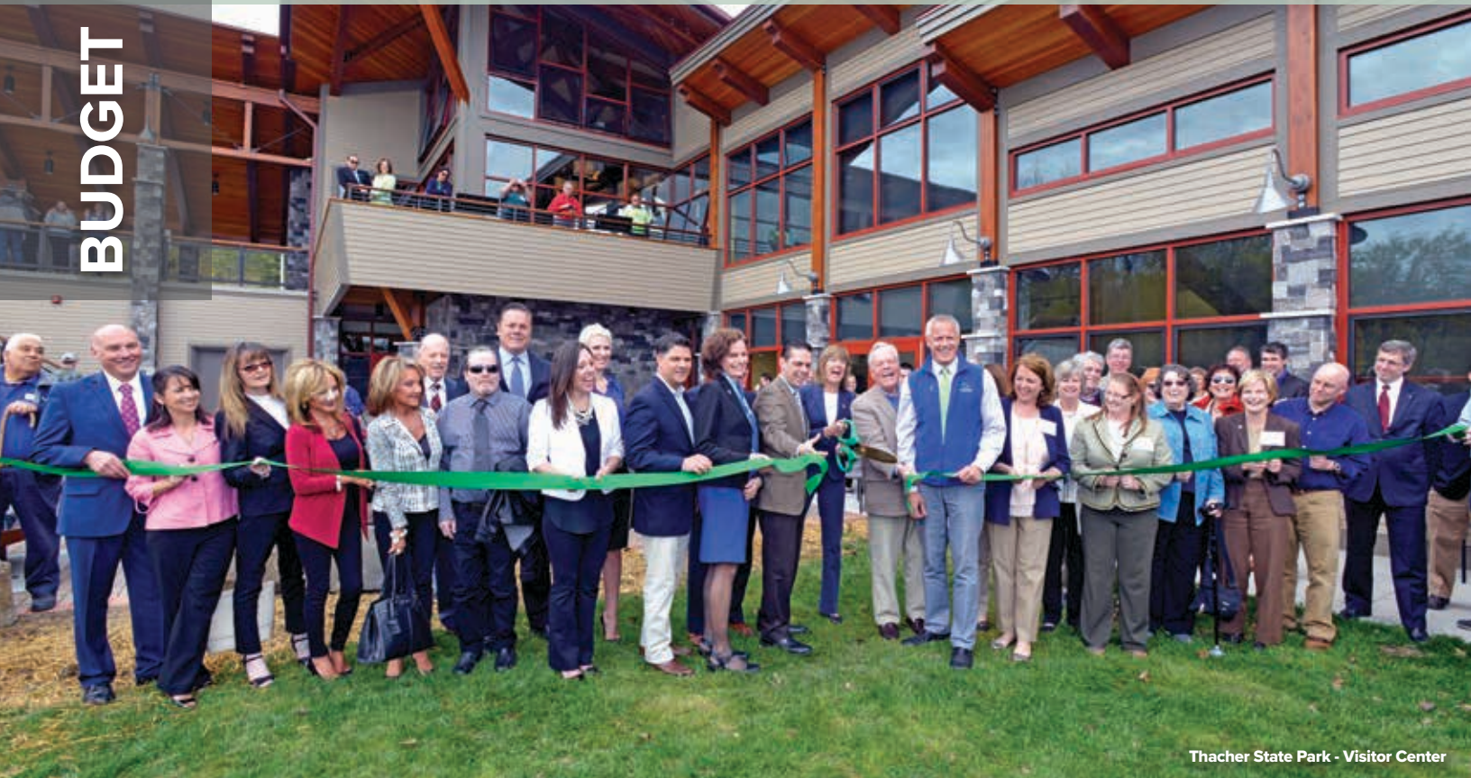
Thacher State Park - Visitor Center