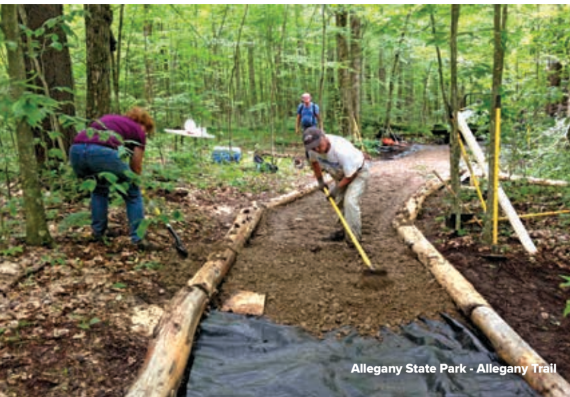
Allegheny State Park - Allegheny Trail

The Finger Lakes region continues to advance projects that connect the state parks to the area's thriving tourism industry. The luxury cottages that opened this summer at Sampson Lake State Park will allow visitors to experience the beauty of the park as they tour the wine trail nearby. At Watkins Glen State Park , the transformation of the entrance area currently underway will better connect the park to the Village and the myriad of activities that take place there year-round. The new visitors center at Taughannock Falls State Park is hugely popular, and in 2017 it served over 30,000 travelers from 73 countries and all 50 states.