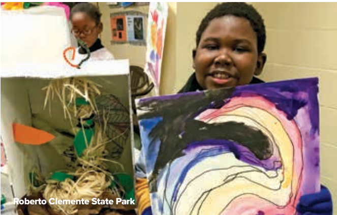
Roberto Clemente State Park