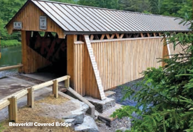
Beaverkill Covered Bridge