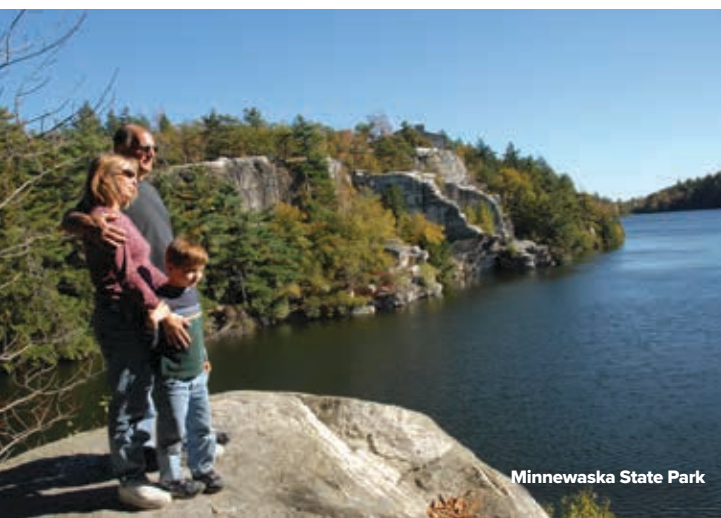
Minnewaska State Park