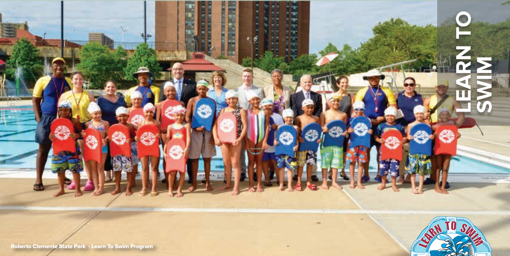
Roberto Clemente State Park - Learn To Swim Program