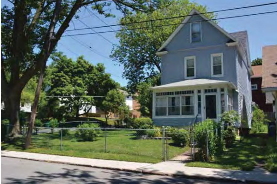
Photograph 4.179. 2833 Whirlpool Street, facing northeast (Panamerican 2014).