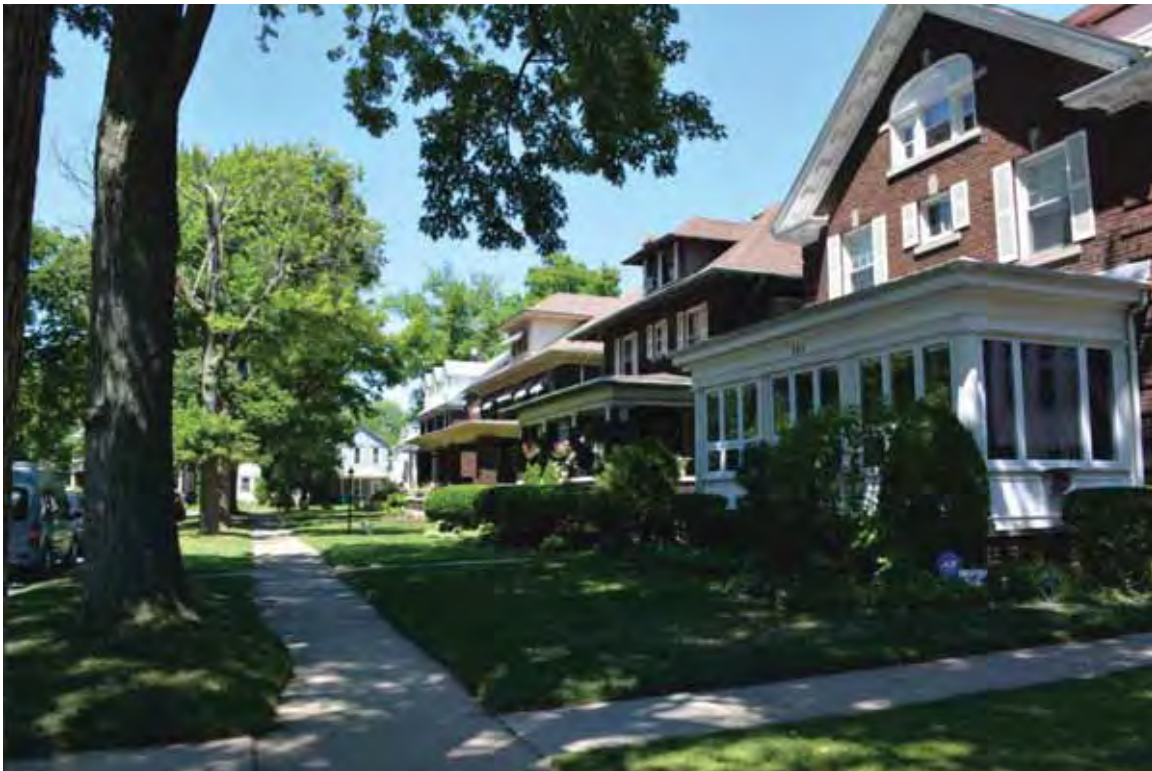
Photograph 4.15b. East side of Park Place, Park Place Historic District, facing north ( Panamerican 2014 ).