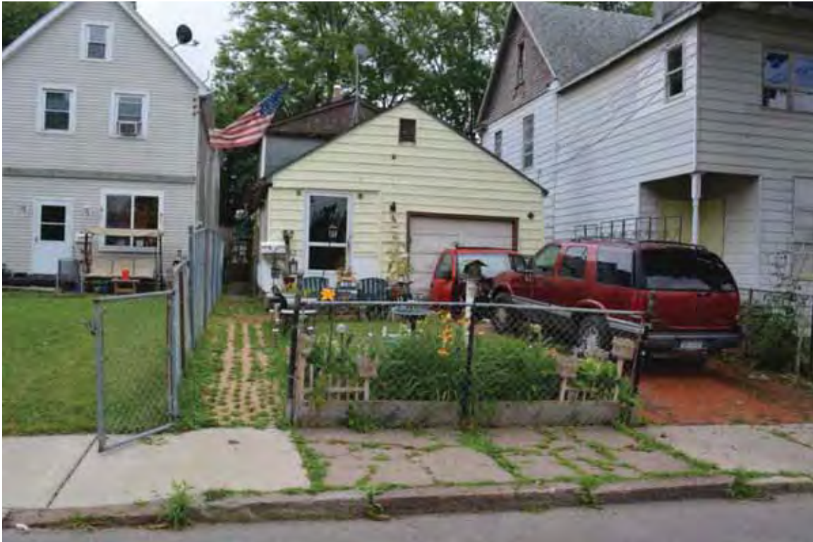
Photograph 4.184. 713 Willow Street, facing south (Panamerican 2014).