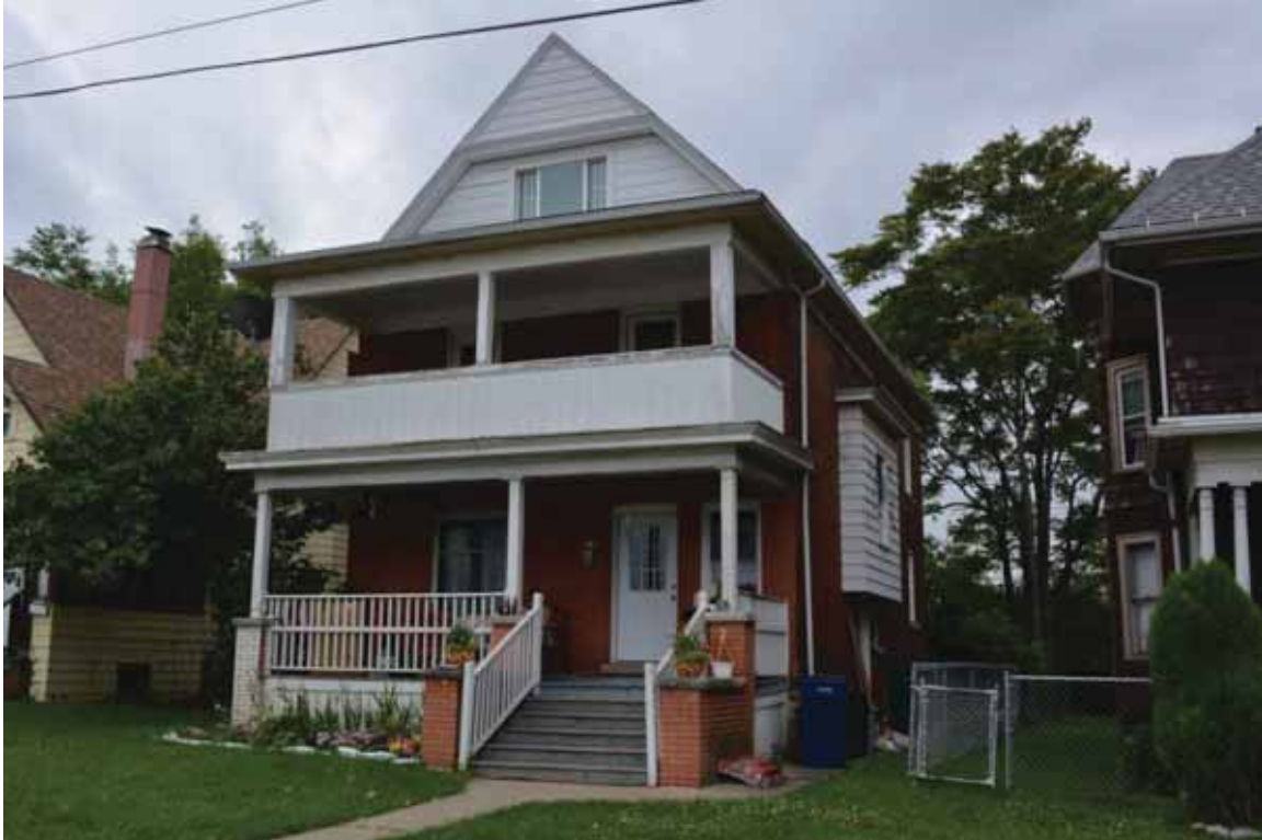
Photograph 4.91. 1634 Eighth Street, facing west.