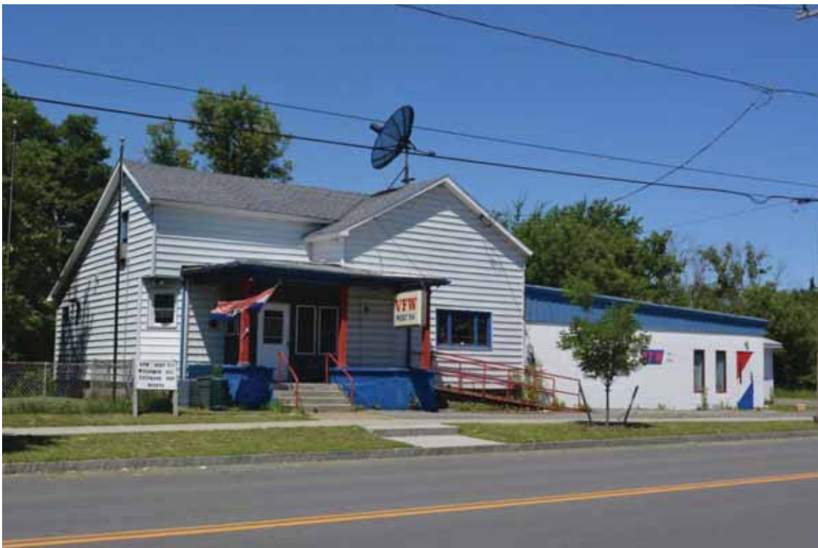
Photograph 4.140. 2772 Main Street, facing northwest (Panamerican 2014).