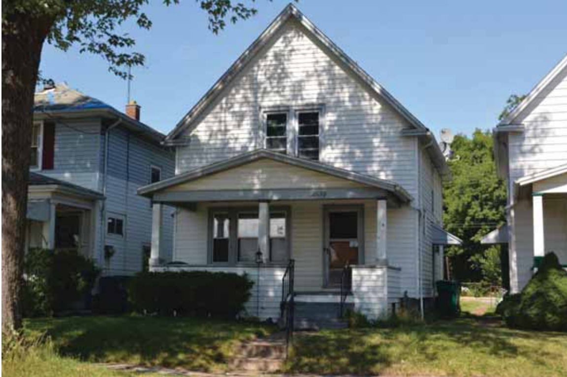
Photograph 4.165. 2659 Whirlpool Street, facing east (Panamerican 2014).