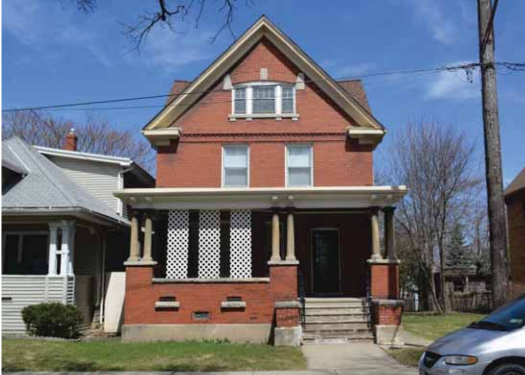
Photograph 4.45. Residence at 390 Spruce Avenue, facing north (Panamerican 2015).