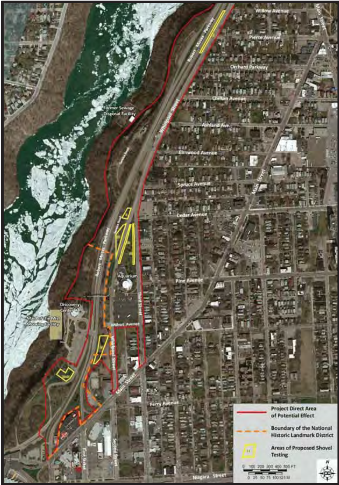
Figure 5.2. Areas of proposed shovel testing in the southern portion of the APE.