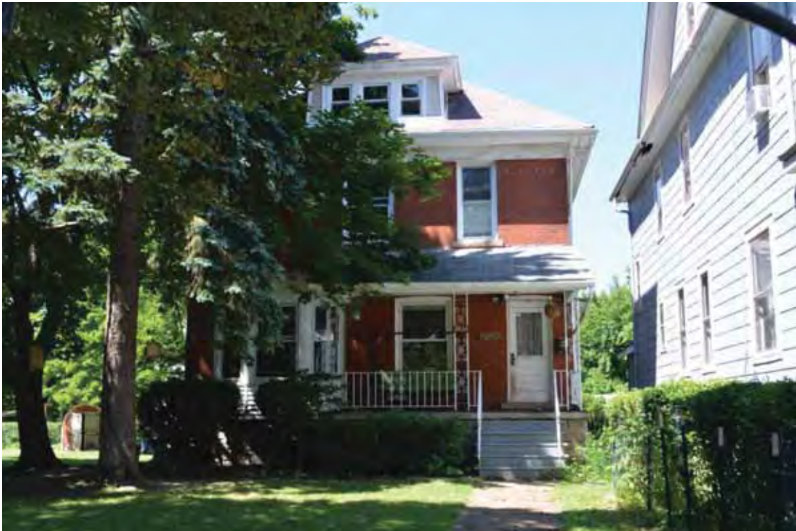
Photograph 4.96. 2834 Lewiston Road, facing west.