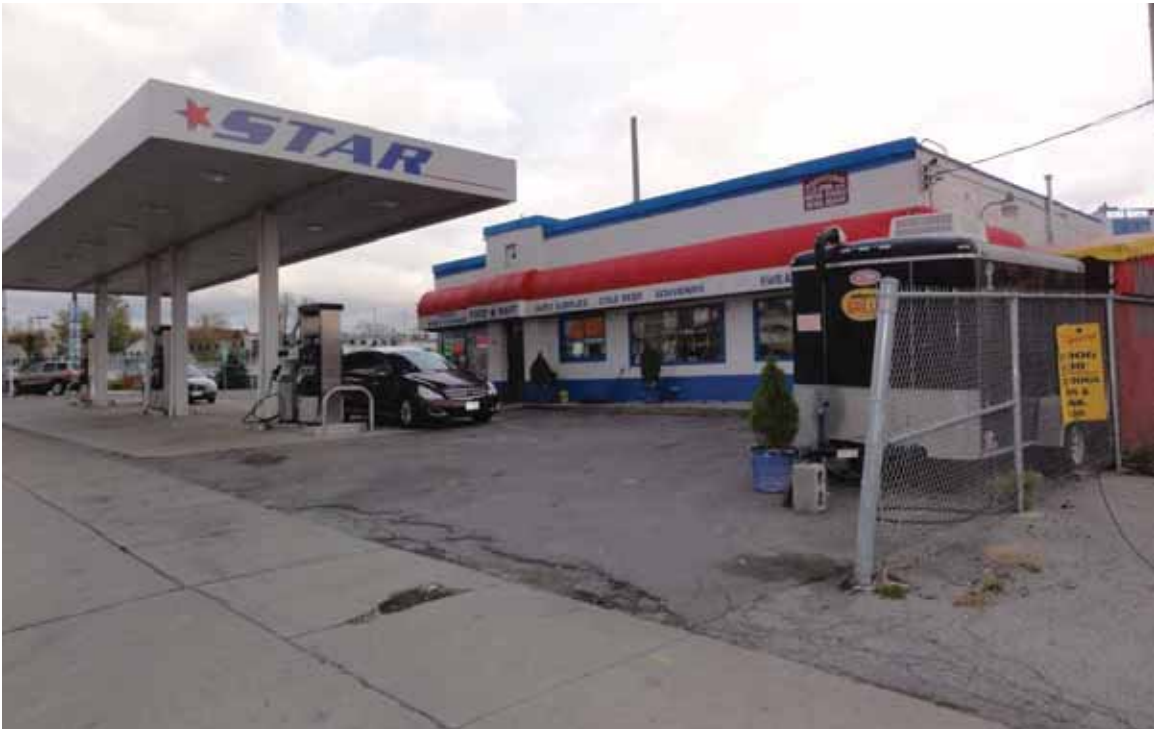
Photograph 4.116. 465 Main Street, facing northwest.