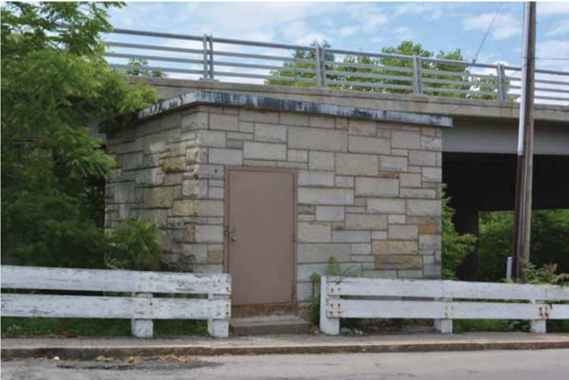
Photograph 4.154. Utility building on west side of Whirlpool Street, north of Cleveland Avenue, facing west ( Panamerican 2014 ).