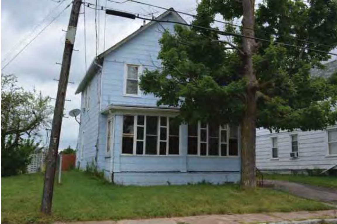
Photograph 4.105. 714 Linwood Avenue, facing north (Panamerican 2014).