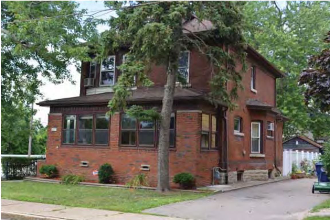
Photograph 4.100. 812 Lincoln Place, facing northwest (Panamerican 2014).