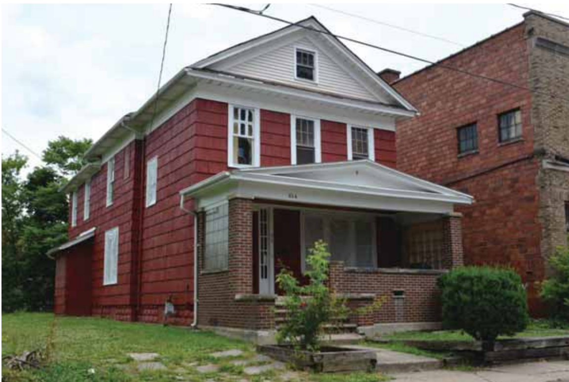
Photograph 4.75. 814 Division Avenue, facing northeast.