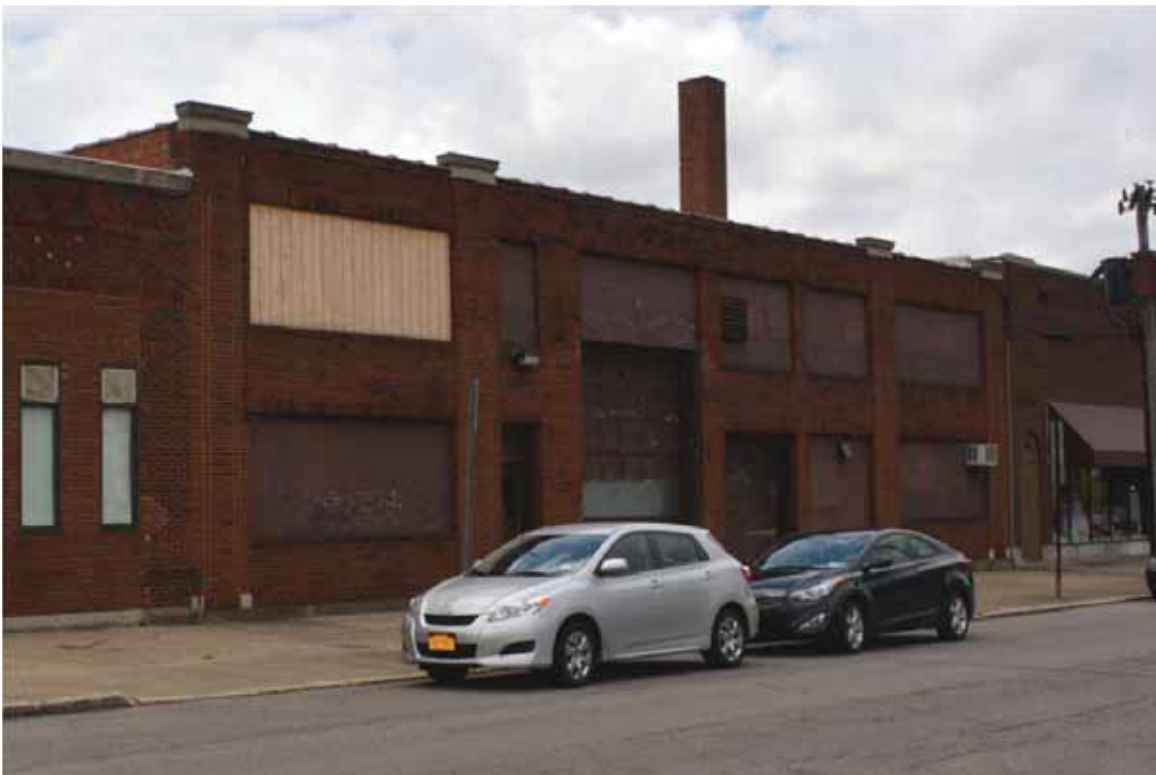
Photograph 4.112. 827 Linwood Avenue, facing southwest.