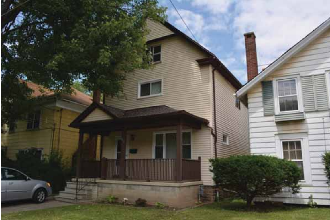
Photograph 4.101. 818 Lincoln Place, facing northwest ( Panamerican 2014 ).