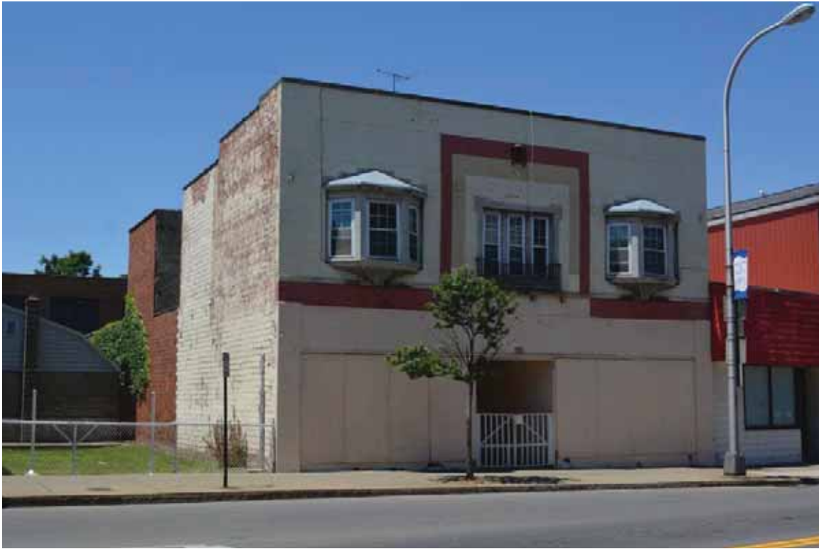
Photograph 4.119. 1408 Main Street, facing west–northwest.