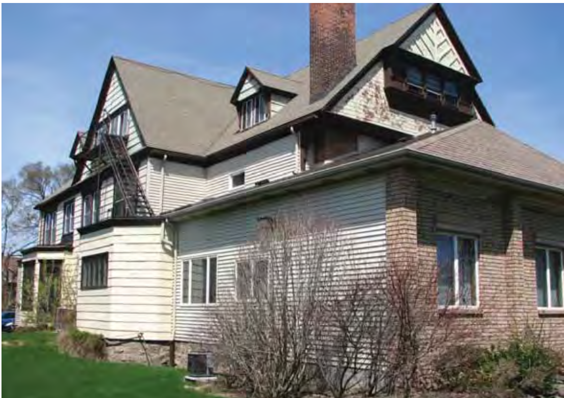
Photograph 4.118. Paul A. Schoellkopf House at 730 Main Street, facing southwest (Panamerican 2015).