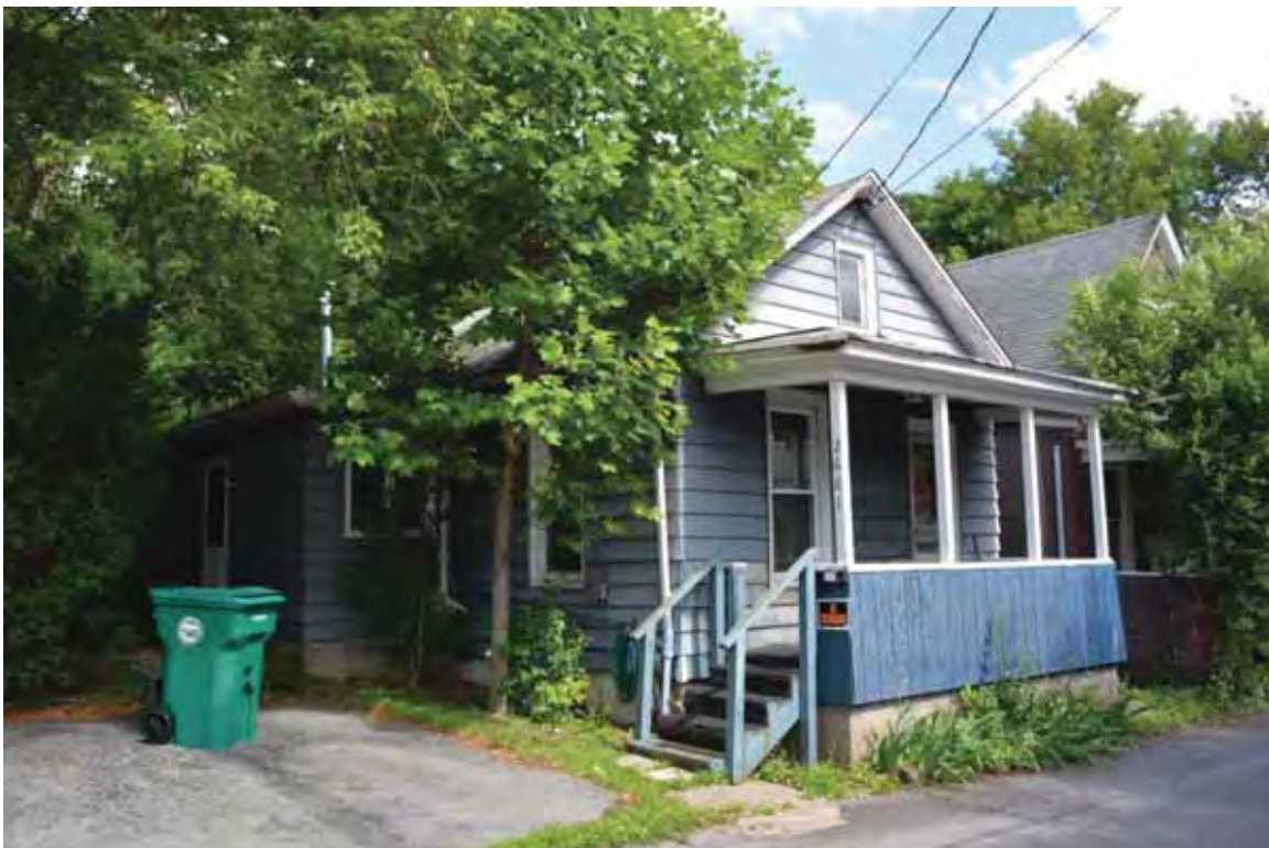
Photograph 4.152. 2681 Spring Street, facing southeast.