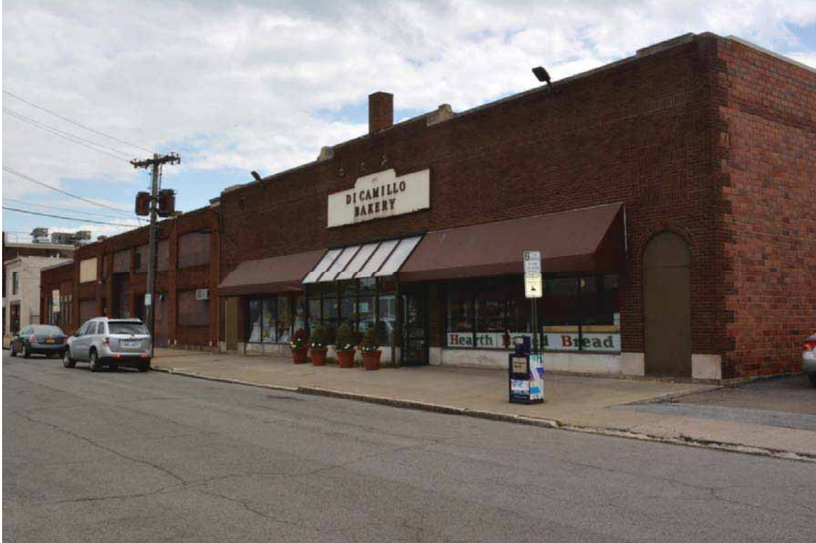
Photograph 4.111. 801 Linwood Avenue, facing southeast.