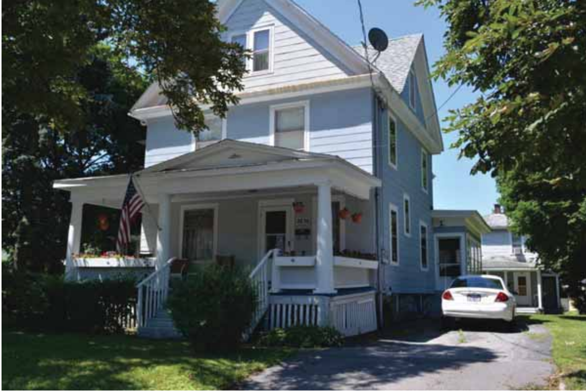
Photograph 4.97. 2836 Lewiston Road, facing west-southwest (Panamerican 2014).