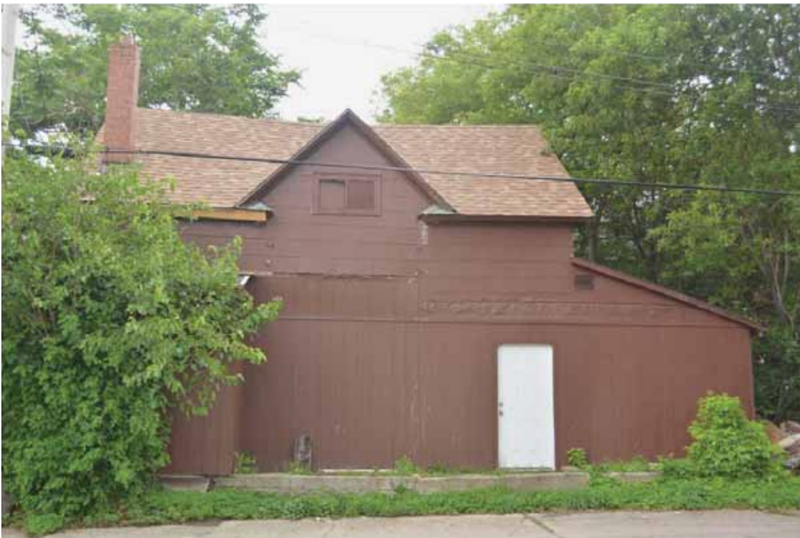
Photograph 4.90. 1628A Eighth Street, facing south ( Panamerican 2014 ).