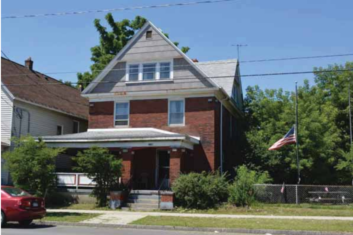
Photograph 4.139. 2726 Main Street, facing west-southwest (Panamerican 2014).