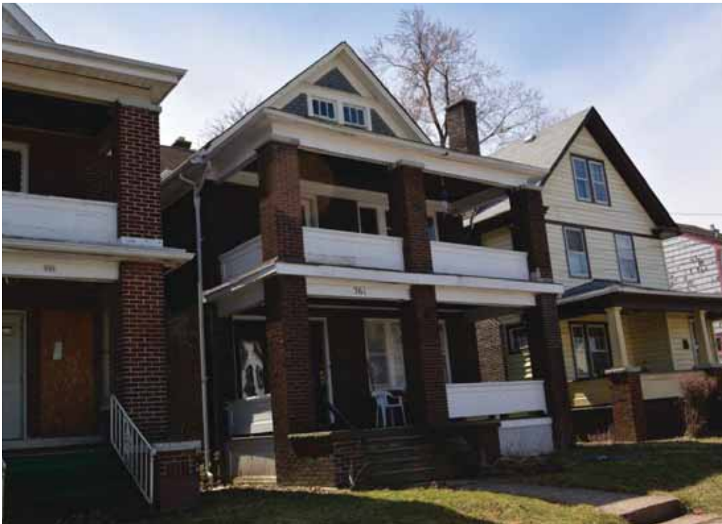
Photograph 4.41. Residence at 361 Spruce Avenue, facing southwest ( Panamerican 2015 ).