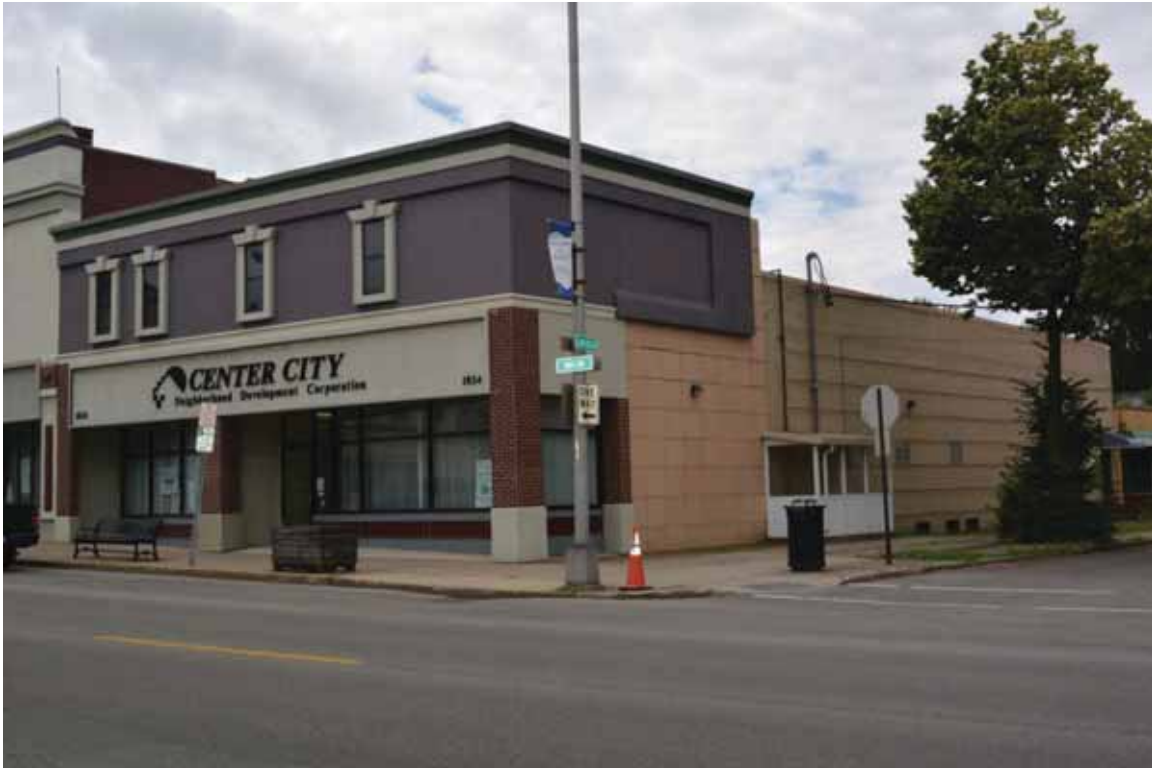
Photograph 4.132. 1820-24 Main Street, facing west (Panamerican 2014).