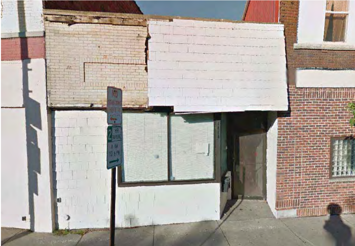
Photograph 4.120. 1410 Main Street, facing west.