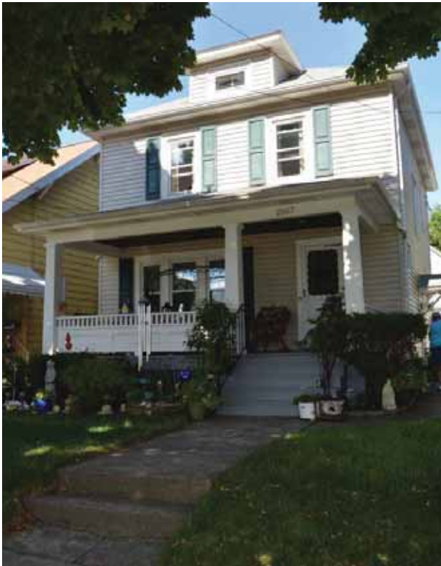
Photograph 4.168. 2667 Whirlpool Street, facing east ( Panamerican 2014 ).