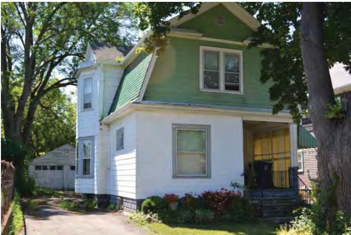
Photograph 4.66. 623 Chestnut Avenue, facing south-southwest.