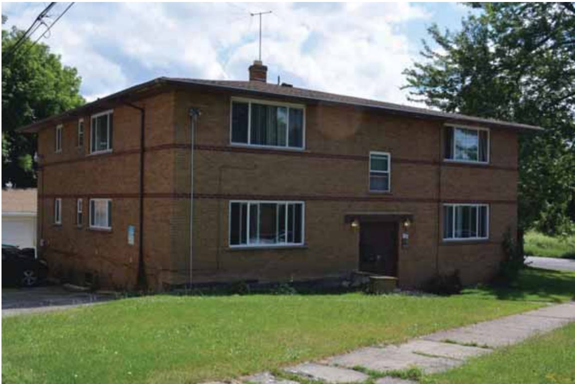
Photograph 4.56. 605 Chasm Avenue, facing southeast.