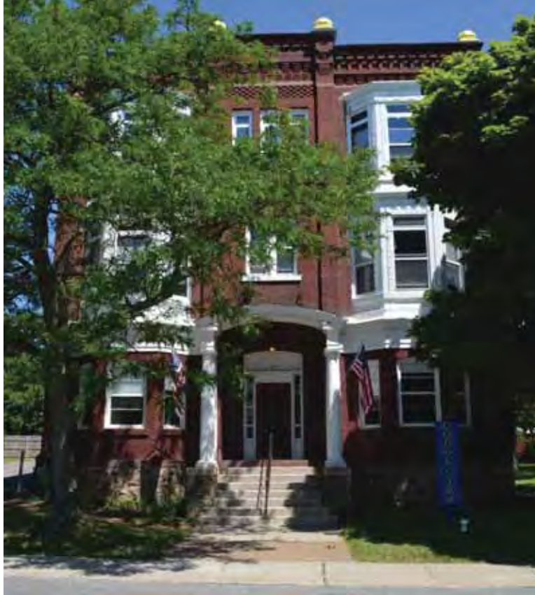
Photograph 4.51. Hotel Mayle/Park Place Apartments at 723 Third Street, facing east (Panamerican 2014).