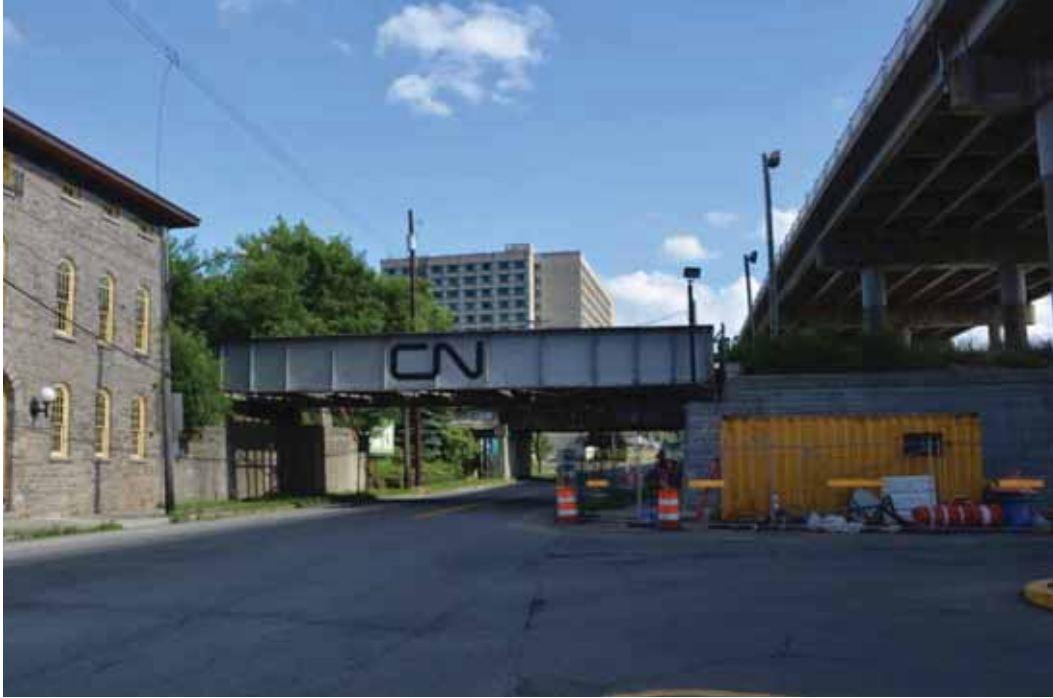
Photograph 4.53. Canadian Pacific Railway Bridge (Whirlpool Rapids Bridge) over Whirlpool Street, facing north (Panamerican 2014).