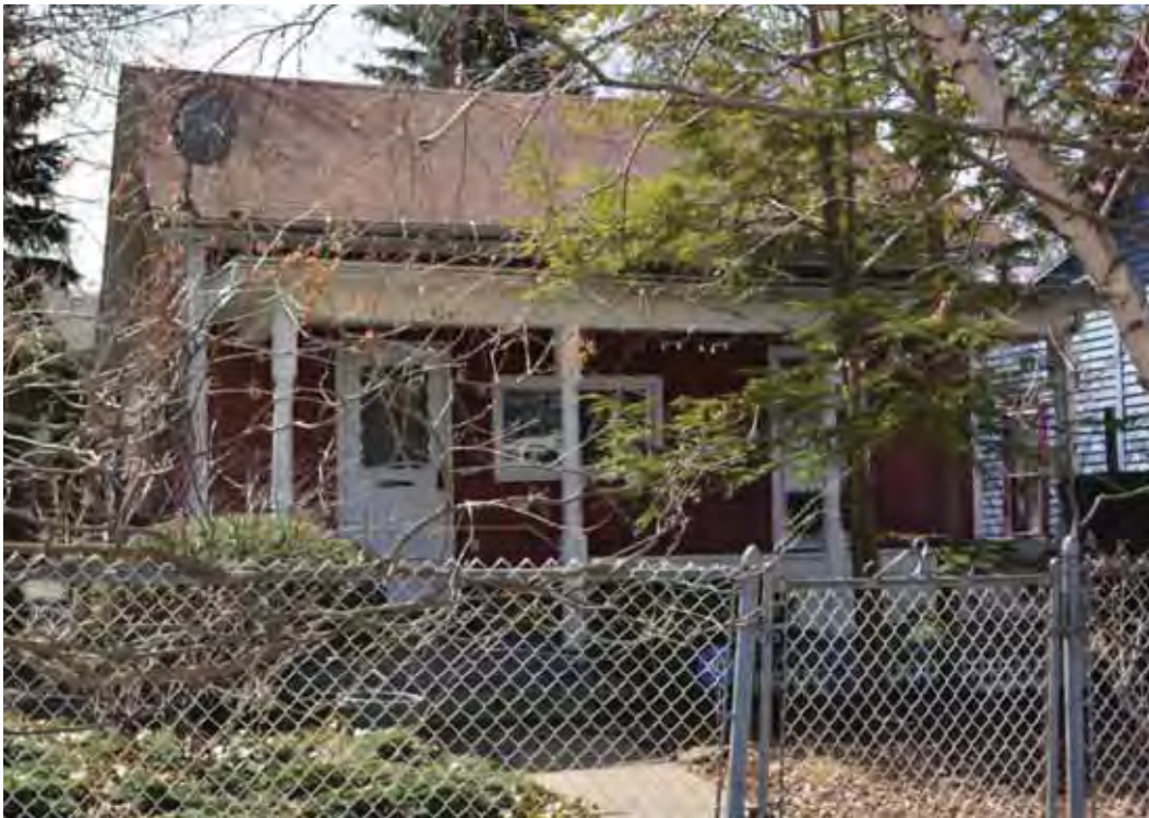
Photograph 4.25. Residence at 621 Elmwood Avenue, facing south (Panamerican 2015).