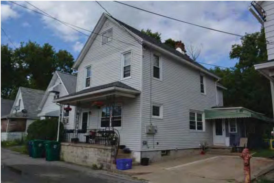
Photograph 4.146. 2659 Spring Street, facing northeast.