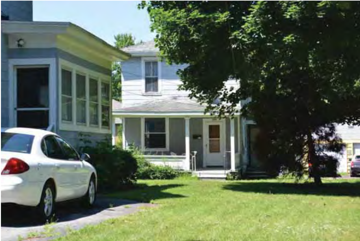
Photograph 4.98. 2836A Lewiston Road, facing west (Panamerican 2014).