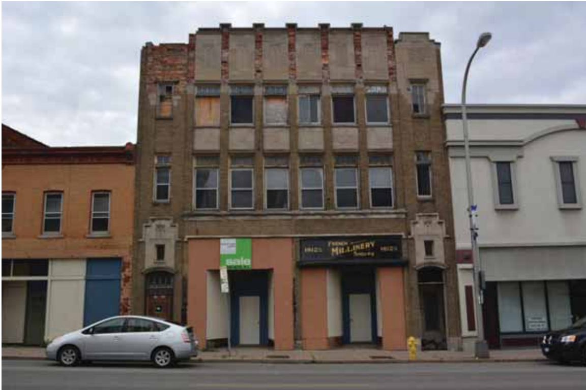
Photograph 4.130. 1812 Main Street, facing west.