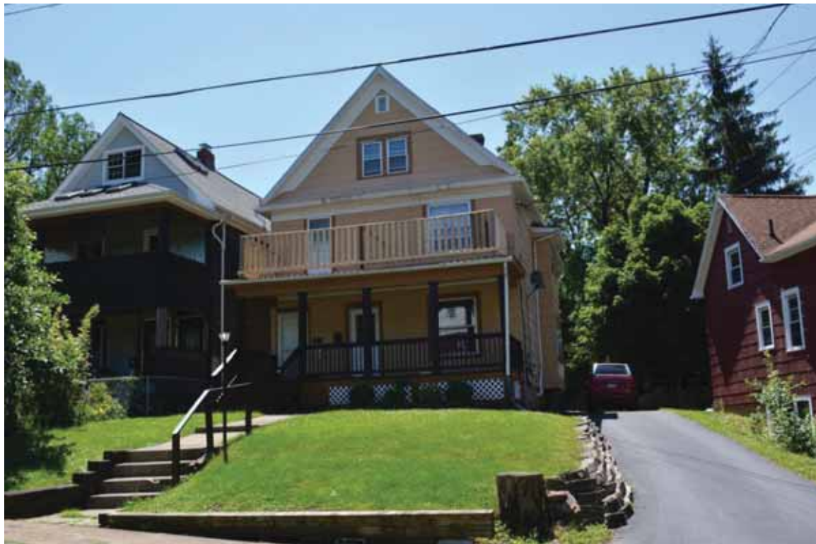
Photograph 4.62. 615 Chestnut Avenue, facing south ( Panamerican 2014 ).