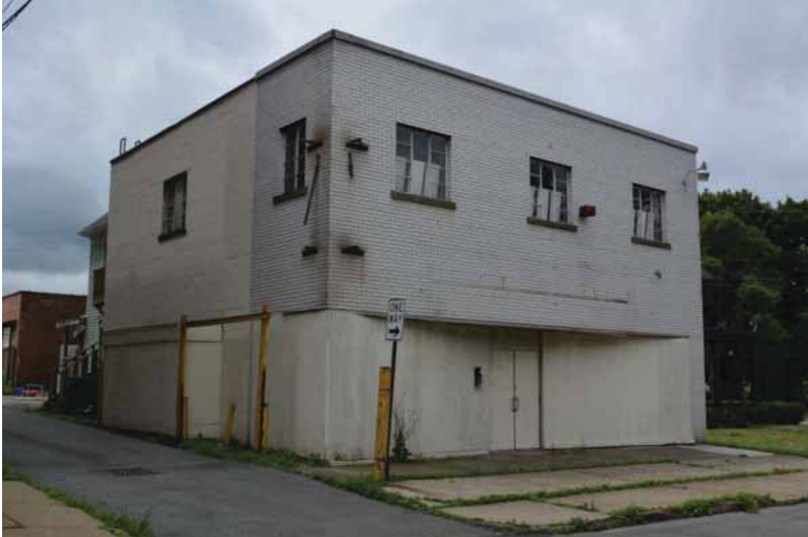
Photograph 4.73. 811 Division Avenue, facing southwest.