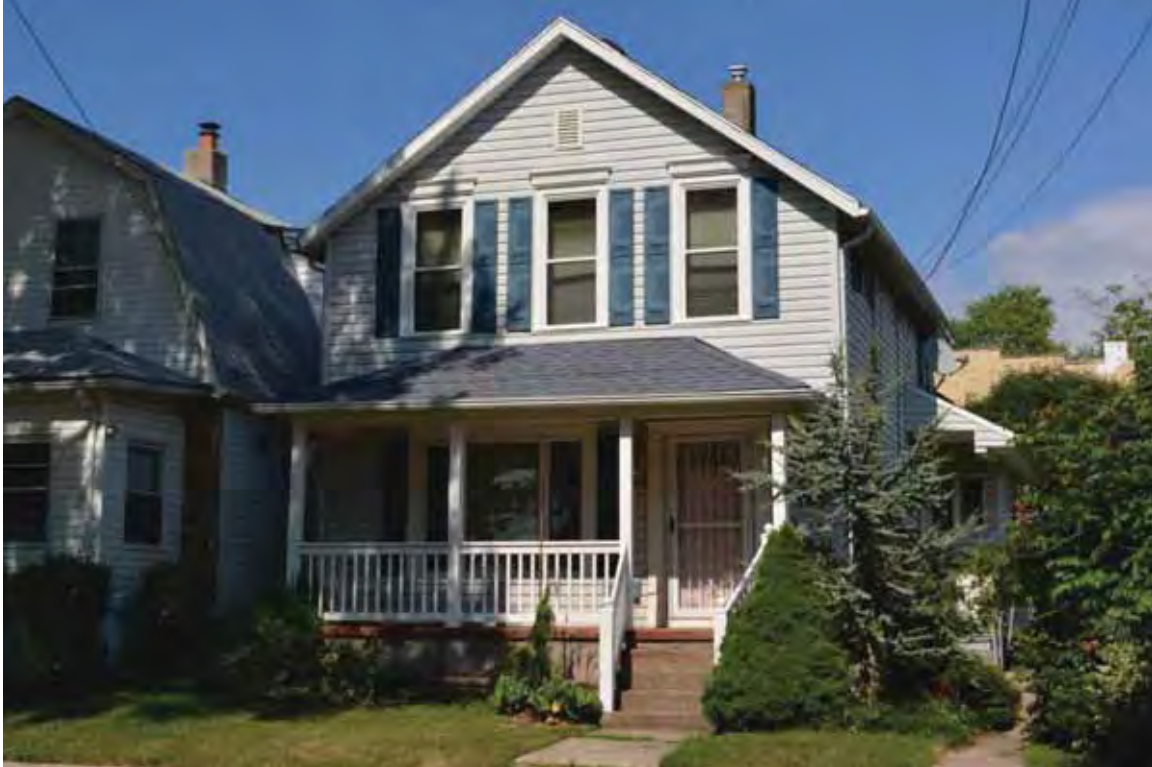
Photograph 4.161. 2647 Whirlpool Street, facing east (Panamerican 2014).