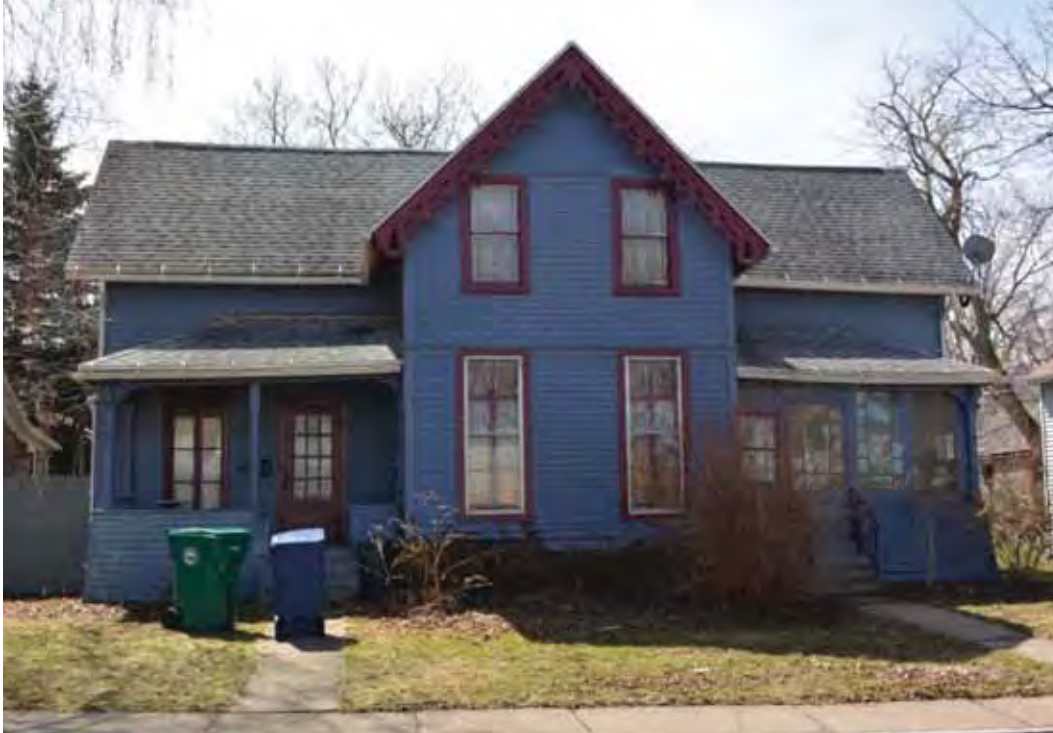
Photograph 4.24. Residence at 615-17 Elmwood Avenue, facing south.