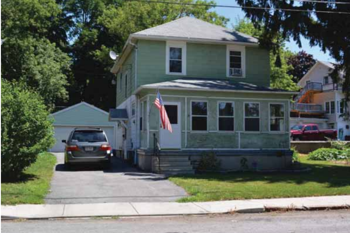
Photograph 4.175. 2813 Whirlpool Street, facing east (Panamerican 2014).