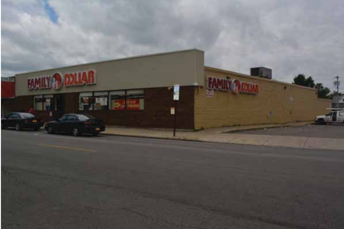
Photograph 4.127. 1632 Main Street, facing southwest (Panamerican 2014).