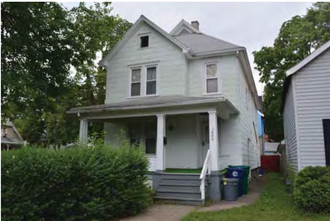
Photograph 4.76. 1404 Eighth Street, facing west.