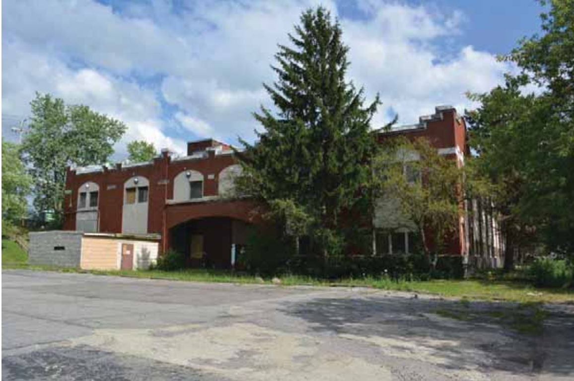
Photograph 4.157. North side of 2600 Whirlpool Street, facing southeast ( Panamerican 2014 ).