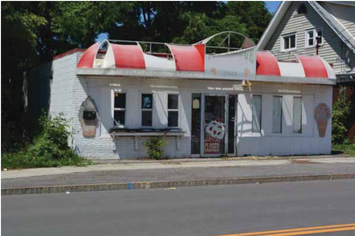
Photograph 4.136. 2648 Main Street, facing west-northwest (Panamerican 2014).