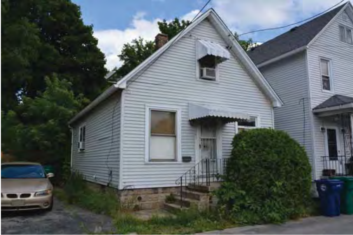
Photograph 4.147. 2661 Spring Street, facing east-southeast.