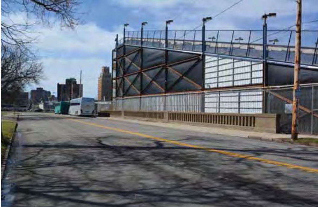
Photograph 4.38. Second Street Bridge, Second Street, facing south ( Panamerican 2015 ).