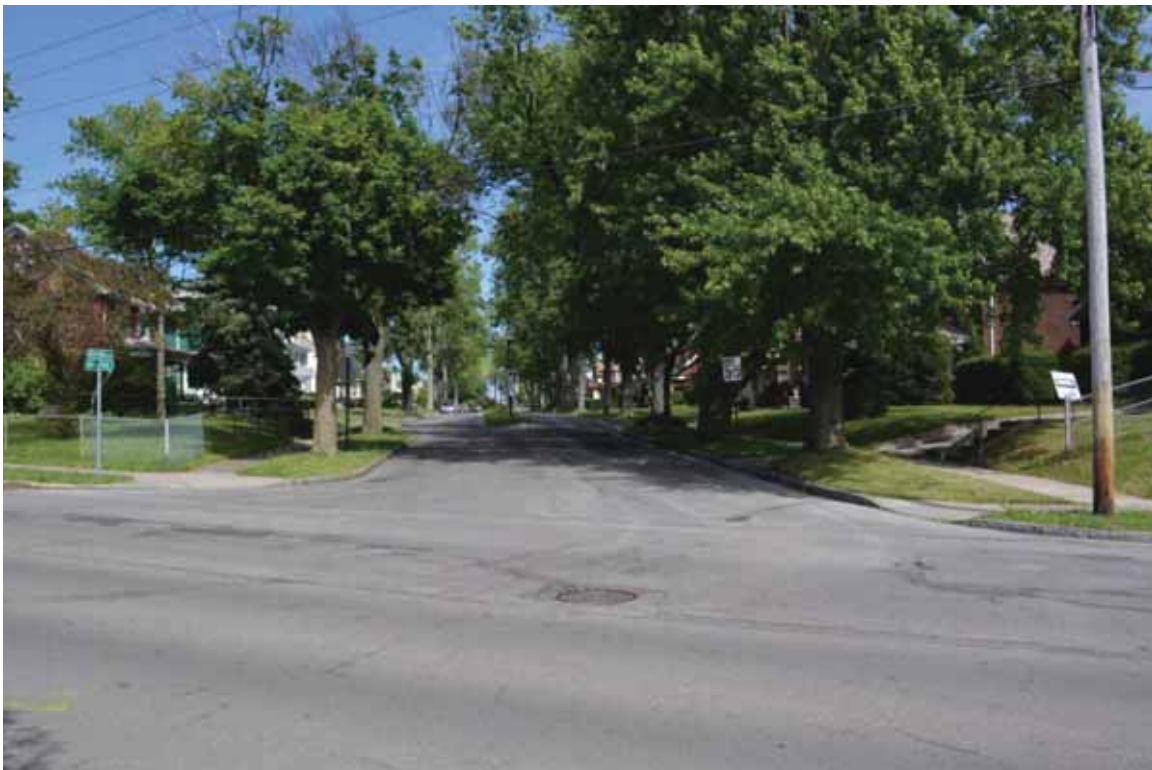
Photograph 4.13. Chilton Avenue-Orchard Parkway Historic District, intersection of Whirlpool Street and Orchard Parkway, facing east ( Panamerican 2014 ).