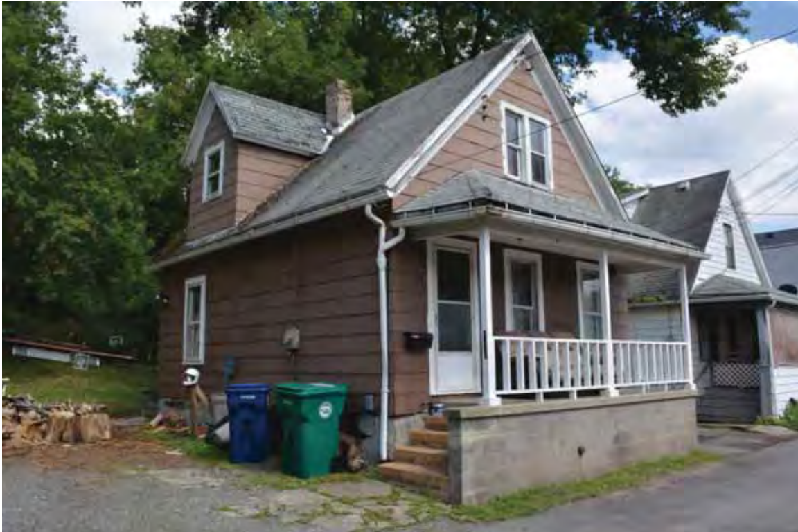
Photograph 4.150. 2675 Spring Street, facing southeast (Panamerican 2014).