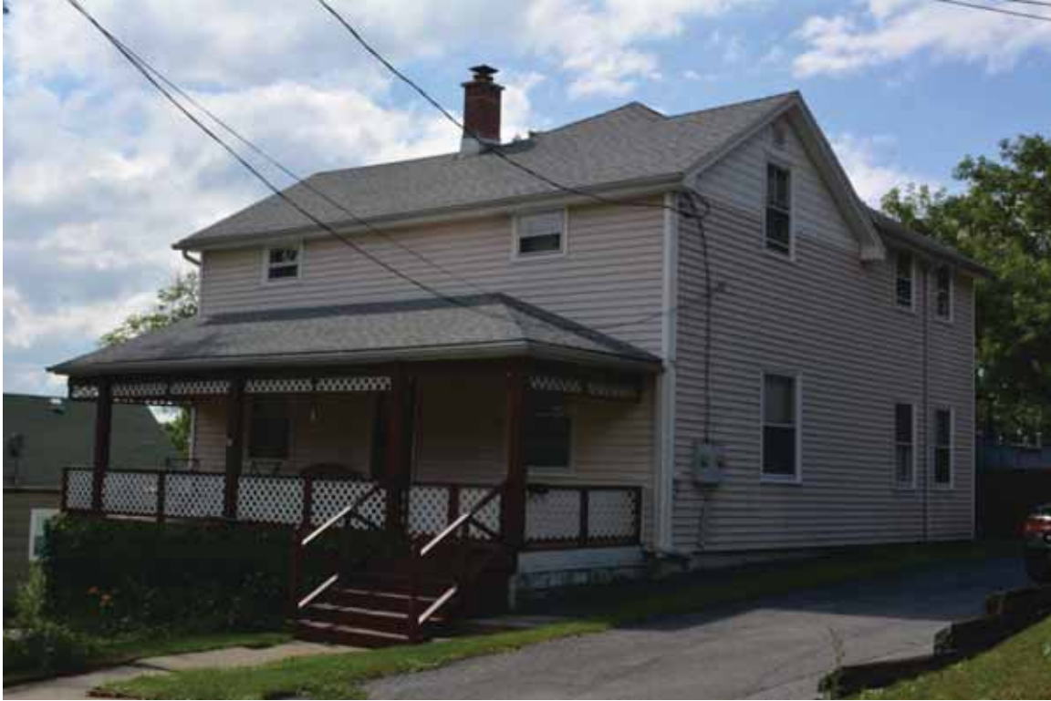
Photograph 4.57. 610 Chasm Avenue, facing northwest (Panamerican 2014).