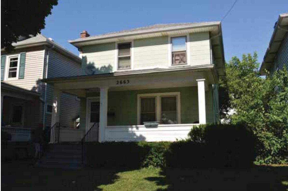
Photograph 4.167. 2663 Whirlpool Street, facing east ( Panamerican 2014 ).