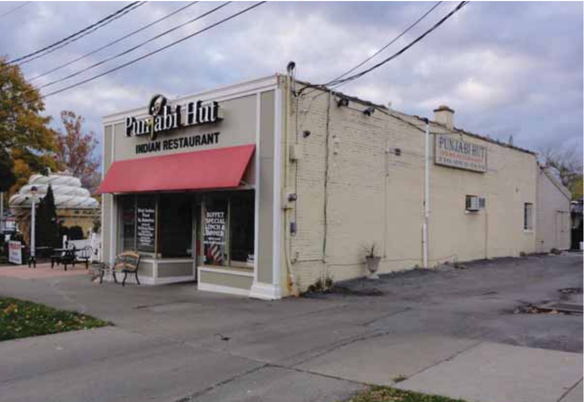
Photograph 4.142. 26 Niagara Street, facing northwest.