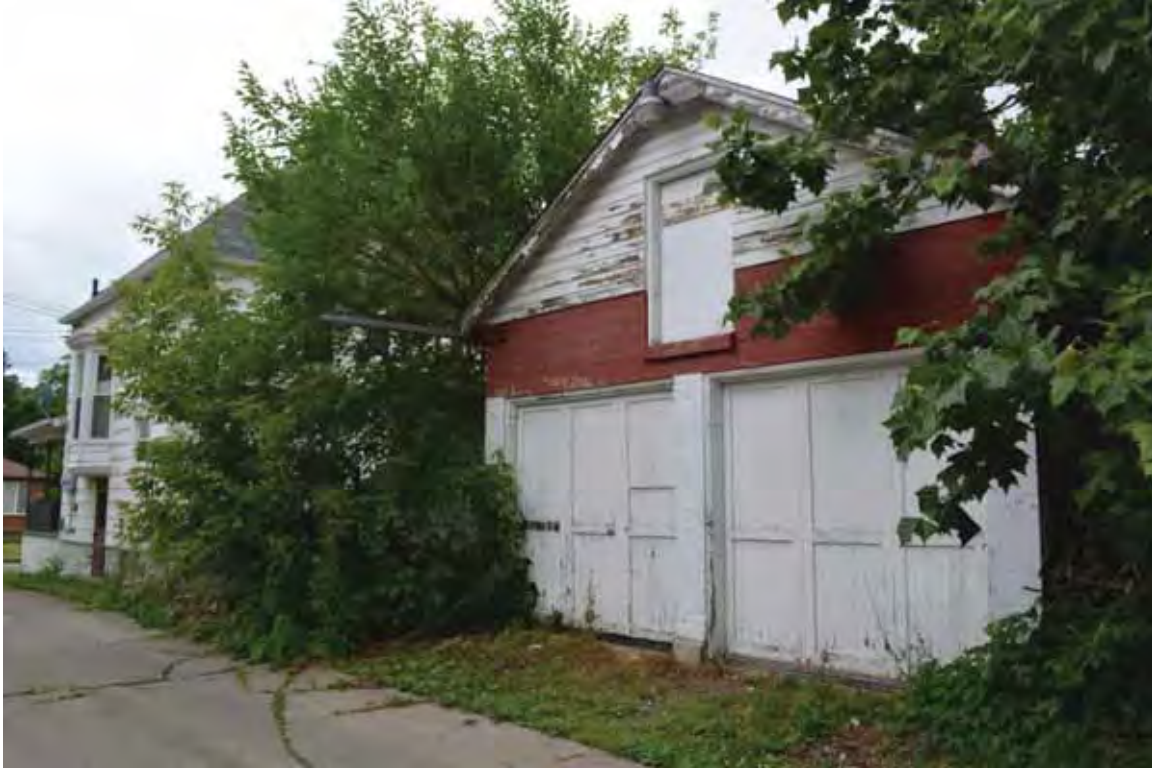
Photograph 4.107. 716A Linwood Avenue, facing southwest (Panamerican 2014).