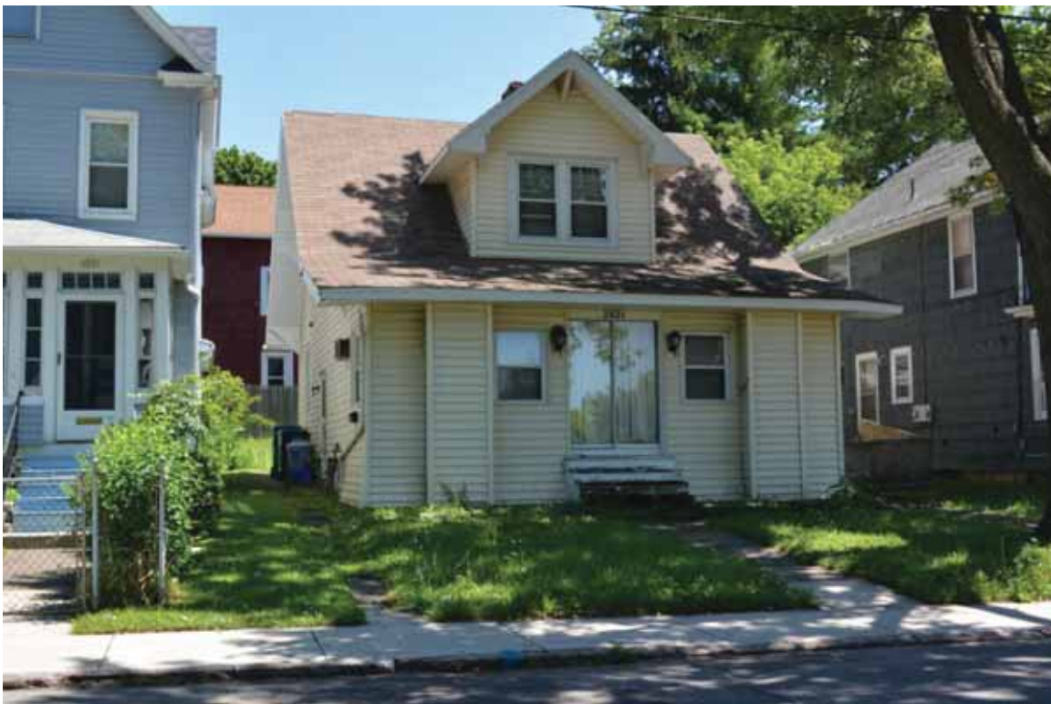
Photograph 4.178. 2821 Whirlpool Street, facing east (Panamerican 2014).