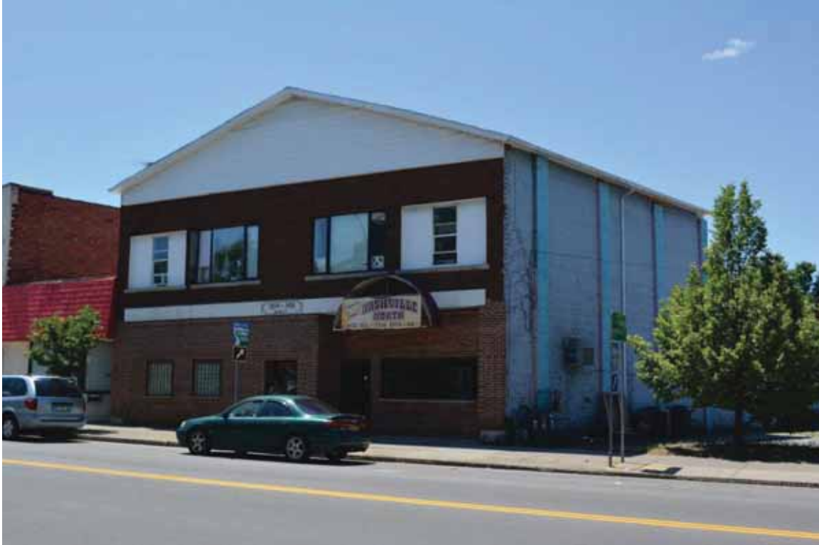
Photograph 4.121. 1414 Main Street, facing southwest (Panamerican 2014).