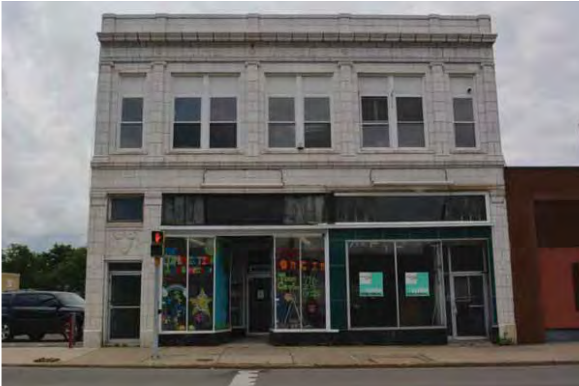
Photograph 4.128. 1700 Main Street, facing southwest.