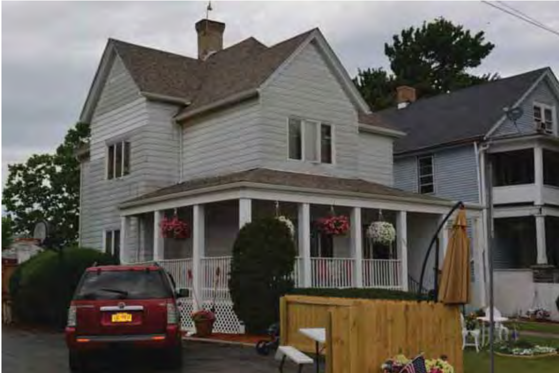
Photograph 4.86. 1606 Eighth Street, facing northwest.