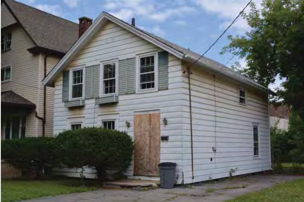
Photograph 4.103. 824 Lincoln Place, facing northwest.