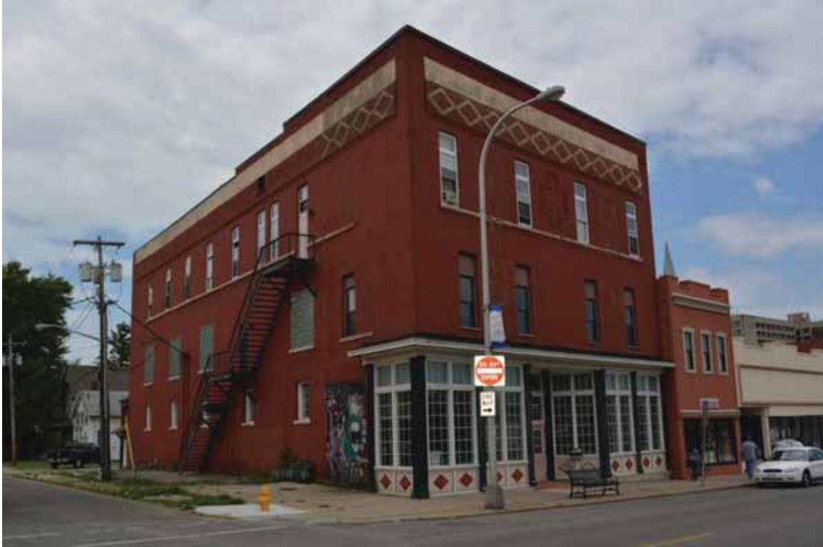
Photograph 4.133. 1902 Main Street, facing northwest ( Panamerican 2014 ).