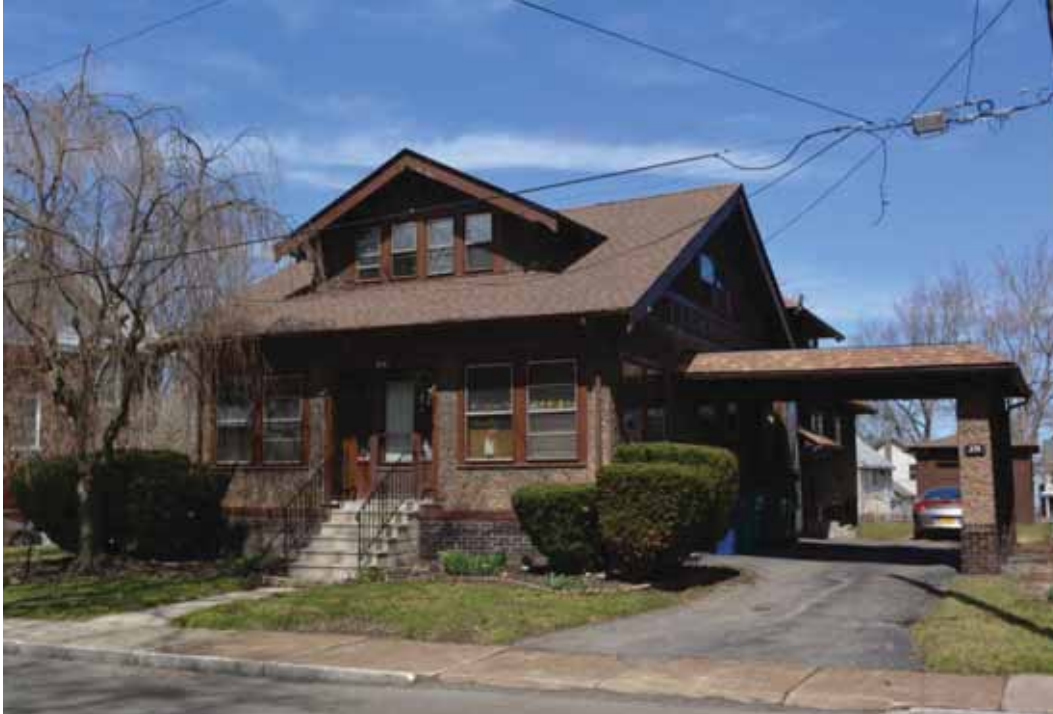
Photograph 4.41a. Residence at 370 (368) Spruce Avenue, facing northwest (Panamerican 2015).