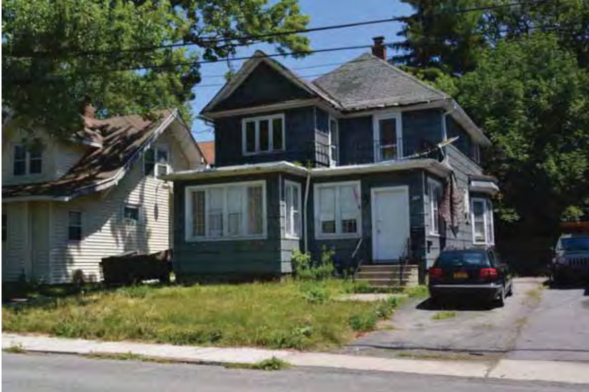
Photograph 4.177. 2819 Whirlpool Street, facing northeast.