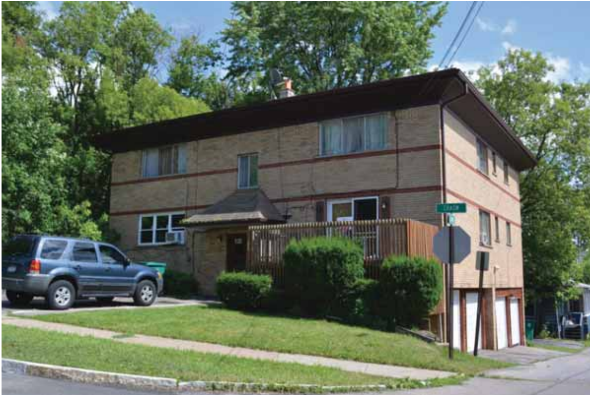
Photograph 4.58. 611 Chasm Avenue, facing southeast.