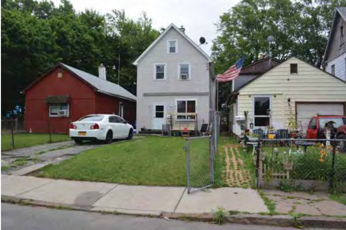
Photograph 4.185. 715 Willow Street, facing south.