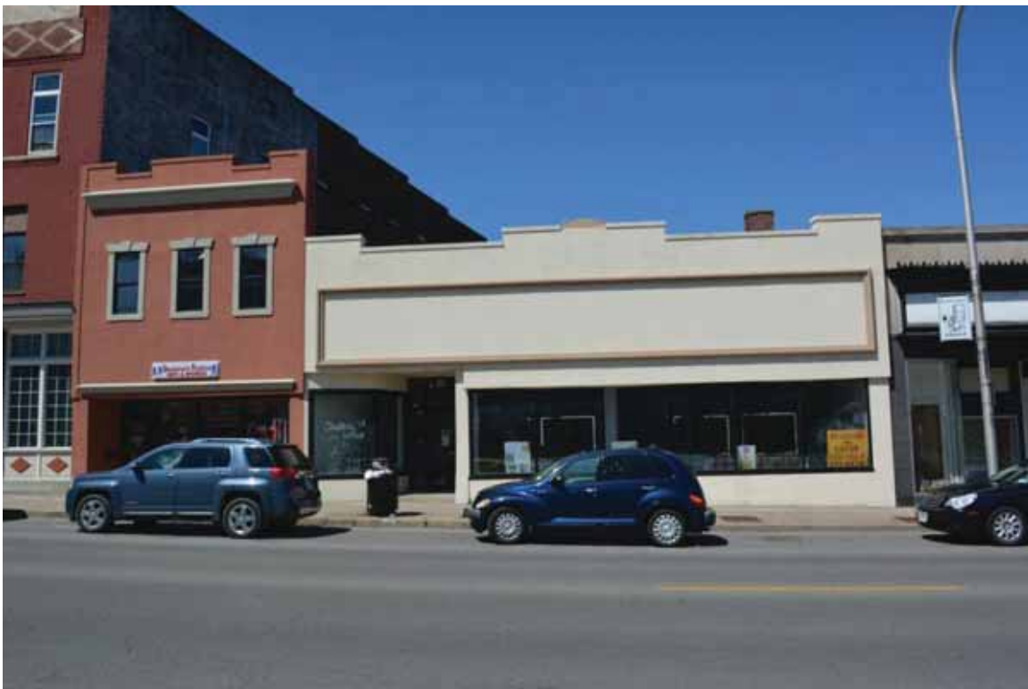
Photograph 4.134. 1908 Main Street, facing west ( Panamerican 2014 ).