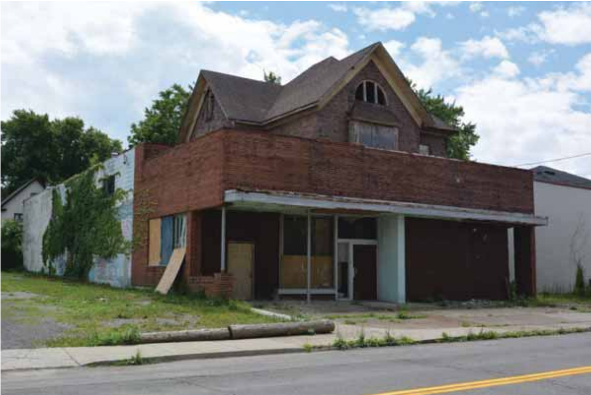
Photograph 4.68. 813 Cleveland Avenue, facing southwest.