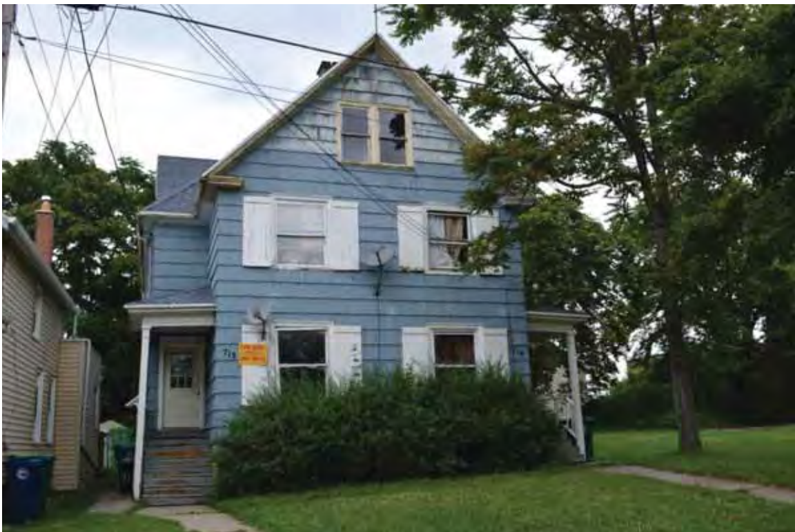
Photograph 4.70. 712 Division Avenue, facing north (Panamerican 2014).