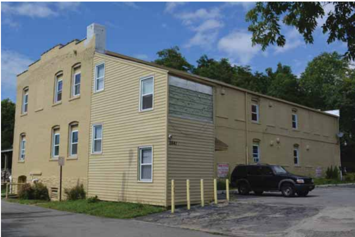
Photograph 4.160. 2641 Whirlpool Street, facing northeast.