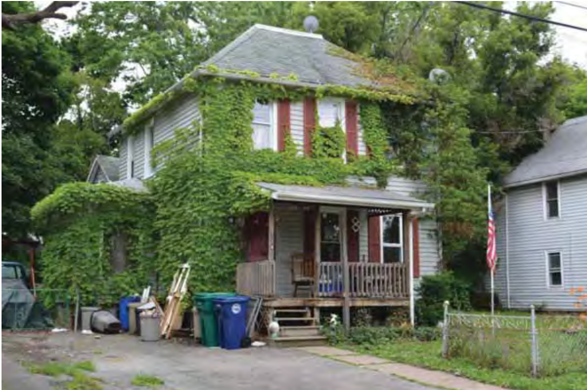
Photograph 4.188. 729 Willow Street, facing southwest (Panamerican 2014).