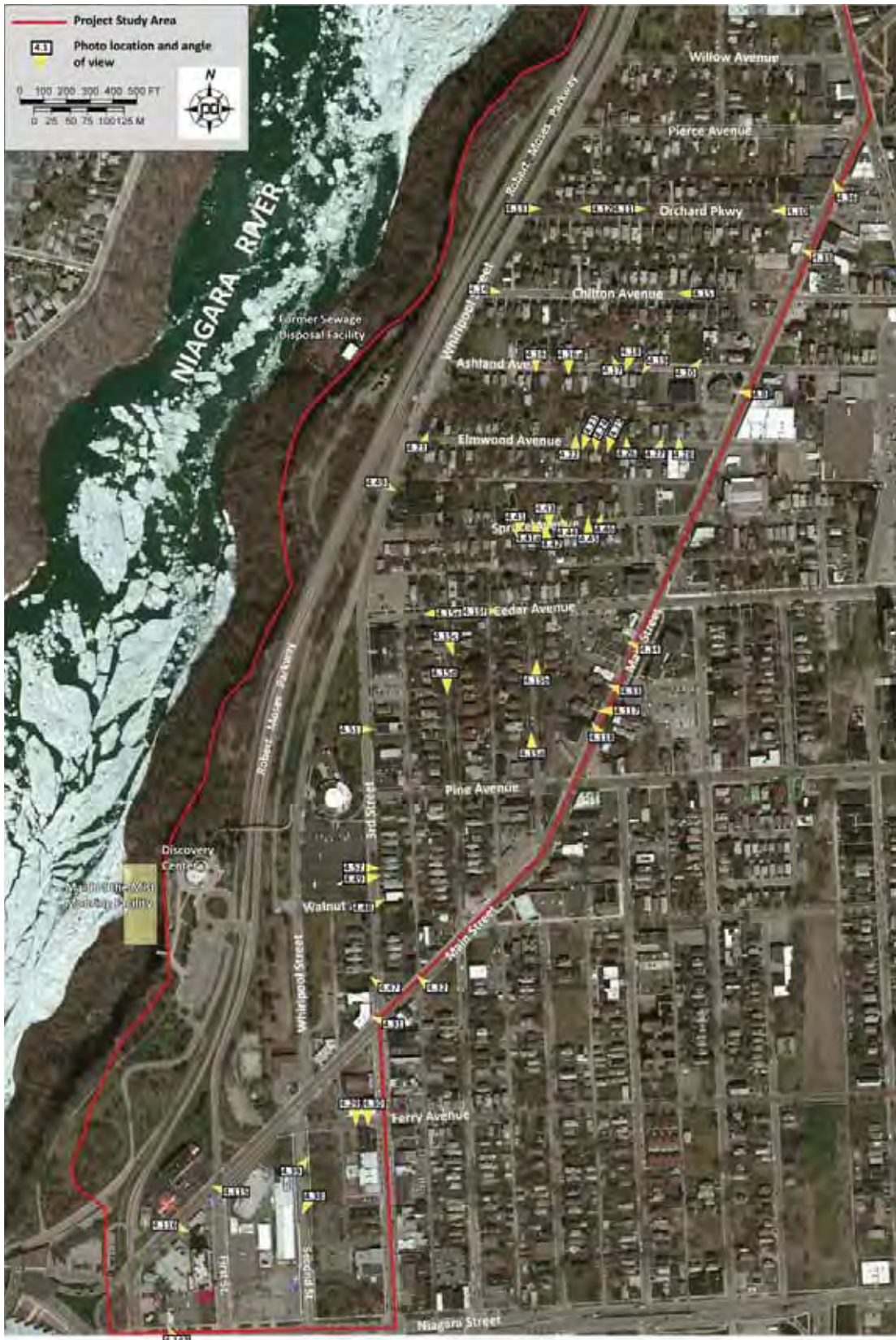
Figure 4.4. Southern portion of RMP North APE.