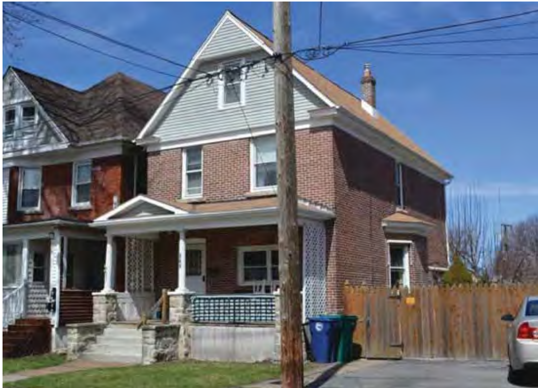
Photograph 4.44. Residence at 378 Spruce Avenue, facing northwest (Panamerican 2015).