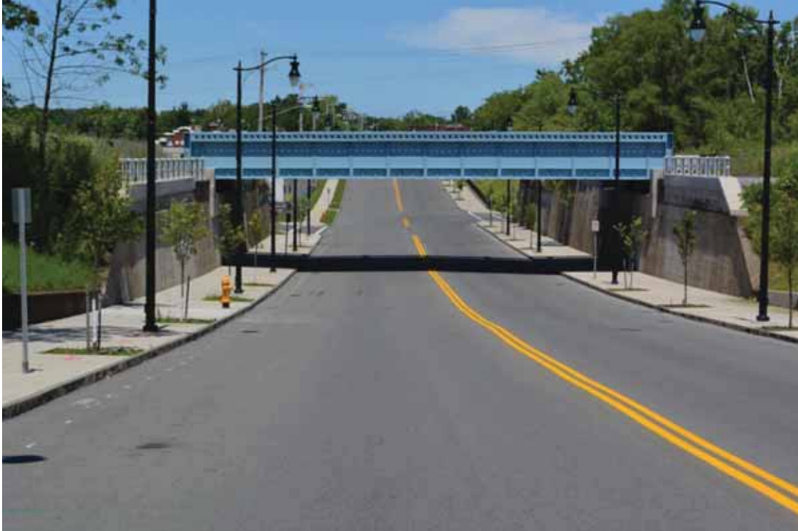
Photograph 4.135. Railroad bridge over Main Street, at North Ave, facing north (Panamerican 2014).