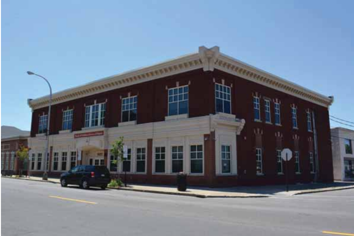
Photograph 4.123. 1522 Main Street, facing west-northwest.