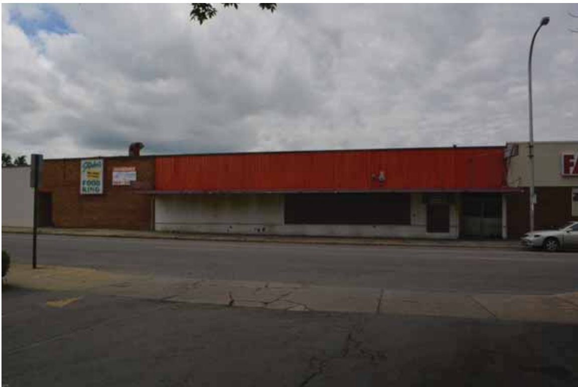
Photograph 4.126. 1614 Main Street, facing west (Panamerican 2014).