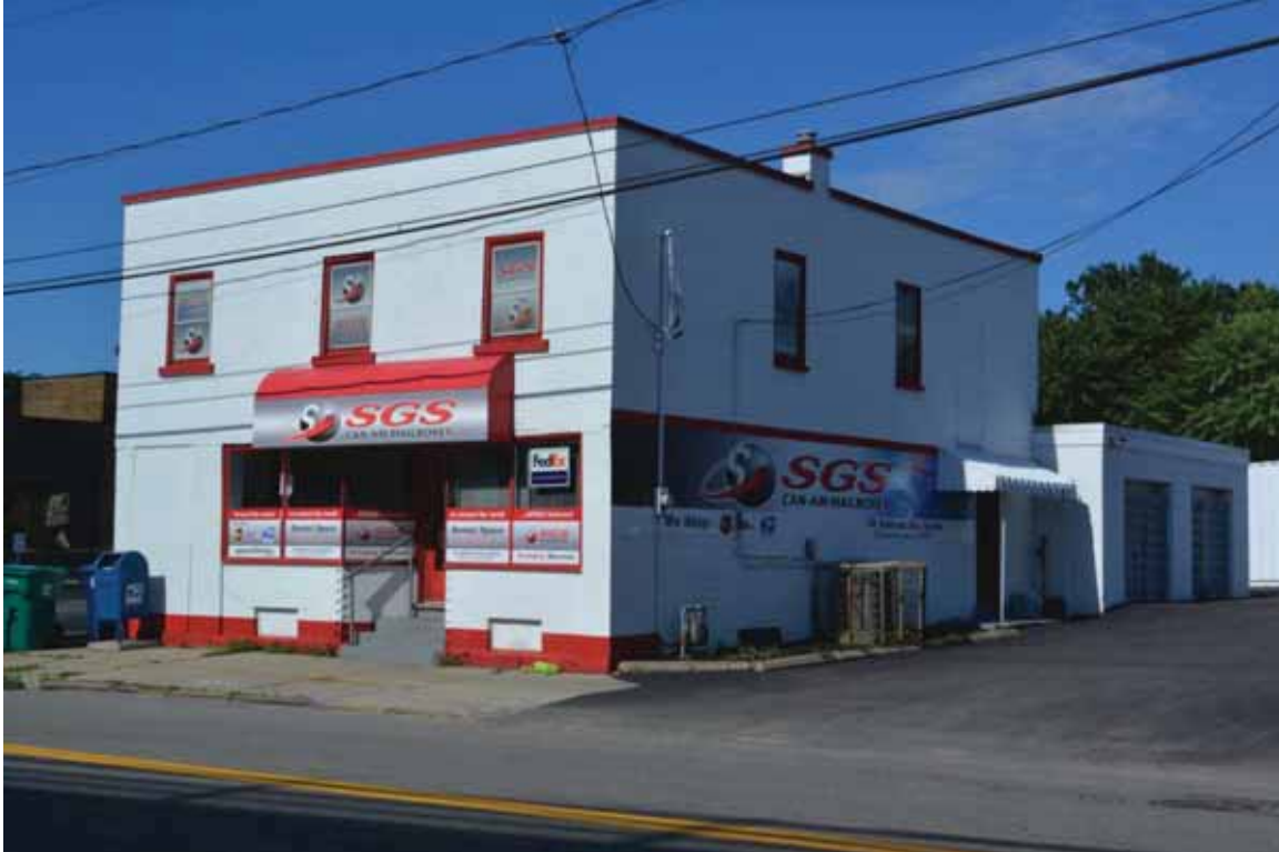
Photograph 4.155. 2315 Whirlpool Street, facing northeast (Panamerican 2014).