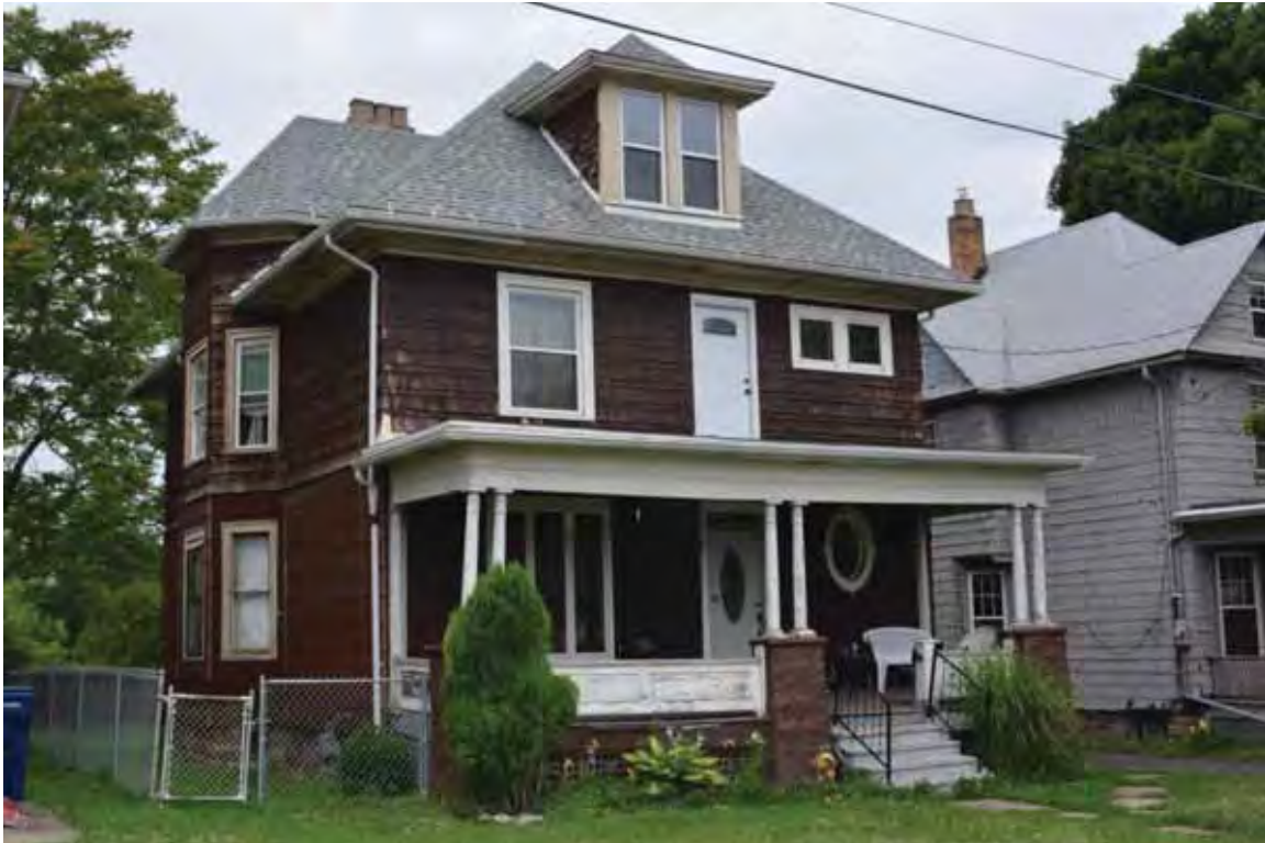
Photograph 4.92. 1636 Eighth Street, facing west-northwest.