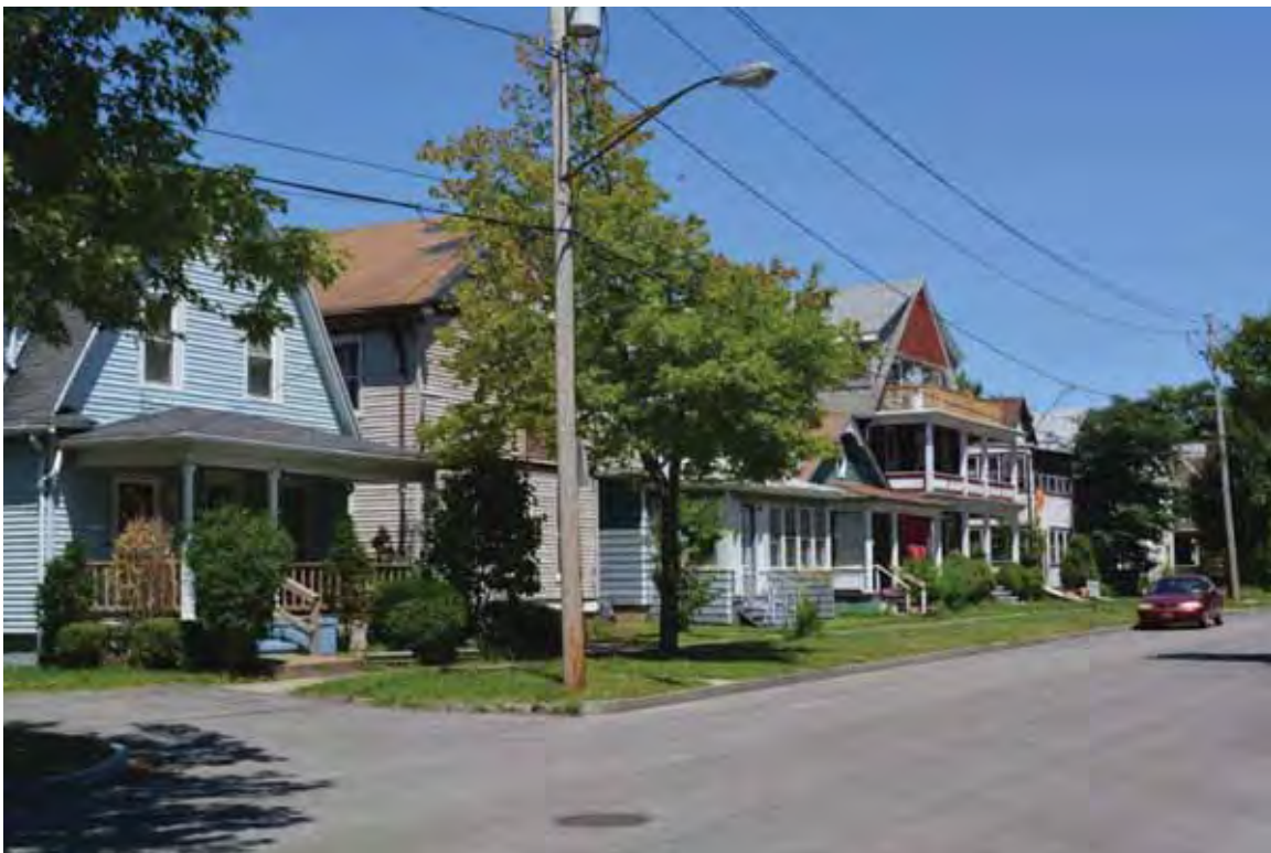
Photograph 4.15f. North side of Cedar Avenue, Park Place Historic District, facing northeast ( Panamerican 2014 ).