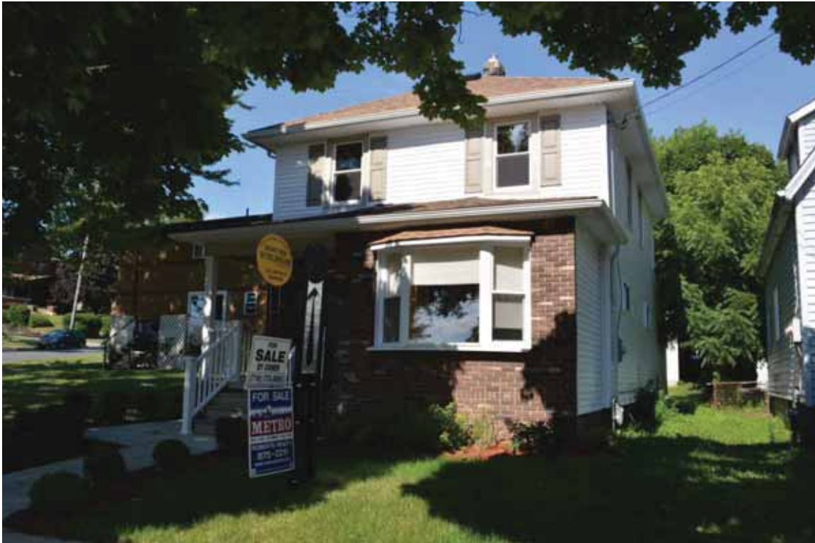
Photograph 4.174. 2685 Whirlpool Street, facing east (Panamerican 2014).