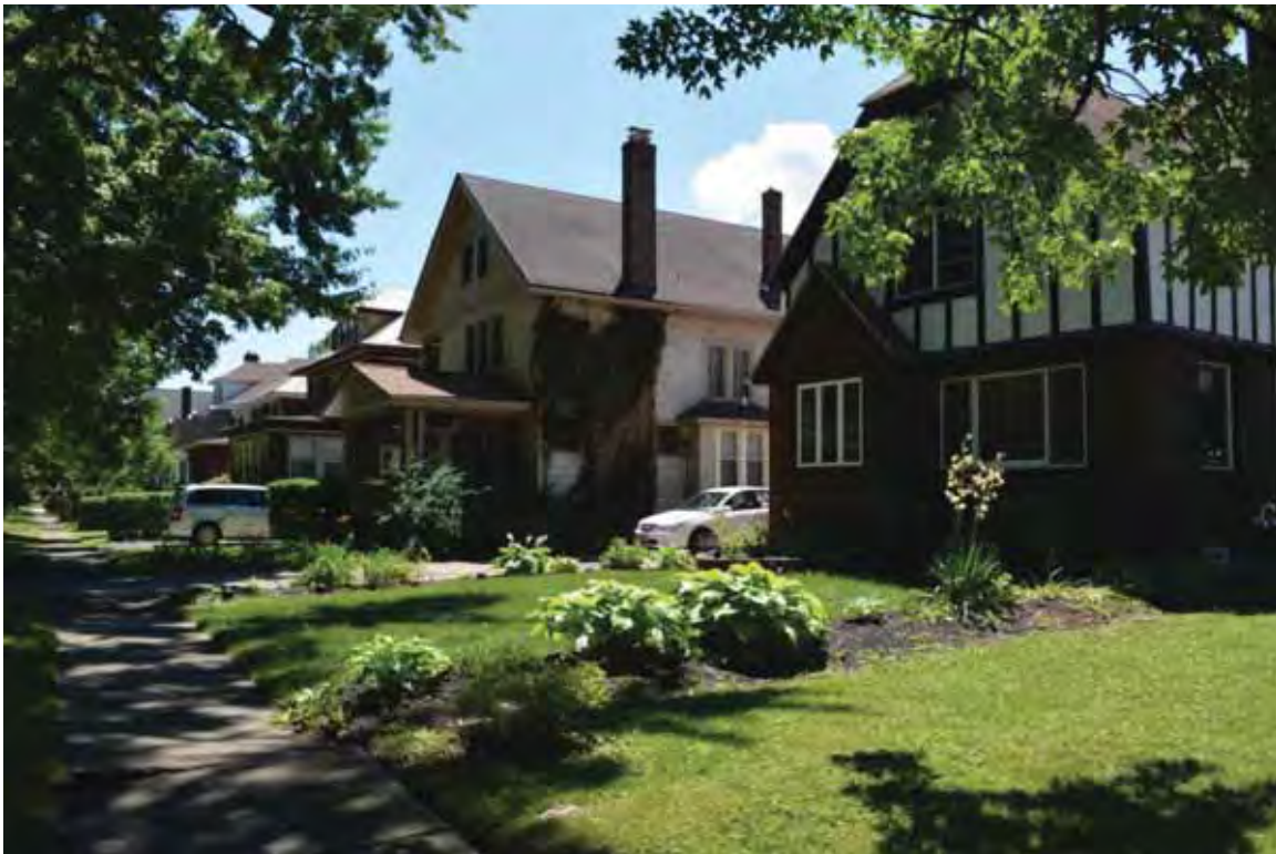
Photograph 4.15d. West side of Fourth Street, Park Place Historic District, facing southeast ( Panamerican 2014 ).