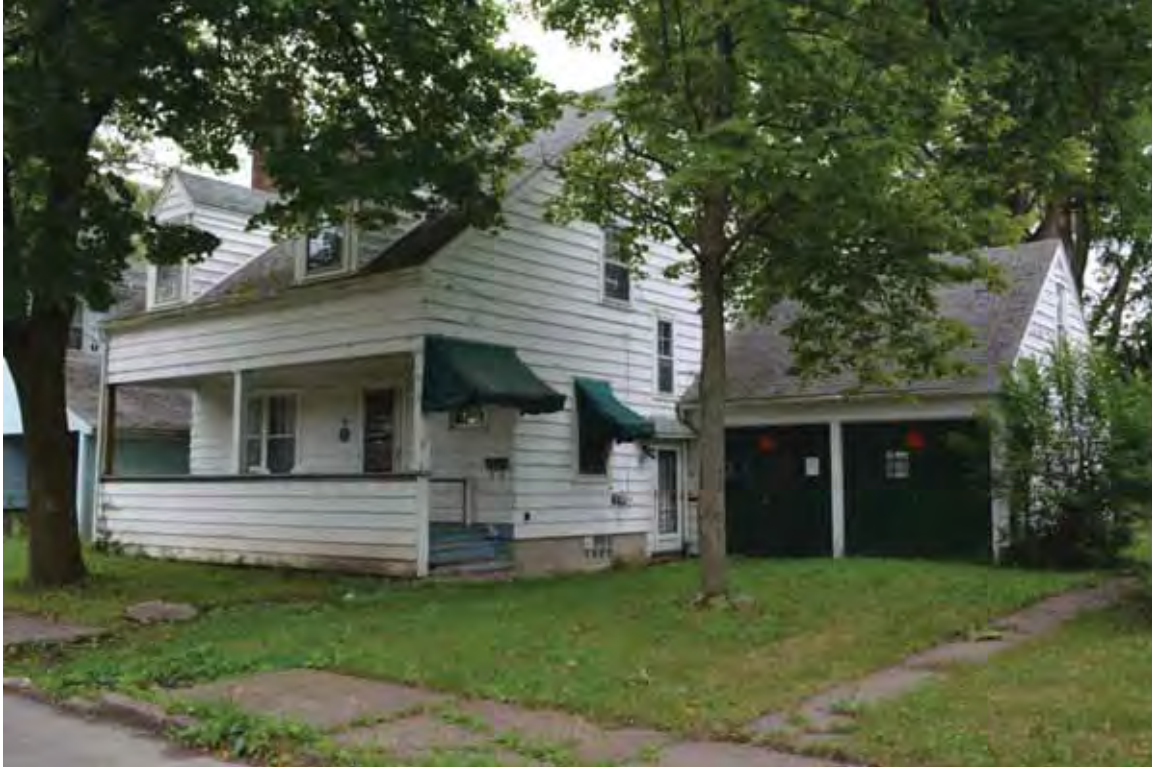
Photograph 4.189. 735 Willow Street, facing southeast (Panamerican 2014).