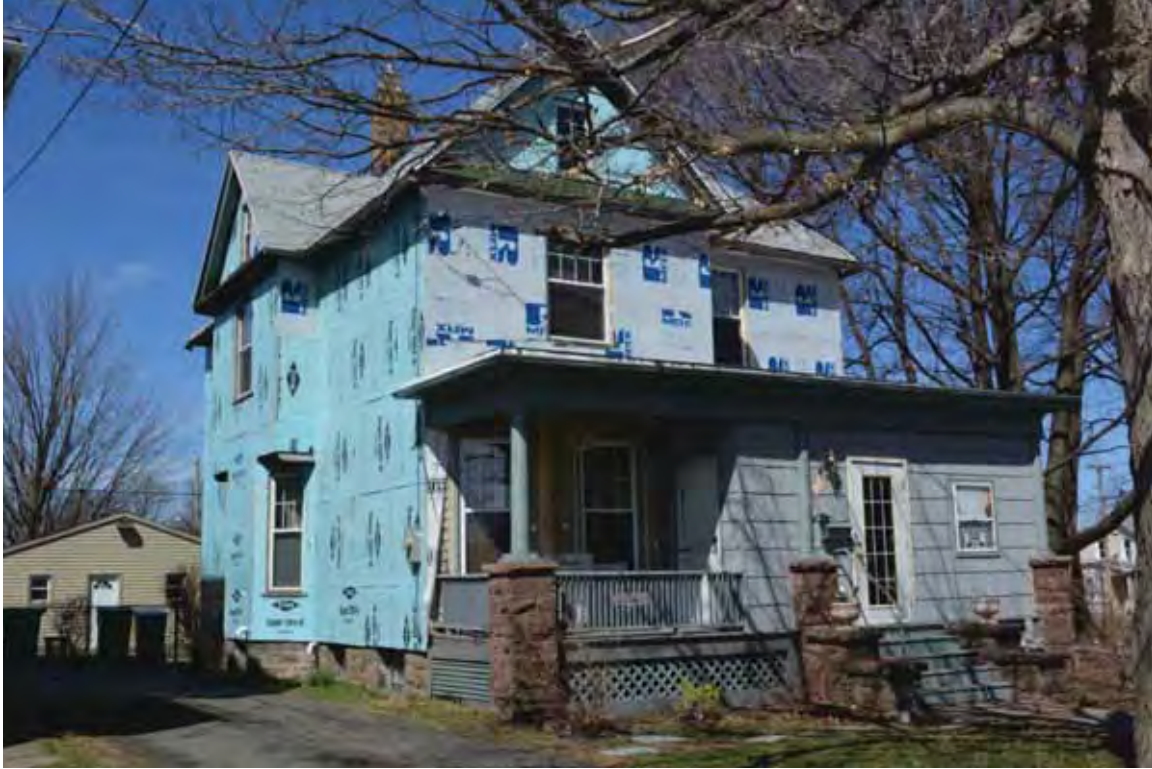
Photograph 4.93. 1640 Eighth Street, facing west-northwest.