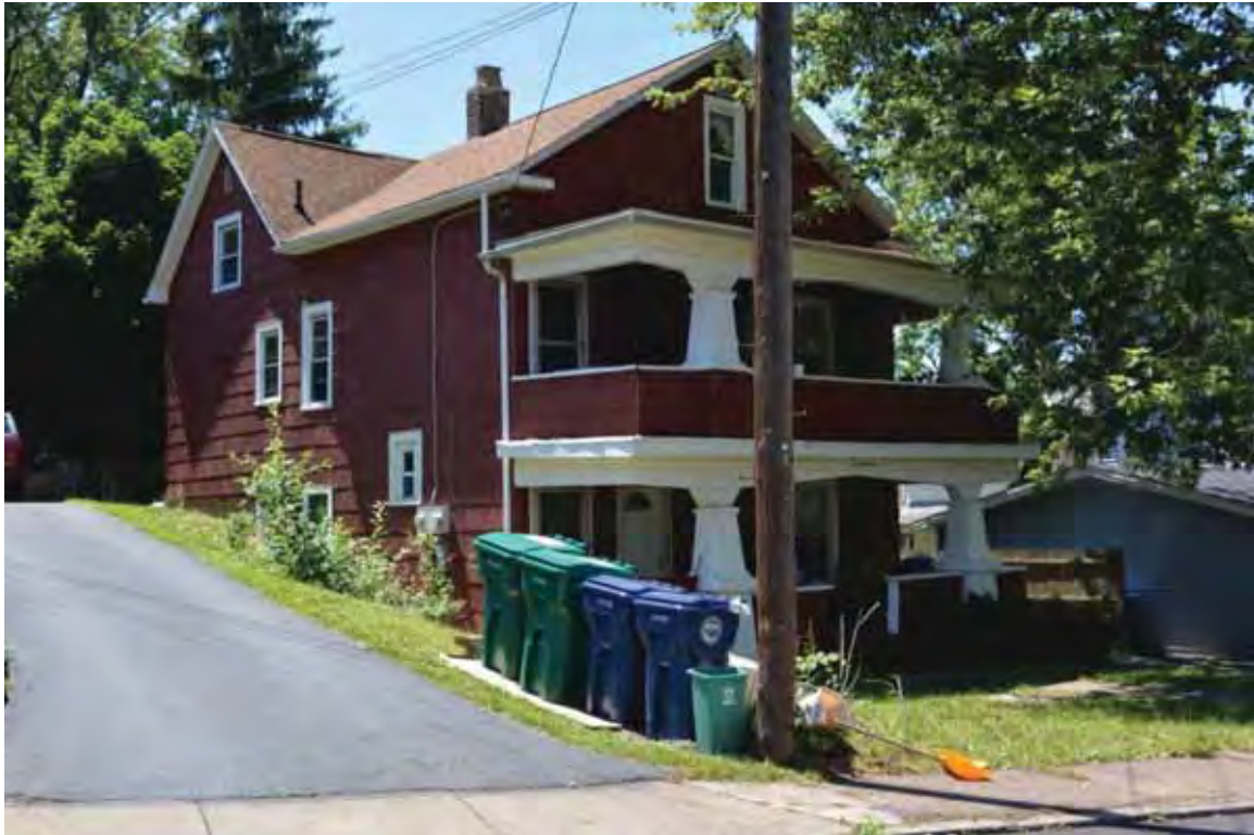
Photograph 4.61. 613 Chestnut Avenue, facing southwest ( Panamerican 2014 ).