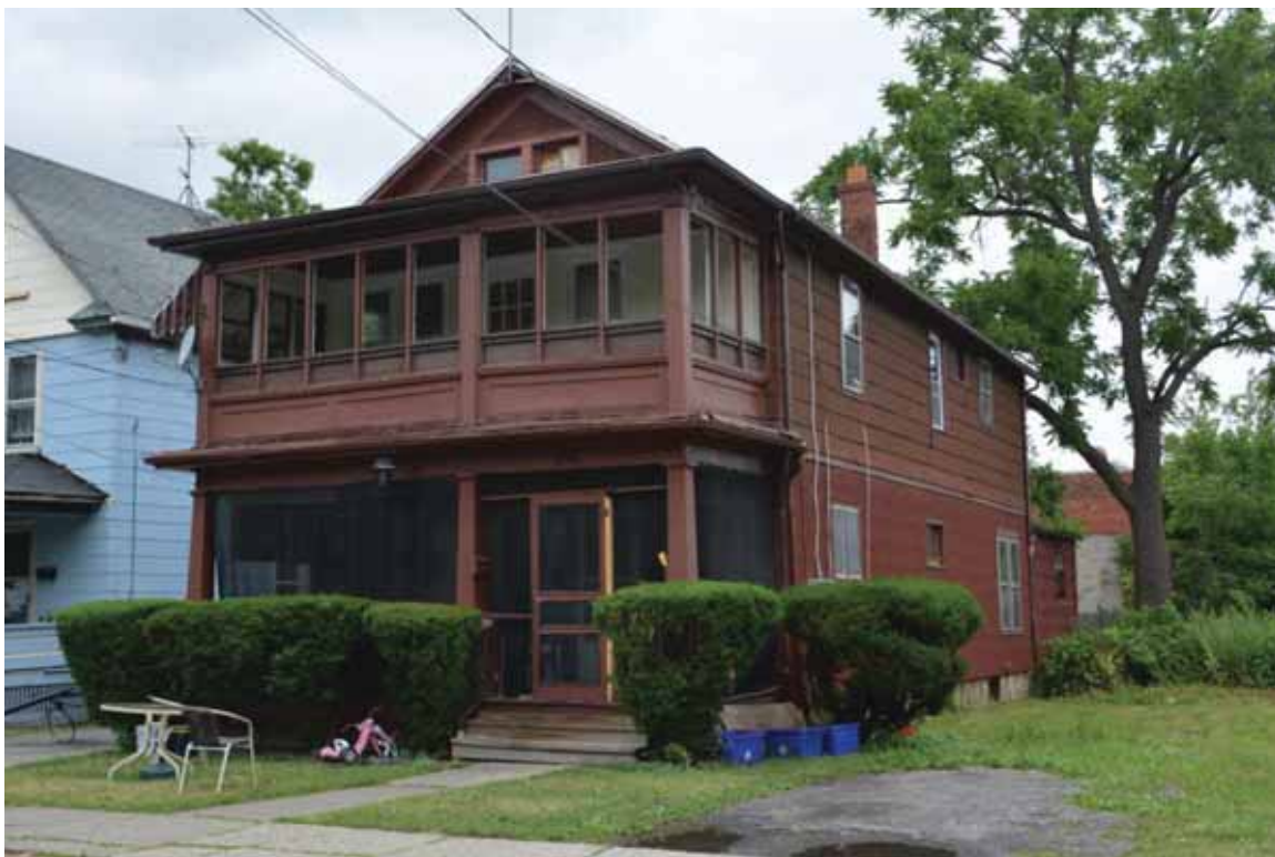
Photograph 4.193. 814 Willow Street, facing northwest.