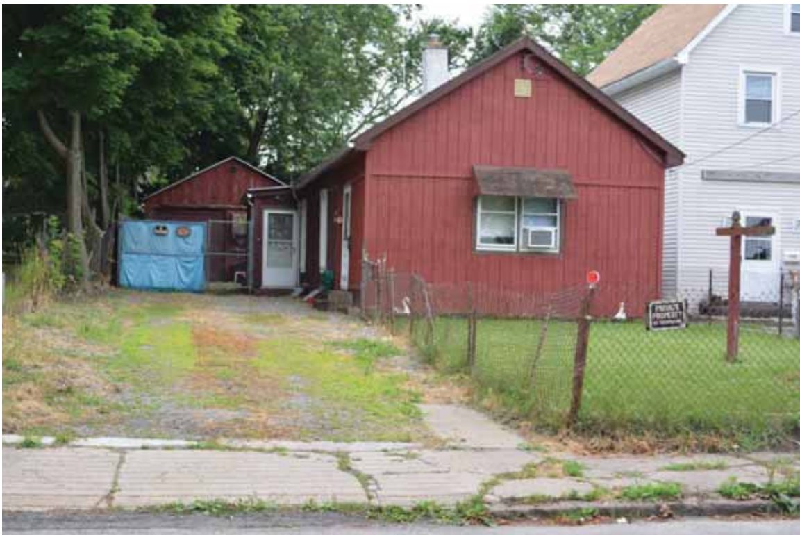
Photograph 4.186. 717 Willow Street, facing south.