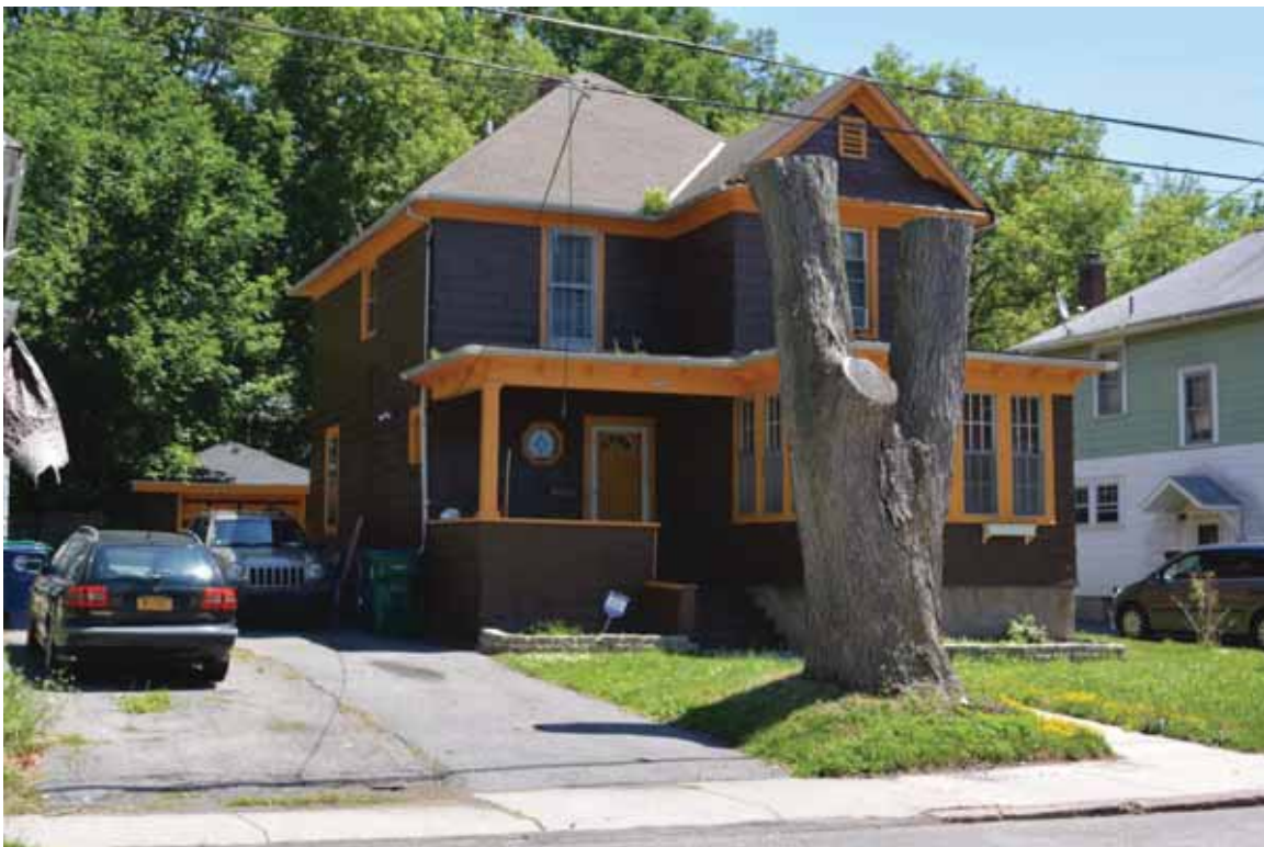
Photograph 4.176. 2815 Whirlpool Street, facing east (Panamerican 2014).