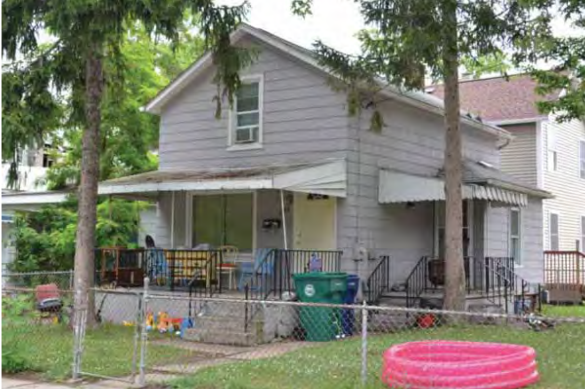
Photograph 4.83. 1503 Eighth Street, facing northeast.