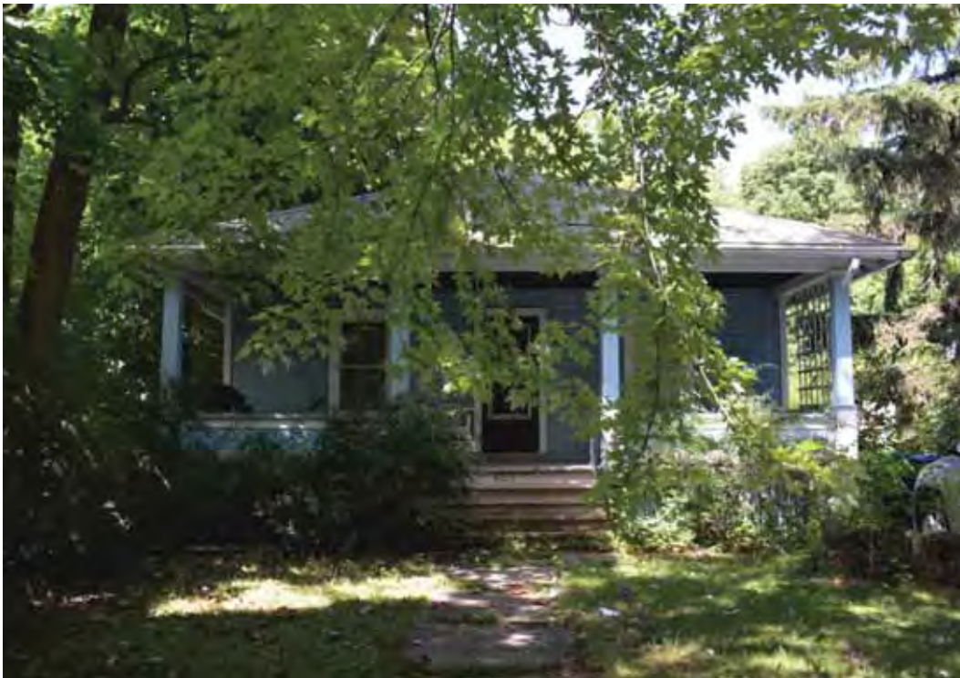
Photograph 4.21. Residence at 408 Elmwood Avenue, facing north (Panamerican 2014).