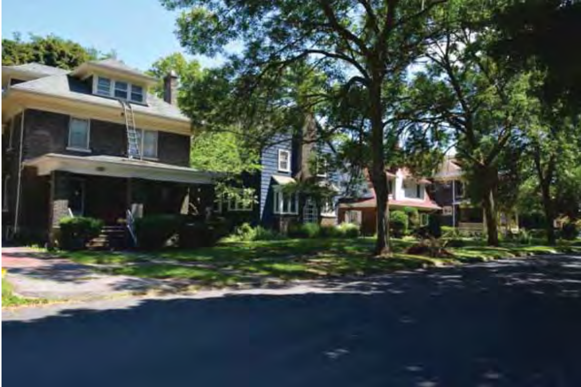
Photograph 4.15c. East side of Fourth Street, Park Place Historic District, facing southeast ( Panamerican 2014 ).