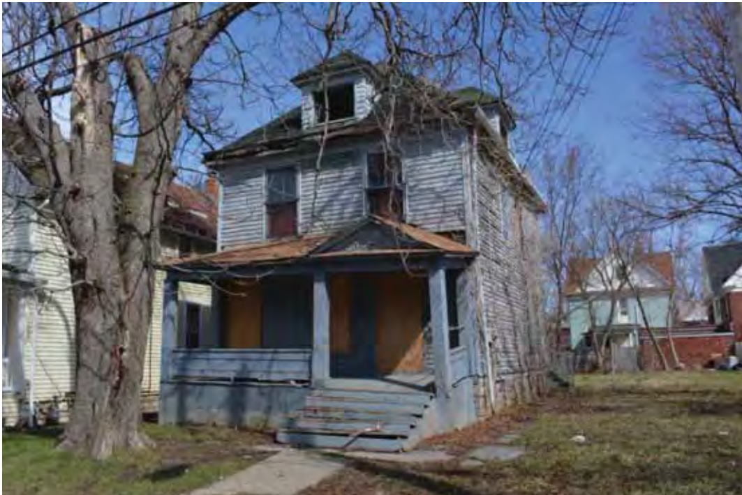
Photograph 4.17. Residence (vacant) at 670 Ashland Avenue, facing northwest (Panamerican 2015).