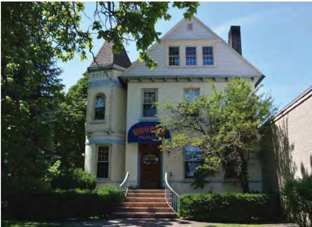
Photograph 4.33. Davy Home at 742 Main Street, facing west (Panamerican 2014).