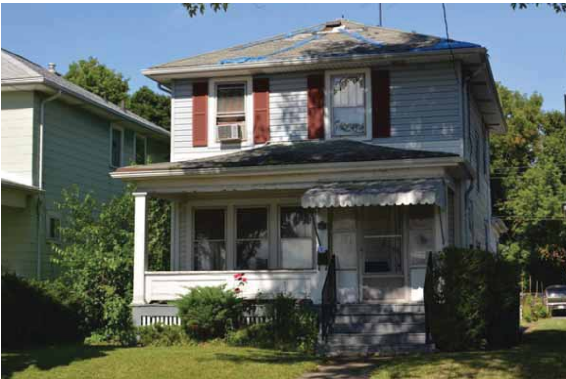
Photograph 4.166. 2661 Whirlpool Street, facing east (Panamerican 2014).