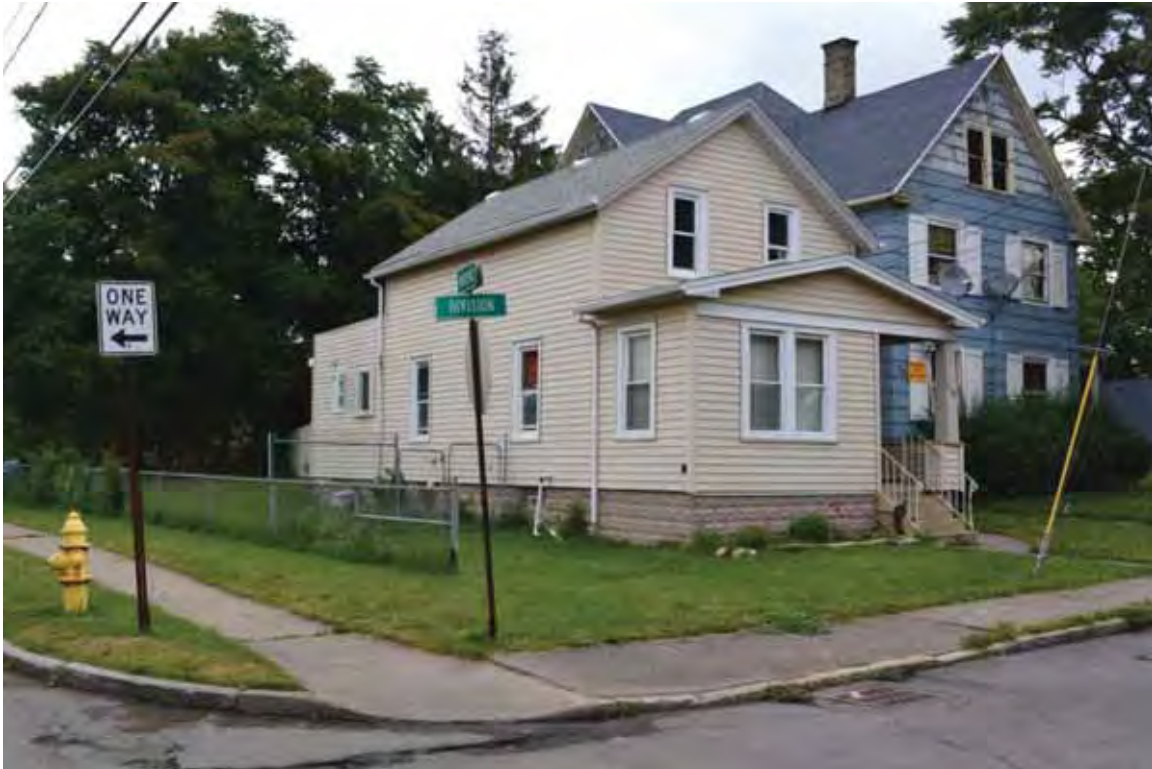
Photograph 4.69. 710 Division Avenue, facing northeast (Panamerican 2014).