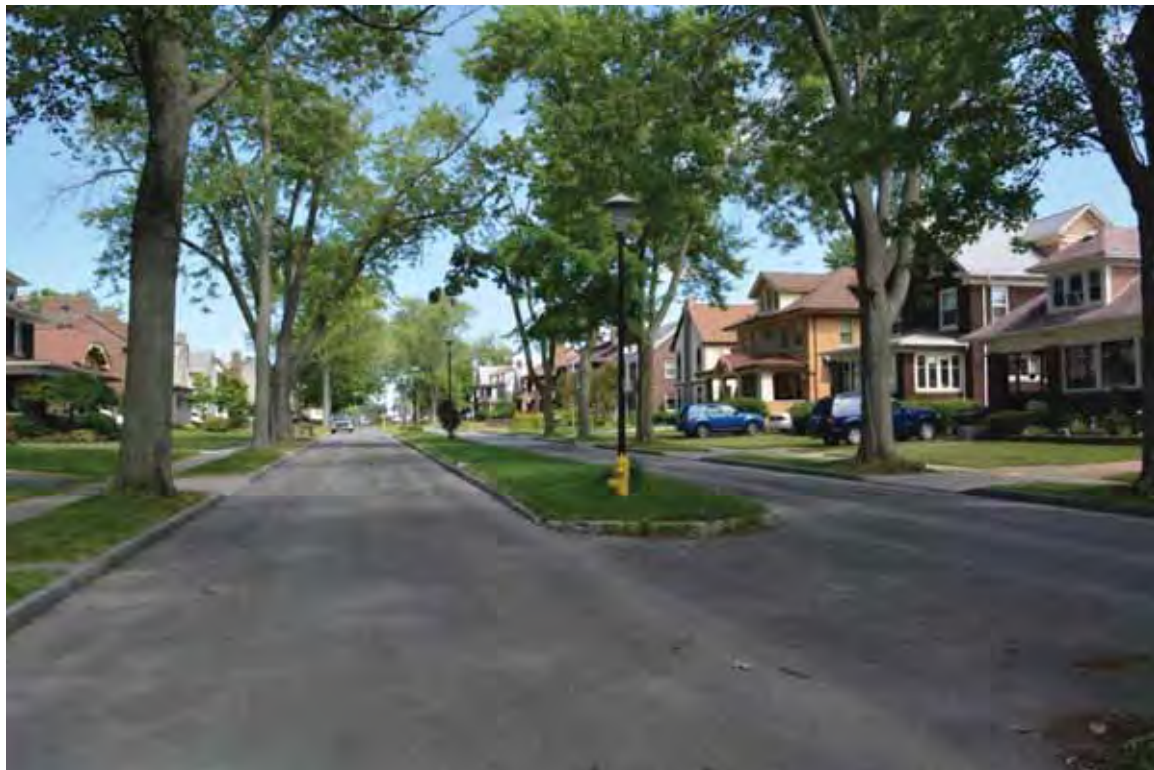
Photograph 4.11. Chilton Avenue-Orchard Parkway Historic District from 638 Orchard Parkway, facing east ( Panamerican 2014 ).