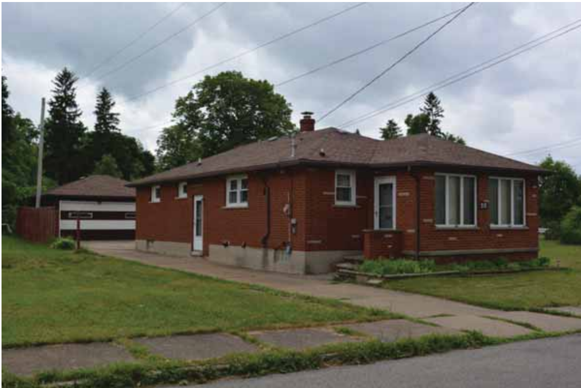
Photograph 4.108. 717 Linwood Avenue, facing southwest.