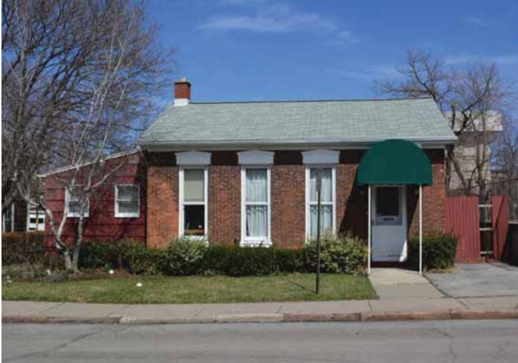
Photograph 4.28. Residence at 652 Elmwood Avenue, facing north ( Panamerican 2015 ).