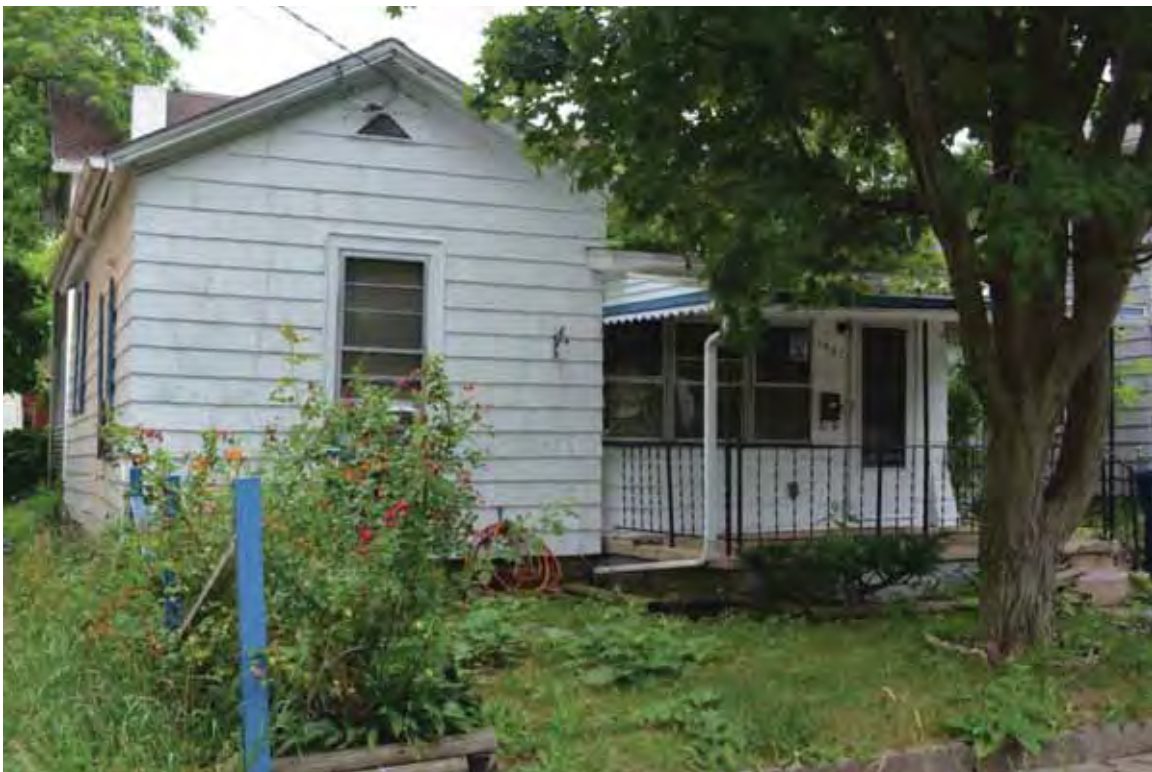
Photograph 4.84. 1507 Eighth Street, facing east.