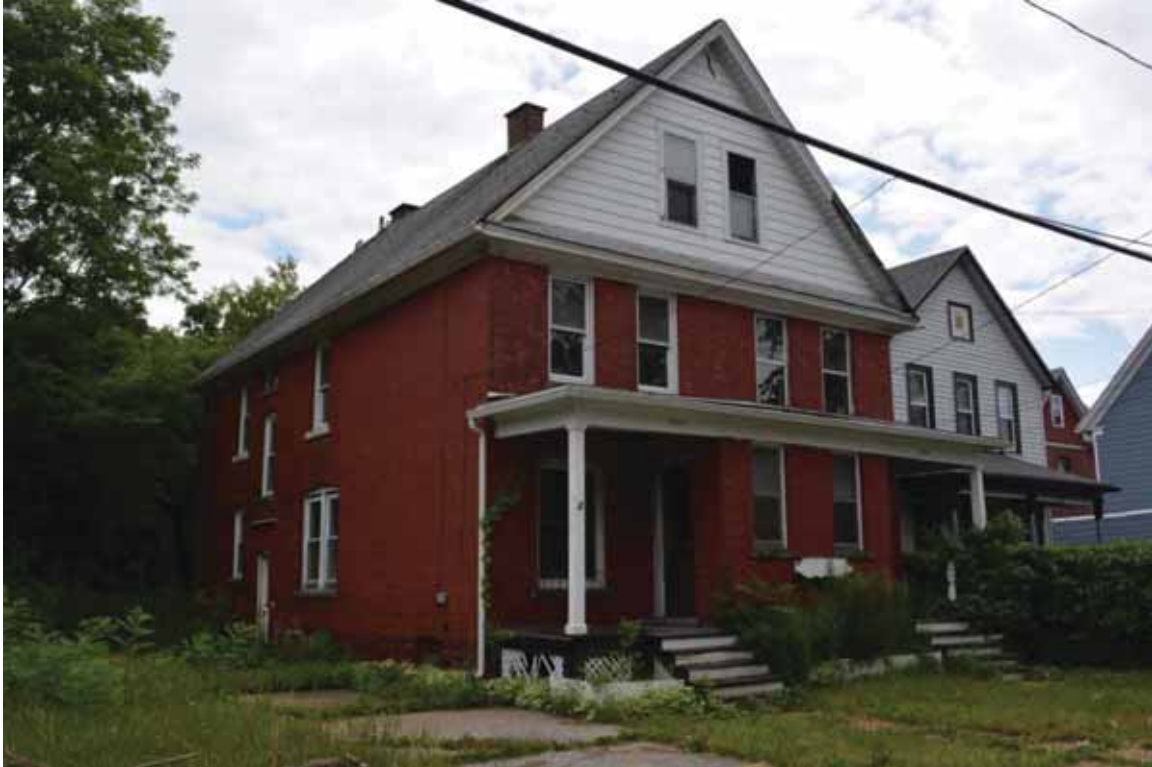
Photograph 4.79. 1411-13 Eighth Street, facing southeast (Panamerican 2014).