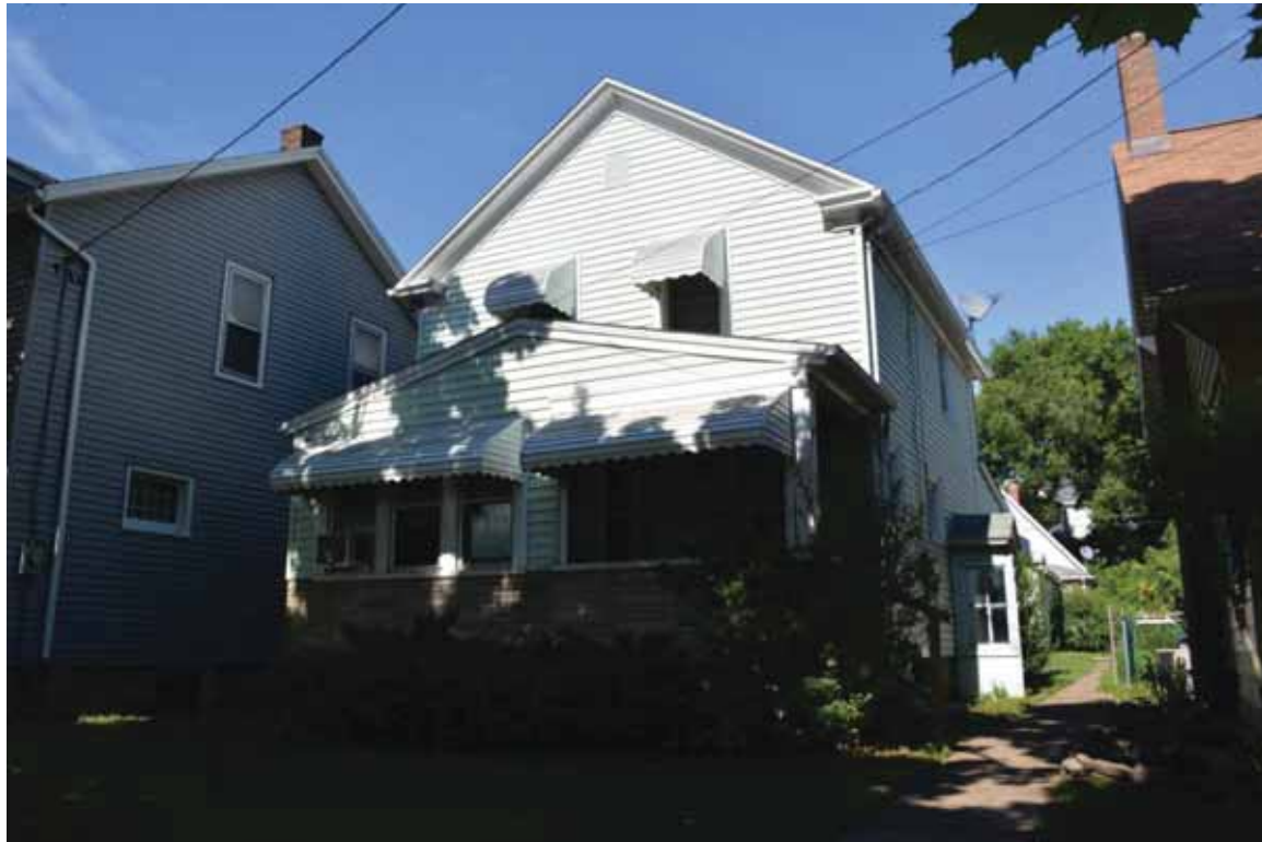
Photograph 4.170. 2673 Whirlpool Street, facing east (Panamerican 2014).