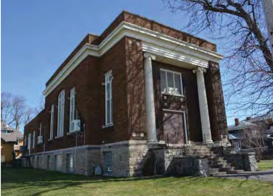
Photograph 4.20. Temple Bethel at 720 Ashland Avenue, facing northeast (Panamerican 2015).