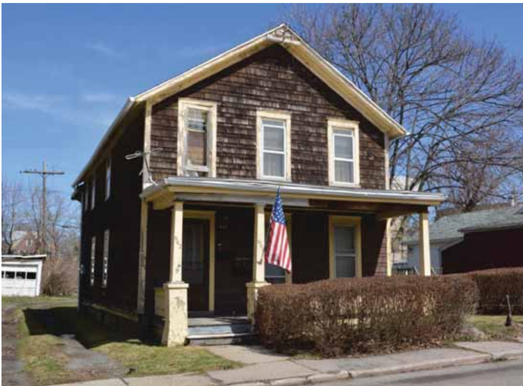
Photograph 4.27. Residence at 642-44 Elmwood Avenue, facing northeast (Panamerican 2015).