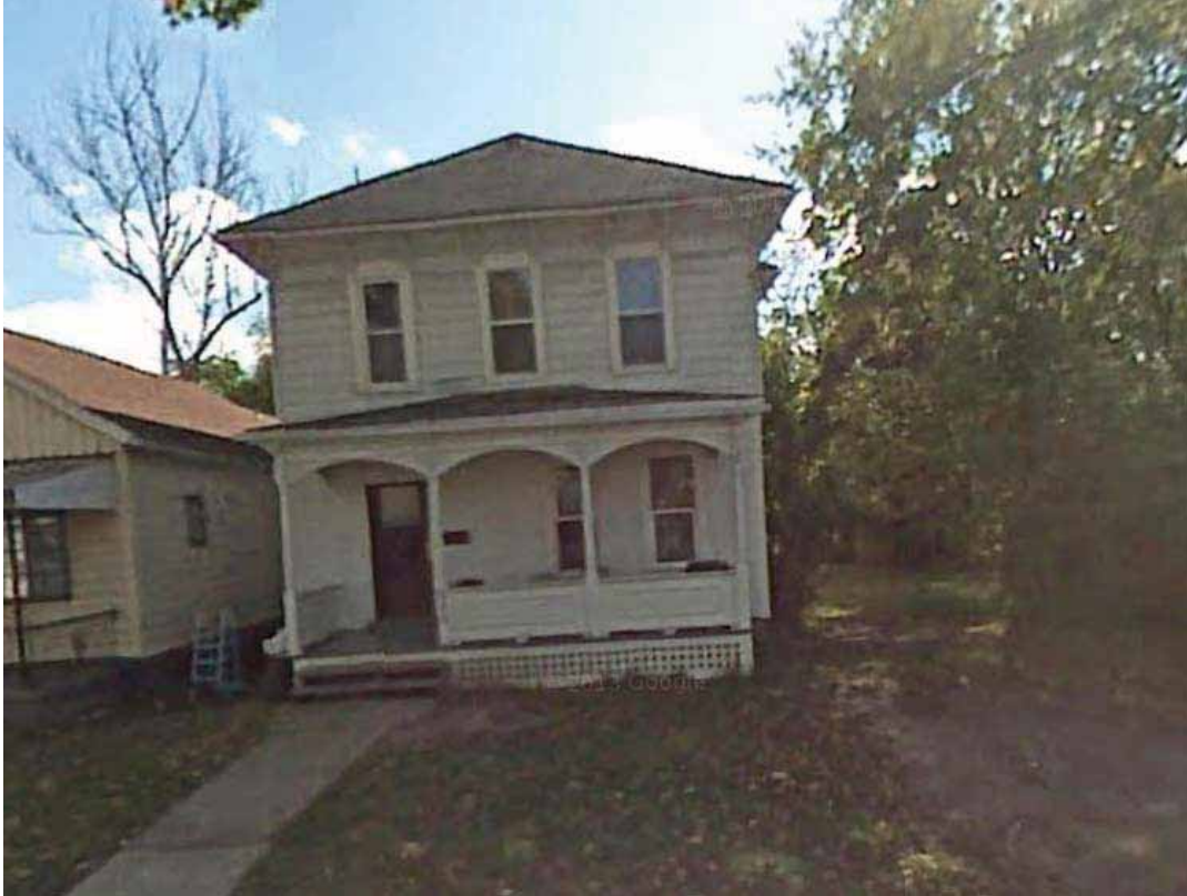
Photograph 4.16a. Residence at 670 Ashland Avenue, facing south (Google 2015).