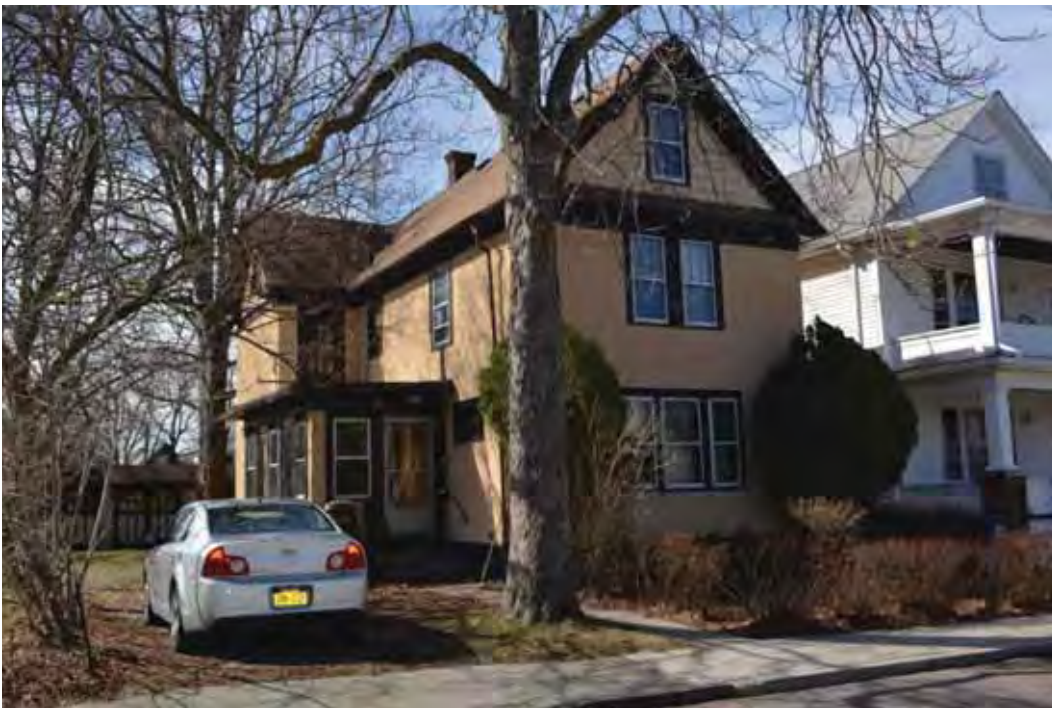
Photograph 4.19. Residence at 701 Ashland Avenue, facing southwest (Panamerican 2015).