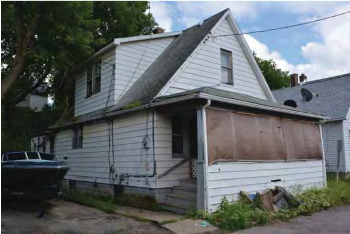
Photograph 4.148. 2665 Spring Street, facing southeast (Panamerican 2014).