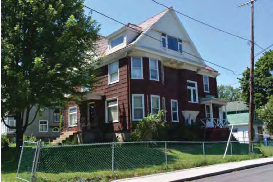
Photograph 4.95. 2816 Lewiston Road, facing southwest.