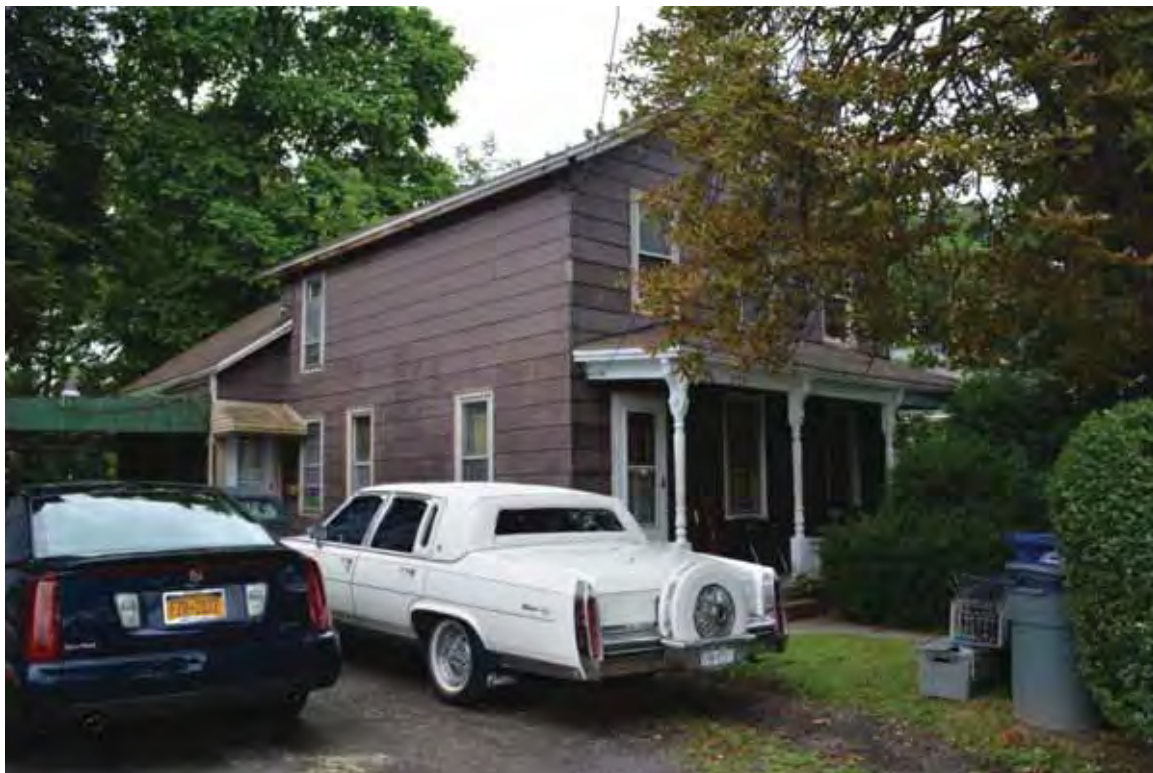
Photograph 4.196. 819 Willow Street, facing southwest.