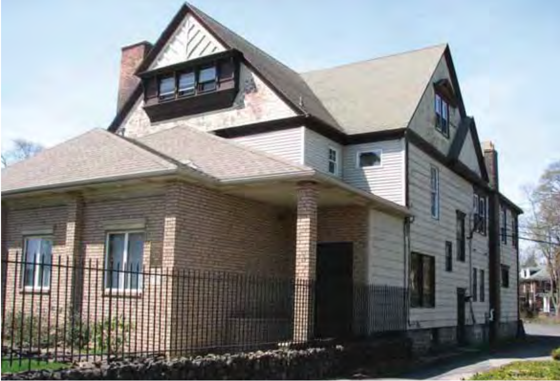
Photograph 4.117. Paul A. Schoellkopf House at 730 Main Street, facing southwest (Panamerican 2015).