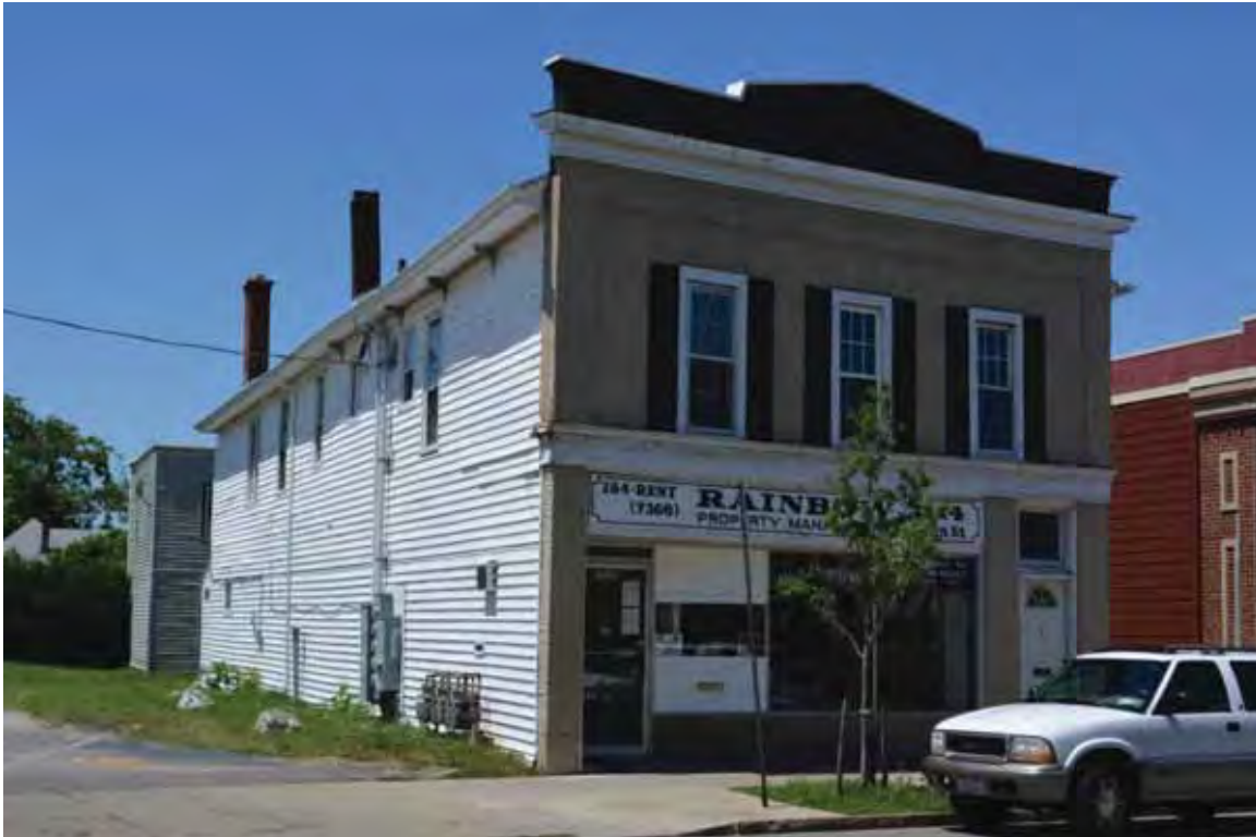
Photograph 4.122. 1514 Main Street, facing west-northwest (Panamerican 2014).