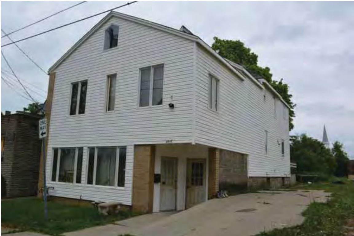
Photograph 4.72. 726 Division Avenue, facing north (Panamerican 2014).