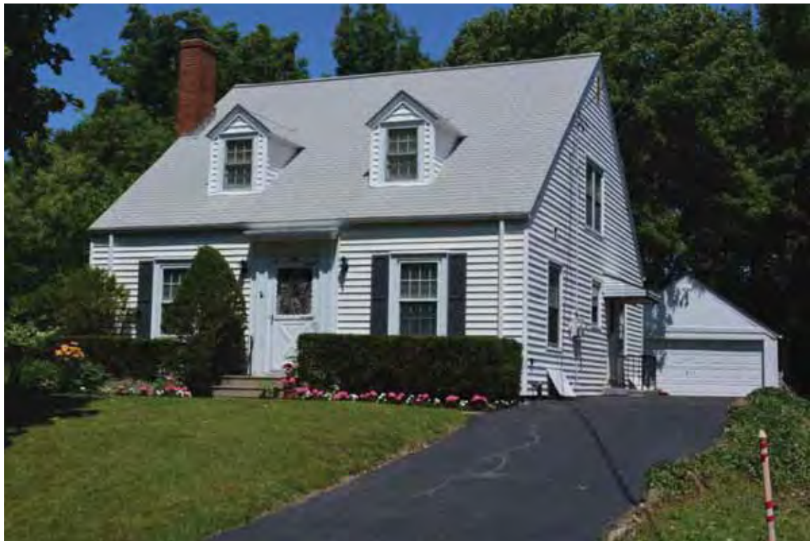
Photograph 4.60. 612 Chestnut Avenue, facing northwest (Panamerican 2014).