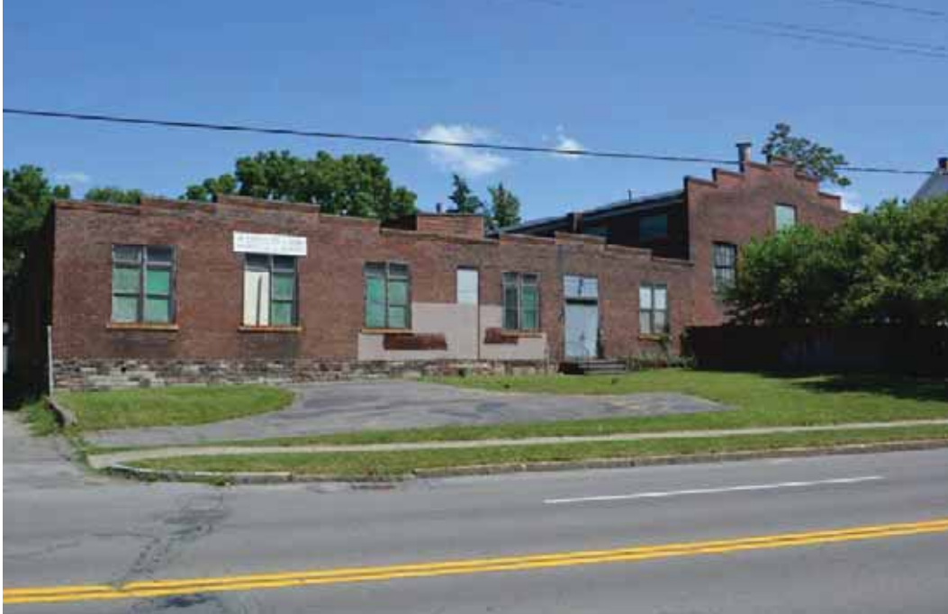
Photograph 4.40. Whirlpool Street frontage of 318 Spruce Avenue, facing east ( Panamerican 2014 ).