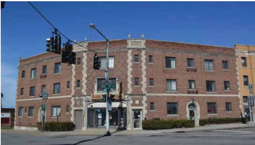
Photograph 4.31. Sagamore Apartments at 530 Main Street, facing northwest ( Panamerican 2015 ).