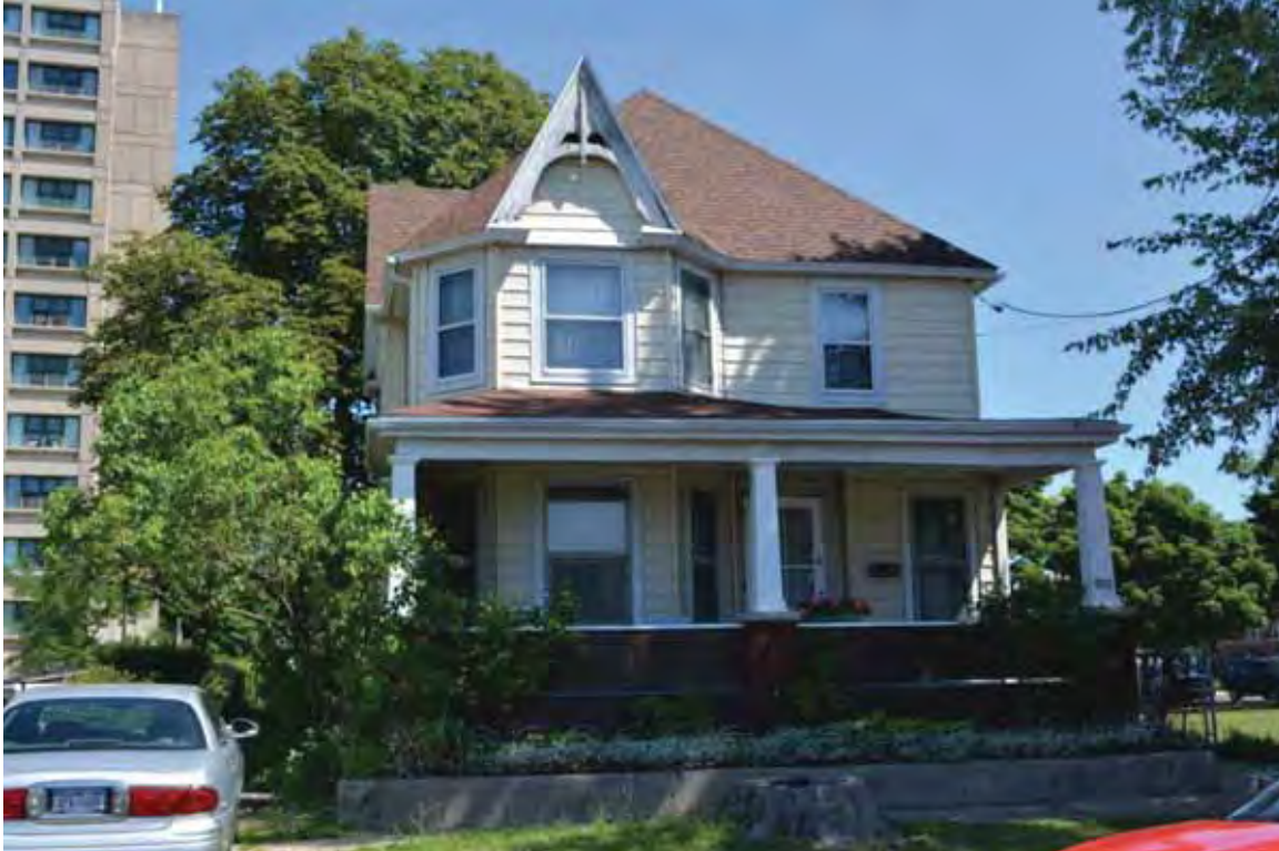
Photograph 4.141. 810 Niagara Avenue, facing north (Panamerican 2014).