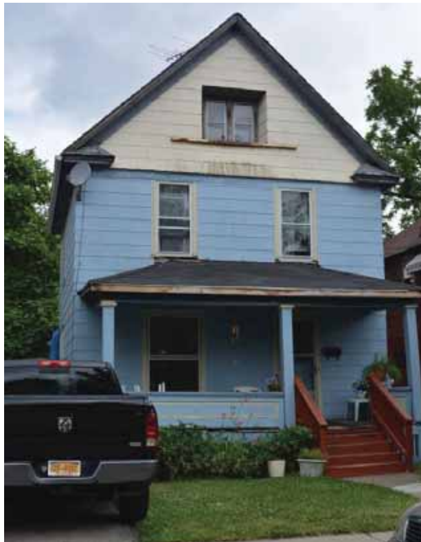
Photograph 4.192. 810 Willow Street, facing north.