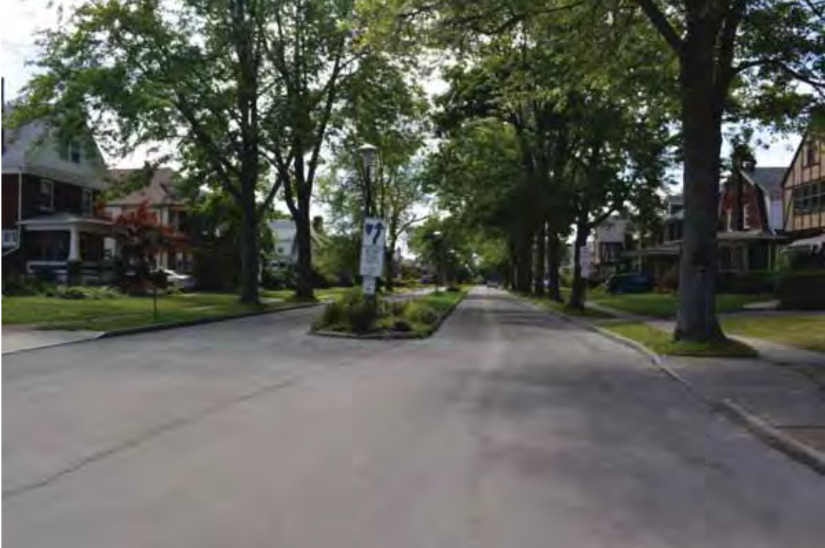
Photograph 4.10. Chilton Avenue-Orchard Parkway Historic District from east end of Orchard Parkway, facing west ( Panamerican 2014 ).