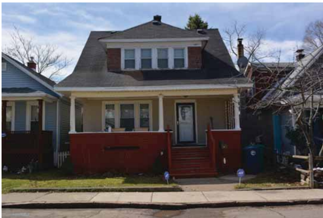
Photograph 4.16. Residence at 637 Ashland Avenue, facing south (Panamerican 2015).