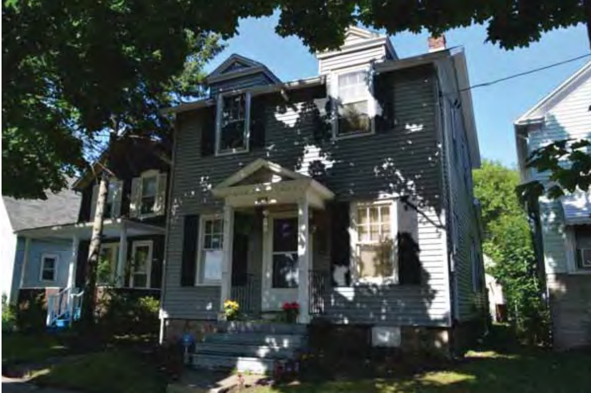
Photograph 4.171. 2675 Whirlpool Street, facing east (Panamerican 2014).