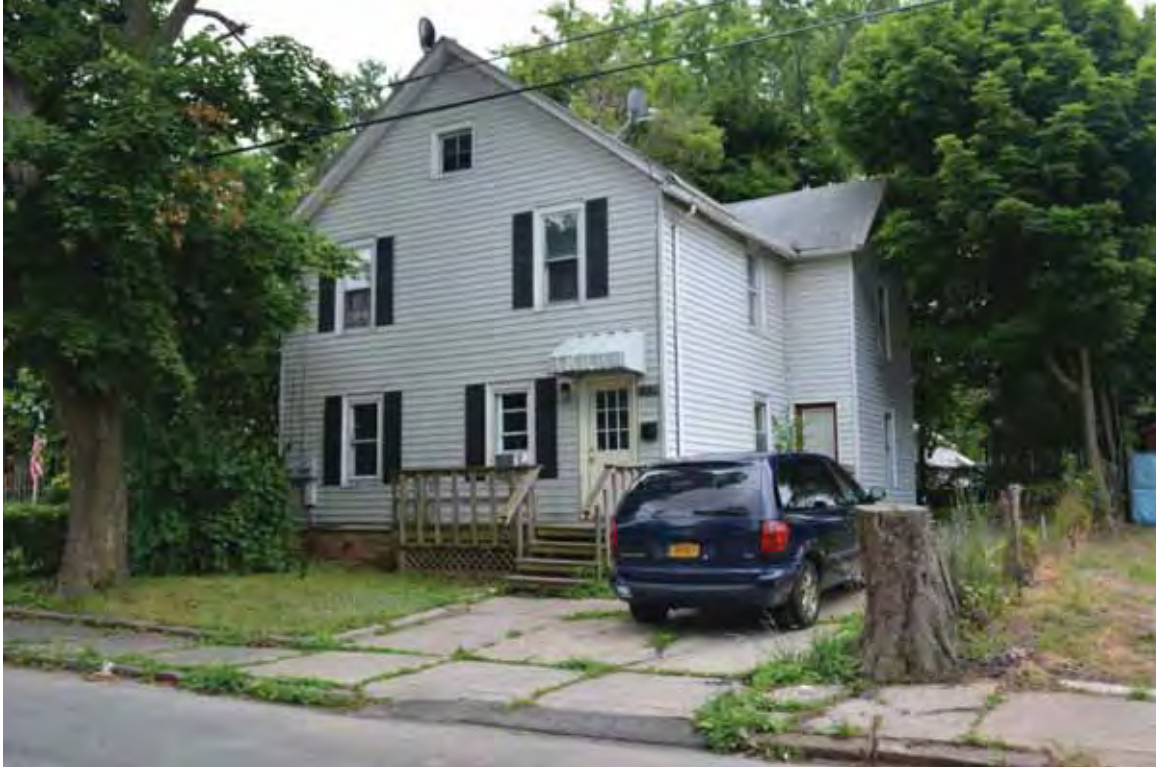
Photograph 4.187. 721 Willow Street, facing southeast (Panamerican 2014).