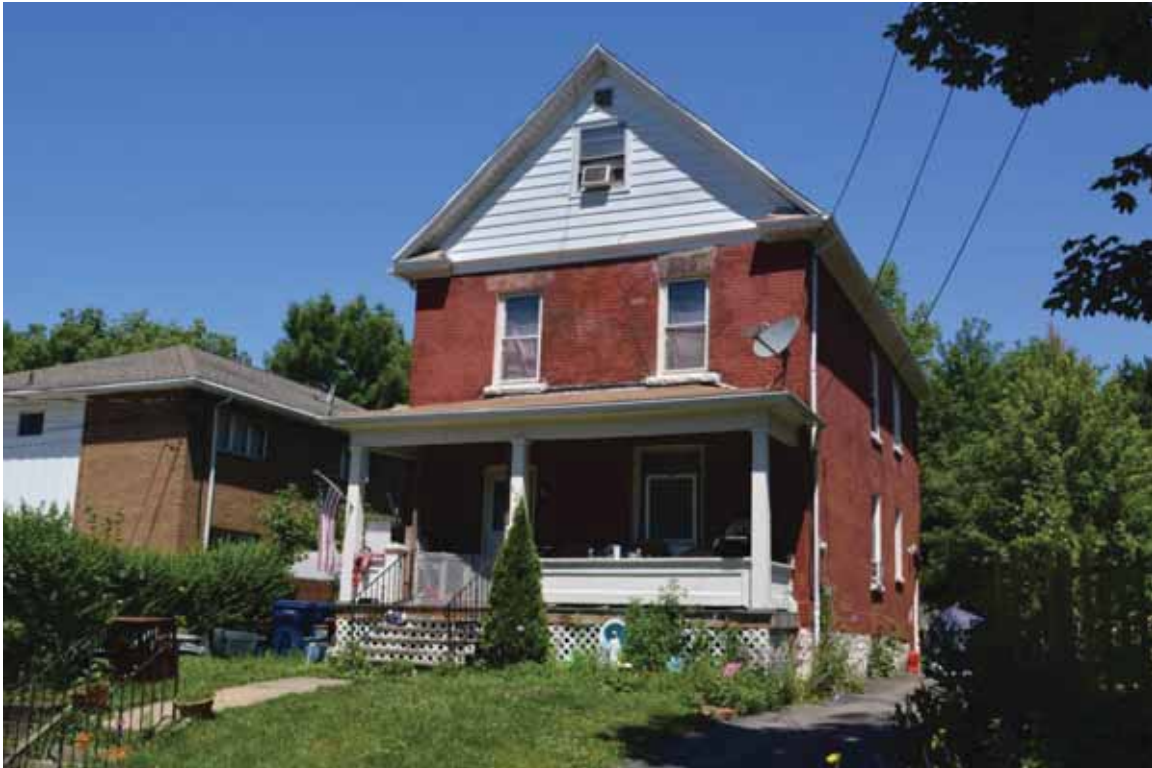
Photograph 4.64. 622 Chestnut Avenue, facing north-northwest (Panamerican 2014).