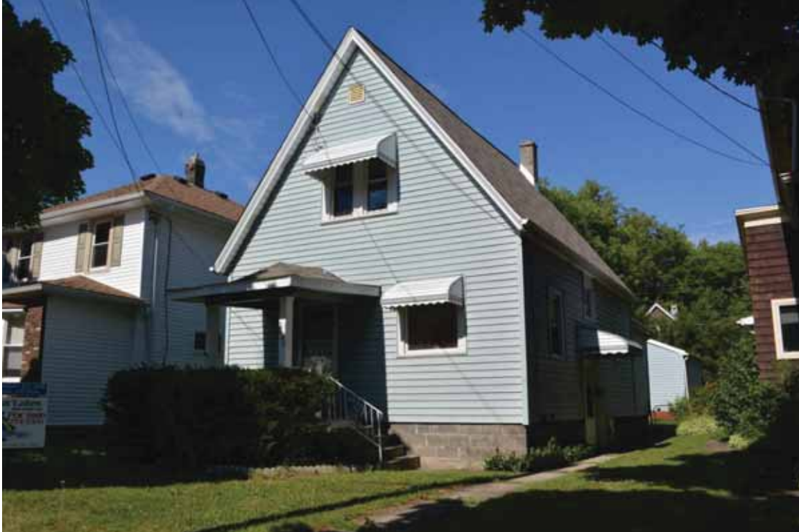
Photograph 4.173. 2683 Whirlpool Street, facing northeast (Panamerican 2014).