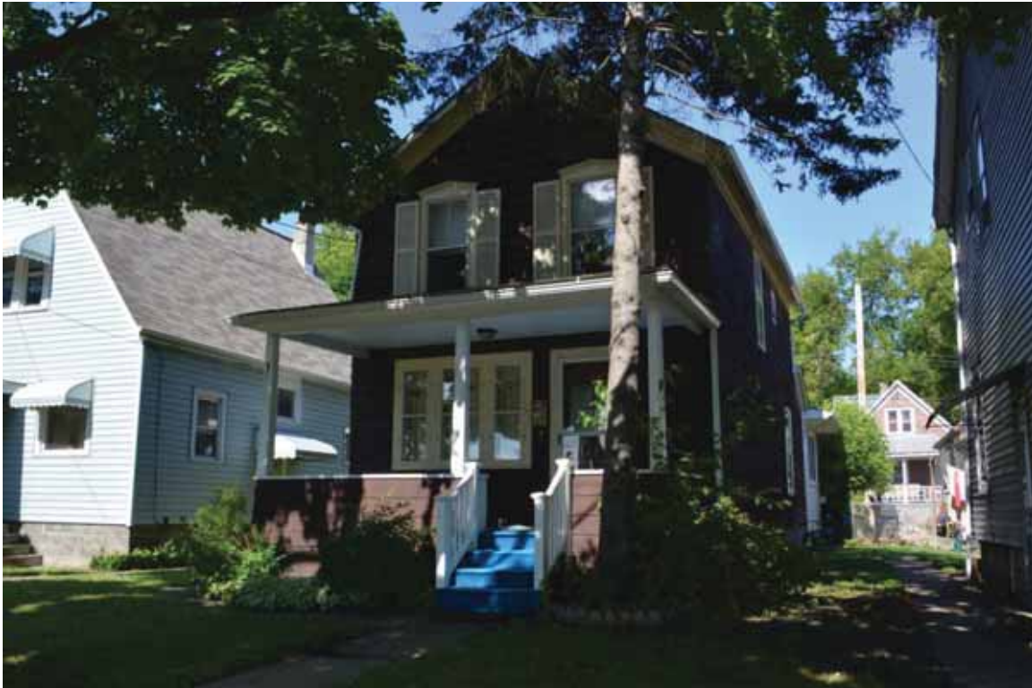
Photograph 4.172. 2681 Whirlpool Street, facing east (Panamerican 2014).