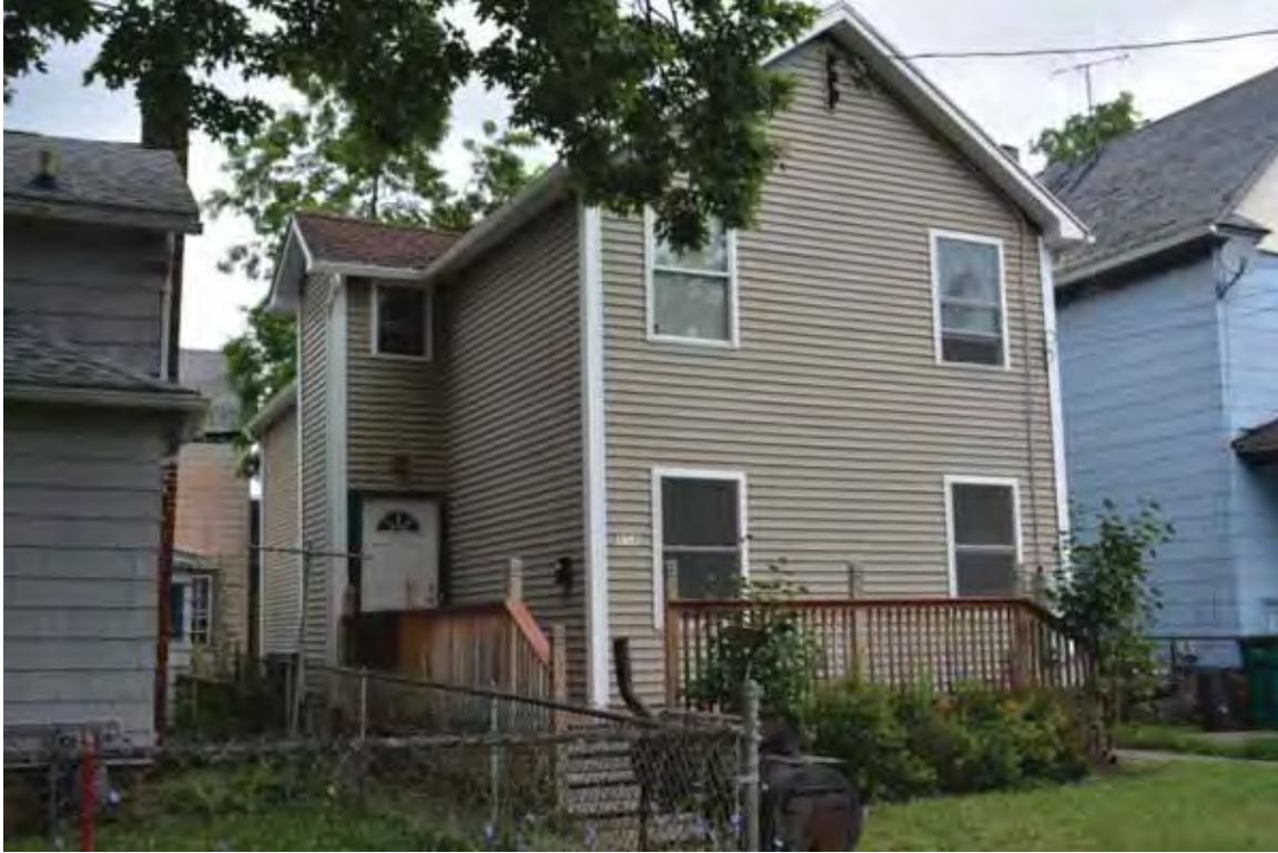
Photograph 4.191. 808 Willow Street, facing northeast.