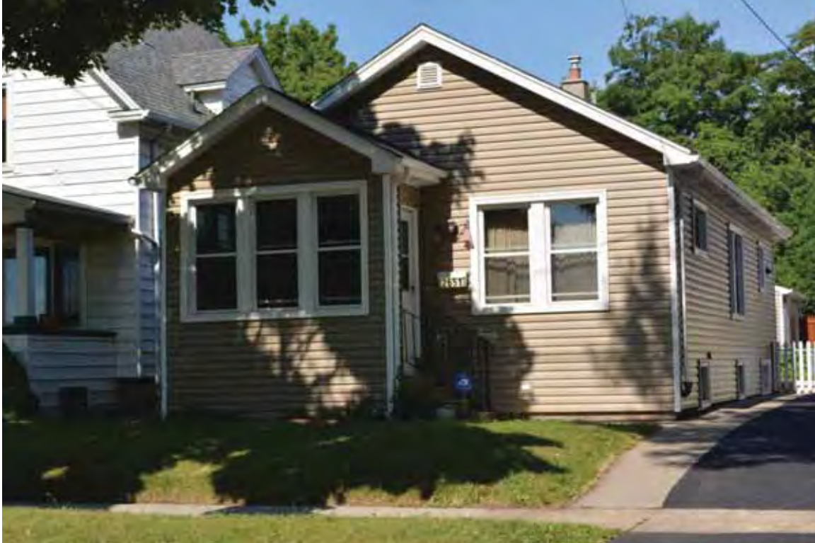
Photograph 4.163. 2651 Whirlpool Street, facing east.