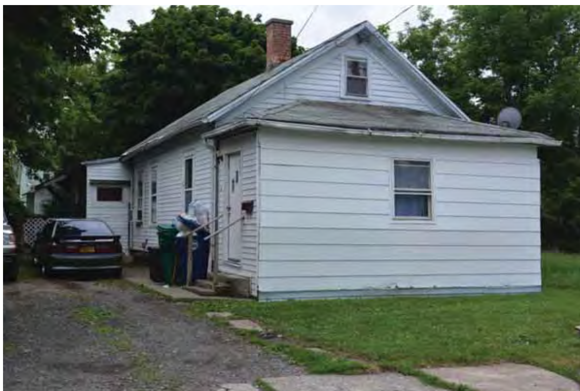
Photograph 4.194. 815 Willow Street, facing southwest (Panamerican 2014).