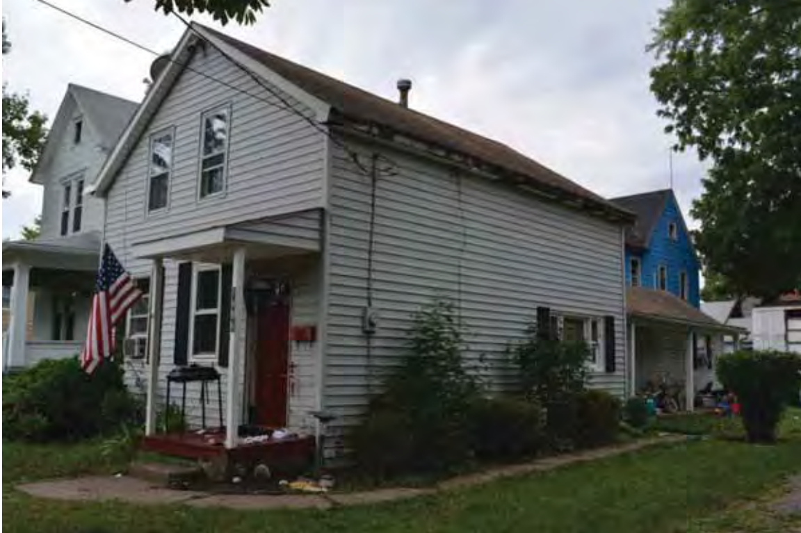
Photograph 4.77. 1408 Eighth Street, facing southwest.