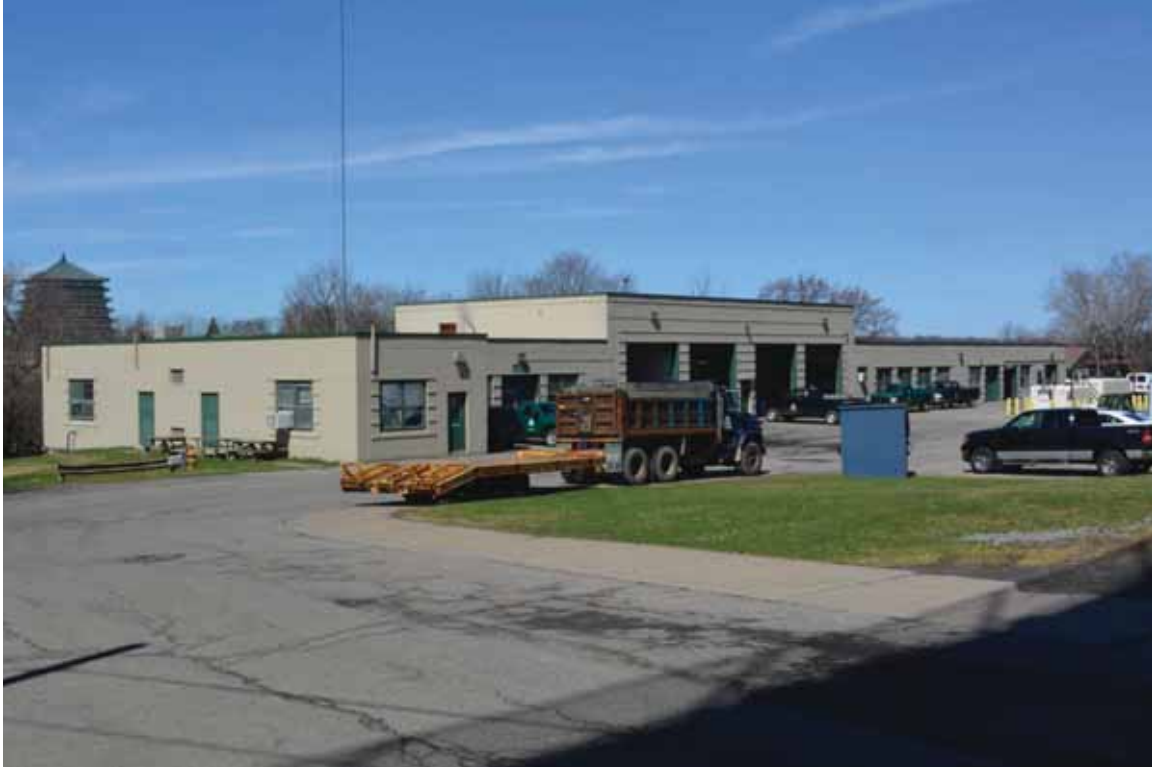
Photograph 4.159. NYS OPRHP Whirlpool Region at 2630 Whirlpool Street, facing northwest (Panamerican 2014).