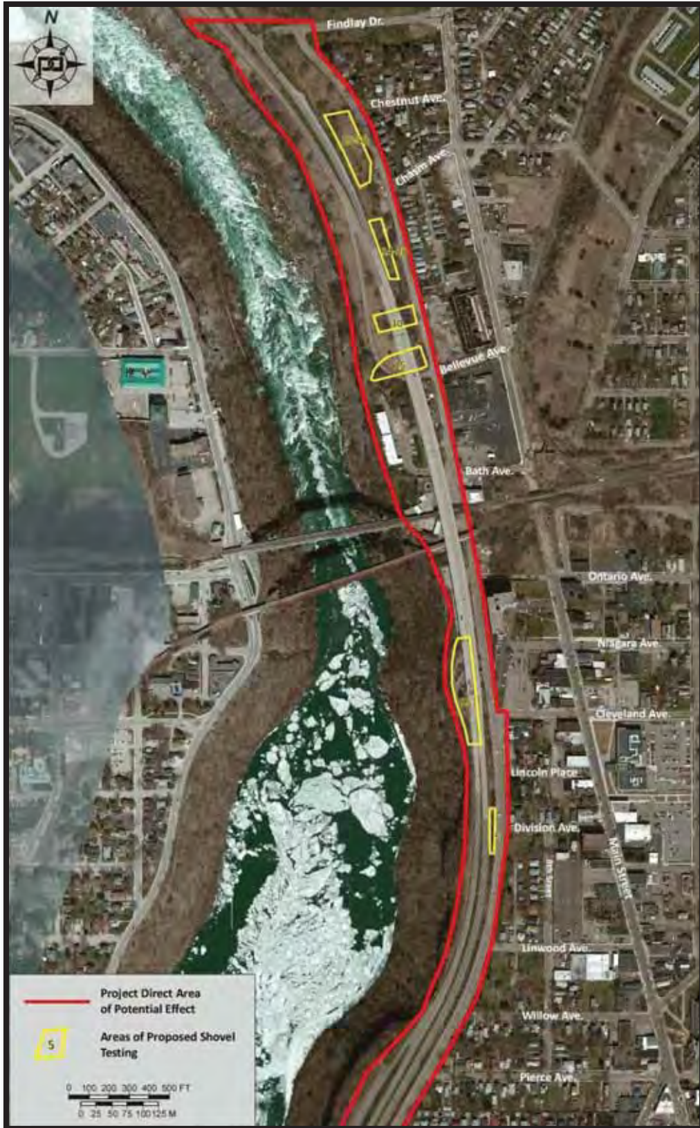
Figure 5.3. Areas of proposed shovel testing in the northern portion of the APE (aerial: Google 2014).