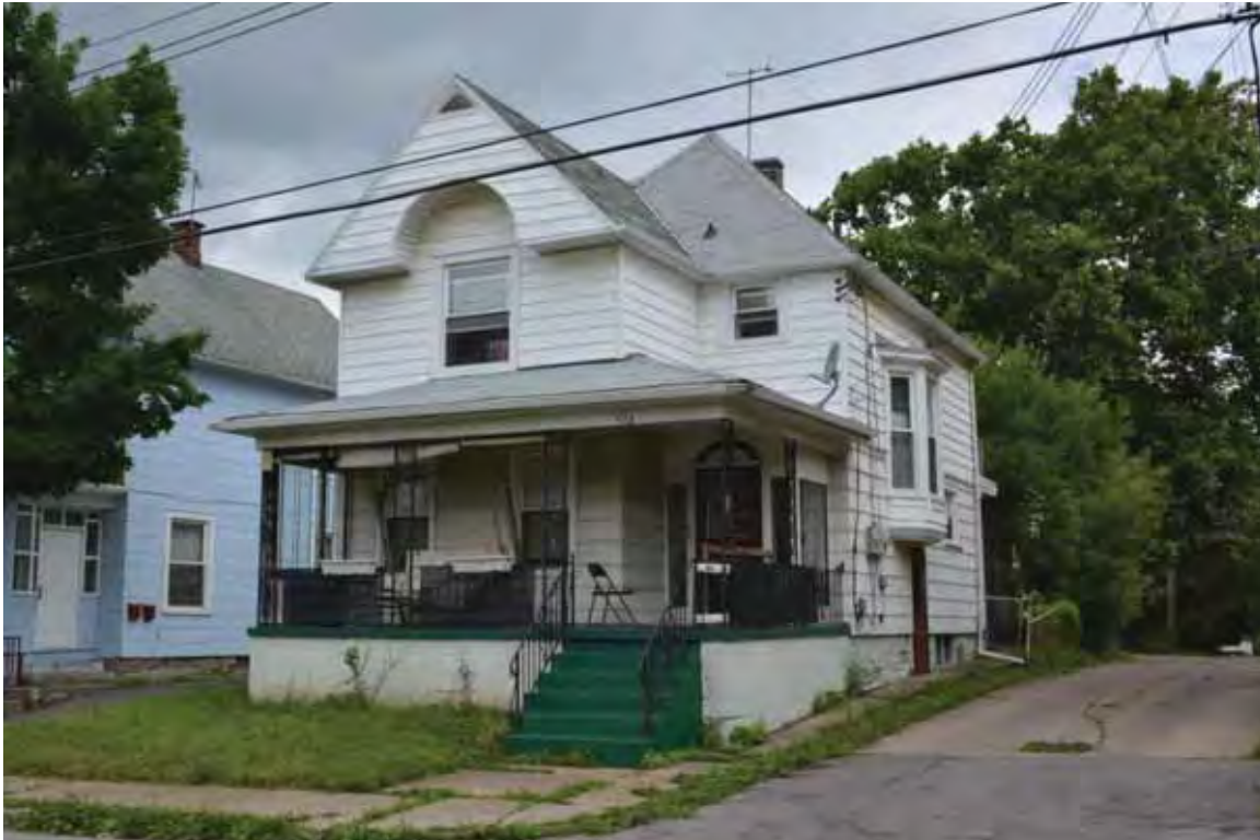
Photograph 4.106. 716 Linwood Avenue, facing northwest (Panamerican 2014).