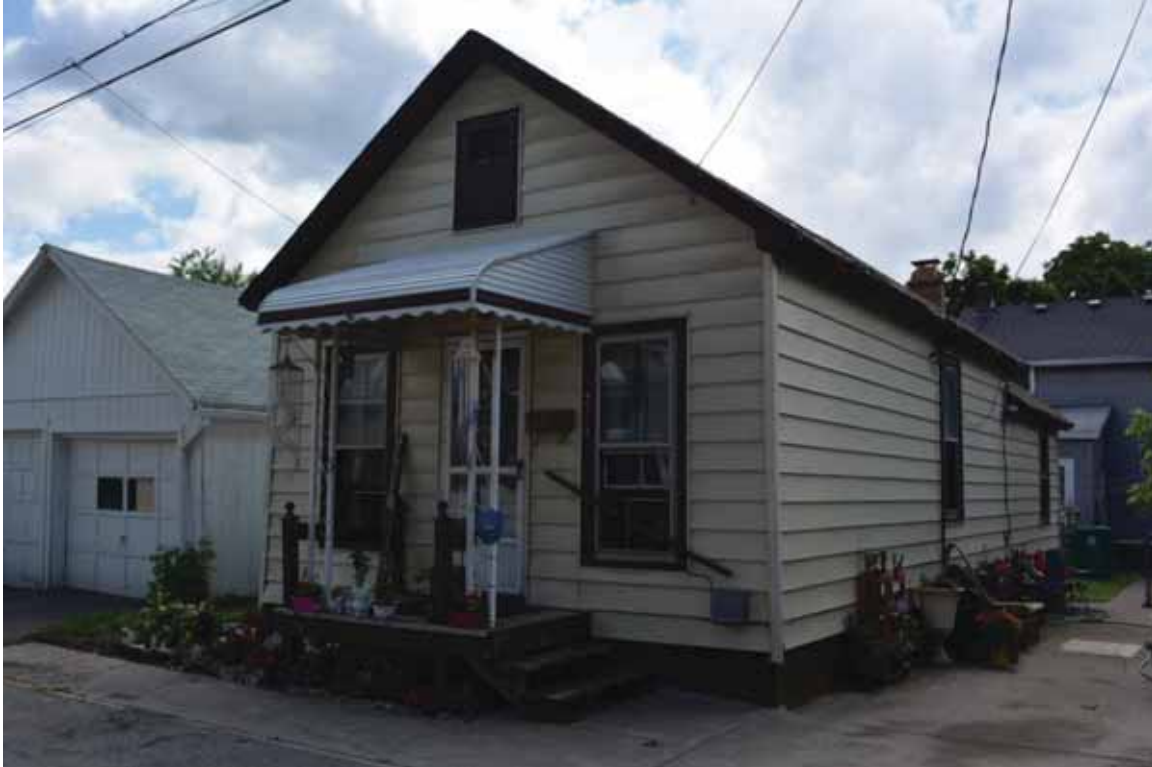
Photograph 4.149. 2672 Spring Street, facing southwest (Panamerican 2014).