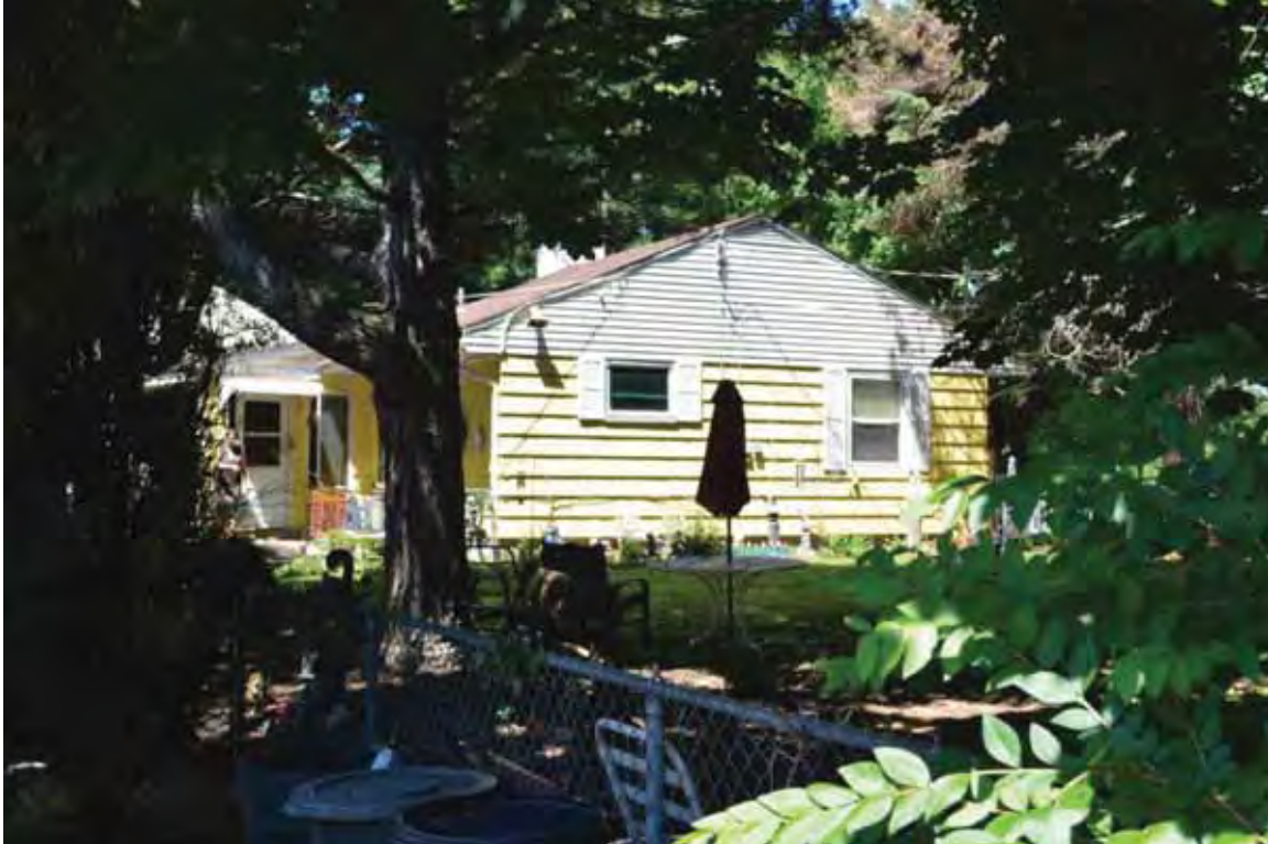
Photograph 4.65. 622½ Chestnut Avenue, facing west ( Panamerican 2014 ).