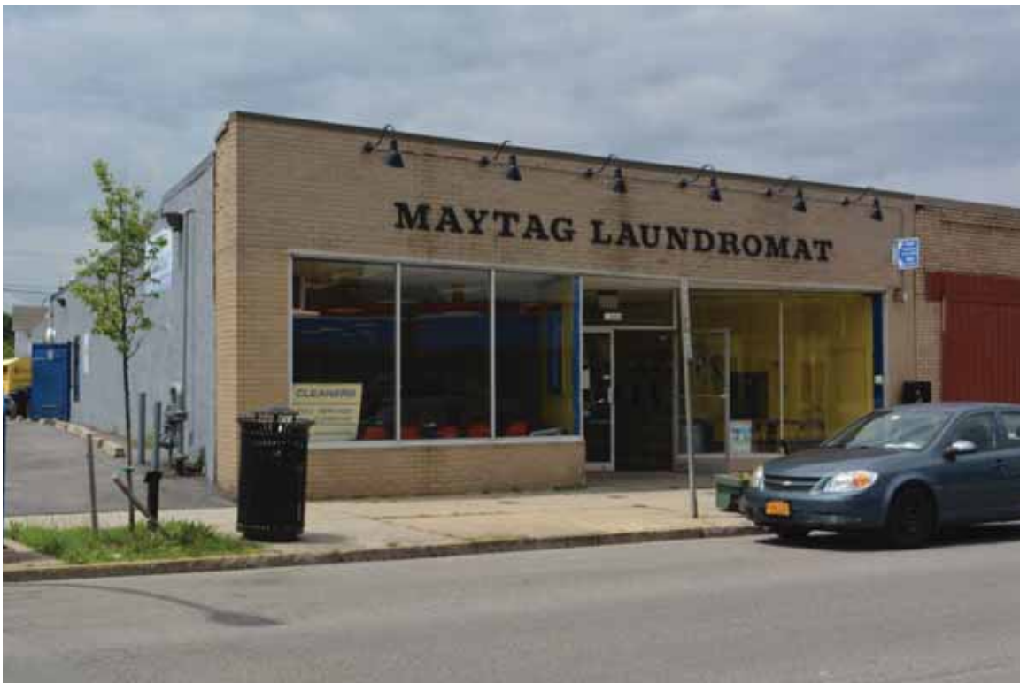
Photograph 4.124. 1606 Main Street, facing west-northwest.