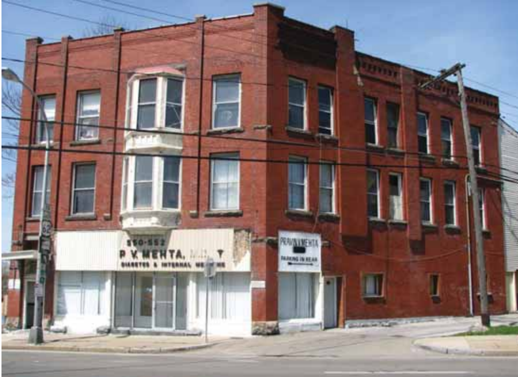
Photograph 4.32. Cannon Block at 550 Main Street, facing northwest (Panamerican 2014).