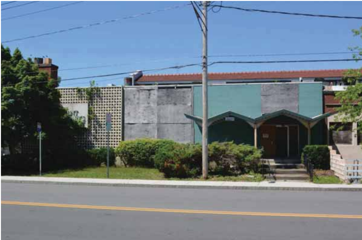
Photograph 4.158. Southeast entrance on Main Street, 2600 Whirlpool Street, facing southeast ( Panamerican 2014 ).