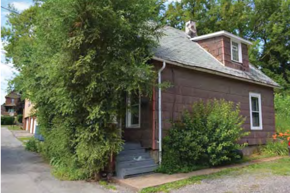
Photograph 4.151. 2679 Spring Street, facing northeast.