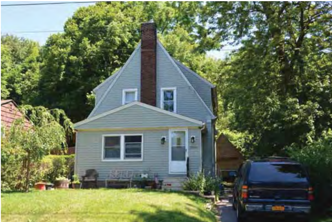
Photograph 4.180. 2909 Whirlpool Street, facing east.