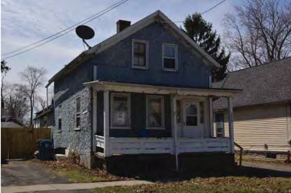
Photograph 4.143. 733 Pierce Avenue, facing southwest.