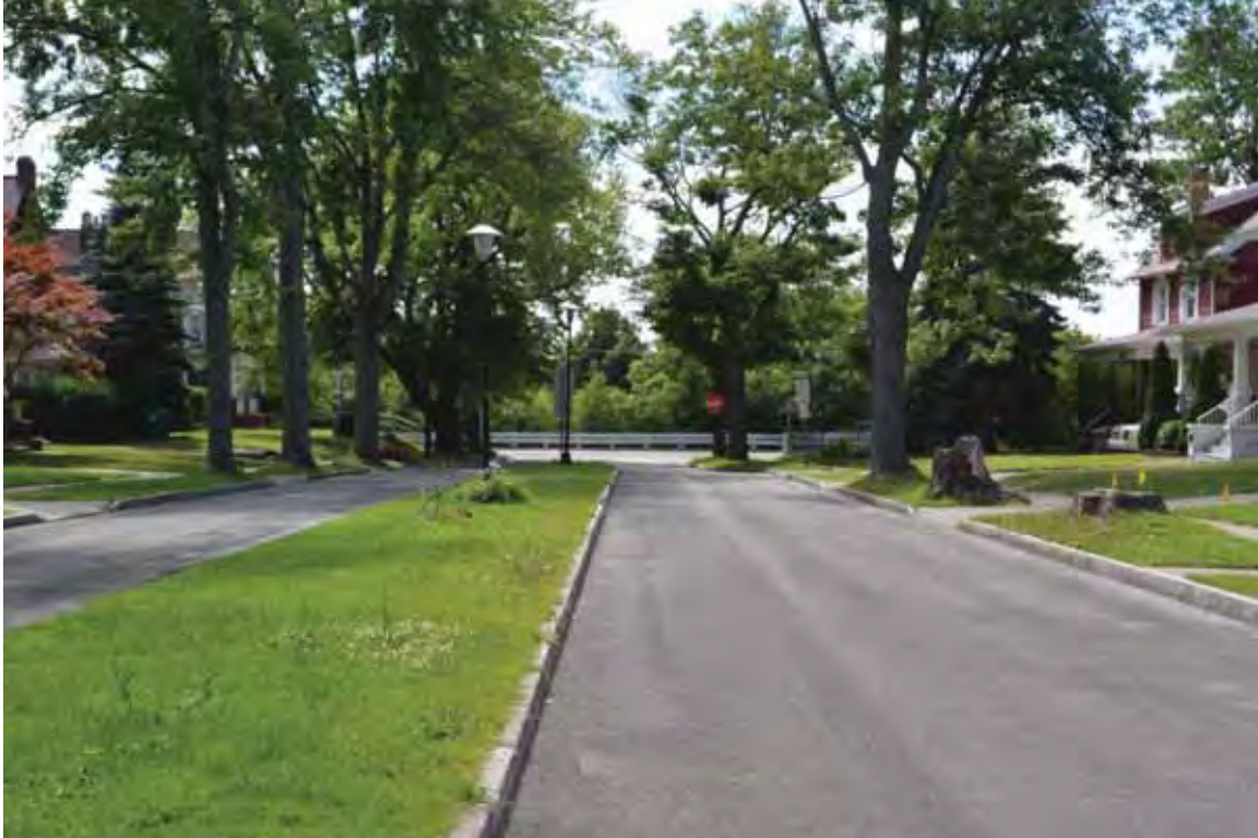
Photograph 4.12. Chilton Avenue-Orchard Parkway Historic District from 638 Orchard Parkway, facing west toward Whirlpool Street ( Panamerican 2014 ).