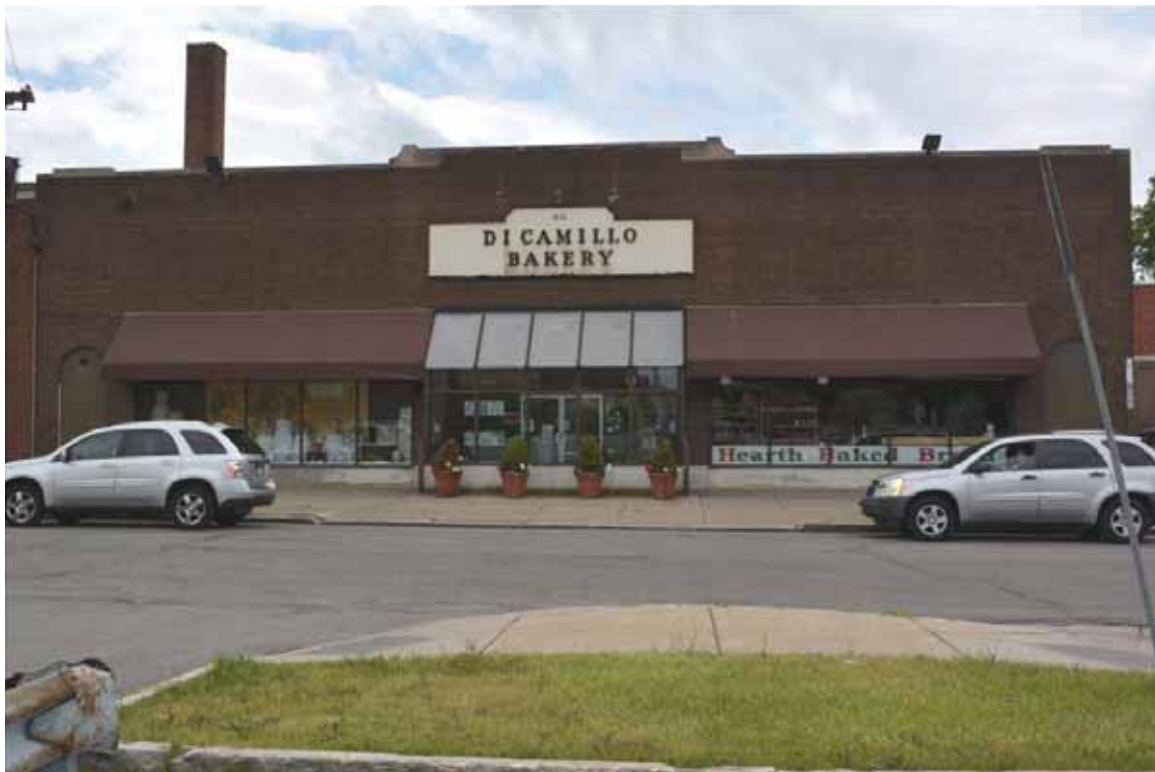
Photograph 4.110. 801 Linwood Avenue, facing south (Panamerican 2014).