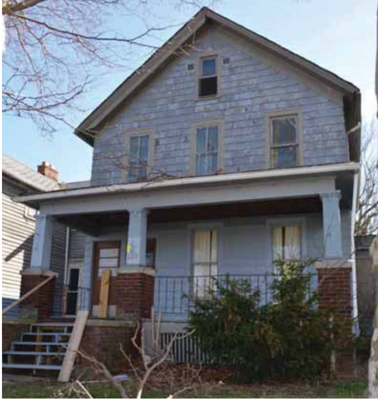
Photograph 4.49. Residence at 609 Third Street, facing northeast ( Panamerican 2015 ).