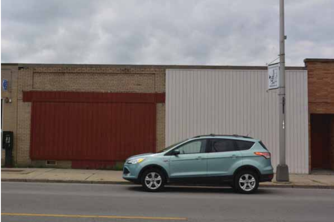
Photograph 4.125. 1610 Main Street, facing west.