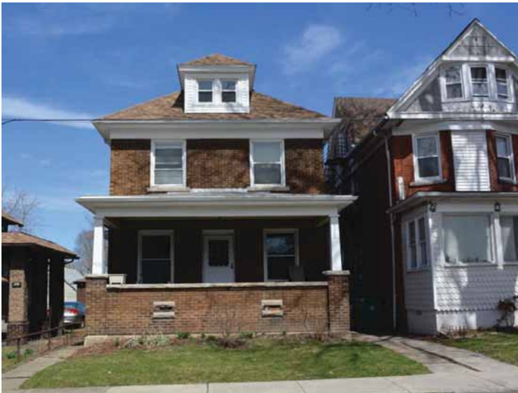
Photograph 4.42. Residence at 372 Spruce Avenue, facing north (Panamerican 2015).