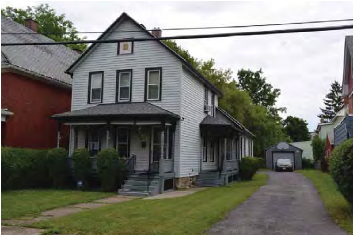
Photograph 4.78. 1409 Eighth Street, facing east (Panamerican 2014).