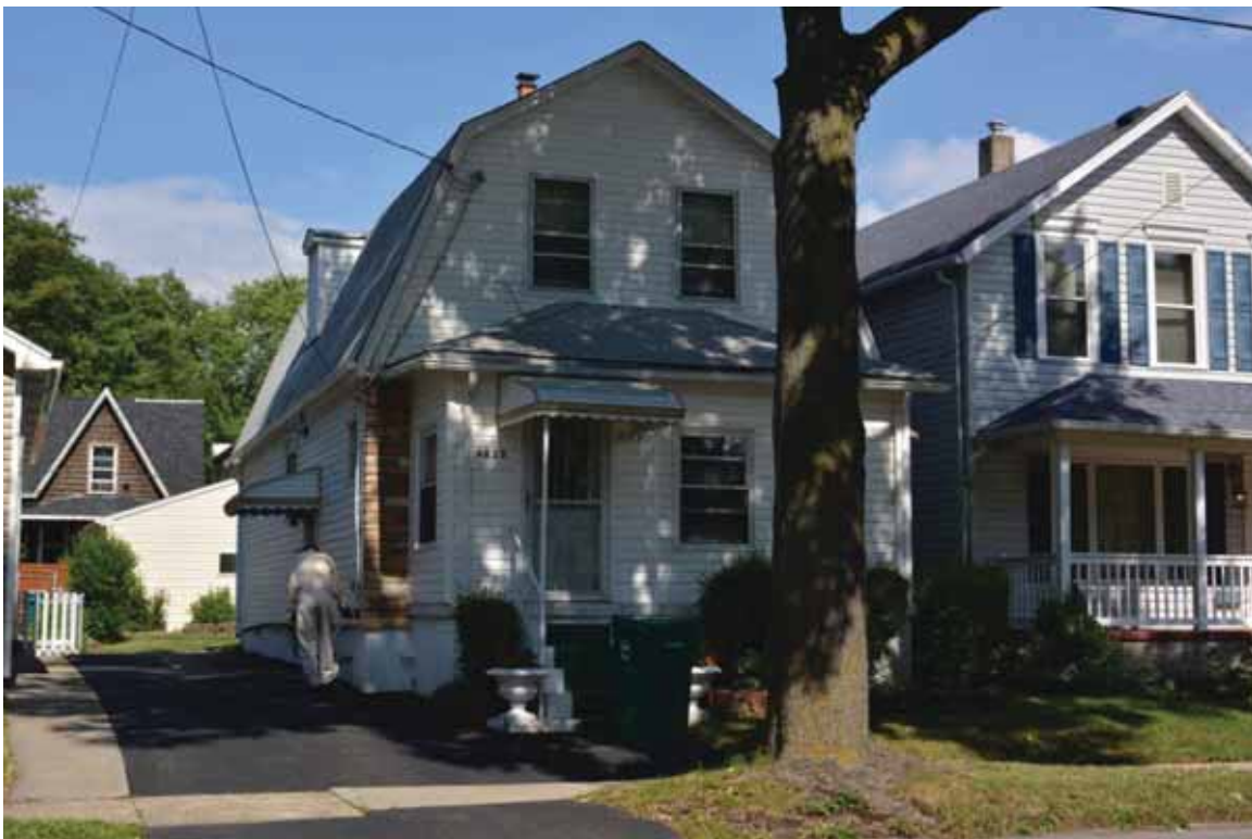
Photograph 4.162. 2649 Whirlpool Street, facing east (Panamerican 2014).