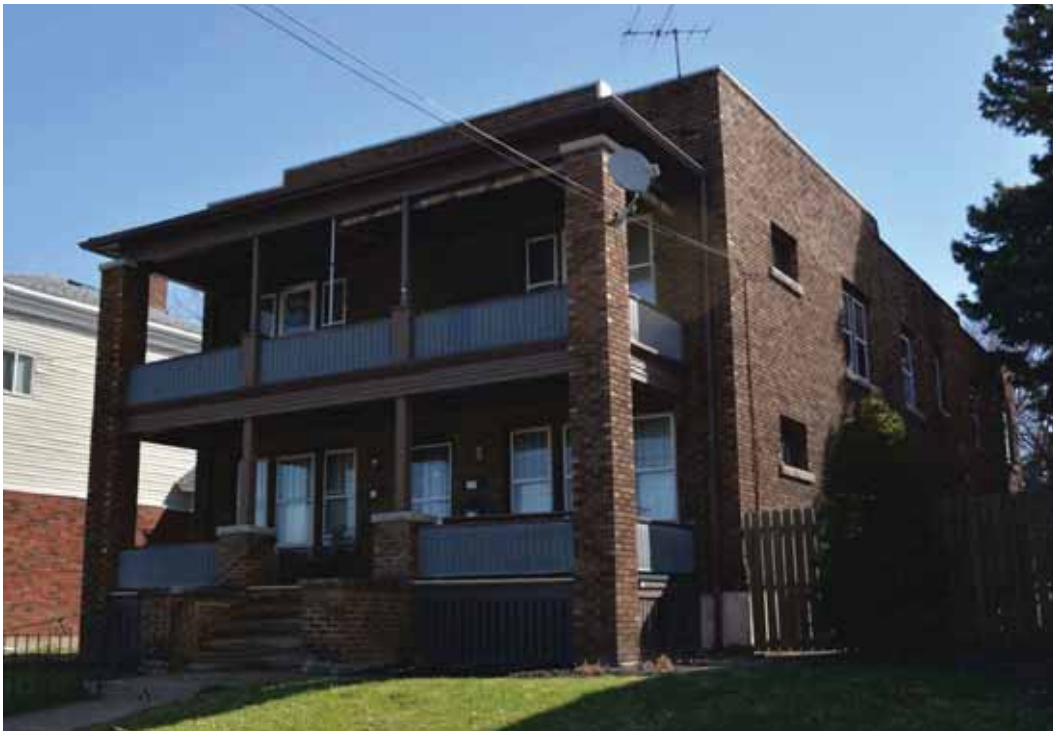
Photograph 4.48. Residence at 603 Third Street, facing northeast (Panamerican 2015).