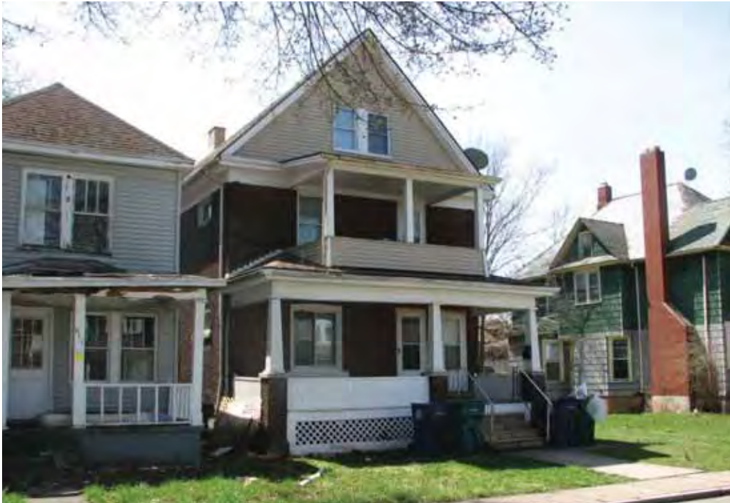
Photograph 4.23. Residence at 611 (609) Elmwood Avenue, facing southwest. Note, listed in CRIS as 619 Elmwood ( Panamerican 2015 ).