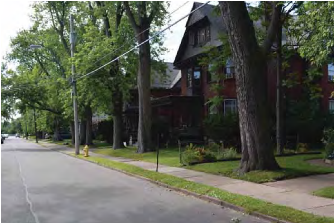
Photograph 4.15. Chilton Avenue-Orchard Parkway Historic from opposite 699 Chilton Avenue, facing west-northwest (Panamerican 2014).