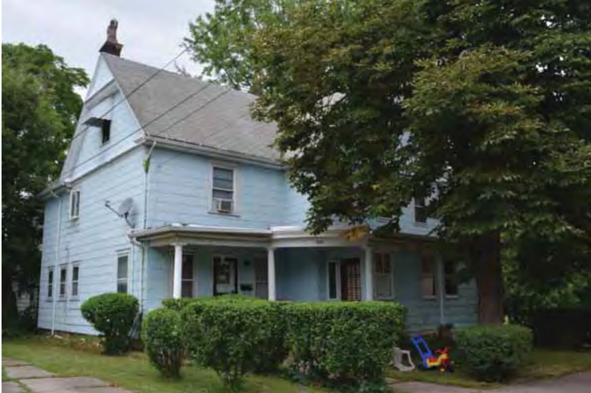
Photograph 4.81. 1422 Eighth Street, facing northwest (Panamerican 2014).