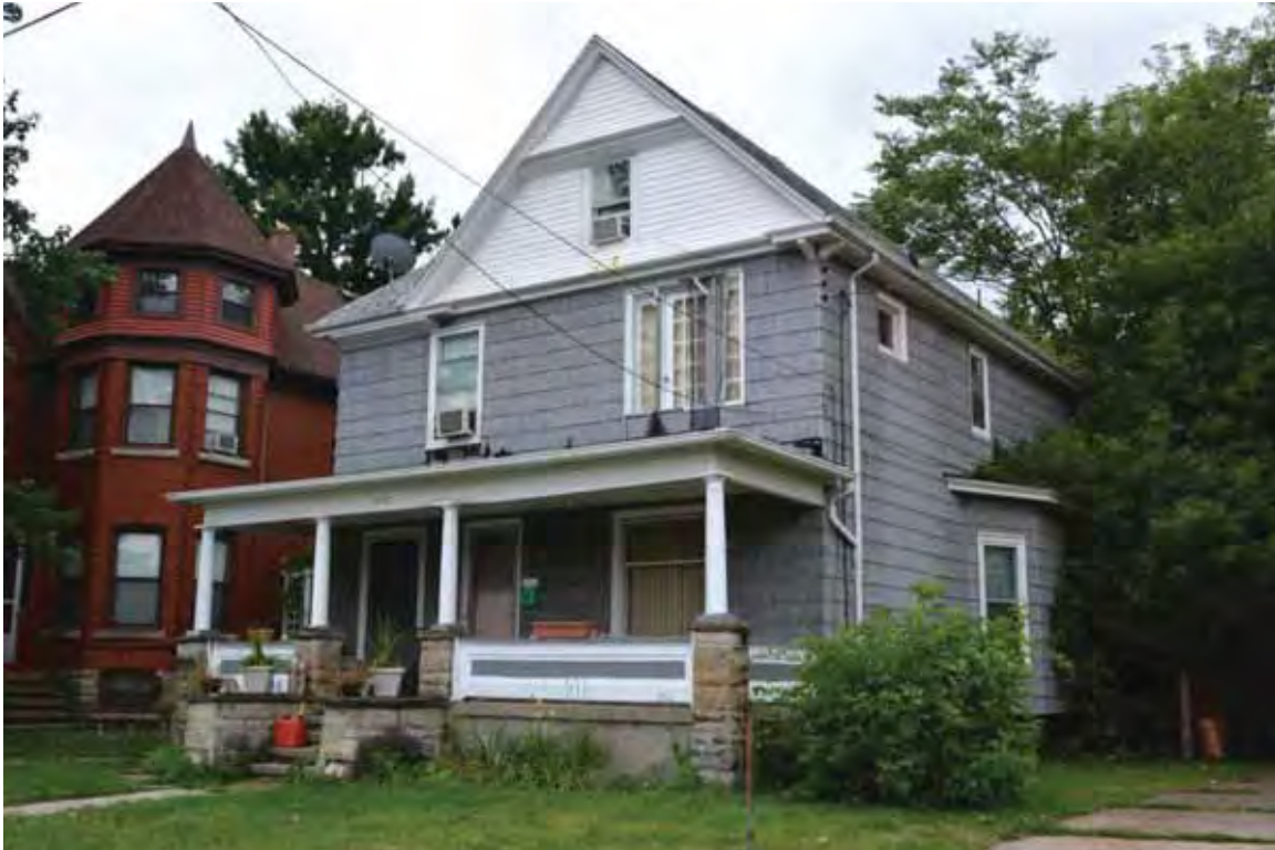
Photograph 4.88. 1622 Eighth Street, facing southwest (Panamerican 2014).