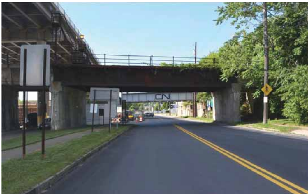
Photograph 4.52. Michigan Central Railway (1925; BIN 7090240) over Whirlpool Street, facing north (Panamerican 2014).