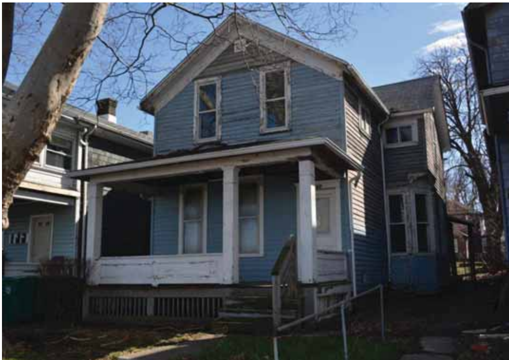
Photograph 4.50. Residence at 611 Third Street, facing northeast ( Panamerican 2015 ).