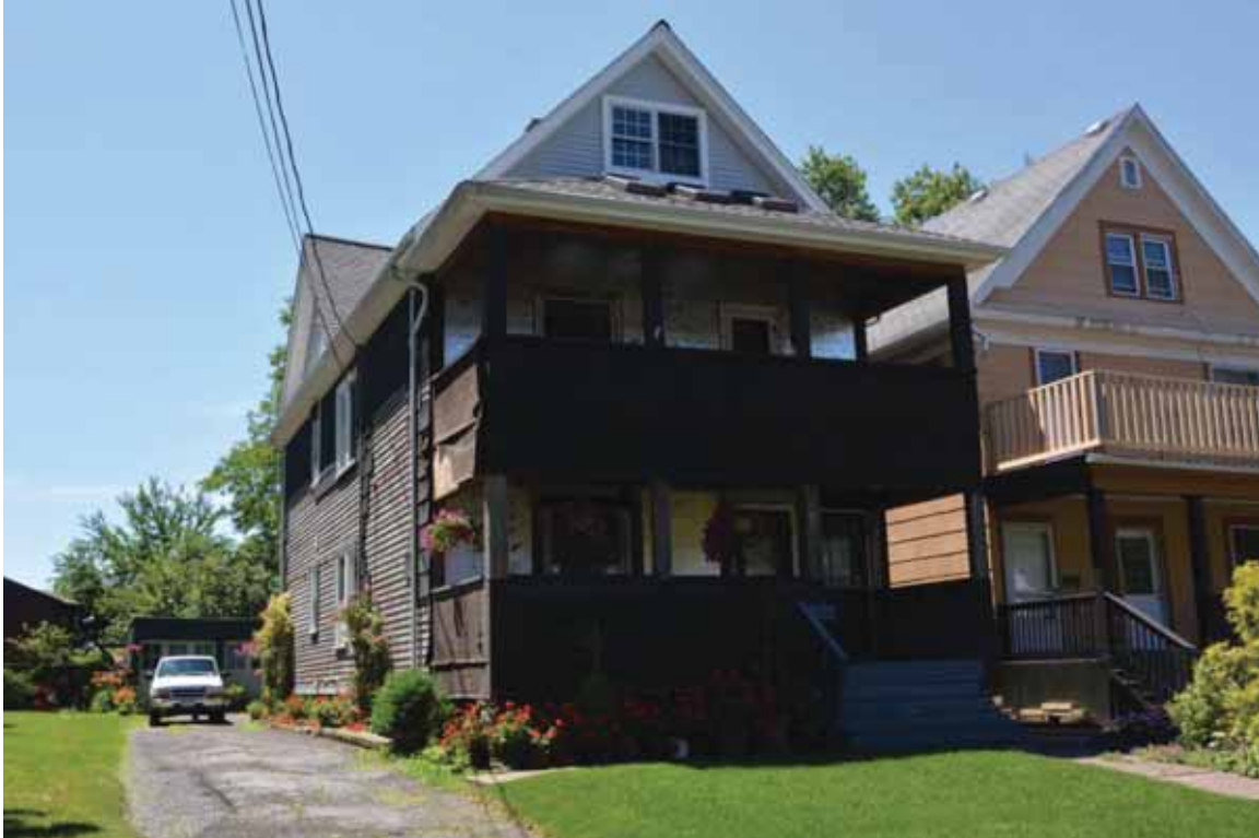
Photograph 4.63. 621 Chestnut Avenue, facing south.