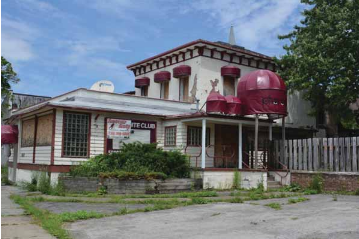
Photograph 4.153. 1919 Whirlpool Street, facing north-northeast ( Panamerican 2014 ).