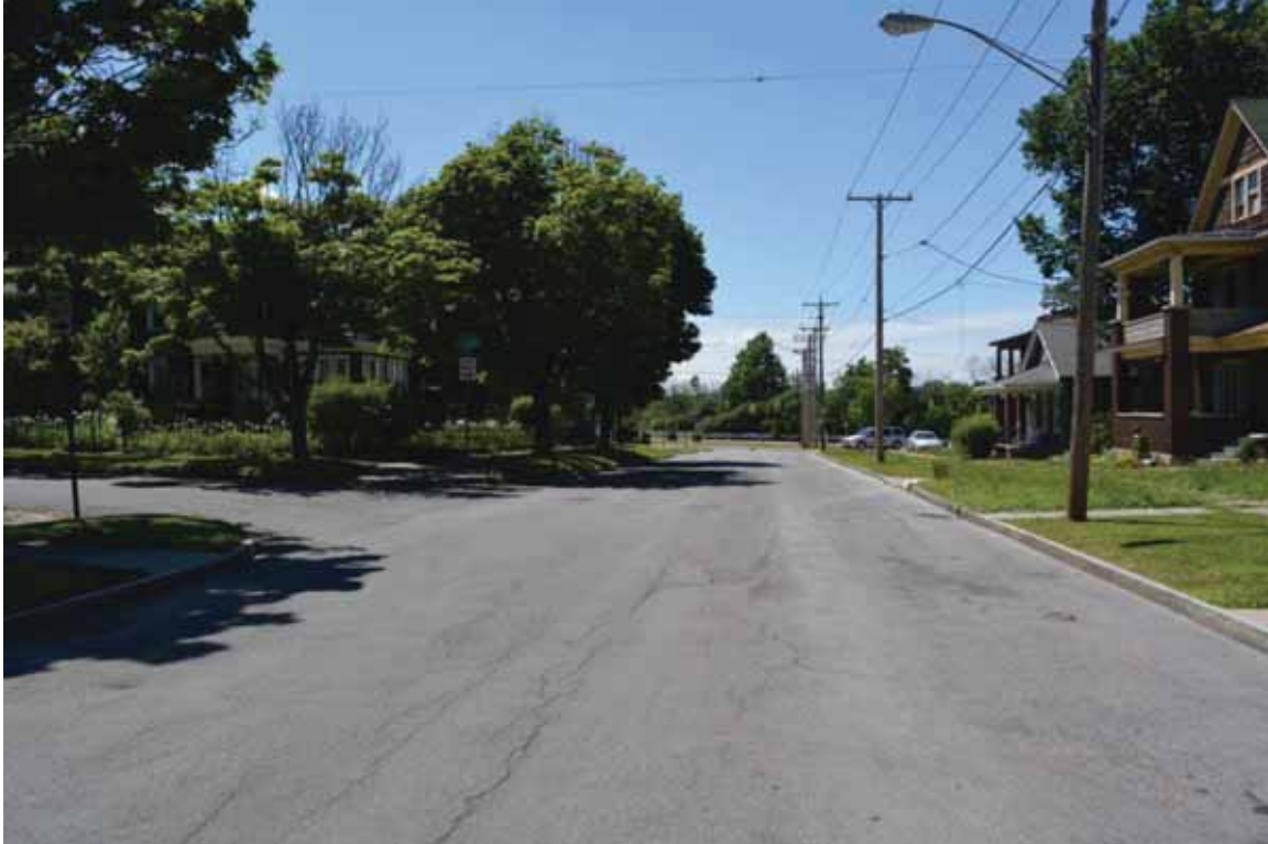
Photograph 4.15e. Cedar Avenue, Park Place Historic District, facing west ( Panamerican 2014 ).