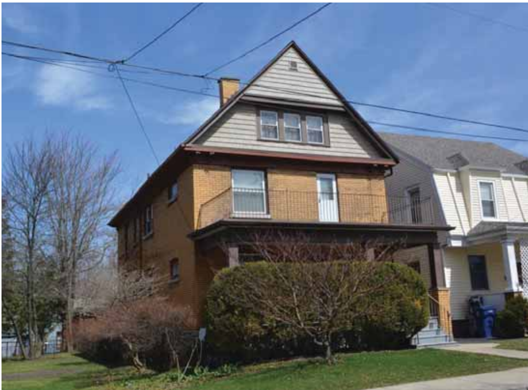
Photograph 4.46. Residence at 598-600 Spruce Avenue, facing northeast (Panamerican 2015).