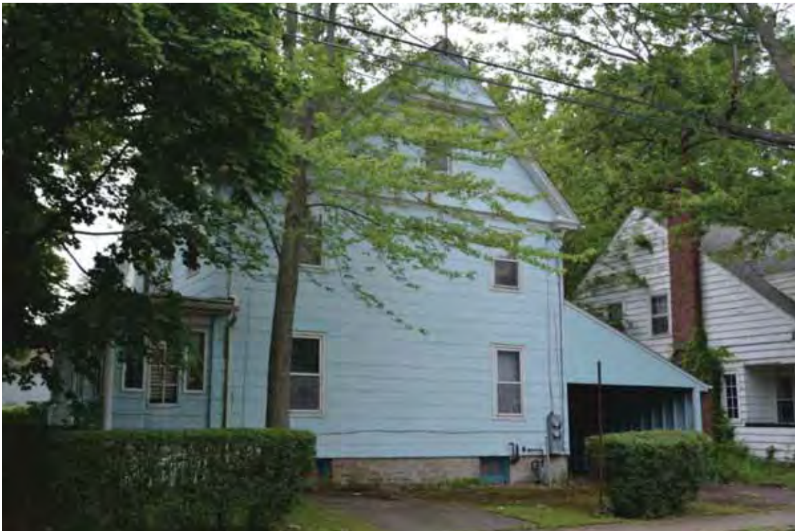
Photograph 4.82. 1422 Eighth Street, facing south (Panamerican 2014).