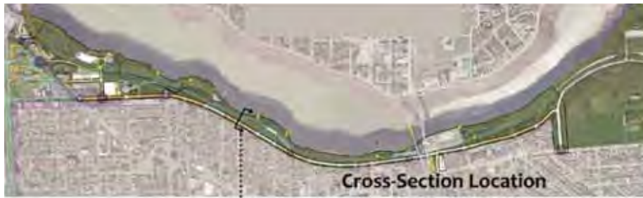
Cross-Section Location FACING NORTHEAST