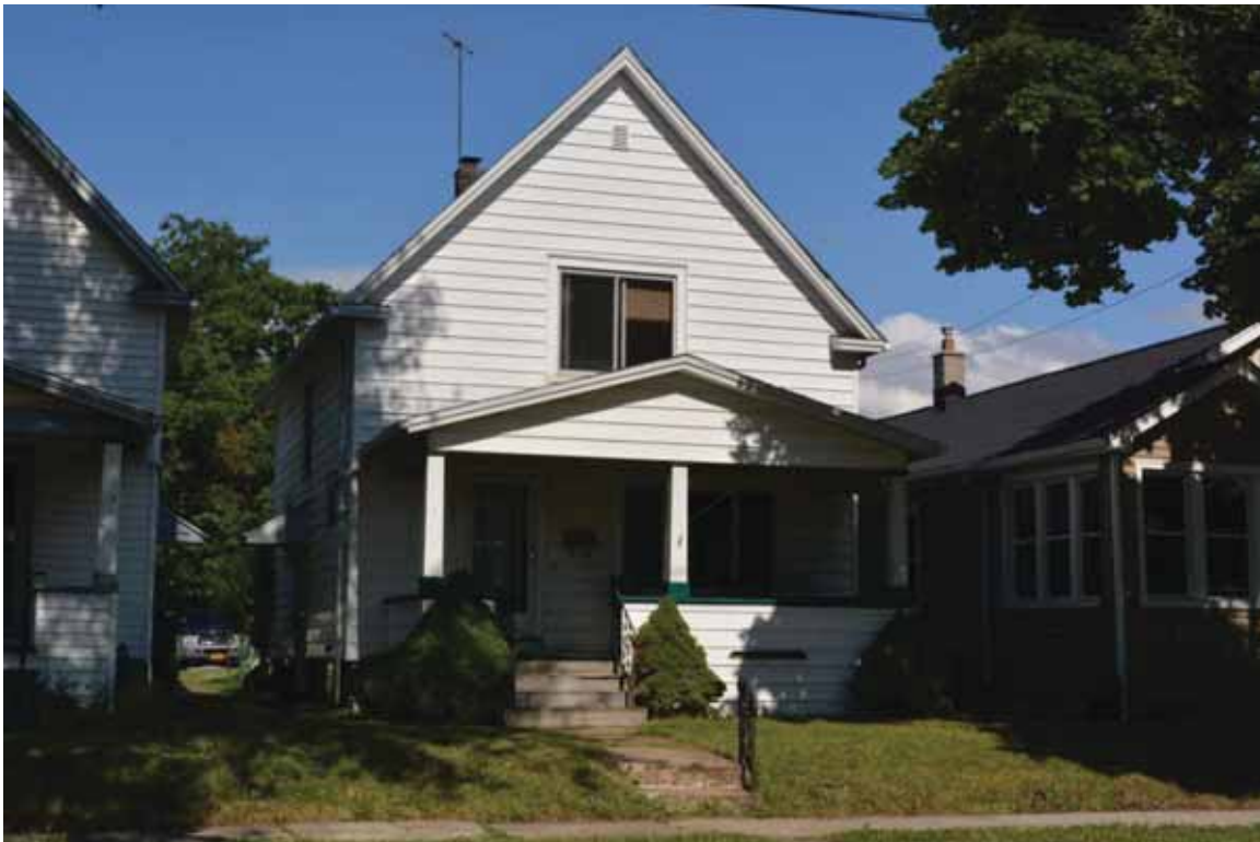
Photograph 4.164. 2655 Whirlpool Street, facing east (Panamerican 2014).