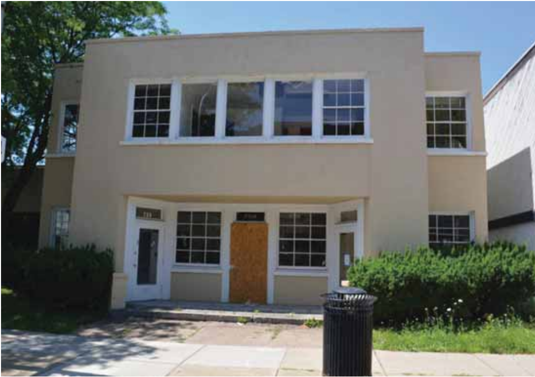
Photograph 4.34. 760 Main Street, facing west.