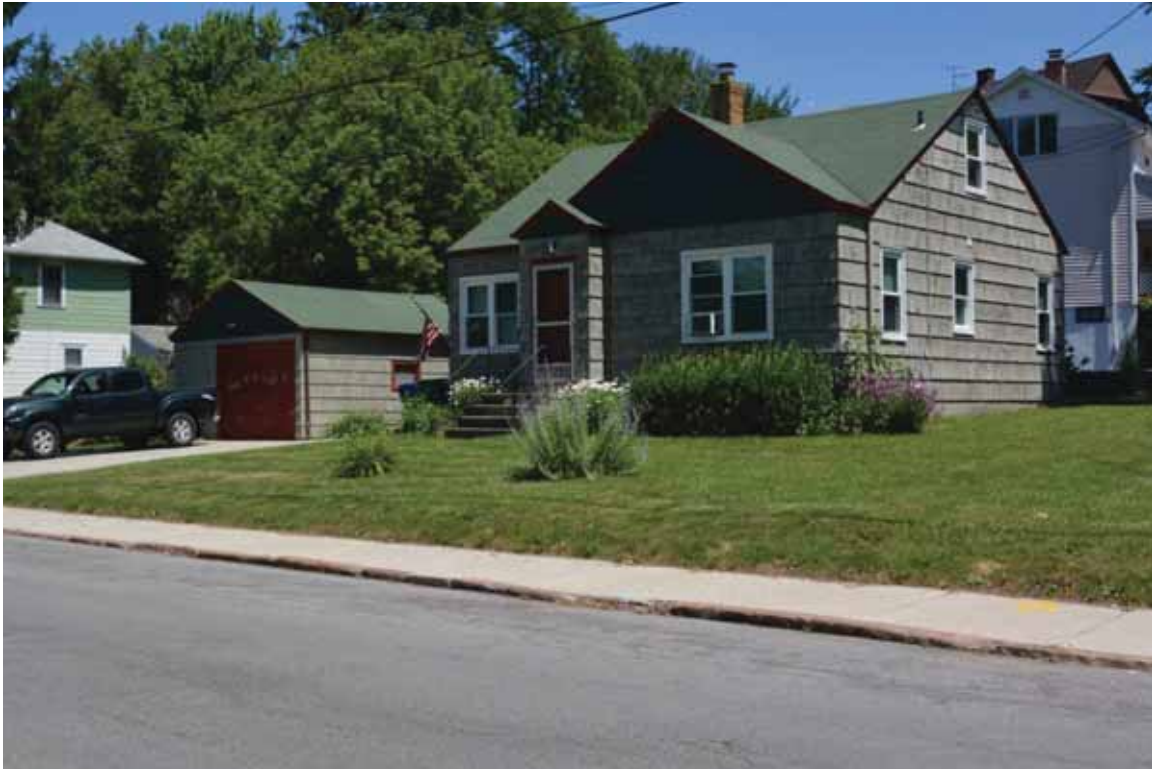
Photograph 4.55. 604 Chasm Avenue, facing northeast.