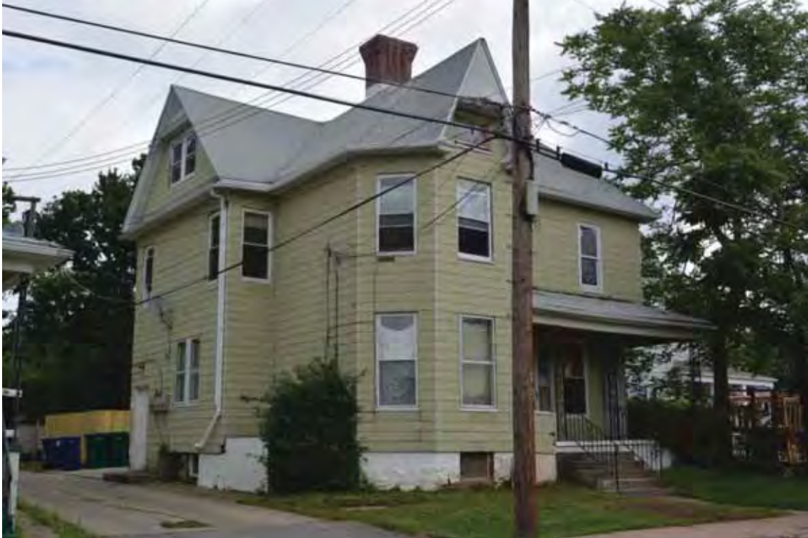
Photograph 4.109. 726 Linwood Avenue, facing northeast (Panamerican 2014).