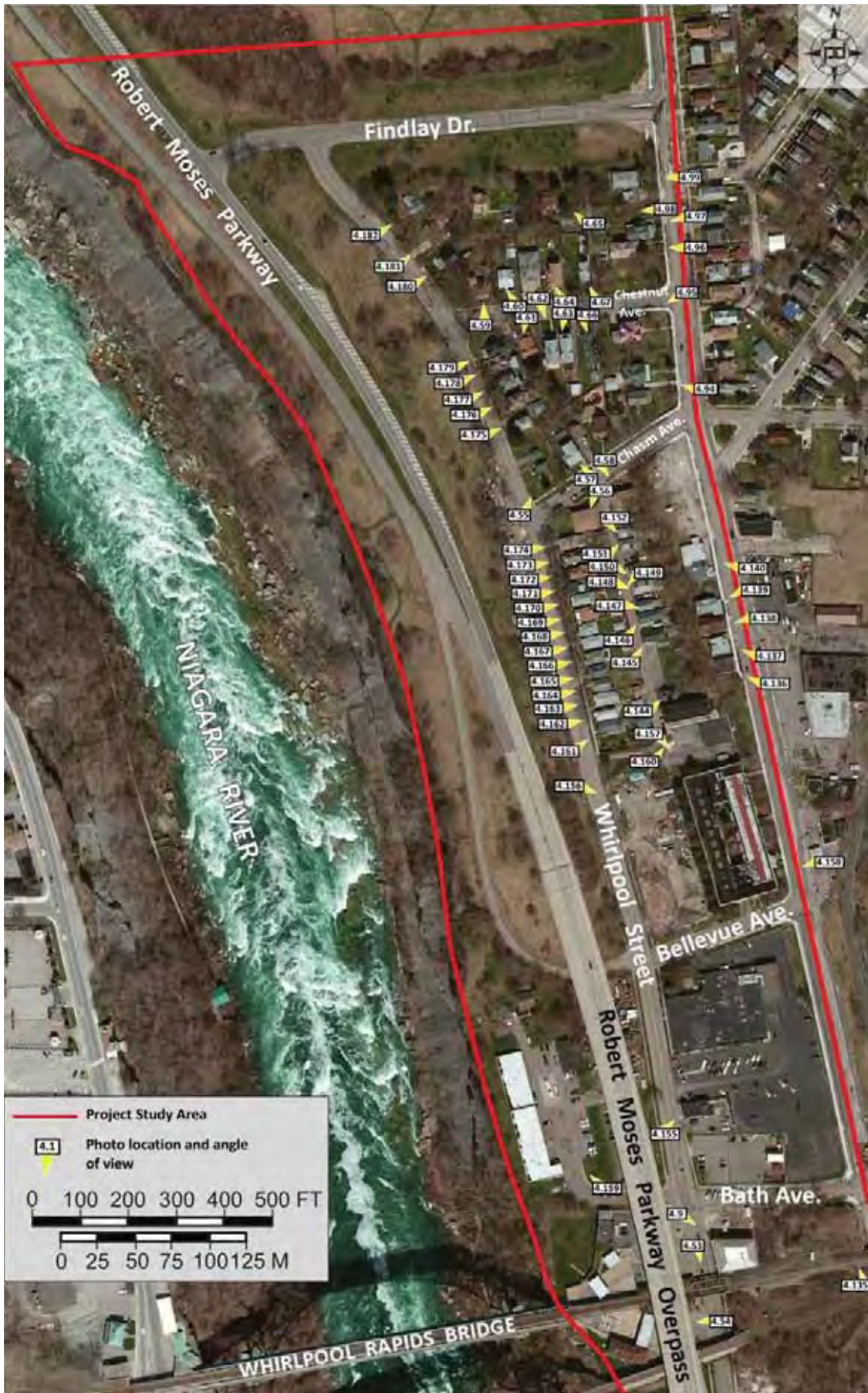
Figure 4.6. Northern portion of RMP North APE.