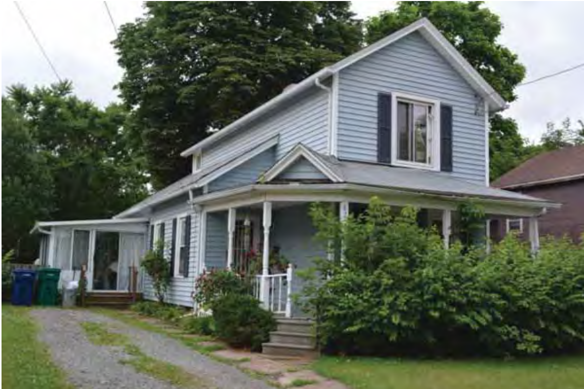
Photograph 4.198. 825 Willow Street, facing southwest (Panamerican 2014).