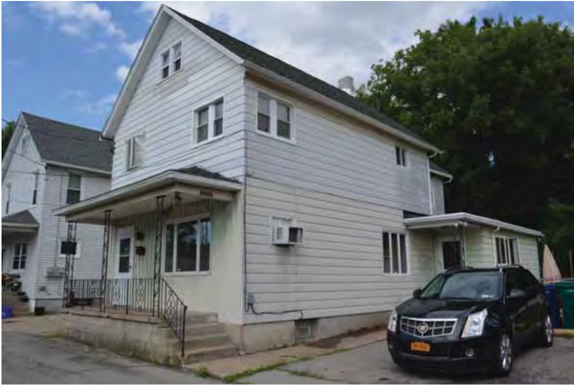
Photograph 4.145. 2657 Spring Street, facing northeast.