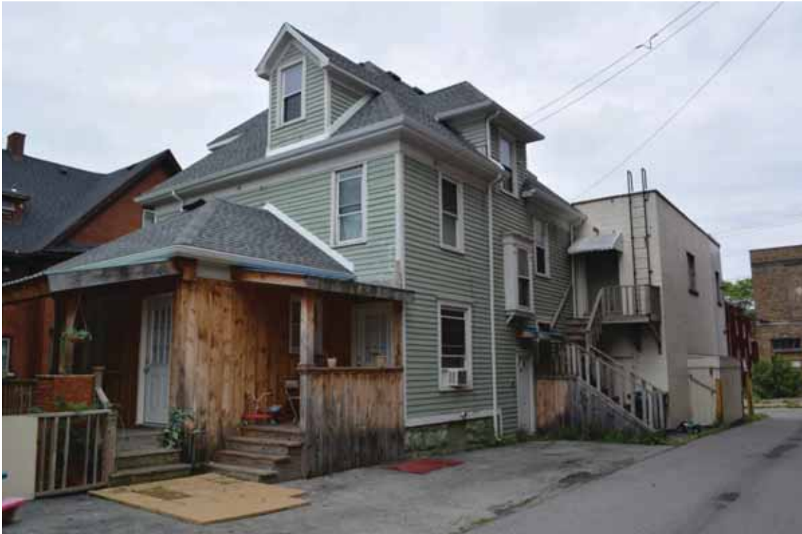
Photograph 4.74. 811 Division Avenue, facing northwest.