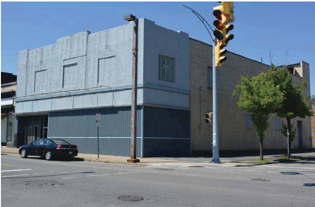
Photograph 4.37. Art Deco commercial building at 1932 Main Street, facing southwest (Panamerican 2014).