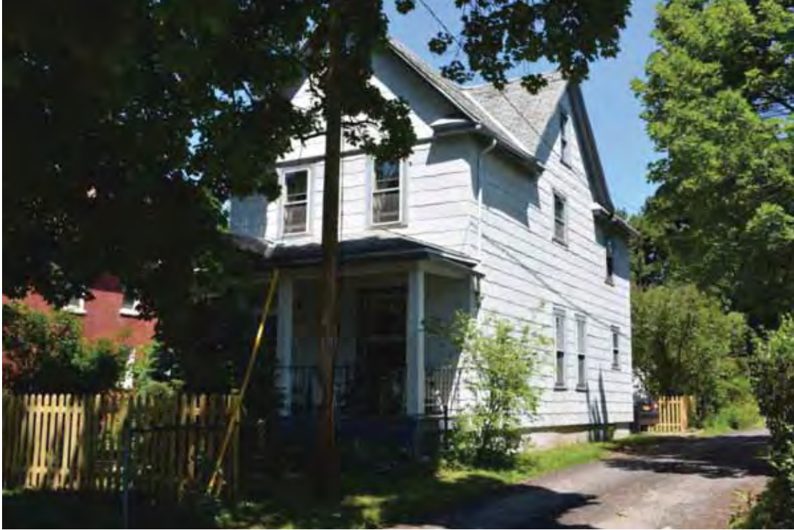
Photograph 4.67. 628 Chestnut Avenue, facing northwest (Panamerican 2014).