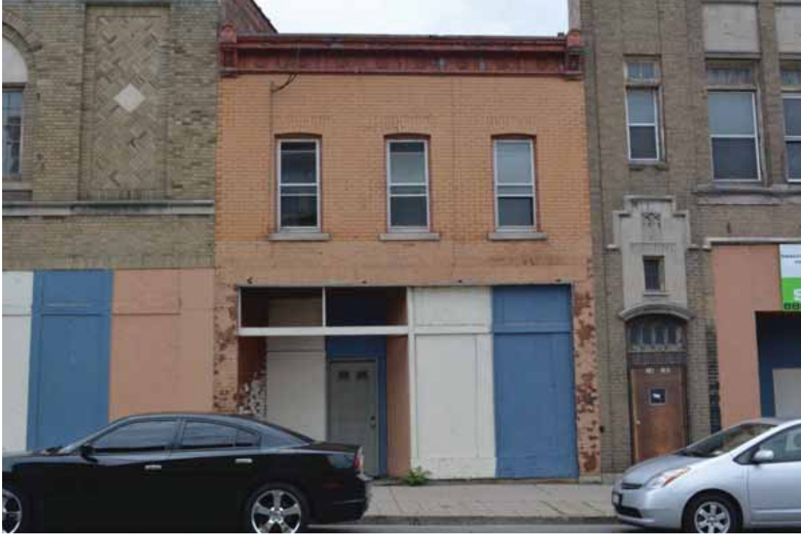
Photograph 4.129. 1808-10 Main Street, facing west (Panamerican 2014).