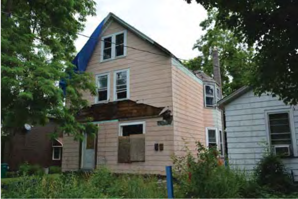
Photograph 4.85. 1509 Eighth Street (vacant), facing northeast.