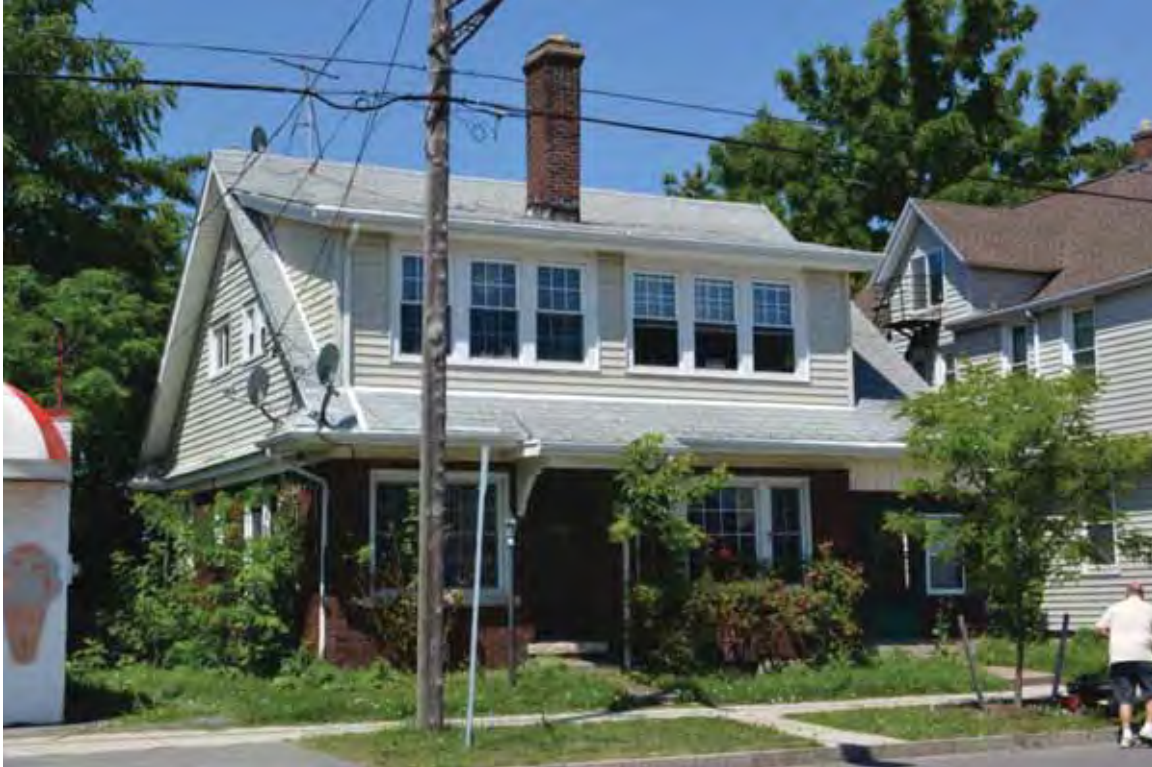
Photograph 4.137. 2650 Main Street, facing west-northwest.