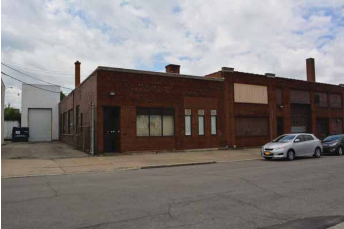
Photograph 4.113. 829 Linwood Avenue, facing south.