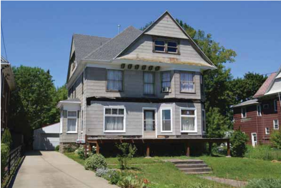
Photograph 4.94. 2808 Lewiston Road, facing west (Panamerican 2014).