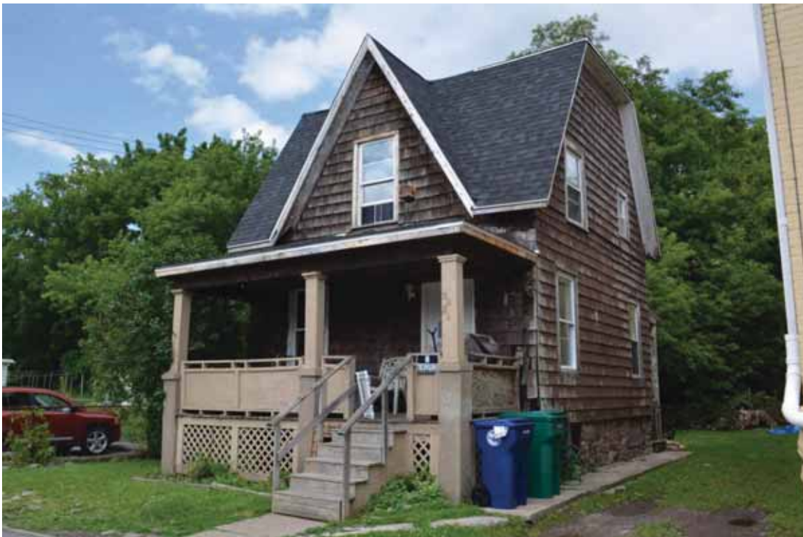
Photograph 4.144. 2655 Spring Street, facing northeast.