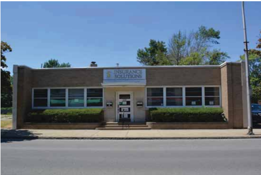
Photograph 4.35. Commercial building (1948) at 1220 Main Street, facing west (Panamerican 2014).