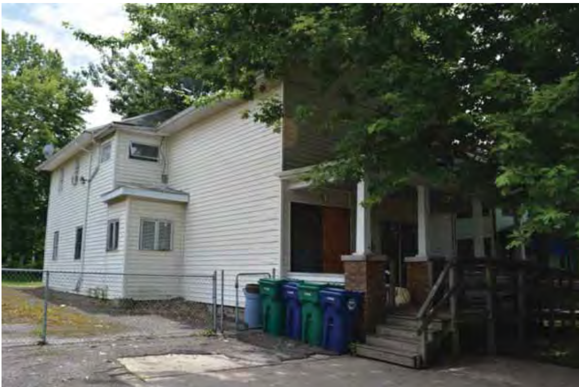
Photograph 4.102. 819 Lincoln Place, facing southwest ( Panamerican 2014 ).