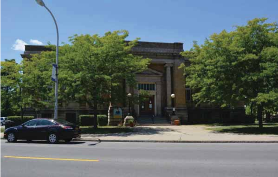
Photograph 4.8. Niagara Falls Public Library at 1022 Main Street, facing west (Panamerican 2014).