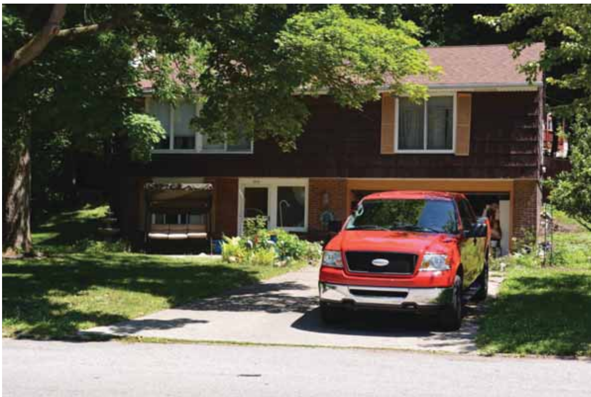
Photograph 4.181. 2915 Whirlpool Street, facing east (Panamerican 2014).