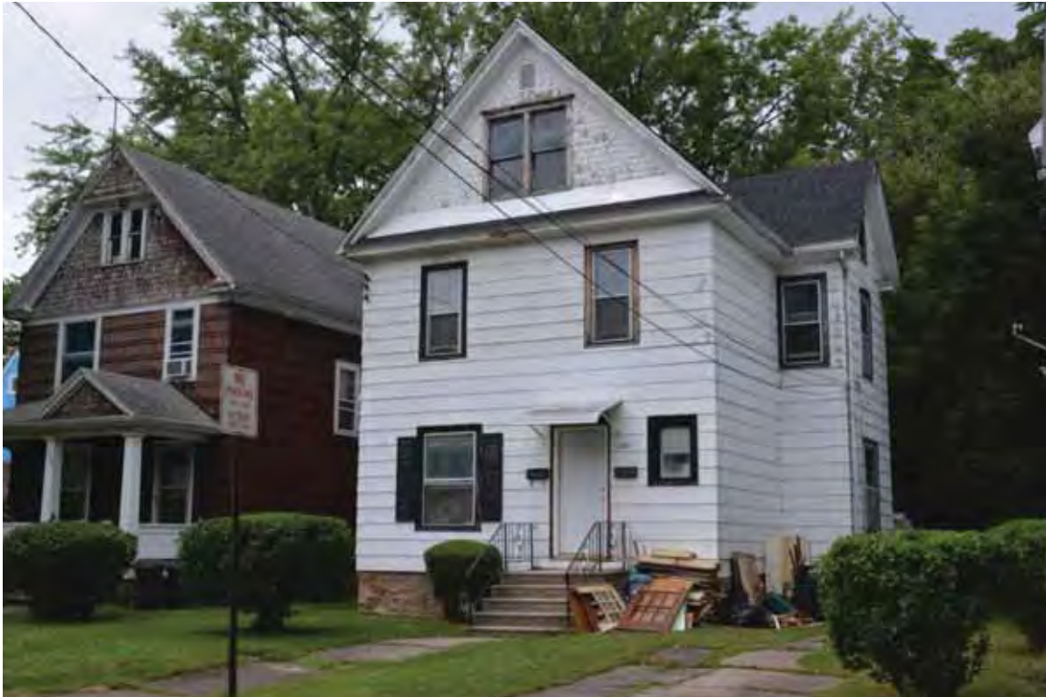
Photograph 4.80. 1420 Eighth Street, facing southwest (Panamerican 2014).