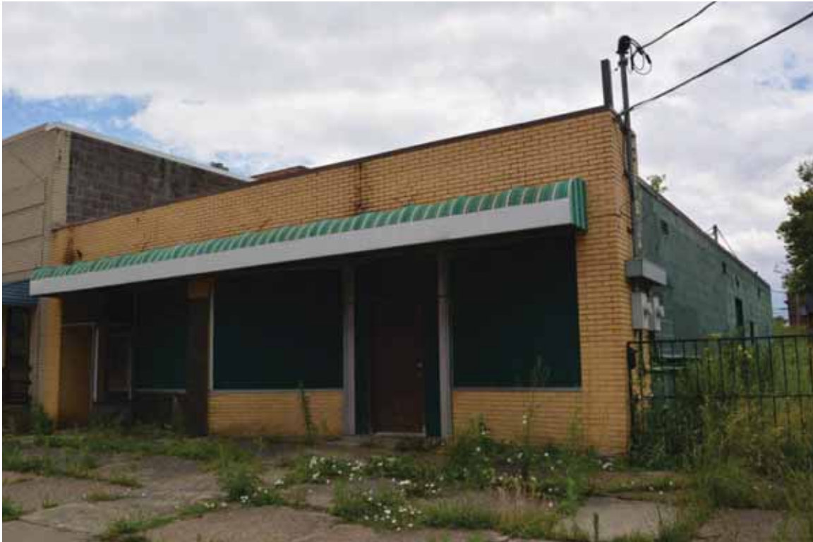
Photograph 4.104. 833 Lincoln Place, facing southeast (Panamerican 2014).