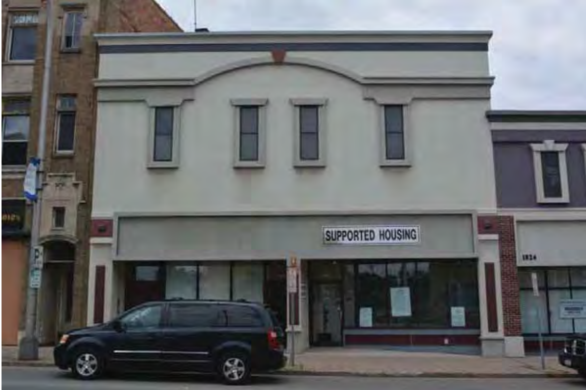
Photograph 4.131. 1818 Main Street, facing west.