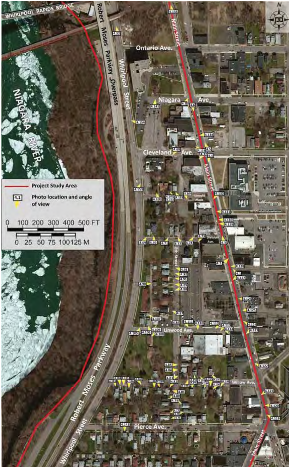
Figure 4.5. Middle portion of RMP North APE.