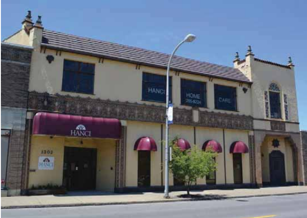
Photograph 4.36. E.A. Kinsey Auto Co. Building at 1300-02 Main Street, facing northwest (Panamerican 2014).