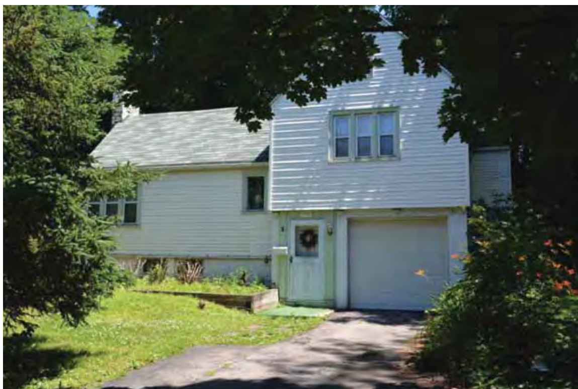
Photograph 4.182. 2921 Whirlpool Street, facing east.