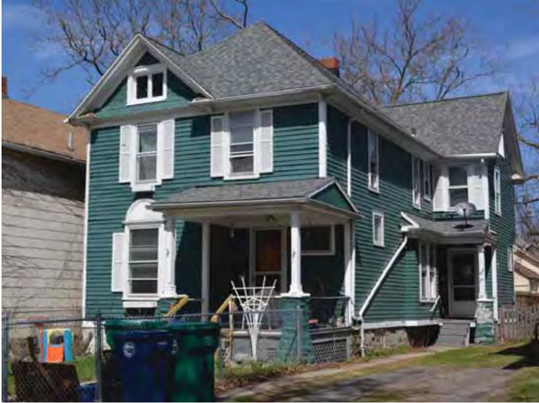
Photograph 4.22. Residence at 608 Elmwood Avenue, facing northwest ( Panamerican 2015 ).