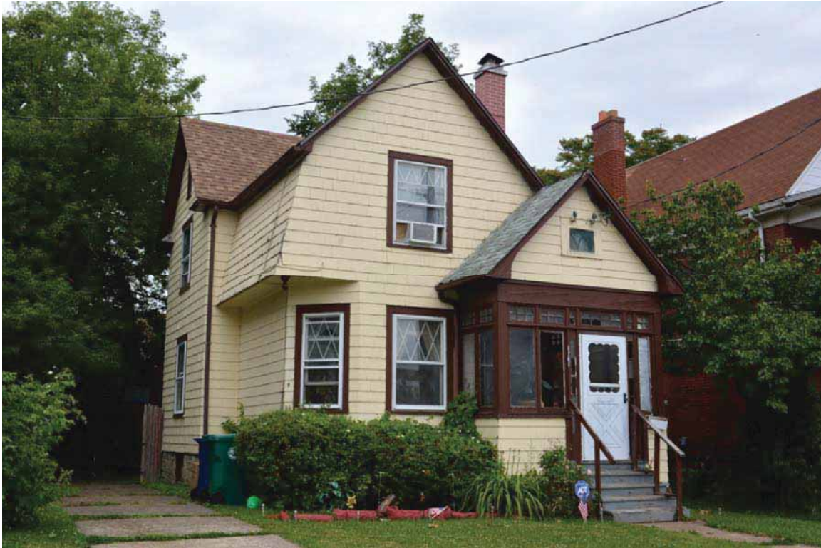
Photograph 4.89. 1628 Eighth Street, facing west ( Panamerican 2014 ).