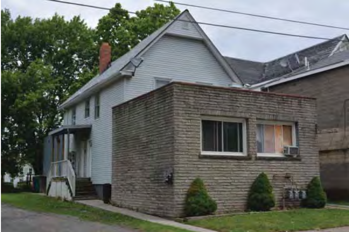
Photograph 4.71. 724 Division Avenue, facing north-northwest (Panamerican 2014).