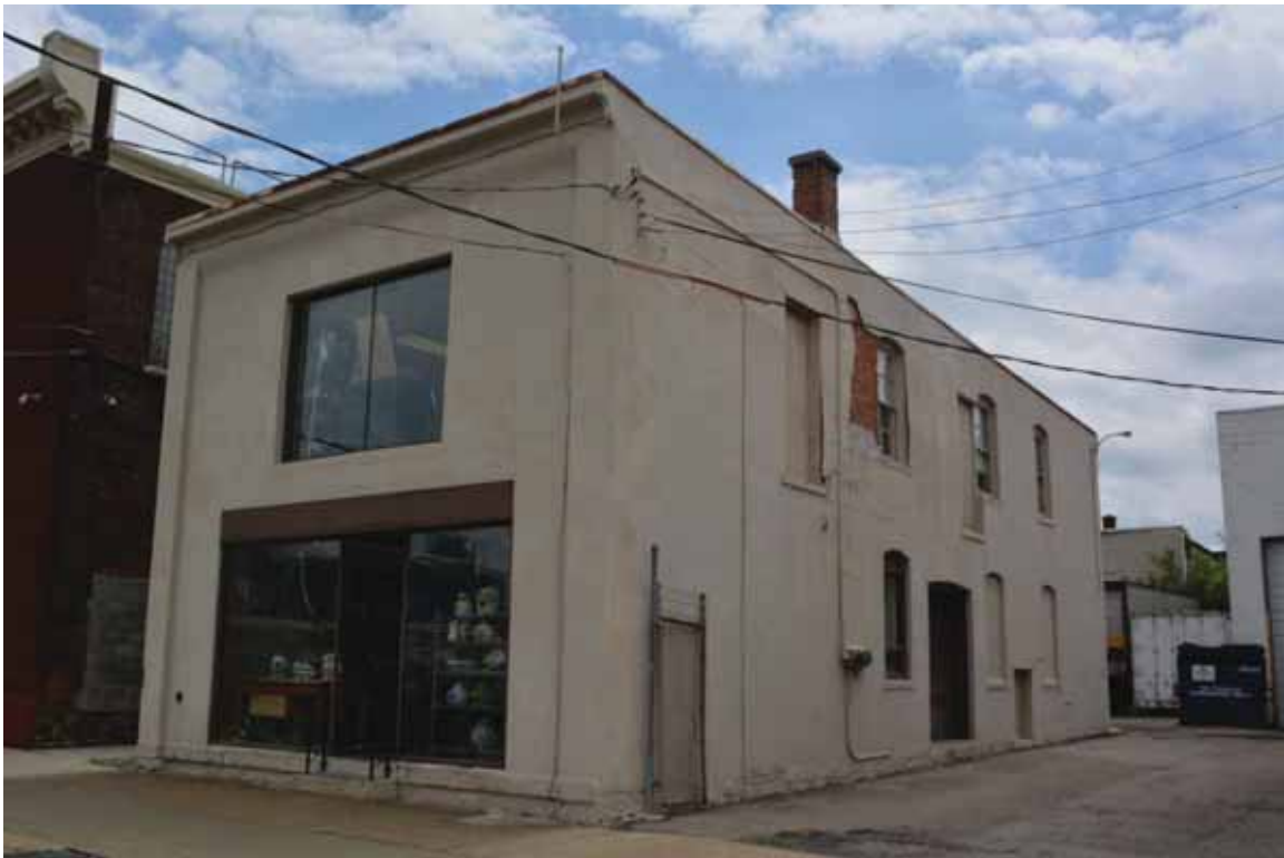
Photograph 4.114. 831 Linwood Avenue, facing southeast (Panamerican 2014).