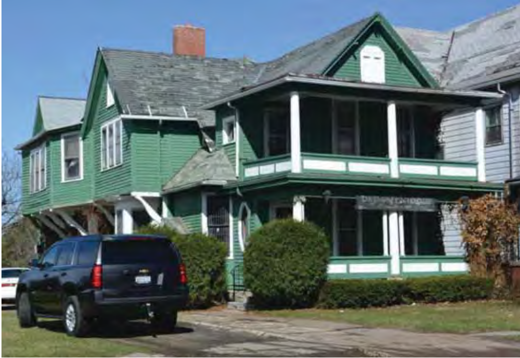
Photograph 4.47. Residence at 562 Third Street, facing northwest (Panamerican 2015).