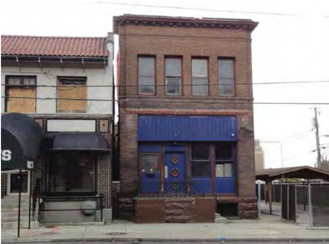
Photograph 4.29. Former telephone exchange building at 211 Ferry Avenue, facing south ( Panamerican 2015 ).