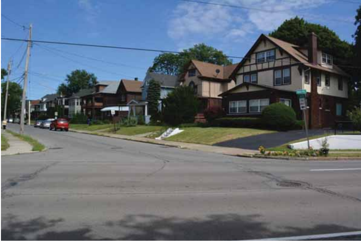
Photograph 4.14. Chilton Avenue-Orchard Parkway Historic District, intersection of Chilton Avenue and Whirlpool Street, facing east-southeast (Panamerican 2014).