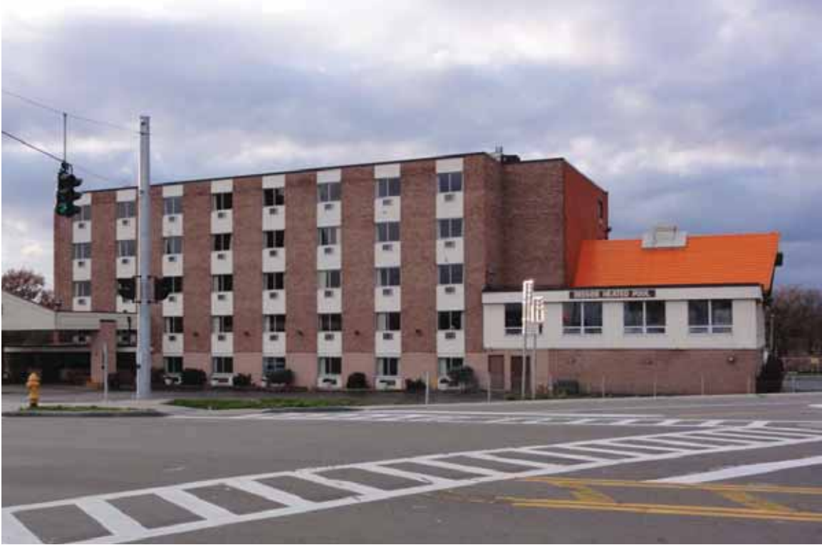
Photograph 4.115. 454 Main Street, facing northwest.