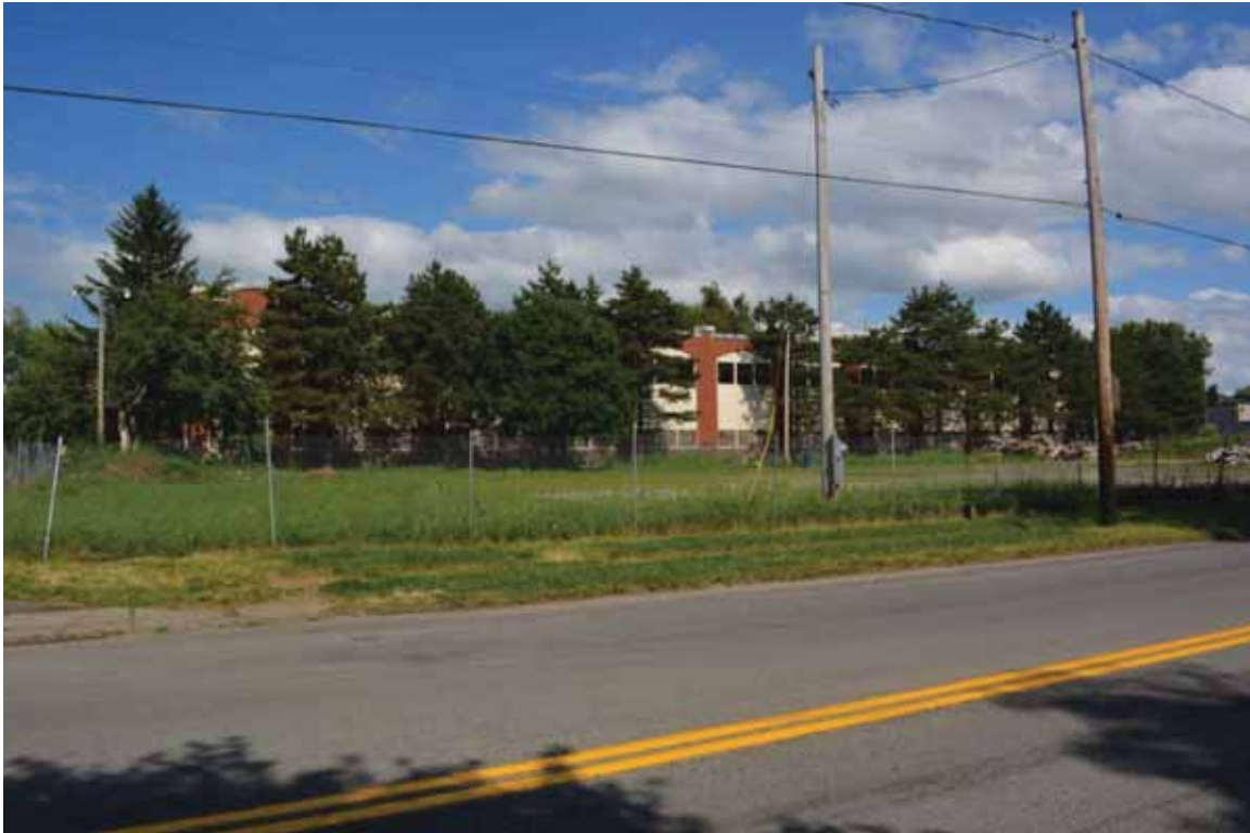
Photograph 4.156. 2600 Whirlpool Street, facing southeast (Panamerican 2014).