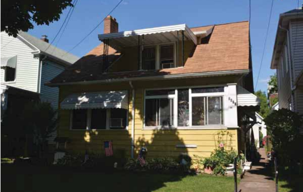
Photograph 4.169. 2671 Whirlpool Street, facing east (Panamerican 2014).