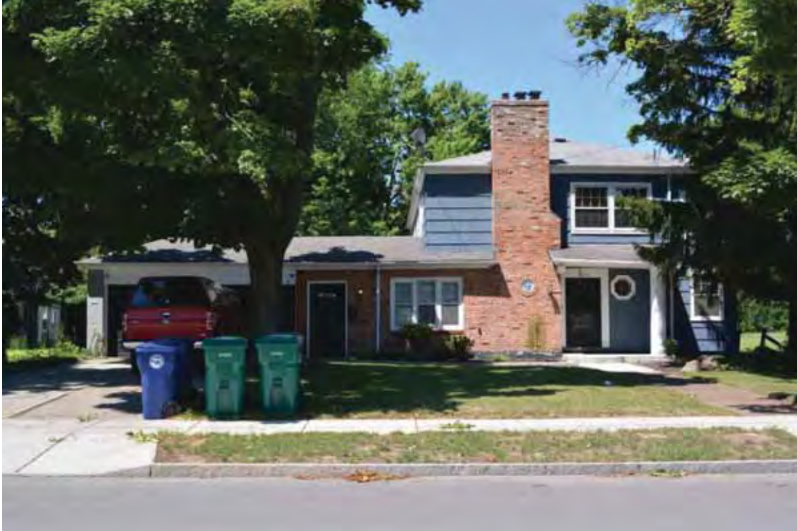
Photograph 4.99. 2848 Lewiston Road, facing west (Panamerican 2014).