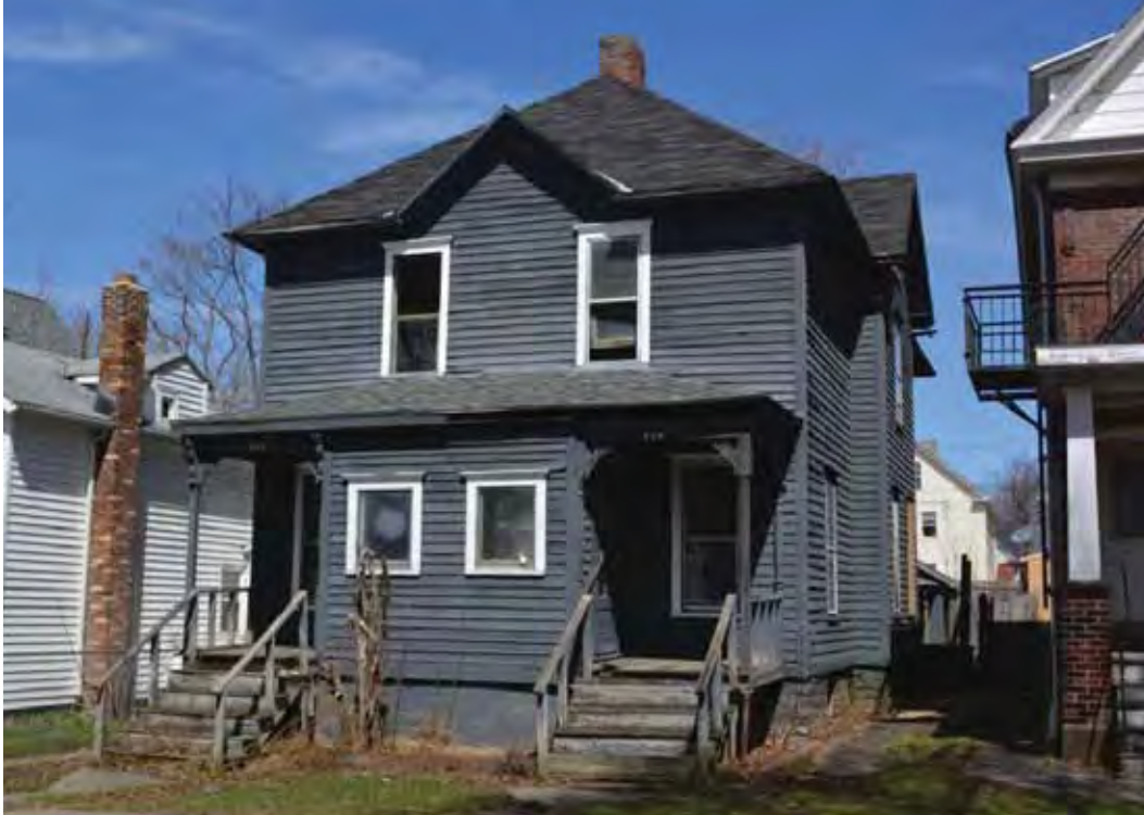
Photograph 4.26. Residence at 628-30 Elmwood Avenue, facing northwest (Panamerican 2015).