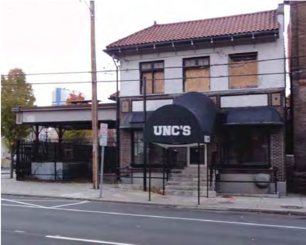
Photograph 4.30. Commercial building at 223 Ferry Avenue (476 Third Street), facing southeast.