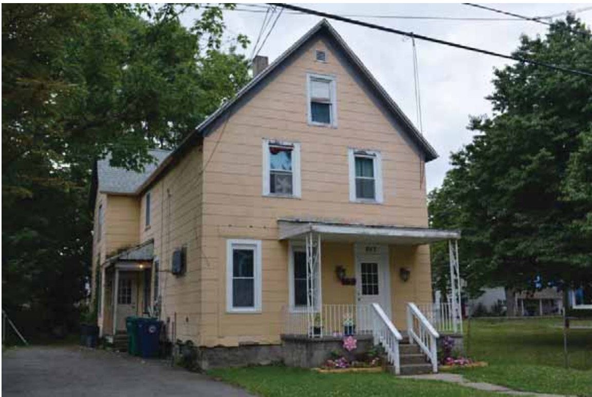
Photograph 4.190. 807 Willow Street, facing south.