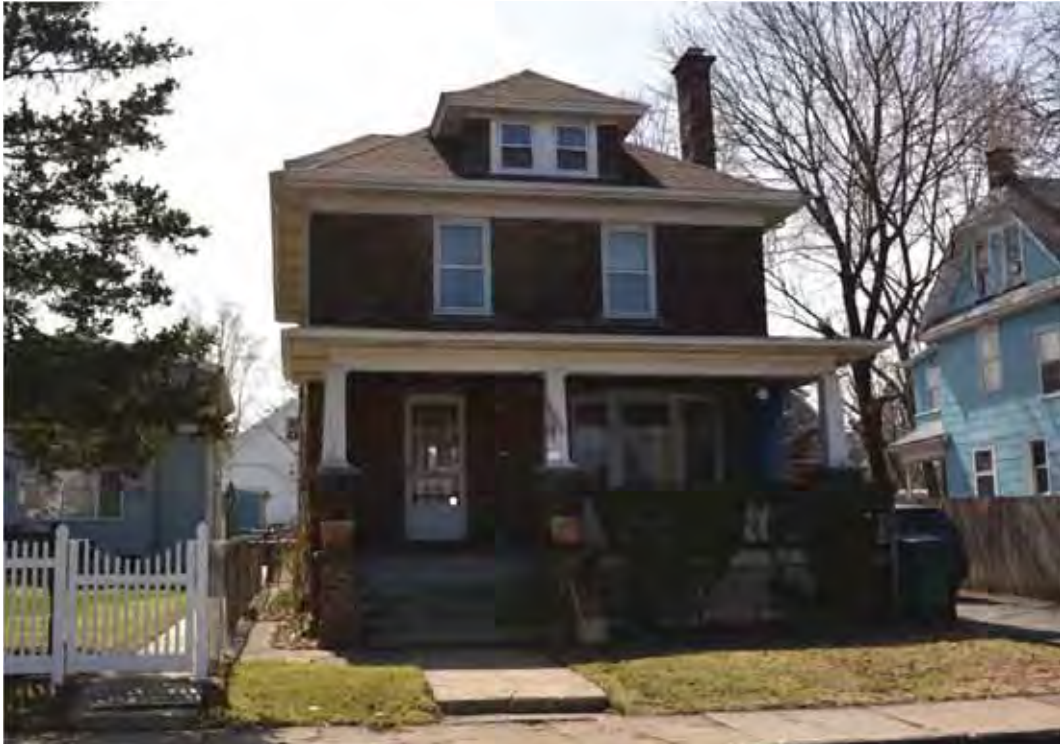
Photograph 4.43. Residence at 377 Spruce Avenue, facing south (Panamerican 2015).