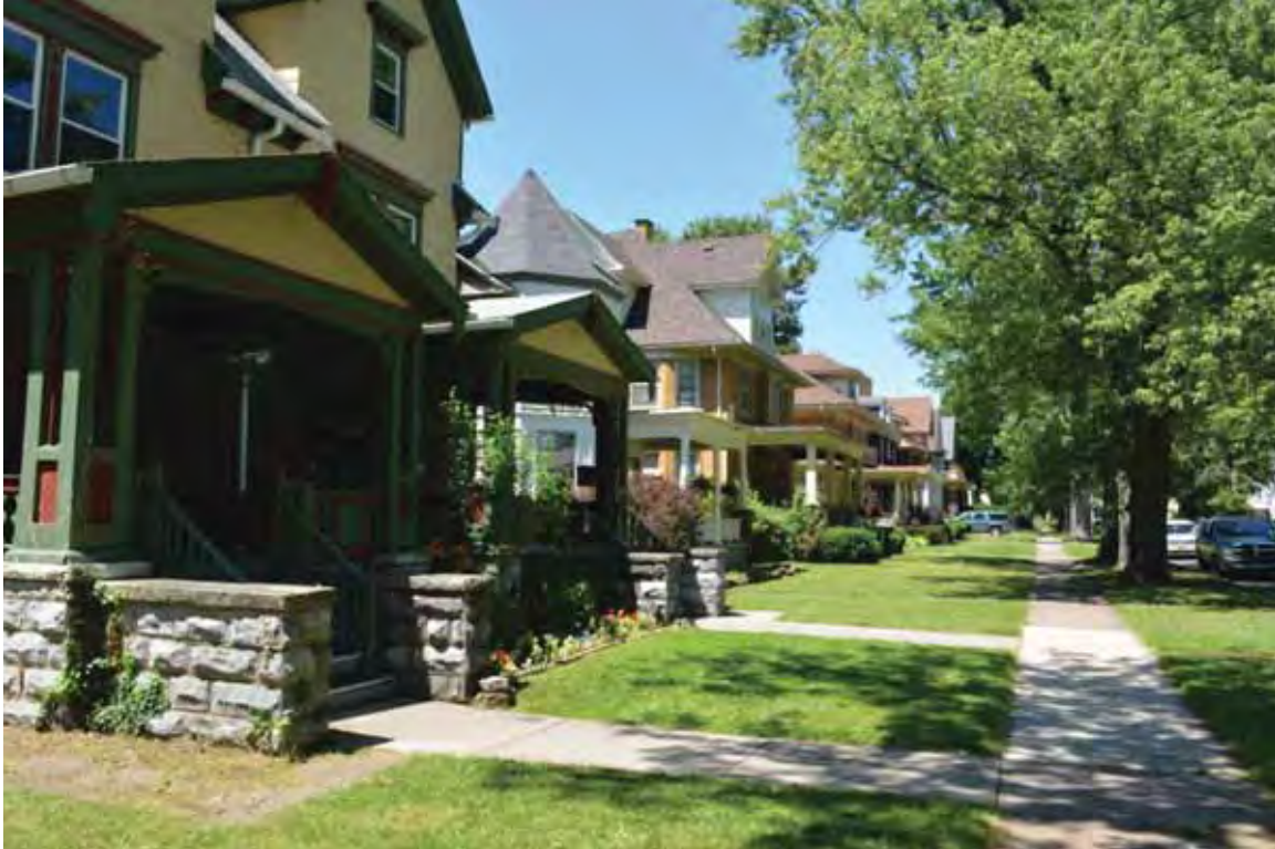
Photograph 4.15a. West side of Park Place, Park Place Historic District, facing north ( Panamerican 2014 ).