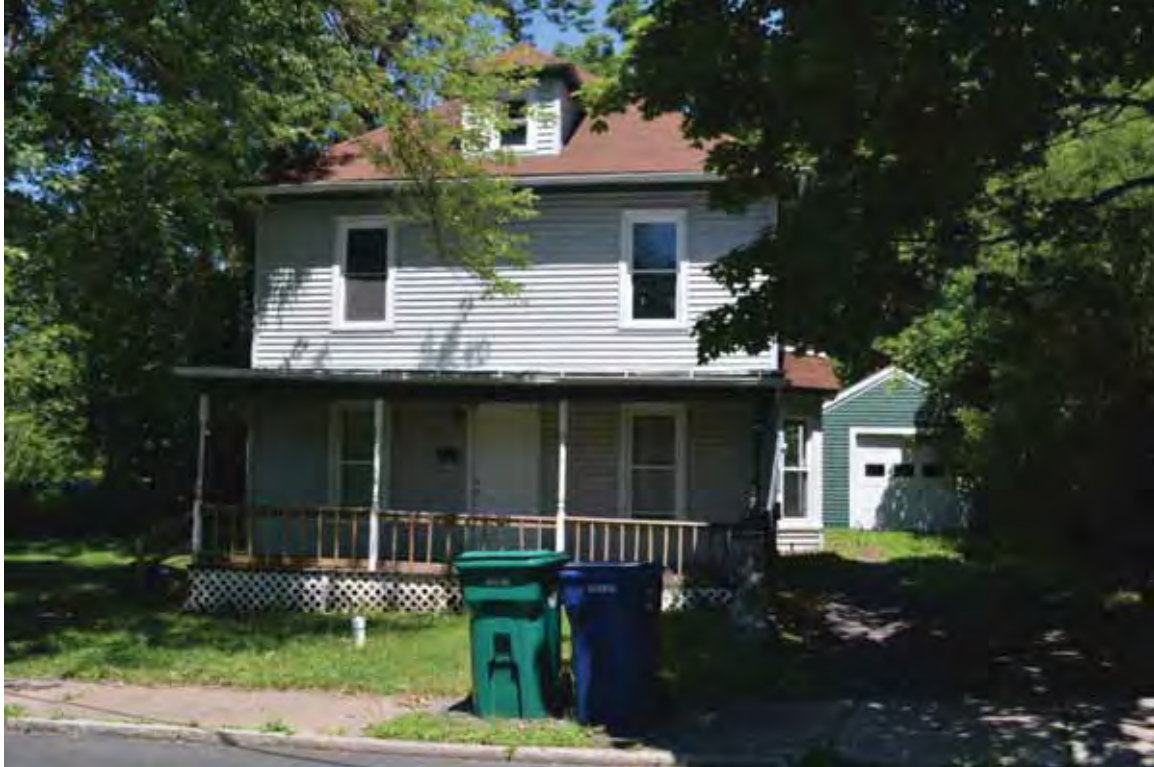
Photograph 4.59. 608 Chestnut Avenue, facing north (Panamerican 2014).