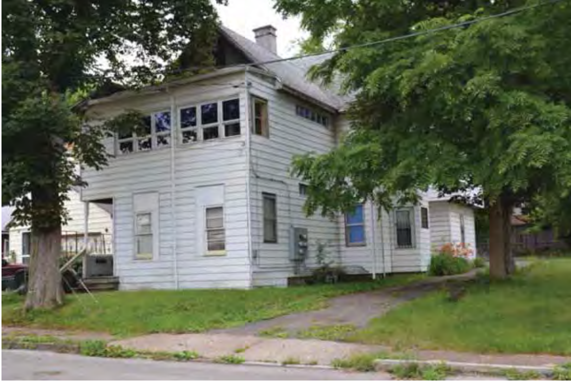
Photograph 4.183. 711 Willow Street, facing southeast.