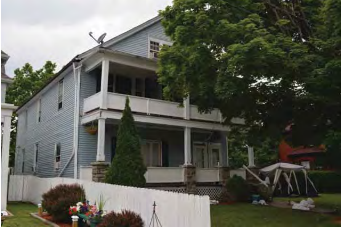
Photograph 4.87. 1610-12 Eighth Street, facing northwest (Panamerican 2014).