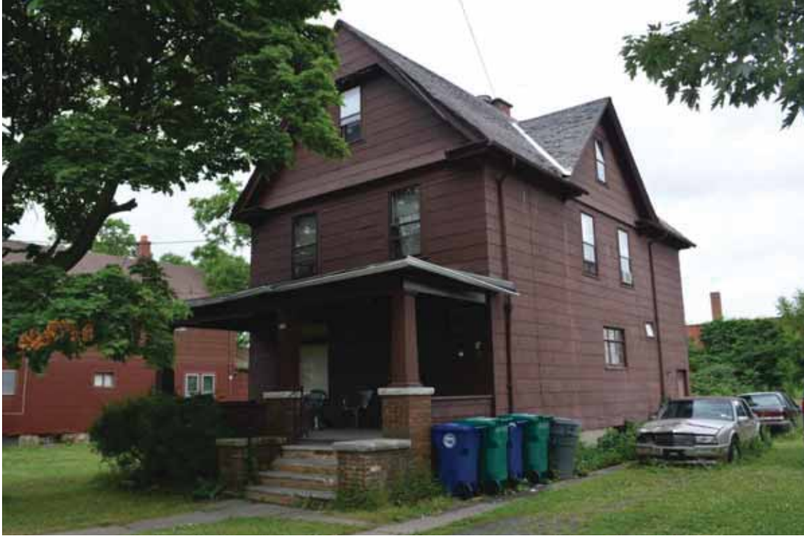
Photograph 4.197. 820 Willow Street, facing northwest (Panamerican 2014).