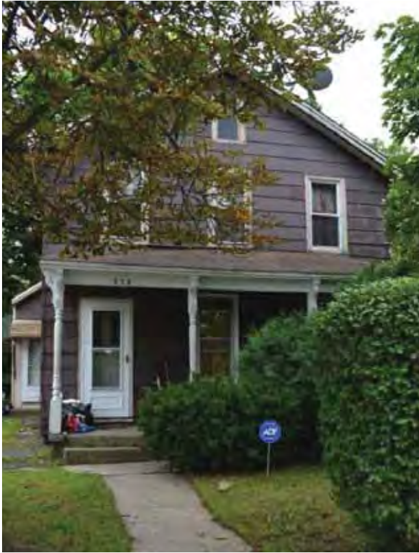
Photograph 4.195. 819 Willow Street, facing south (Panamerican 2014).