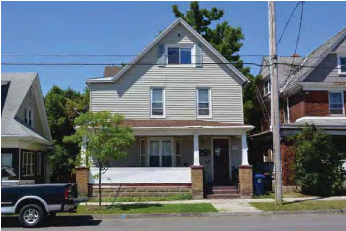
Photograph 4.138. 2658 Main Street, facing west (Panamerican 2014).