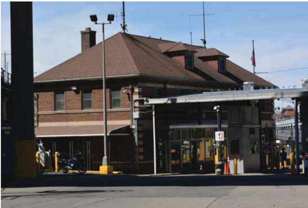
Photograph 4.54. U.S. Customs & Immigration (WHL LPOE Border Inspection), Whirlpool Street, facing west (Panamerican 2014).