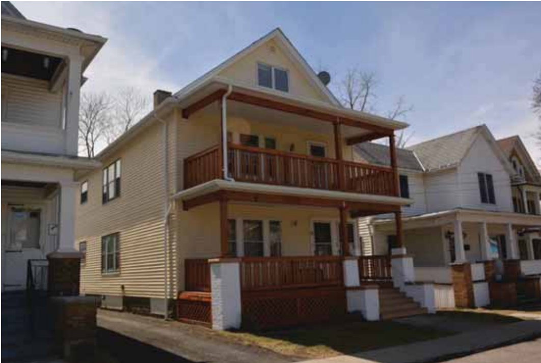
Photograph 4.18. Residence at 675 Ashland Avenue, facing southwest (Panamerican 2015).