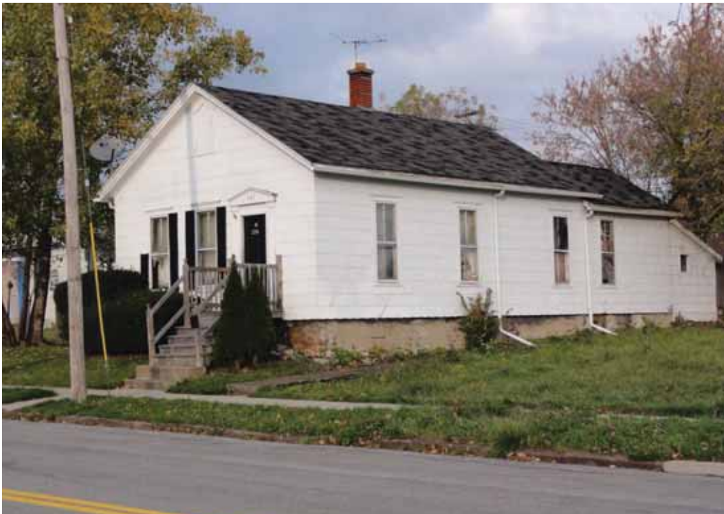
Photograph 4.39. 467 Second Street, facing northeast ( Panamerican 2015 ).