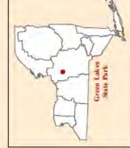
Grassland Management Plan Figure 1