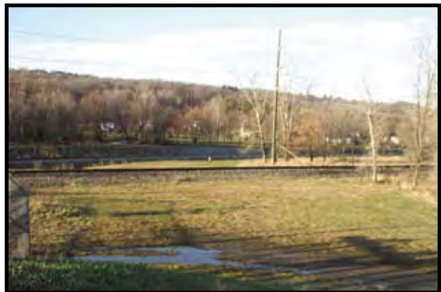
SWNA Alternate Trail or Spur: The alternate trail requires a new at-grade crossing of the active Norfolk Southern Railroad line.