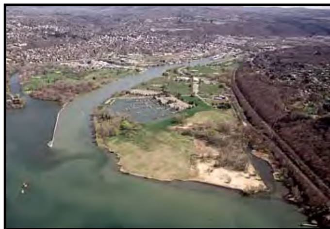
Spur Trail: The complex of recreational lands along the west side of the Cayuga Inlet Flood Control Channel and the southwestern end of Cayuga Lake include Allan H. Treman State Marine Park, closest in view, the City of Ithaca's Cass Park and Cayuga Waterfront Trail immediately south and the Black Diamond Trail along the west side of the complex, west of N. Y. S. Route 89 (second corridor in view along the right side of the photo.)

The following photo illustrates the relationship between Allan H. Treman State Marine Park, Cass Park and the Black Diamond Trail.