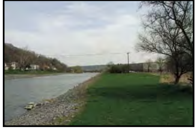
SP 18+000: Trail passes the Cherry Street Industrial area to the east. Trail will cross on a new bridge over the channel in the vicinity of Cecil A. Malone Drive.