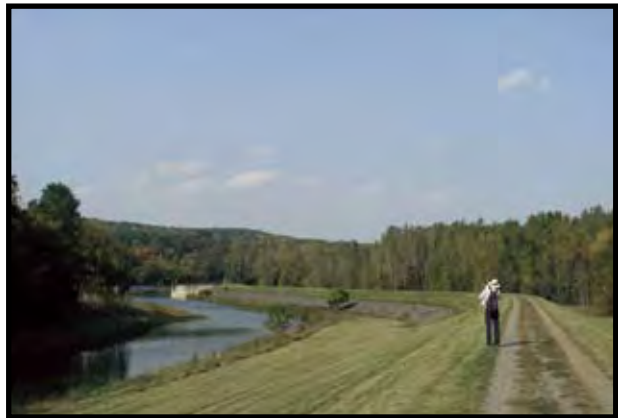
SWNA Alternate Trail or Spur: The existing gravel road on top of the levee is now informally used for walking and jogging. NYSDEC does not allow trail development on top of levees in New York State.