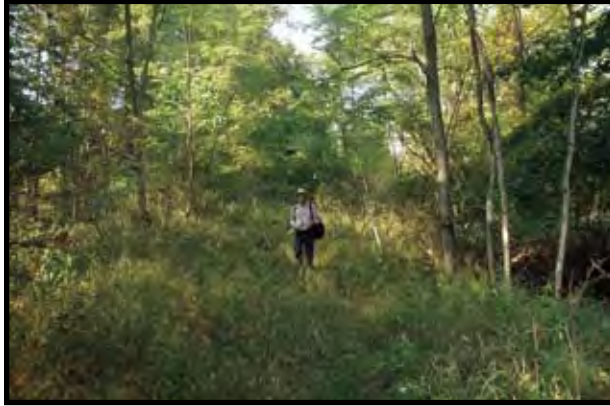
SP 12+500: Abandoned railroad corridor owned by OPRHP.

This segment of trail passes adjacent to remnant floodplain forest. Construction disturbance should be constrained to the top of the prism of the old rail corridor to minimize impact to the forest.