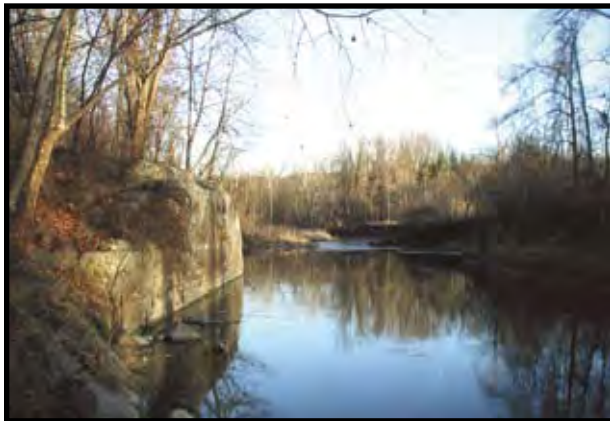
SP 13+200: Trail bridge to be constructed over the Cayuga Inlet along the abandoned railroad line. North abutment is intact.

At SP 13+200 the trail will cross the Cayuga Inlet. A new 150-foot long bridge will be required for the crossing. Old concrete railroad bridge abutments, seen in the photo below, remain at this crossing but are not in useable condition for the new bridge. The old abutments will be left in place to serve as erosion-control retaining walls and new abutments will be constructed behind the old walls.