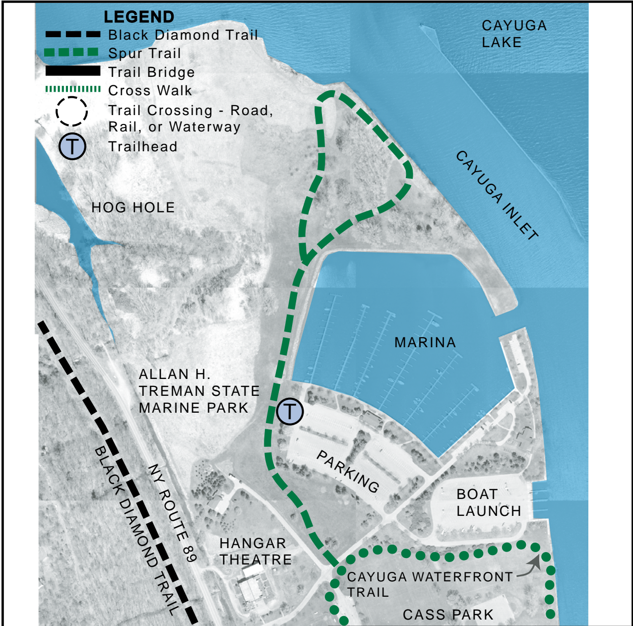
Figure V-9 Black Diamond Trail Allan H. Treman State Marine Park Spur/Cayuga Waterfront Trail