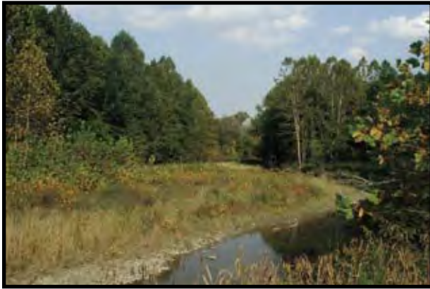
SWNA Alternate Trail or Spur: View of the Cayuga Inlet meandering through the Southwest Natural Area. Proposed alternate/spur trail will follow the southern edge of the Inlet and Inlet floodplain forest.