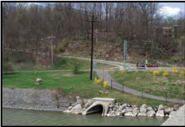
SP 20+900: View from State Street/N. Y. S. Route 79 bridge to where BDT will intersect with the Cayuga Waterfront Trail.