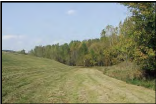
SWNA Alternate Trail or Spur: After crossing over the levee, the trail would be located along the toe of the levee as it heads northwest toward the main Cayuga Inlet Flood Control Channel.