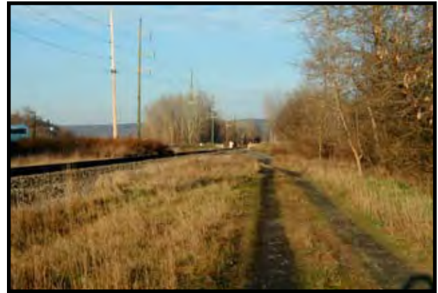
SP 14+625: Trail to be located on former railroad line that is parallel to the active Norfolk Southern Railroad. Safety fence is recommended to be installed between the two corridors.

two corridors, following the design on Figure V-18, page V-114, is recommended to be placed along this section of trail.