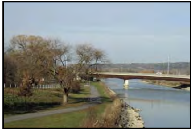
SP 21+000: View north of the trail north of the Buffalo Street/N. Y. S. Route 96 bridge on the west side of the flood control channel where trail will continue to use the Cayuga Waterfront Trail into Cass Park.