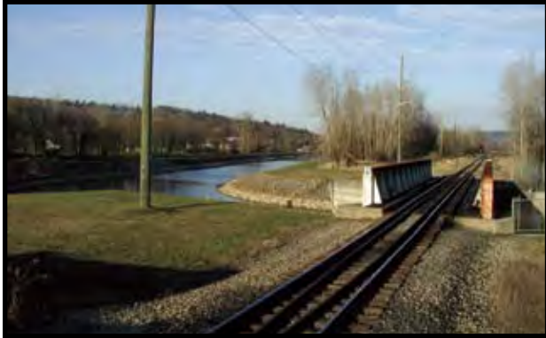
SP 15+125: Southern crossing of the Cayuga Inlet Flood Control Channel. Trail bridge will be located parallel to the active railroad bridge.

Property ownership in this area is unclear and will require further research. If not owned by New York State or the City of Ithaca, the OPRHP will need to acquire title to the property. Fencing between the trail and the railroad may be required in this area.