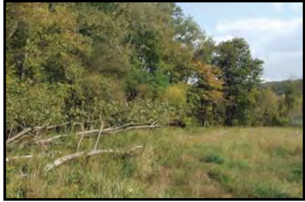
SWNA Alternate Trail or Spur: The trail will be located on the edge of the woodland and meadow to minimize impact on the remnant floodplain forest and take advantage of views of Buttermilk Falls.