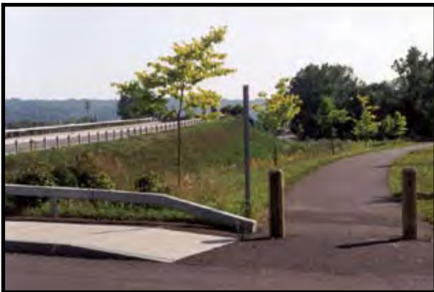
SP 22+500: View south of asphalt trail on west side of Taughannock Blvd./N. Y. S. Route 89. BDT