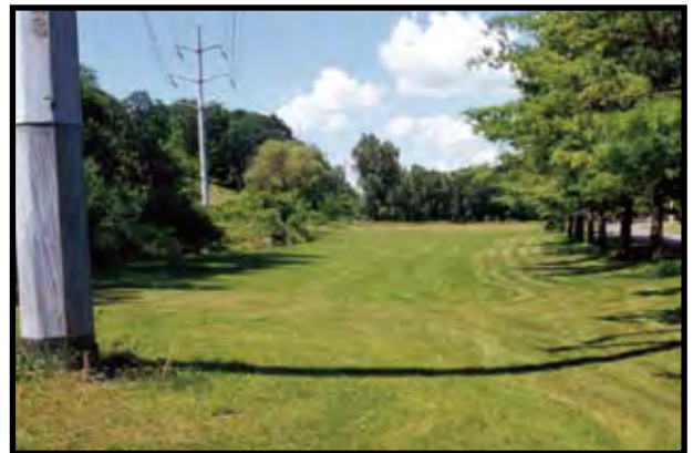
SP 23+000: View north of proposed trail corridor between the NYSEG utility corridor and Cass Park road. The BDT trailhead in Cass Park will be located in the lawn to right of second utility pole.