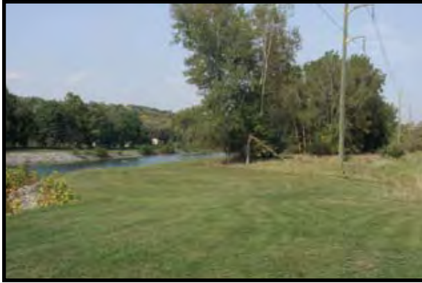
SP 15+400: View to north at south end of the flood control channel. Trail will gently turn left (west) then head north on the east ban of the channel to Cecil A. Malone Drive.