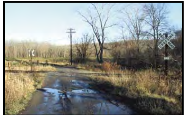
SP 14+875: Existing at-grade crossing of active Norfolk Southern rail line. Crossing will be upgraded for vehicle and pedestrian traffic.

At SP 14+875 the trail will cross to the west side of the active railroad at an existing gravel access road crossing, as shown in the photo below. The access road links Floral Avenue/N. Y. S. Rte 13A to the City of Ithaca's Southwest Natural Area. At present, the City of Ithaca has not developed any patron facilities in the SWA. The BDT crossing of Inlet Road and the railroad line will require upgrading the crossing to protect trail users. OPRHP and the City of Ithaca will need to work with Norfolk Southern Railroad to design and construct the new crossing.