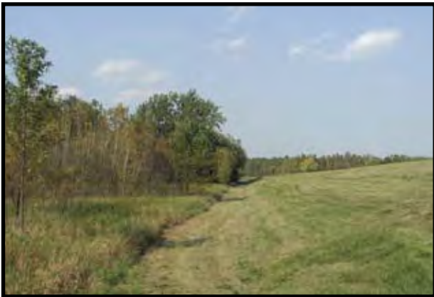
SWNA Alternate Trail or Spur: The trail will meet the flood control levee and ramp up the west side and down the east side as the trail continues to the north.