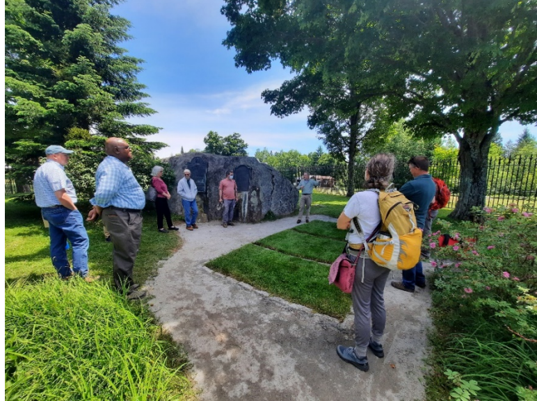
Guided tour at the John Brown family burial plot

Today, 213 acres of the original Brown family homestead are jointly managed by OPRHP and DEC as the John Brown Farm State Historic Site. The remaining historic acreage is part of the Saranac Lakes Wild Forest unit, managed by the DEC.