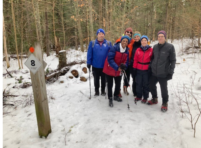
First Day Hike

The site provides year-round passive recreational opportunities popular with local residents and visitors. There are approximately 3.8 miles of multiuse recreational trails at the unit. The grounds and trails support activities such as walking, running, photography, birding, dog-walking, and, in the winter, snowshoeing and cross-country skiing. There are no overnight recreational opportunities.