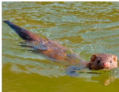
Mink ( Mustela vison )

Much of the Brown homestead was open for pasture and cultivation during the Brown Family's tenancy. Today, most of the land has been reclaimed by wild forest. The existing rustic nature of the site and its structures allows the area to be both historic and consistent with the wild forest character of the surrounding lands.