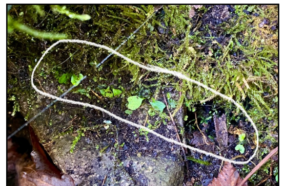
Young AHTF, the offspring of transplanted ferns, were discovered at Clark Reservation in October 2023.

Our efforts to conserve and protect the threatened American hart's-tongue fern (AHTF) continued this fall season. In October, we collected data on over 700 AHTF transplants at five sites in Onondaga and Madison counties. Survival and growth of the transplanted ferns remains promising at most sites, where some established transplants have been growing for eight years now. In an exciting development this fall, offspring from transplanted AHTF were observed for the first time since transplanting began in 2015! Dozens of naturally growing young ferns were noted at a site in Clark Reservation State Park very close to where several mature AHTF transplants have been producing spores for about 7-8 years. This discovery represents a significant step toward the ultimate goal of the AHTF propagation and reintroduction project- creating and augmenting self-sustaining AHTF populations (Cont'd p. 5).