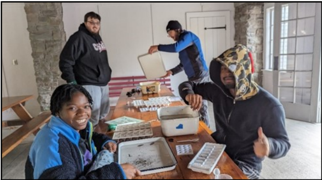
SUNY Cortland Conservation Biology Students identifying benthic macroinvertebrates as part of a lab visit at Fillmore Glen State Park.