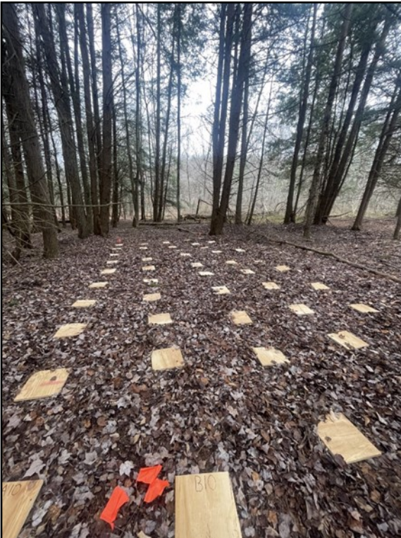
New coverboard plot installed by FORCES Stewards at Robert V. Riddell State Park.