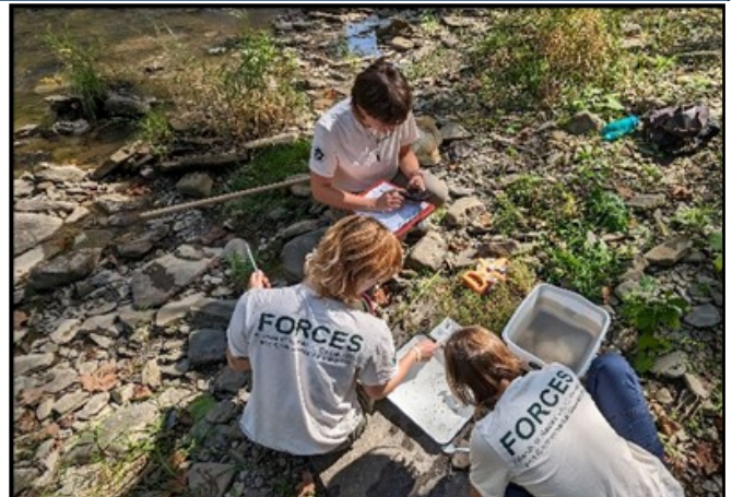
Conservation Stewards conducting a creek survey at Buttermilk Falls State Park.