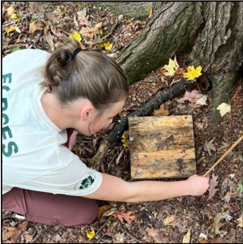
SUNY ESF Club member monitoring a salamander cover board.