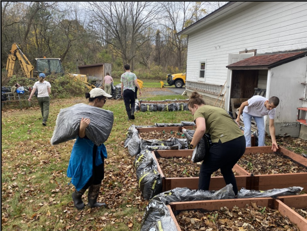
SUNY ESF FORCES club helps to winterize AHTF raised beds at Clark Reservation.