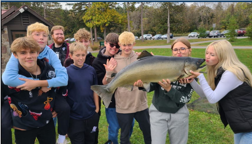
Ladders to the Outdoors participants from Sherburne-Earlville High School learn about fish and aquatic ecology at Green Lakes.