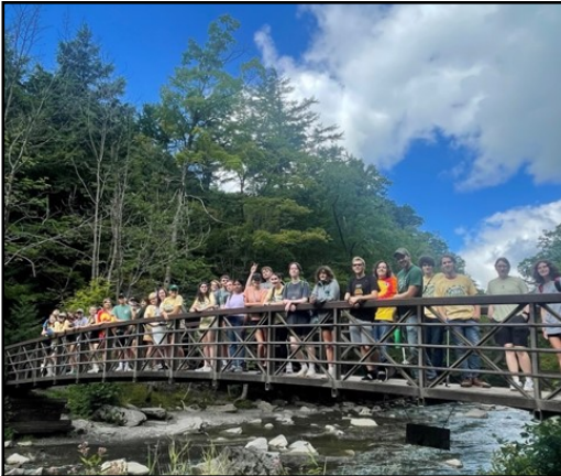
Saturday of Service – SUNY ESF students lined up on the gorge trail bridge. 30 freshmen helped pick up litter throughout the park.