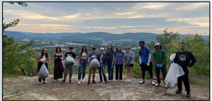
FORCES Club members with 20 bags of trash collected on campus.

The club started out the semester in September with a hike to Mud Lake in the Robert V. Riddell State Park, which gave us an opportunity to learn about trees, mushrooms, local geology, and the lake itself.