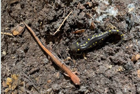
Red-backed salamander and yellow spotted salamander found side by side in the untreated plot at Selkirk Shores State Park.

Central EFT staff continued salamander coverboard surveys at both Selkirk Shores and Robert V. Riddell State Parks through mid-November. This project was implemented in the Central Region in the spring of 2022, as an effort to monitor potential non-target effects of pesticide use on eastern red-backed salamanders. Selkirk Shores and Robert V. Riddell State Parks were chosen because both parks have been chemically treated for hemlock woolly adelgid (HWA). Coverboards were placed in both treated and nontreated areas within each park.