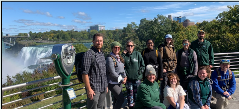
FORCES Stewards and Staff at the 7th Annual FORCES Membership Gathering at Niagara Falls State Park.

FORCES is gearing up for a busy spring season. We'll be hosting our 8th Annual FORCES Summit in April at the Museum of the Earth in Ithaca, stay tuned for more details!