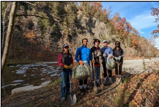
Cornell Tradition Fellows volunteering with removal of invasive slender false brome on the Gorge Trail at Taughannock Falls State Park.