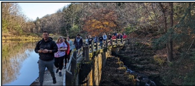
SUNY Cortland Conservation Biology students on the way to conduct a hemlock survey near the dam at Fillmore Glen State Park.