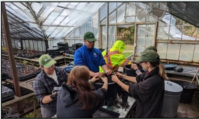
FORCES and SCA Stewards assisting Plant Materials Program Staff with up-potting in the greenhouses at Sonnenberg Gardens and Mansion State Historic Park.