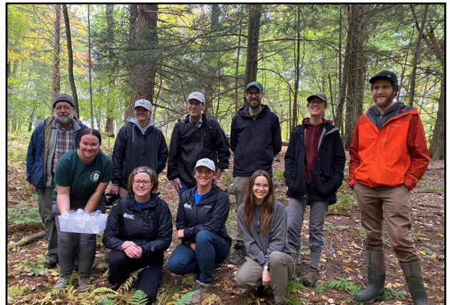
Staff from Parks, NYS Hemlock Initiative, SLELO PRISM, and Oswego County SWCD gather for the HWA biocontrol release at Mexico Point.

This fall, our Piping Plover Project Team cleaned up the beach one last time and removed all of NYS Parks fencing and equipment from the Protecting Bird Nesting Area (PBNA). We hosted several students from Jefferson County Community College for a field trip to the PBNA where they learned about piping plovers and the type of work that we do, including how to use our spotting and monitoring equipment. The students also participated in an activity where we posted illustrations/photos of piping plovers on trees near the parking lot, and they had to identify the unique band combinations in the field like we do on the beach for the actual birds we observe.