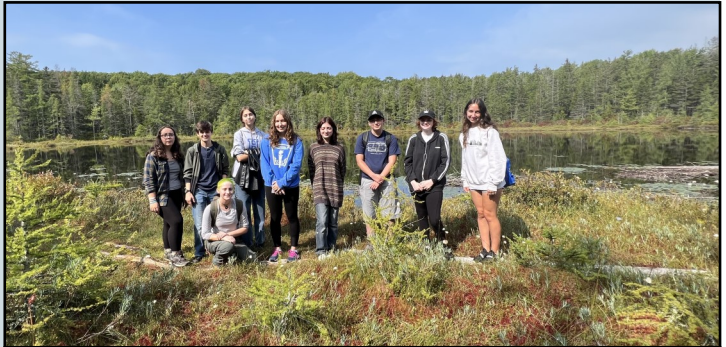
Hartwick FORCES Club members at Mud Lake in Robert V. Riddell State Park.

Hartwick's FORCES club has been working on building new memberships and organizing team-building activities. In the Fall of 2022, the club held a few major events and regular biweekly meetings.