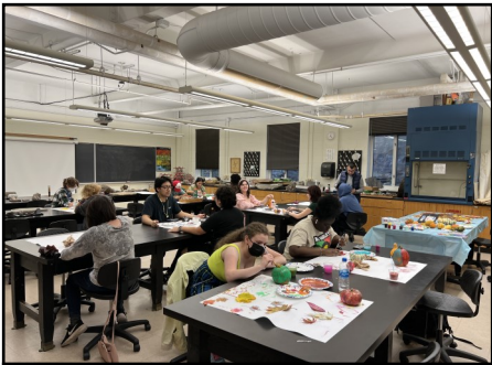
Hartwick College FORCES Club members painting pumpkins.