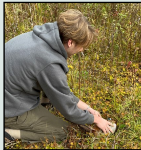
SUNY ESF FORCES Club member assisting with the FORCES DEC Pheasant Release.