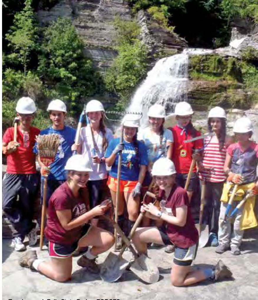
Taughannock Falls State Parks - FORCES