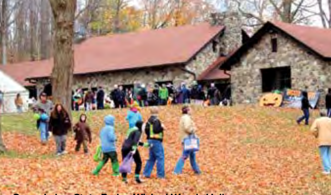
Green Lakes State Park- - Wicked Woods Halloween