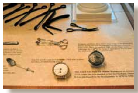
Artifacts at Washington Headquarters

nized as a microcosm of collecting in America, from the birth of the nation to the present, from things used in battle to things used in homes, from souvenirs of travel and