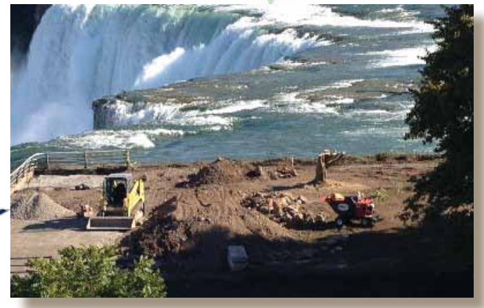
Repairs at Niagara Falls State Park

New York Works funded projects in every region of the state that will enhance the visitor experience and enable our parks to re-emerge after years of decline in capital infrastructure. Highlights of the program include: $25 million for restoration and repairs at Niagara Falls State Park; over $9 million for the rehabilitation of popular athletic facilities, picnic areas and playgrounds at Riverbank and Roberto Clemente State Parks in New York City; over $34 million for infrastructure projects at state parks and historic sites in the Hudson Valley, including $9 million for road and water system repairs at Bear Mountain State Park and over $4 million to restore historic stone work at Mills Man-