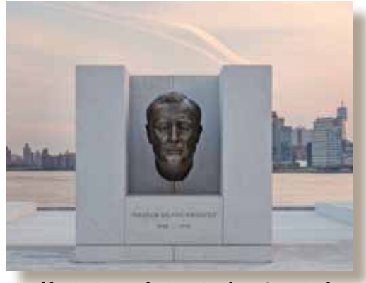
Franklin D. Roosevelt Four Freedoms State Park

speech and expression, freedom of worship, freedom from want, and freedom from fear. Park maintenance, programming and security will be provided cooperatively by State Parks, Four Freedoms Park Conservancy, and the Roosevelt Island Operating Corporation.