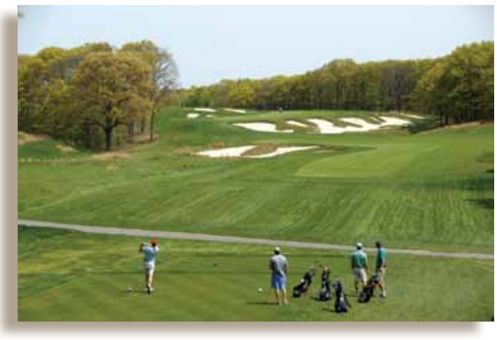
Bethpage State Park, Black Course

the park, but attracted millions of television viewers and world-wide attention to Niagara Falls State Park. And, once again, the world's best golfers played on the Bethpage Black course during the Barclays golf tournament which brought thousands of fans to the famed park during a week of play in August.