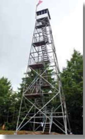
Dickinson Hill Fire Tower

Thanks to an extraordinary volunteer effort by the Fire Tower Committee of the Friends of Grafton Lakes State Park, and assistance from the New York State Police, the historic Dickinson Hill Fire Tower was faithfully restored and reopened to the public as an exciting new hiking destination on the Taconic Ridge. The only one of its kind in Rensselaer County, the 65 foot tower offers panoramic views of the Adirondack and Green Mountains.