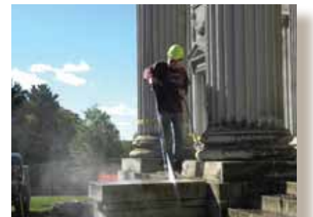
Work being done on the Portico of the Mills Mansion

a century use, this Gilded Age mansion's east portico, roof and estate wall were all in desperate need of structural and aesthetic rehabilitation. Funding for the projects was provided by Governor Cuomo's New