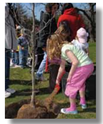
Bayard Cutting Arboretum

State Park hosted the Barclays PGA golf tournament with 100,000 spectators over the course of one week in August. The tournament was played on the Bethpage State Park Black Course which was also the site of the 2002 and 2009 U.S. Open Golf Tournaments. Proceeds from Barclays tickets ordered on-line, amounting to $26,000, were deposited into the Natural Heritage Trust.