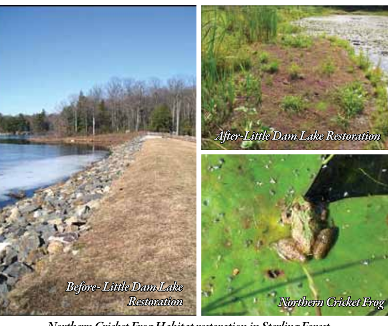
Northern Cricket Frog Habitat restoration in Sterling Forest