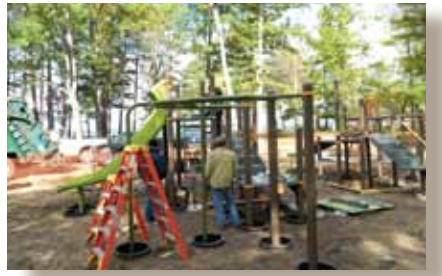
Verona Beach State Park

Verona Beach State Park and Clark Reservation State Park. Verona Beach, located along the eastern shore of Oneida Lake, has adopted a nautical theme with an abstract ship wreck design. An