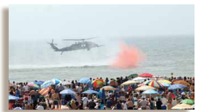
The Jones Beach Air Show

• Park Police opened the summer season with the Jones Beach Air Show which was headlined by the U.S.