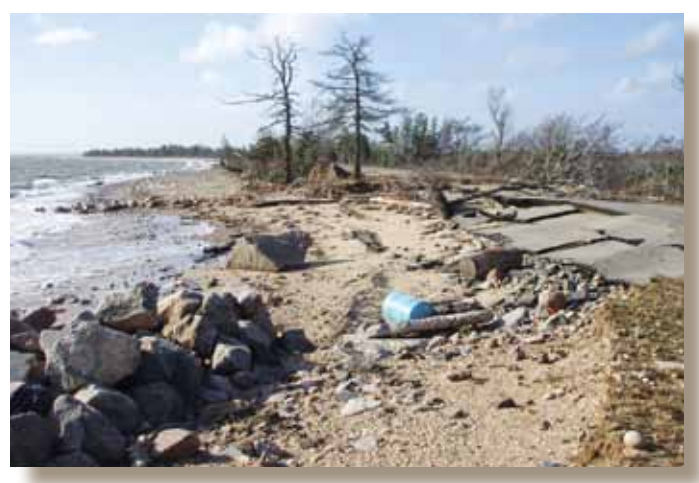
Orient Beach State Park