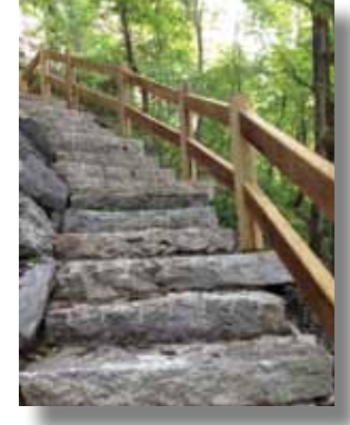
New stairs at Whirlpool overlook

Gorge Trails were overhauled this year along the Rim, creating almost 8 miles of trail between Niagara Falls State Park and Artpark State Park. New stairs were installed at the new Whirlpool overlook and trails were cleared along several sections in order to provide seamless access to this magnificent resource.