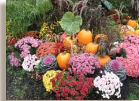
Saratoga Spa State Park

gardens and floral displays to greet the public, while patrons learn about the stunning local options for home gardens. The partnership has yielded eyepopping results at the entrances