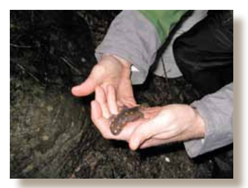
J.B. Thacher State Park Mole Salamander Habitat Enhancement

In 2012, State Parks regional biologists and environmental staff completed more natural resource stewardship projects. These projects