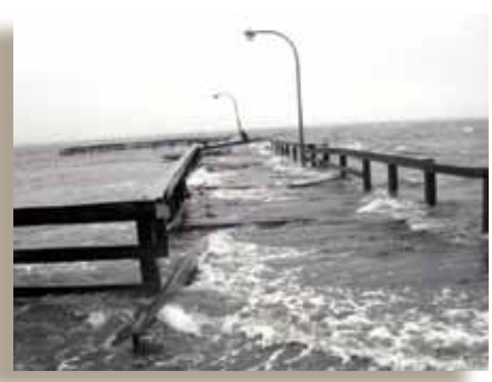
Flooding at Jones Beach State Park

notice the effects of impending storm, Hurricane Sandy. Although Sandy was downgraded to a tropical storm, when combined with two other weather systems affecting the Northeast at the time, she caused