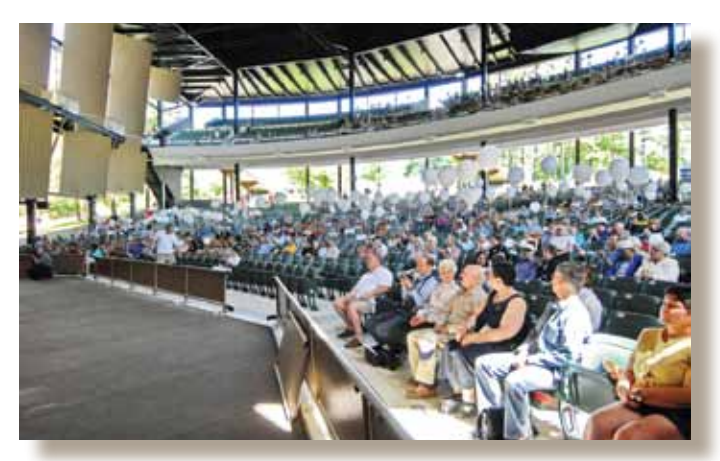
Saratoga Performing Arts Center , Saratoga Spa State Park

period in 2011. Revenue was up 6.3 percent year to date. The revenue trend must continue to support our operating needs.