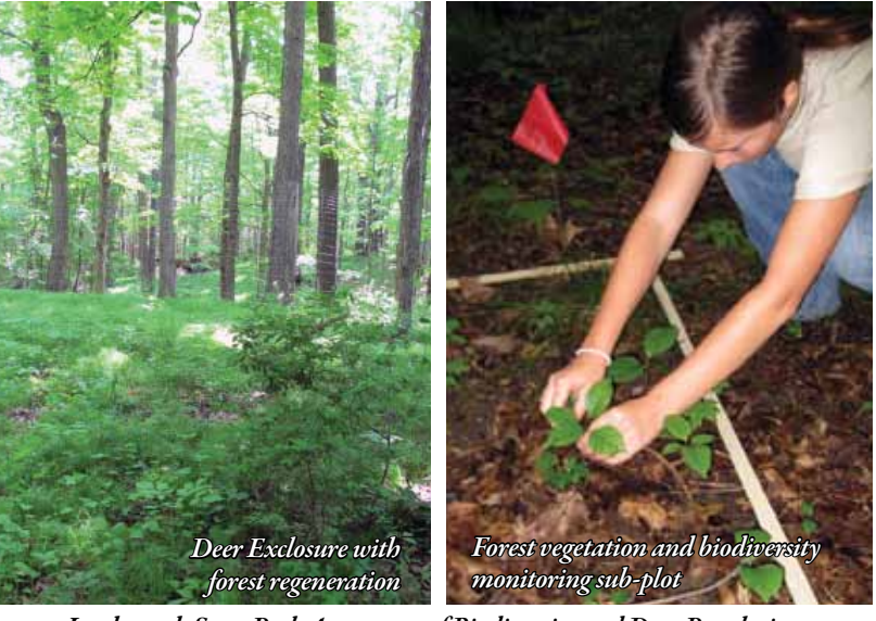
Letchworth State Park Assessment of Biodiversity and Deer Populations