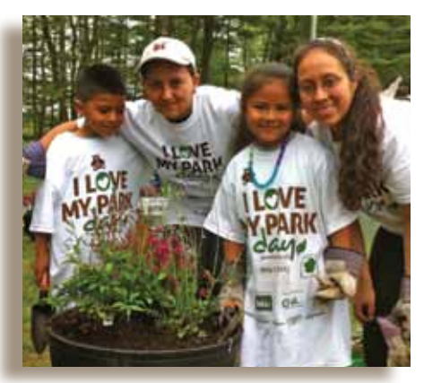
Franklin D. Roosevelt State Park

Volunteers took part in dozens of cleanup, improvement, and beautification projects at 40 state parks and