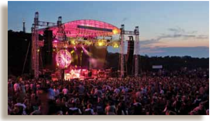
Artpark State Park

Earl W. Brydges Artpark: Renovations to Artpark's outdoor amphitheater were completed as patrons enjoyed outdoor concerts all summer long. Improved patron access into the seating area, new service areas for concessions, a new restroom building, a reformed bowl area for