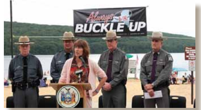
Buckle Up NY event at Lake Welch State Park

• In June, Park Police personnel worked with staff from multiple state, federal, Canadian and local agencies