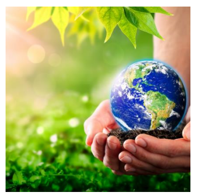
Earth Day Celebration Saturday, April 26, 10a-2pm Copake Falls | Day-Use Area

Earth Day is a time to get together! Learn how nature and our communities can stay healthy! Reduce, Reuse, Recycle. Wellness for us, means wellness for the earth. We will have a few vendors, a food truck or two, informational groups that involve conservation and health/wellness in our local communities. Or just come out for some fun in the sun. Public Event | Free Event