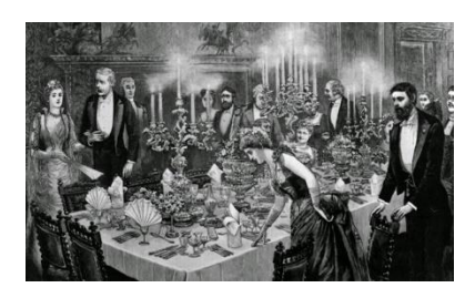
Reservations required: <a href="https://fascinator.eventbrite.com">https://fascinator.eventbrite.com</a> Cost: $12; Friends of Mills at Staatsburgh Member: $10