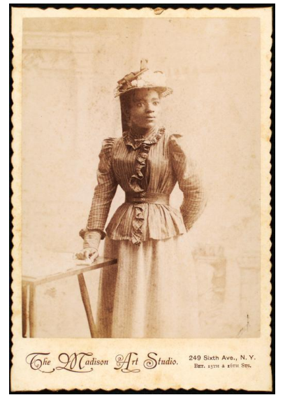
April 27: 1pm

TEA & TALK SERIES: Enjoy tea and scones in Staatsburgh's formal dining room while listening to talks on Gilded Age history.