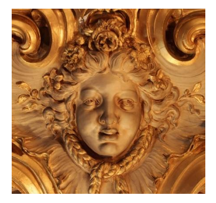
April 29: 6pm via Zoom