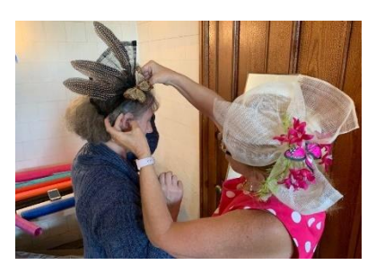
April 12: 2pm Make a Fascinator Workshop

Just in time for Easter, the Kentucky Derby, and the spring season, make your own fascinator to take home...or to the races! These small, striking hats have adorned the heads of fashionable women for centuries. Instruction and all materials will be provided, along with light refreshments.