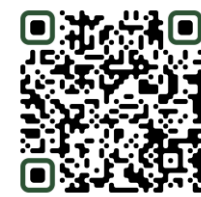
Harriman State Park – Lake Welch Snowmobile Trail Map

For more information about the parks, please download the NY State Parks Explorer app from the Apple App Store or Google Play Store: