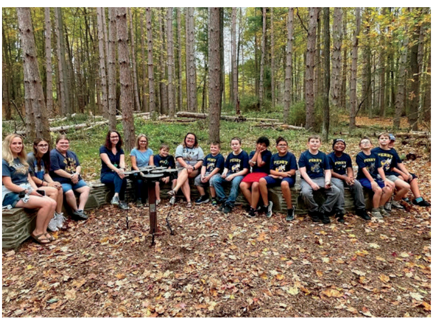
Class from Perry Central School District visits the newly opened ANT

Supported by more than $3.3 million in private fundraising, the new <u>Autism Nature Trail</u> (ANT) at Letchworth State Park is a one-mile hiking loop that includes eight marked sensory stations, each designed to address a different sensory experience in a safe and supportive environment. Activities along the ANT support and encourage sensory perception and integration, while also providing enjoyable activities for visitors of all abilities and ages. Programs and maintenance of the trail will be supported by a long-term endowment held at the NHT, and through ongoing fundraising efforts led by the newly formed ANT Alliance.