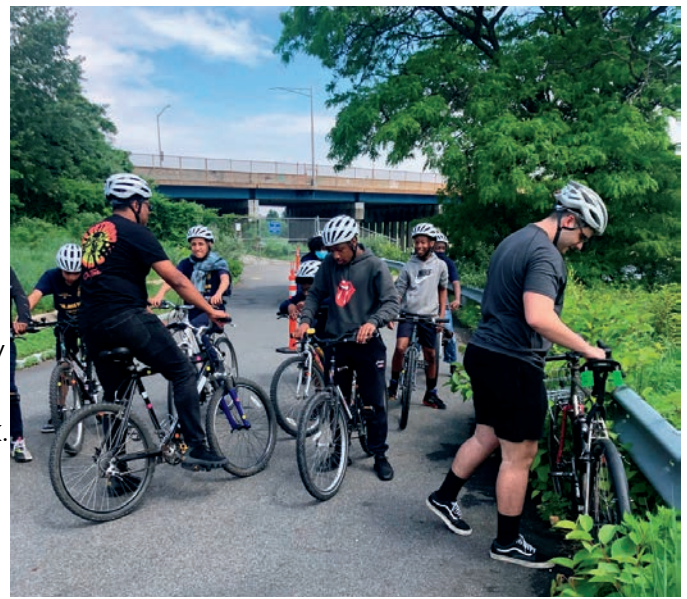
Skills Drills at the Bike Library at Shirley Chisholm State Park

The public-private partnership between State Parks and the NHT strengthened this year with generous funding from Secunda Family Foundation joining the Con Edison Power of Giving program, the Jamaica Bay-Rockaway Parks Conservancy, and the Bloomberg Philanthropies to support the fourth season of the Bike Library at Shirley Chisholm State Park. This funding, administered by the Trust, will support the program's staffing and operations, including bike mechanics and instructors. The Bike Library loans free bikes with helmets so park visitors can explore 10 miles of car-free paths with beautiful vistas in the park. The Library will also offer bike riding classes for all ages plus two Bike Swaps. In addition to donations to support the program, the Bike Library also accepts donations of bikes and supplies.