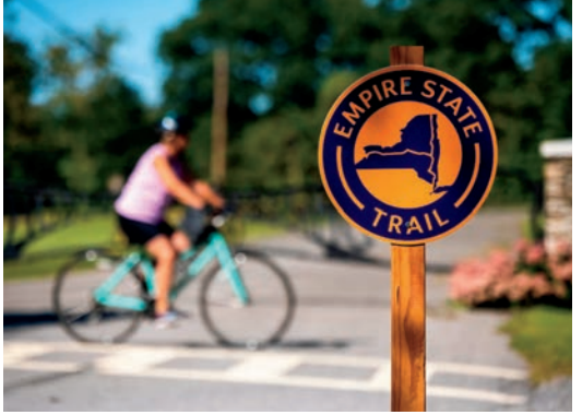
Various points along the newly completed Empire State Trail