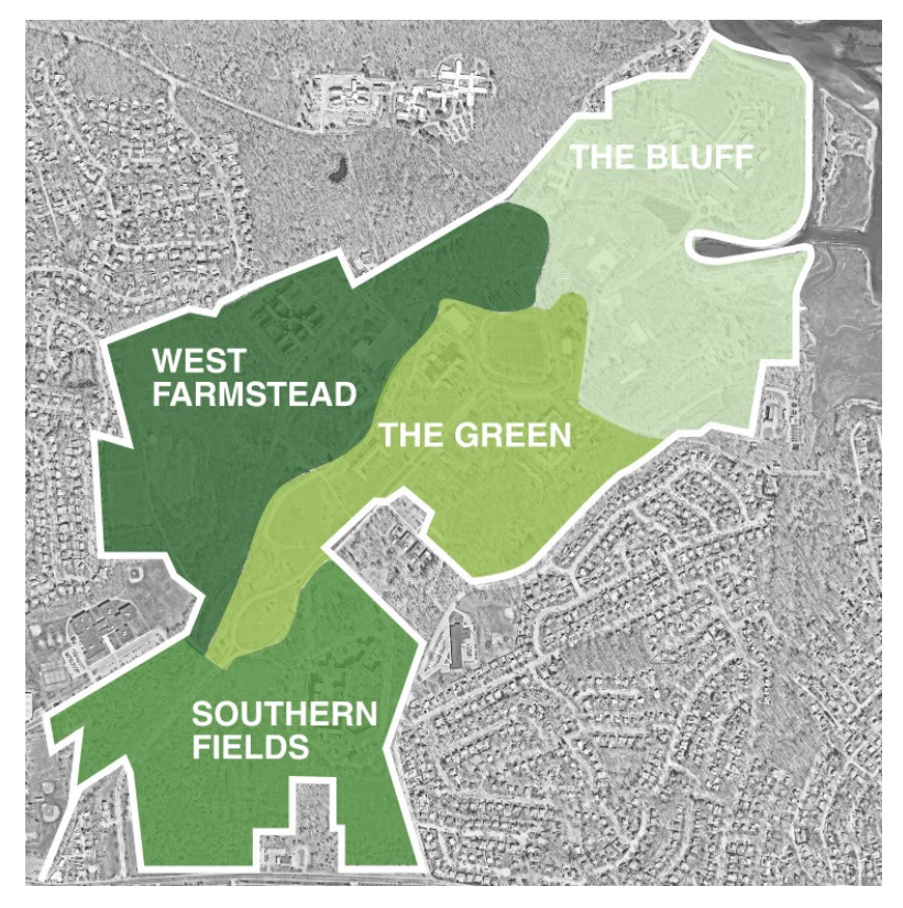
Diagram of proposed program zones

The master plan proposes four development zones based on the intrinsic characteristics of each area of the park. These areas are all seamlessly interconnected by the trail system and park vegetation. This framework is conceptual in nature, primarily to propose types of park programming appropriate for the diverse landscape and former hospital campus.