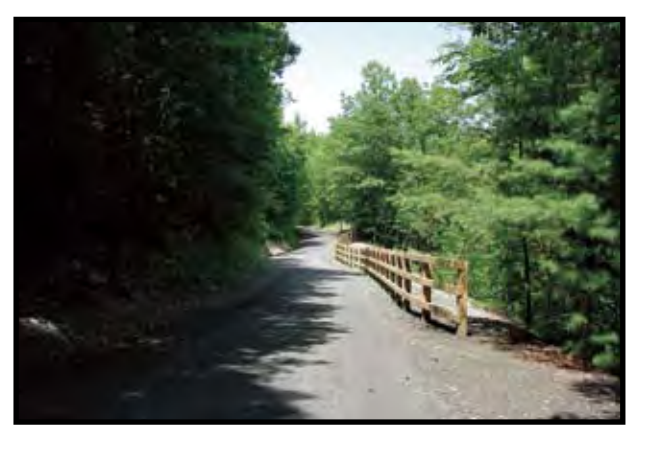
Safety railing, as illustrated in this photo, can also serve to discourage trail users from leaving the corridor and trepassing on adjacent private property. This installation is on the Catharine Valley Trail in the Finger Lakes State Parks Region.

Between SP 54+000 and SP 55+000 the corridor has been maintained by the adjacent landowners who own land on both sides of the trail. In onsite meetings with the adjacent owners options for discouraging trail users from venturing off the trail to visit private facilities included vegetation screening, gates and potentially fencing. Prior to the start of construction, OPRHP will meet with adjacent owners again to finalize the treatment that will be most effective.