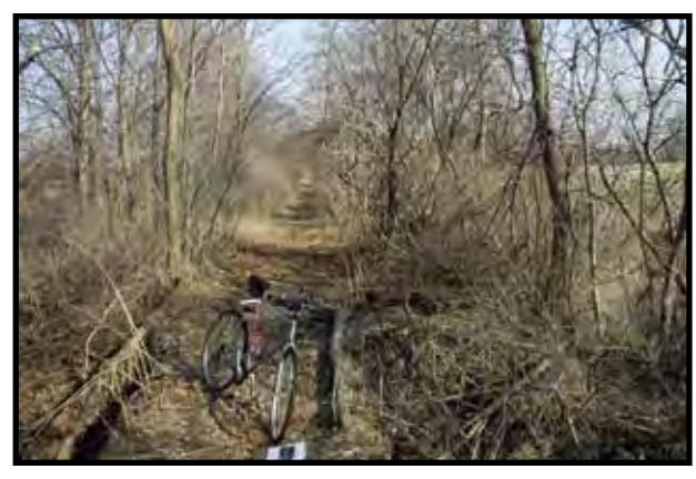
SP 51+700: The lack of maintenance on the drainage structures/ system along the abandoned railroad has resulted in several of them failing. Repair and replacement will be needed on many.

From Houghton Road to SP 54+000 the trail corridor is not excessively overgrown with second-growth vegetation. There are two drainage structures noted on the trail plan, at SP 51+700 and SP 52+800, that require repair or replacement. The following photo illustrates the culvert situation at SP 51+700.