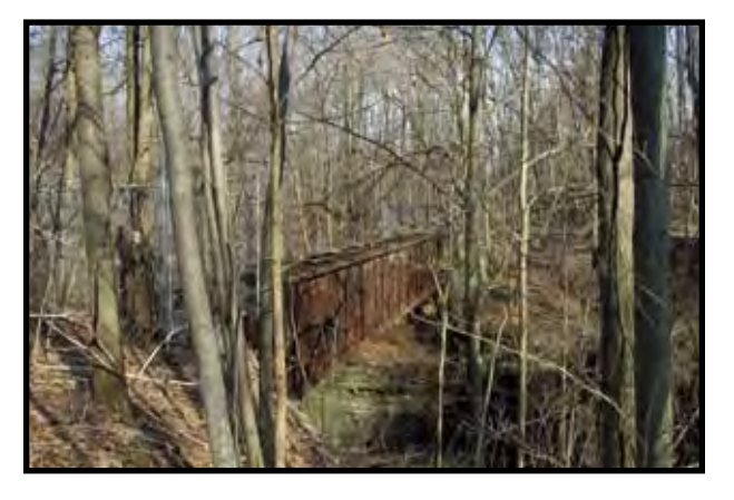
SP 55+100: View, looking south, of the existing railroad bridge over Willow Creek. Redecking and safety railing are needed to put the structure in use for the trail.

minimum, the bridge will require new decking and safety railing following ASHTO and NYDOT specifications for bicycle facilities. The existing bridge structure is illustrated in the following photo.