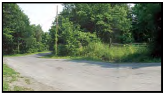
SP 41+300 E: View southeast at the intersection of the trail and Glenwood Heights Road. Site distance for trail users traveling north is limited downslope. Selected clearing of vegetation may improve the condition with the support of the warning sign program.