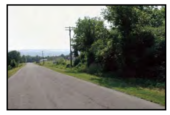
SP 50+200: View of trail corridor from Houghton Road intersection. Trail corridor located to the right of the utility pole in the forefront of the photo.

The trail intersects with Houghton Road at SP 50+200. Visability for both trail users and motorists is good in both directions at this intersection. On the southwest side of the Houghton Road/BDT intersection, a driveway to serve an adjacent property will be developed similar to the situation existing at the Garrett Road intersection. Grading and culvert installation will be required to make smooth transitions from the road to the trail. The following photos document the existing condition at the trail/road intersection.