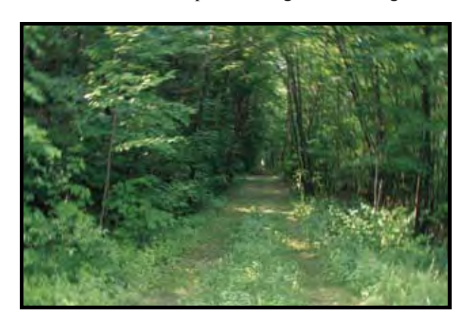
SP 36+000: Railroad corridor north of segment of trail with NYSEG transmision lines. Trail will pass through a second-growth forest landscape.

From SP 35+000 to the crossing of Glenwood Heights Road, at SP 41+300, the trail is clear and open with a packed gravel and dirt surface as illustrated in the photo below. Between SP 39+000 and Glenwood Heights Road, the adjacent property owners are preparing their lands on both sides of the trail corridor to accommodate a bison farm. The farm will use an existing farm crossing from the days of the railroad operation to periodically move the bison between pastures. Special signs alerting trail users to the bison farm operation and crossing conditions will be required along this trail segment.