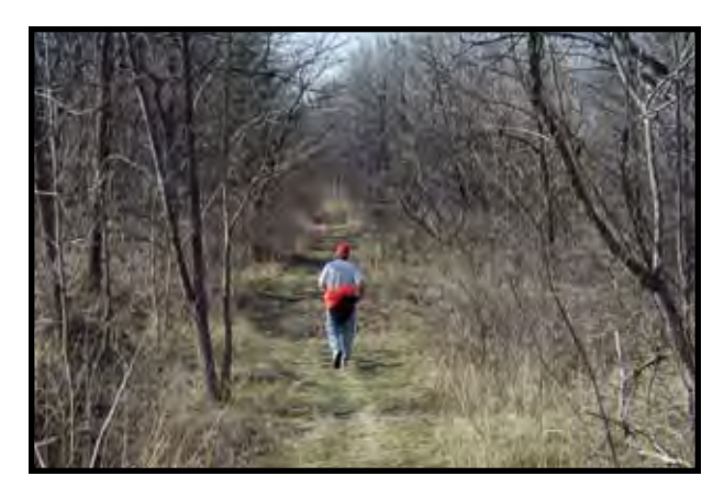
SP 44+500: Former railroad corridor north of Perry City Road is accessible but will require clearing of shrubs and small trees to achieve the required 16-foot horizontal clearance.

North of Perry City Road, between SP 43+700 and SP 47+000, the corridor surface is grass and packed dirt and fairly clear of vegetation encroachment, though some additional clearing will be required, as represented in the following photo. Drainage swales upslope of the former railbed will need to be re-established along this segment.