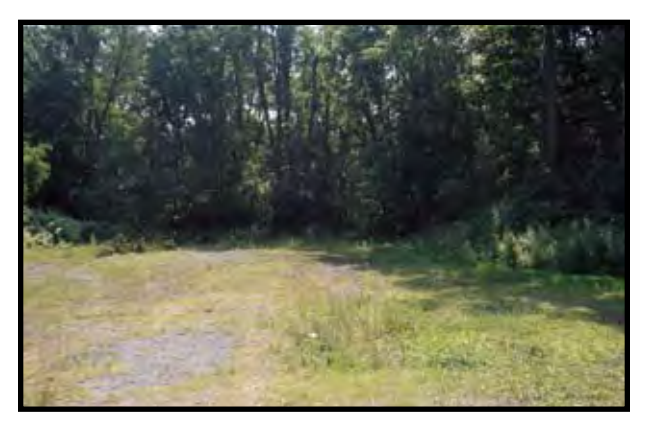
SP 55+500: Potential future trail access point along trail corridor between Willow Creek bridge and Kraft Road.

Between the bridge and Kraft Road there is an area including OPRHP and private property formerly used by the Tompkins County Highway Department to store road-repair materials. During the railroad era, the area was a siding for a hay, grain and coal storage building. The area would lend itself easily to be developed as a small trail access/parking area. With the privately-operated, 200-site Spruce Row Campground within three-quarters of a mile to the west, an access point in this location might be appropriate. OPRHP will explore this option in the future after the trail is open and operating to assess the need for additional access points.