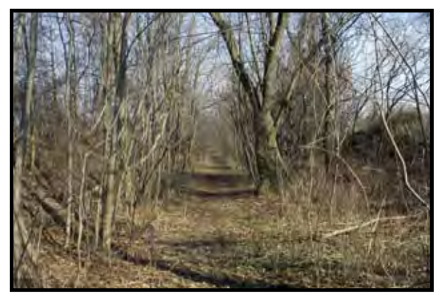
SP 65+000: Sections of the railroad corridor south of Gorge Road are below the elevation of surrounding fields. These areas tend to be wet and will require establishing better drainage systems.

At times the corridor is raised on an embankment with nice views into the surrounding woods and field. In other areas it is in a cut with steep banks on either side of the proposed trail. There are many wet areas in the cut sections and drainage improvements will be needed when surfacing the proposed trail.