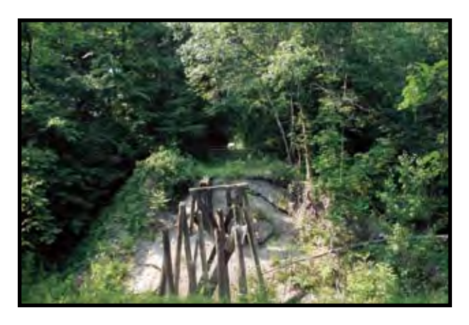
SP 42+250: A new structure for the trail crossing of Glenwood Creek is required. A bridge unit could allow the old trestle-support timbers to be left in place for an interpretive opportunity.

This 2,400 linear feet of the BDT continues on the former railroad corridor, which is currently a grass, dirt packed surface with remnant railroad ballast. At SP 42+250 the trail will cross Glenwood Creek. Up to the mid-1990s, an earthen embankment with culverts served as the crossing of the creek. Two large winter thaw/rainstorm events in the mid-1990s resulted in the earthen embankment washing out. The remains of the structure include a trestle-like support system, as seen in the following photo. A new crossing will be required in this location. Options include a box-culvert system or a bridge. The span for a bridge is approximately 150 feet in length.