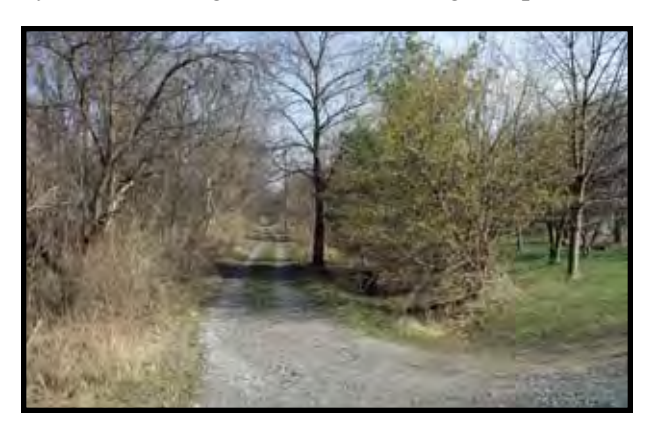
SP 48+500: View of trail corridor south of Garrett Road intersection. An adjacent property owner has used the corridor to reach a residence. The property has road frontage on N.Y.S. Route 89, owner notified a new driveway will have to be constructed.

driveway is located west of and adjacent to the trail corridor, separated from the proposed trail by a narrow hedgerow. The following two photos