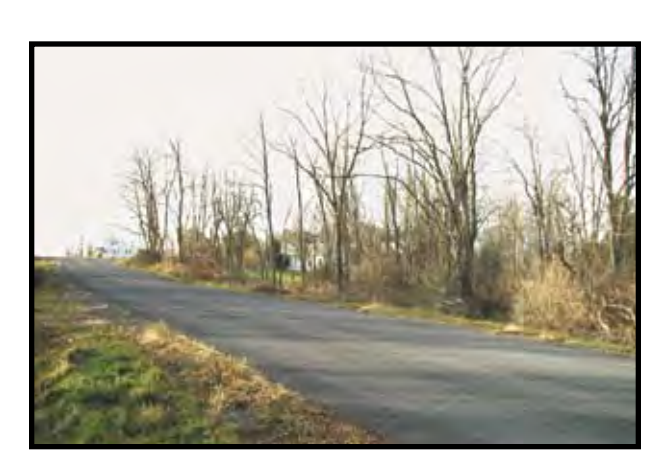
SP 58+900: Trail intersection at Agard Road. Trail crosses road at a cross-slope. Culverts will need to be installed for the trail crossing on both sides of the road.

Signs warning motorists of the trail crossing will be installed on the road in consultation with the Town of Ulysses Highway Department.