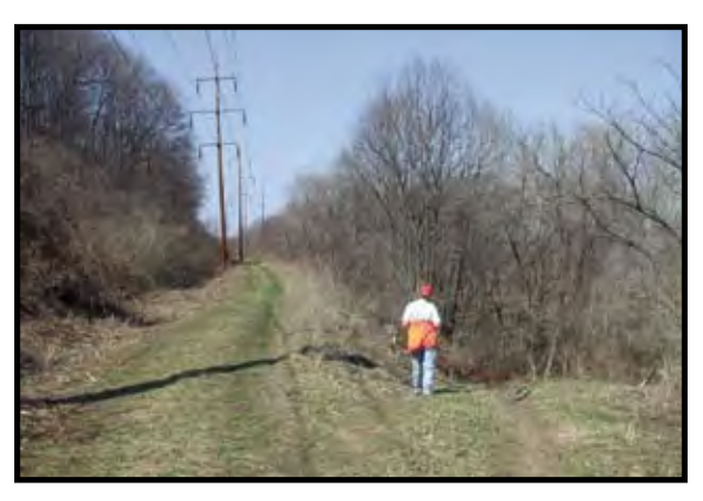
SP 24+800: Dirt access road from N. Y. S. Route 89 near Cass Park. Road could provide emergency and maintenance access to the trail.