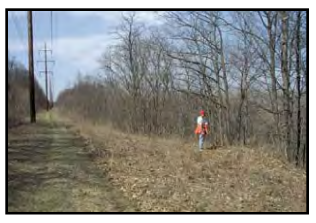
SP 27+500: Proposed location for a trail overlook and interpretive site. This is located at where the trail crosses Williams Creek.