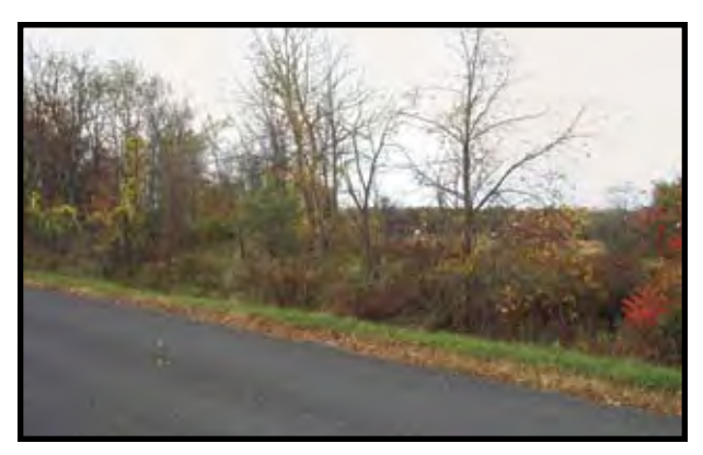
SP 50+200: View of trail corridor north from Houghton Road intersection. This segment of trail is fairly overgrown and difficult to locate in the landscape.

The trail/road interfaces will include the standard gate/bollard system with traffic warning signs as illustrated in Figures V-19 and V-20, pages V-115 and V-116.