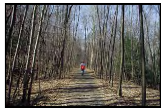
SP 33+000: This section of trail was formerly used by the Cayuga Medical Center, under license agreement with NYSEG, as part of their fitness trail.

The BDT continues north from SP 32+500 on the railroad grade. This section of the trail is relatively clear and passes through dense second growth woodland. The Cayuga Medical Center (CMC) developed walking trails from the hospital downslope to the trail corridor near SP 33+000 and utilized 3,600 linear feet of the railbed under a license with NYSEG, the previous owner. CMC surfaced the corridor with 2 - 4" diameter stone. The stone will provide a firm base for the stonedust surfacing.