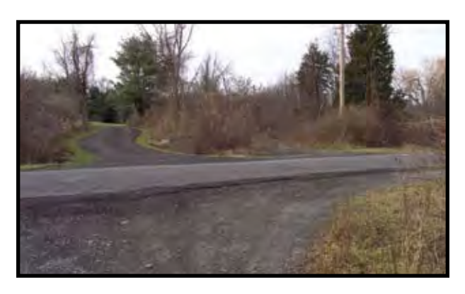
SP 48+500: View of trail corridor north of Garrett Road. Adjacent property owners reconstructed their driveway, to the left, to eliminate a perpendicular crossing of the trail.

represent the existing condition at Garrett Road. The trail/road interfaces will include the standard gate/bollard system with traffic warning signs as illustrated in Figures V-19 and V-20, pages V-115 and V-116.