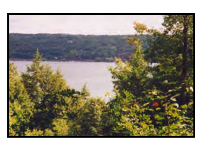
SP 32+500: For the first 4 miles north from Allan H. Treman, the trail passes through a woodland setting. Glimpses of Cayuga Lake through the woods occur occassionally at hillside stream crossings.