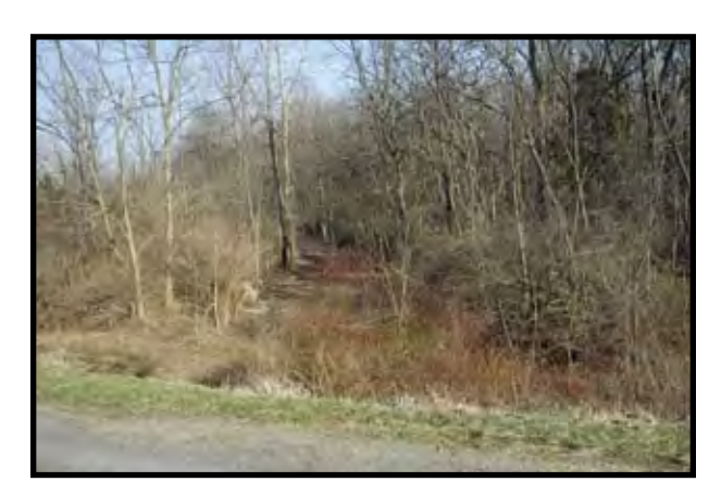
SP 66+300: View south from Gorge Road to trail corridor. Gorge Road is 8 feet above the trail elevation. Ramps will need to be constructed in this area.

Gorge Road is approximately 8 feet higher in elevation than the surrounding landscape and will require constructing ramps on both approaches for the trail to meet ADA slope requirements. Visibility at the crossing is good in both directions and the road is level at the point of crossing.