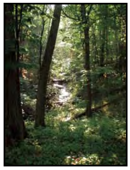
SP 35+000: View west from the trail corridor to Indian Creek. This site is a proposed overlook and interpretive site.

At SP 35+000 there are very nice views of Indian Creek, one of the larger hillside creeks, to the west. The area provides an excellent spot for a seating and rest area.