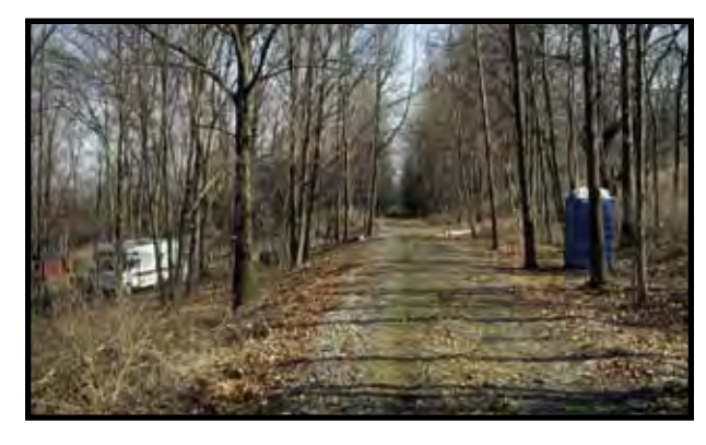
SP 42+500: A residence has been built along the east side of the corridor. A screening treatment is recommended between the trail and adjoining land use.

North of Glenwood Creek the corridor is packed gravel and clear of vegetation. Property to the east of the corridor has been developed for residential use. Screening between the trail and buildings on the property is recommended between SP 42+500 and SP 43+000.