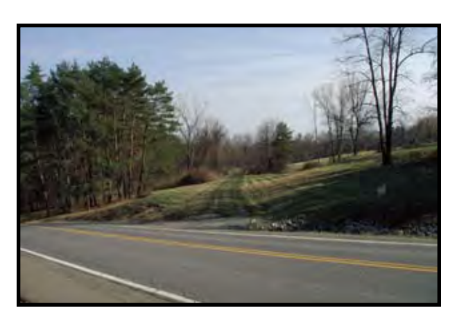
SP 43+700: View of the trail south of Perry City Road. Road crosses at a 45-degree angle and has a steep cross slope towards the east (left in photo.)

The trail/road interfaces will include the standard gate/bollard system with traffic warning signs as illustrated in Figures V-19 and V-20, pages V-115 and V-116.