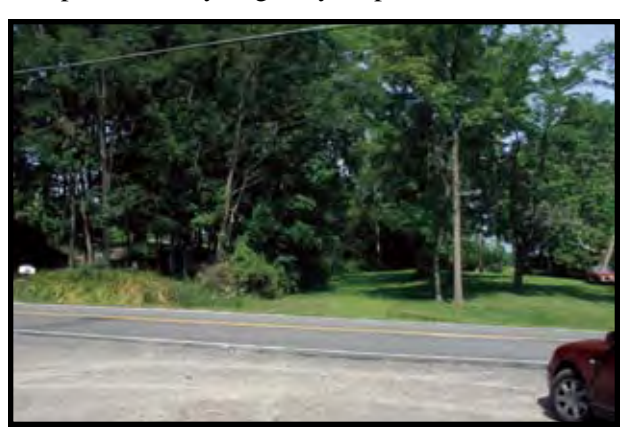
SP 55+500: Trail crossing at Kraft Road has good visibility in both directions.

Signs warning motorists of the trail crossing will be installed on the road in consultation with the Tompkins County Highway Department.