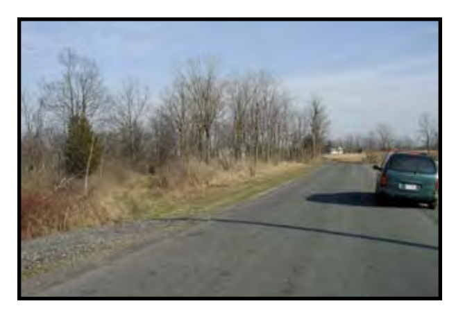
SP 60+500: View looking south of trail intersection with Willow Creek Road. Trail realignment at this crossing is recommended to have trail users approach the road at a 90° angle.

Signs warning motorists of the trail crossing will be installed on the road in consultation with the Town of Ulysses Highway Department.