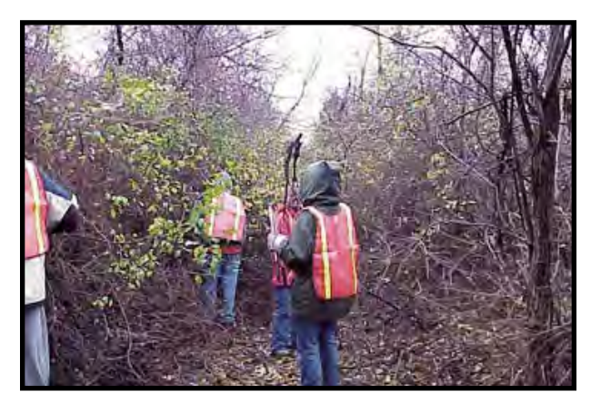
SP 61+000: In 2000, a group of volunteers came to clear brush from the trail corridor between Taughannock Falls State Park and Willow Creek Road.

This section of trail was cleared by volunteers working with State Parks crews in 2000 and park maintenance staff in 2005-2006 and again by volunteers in spring 2007.