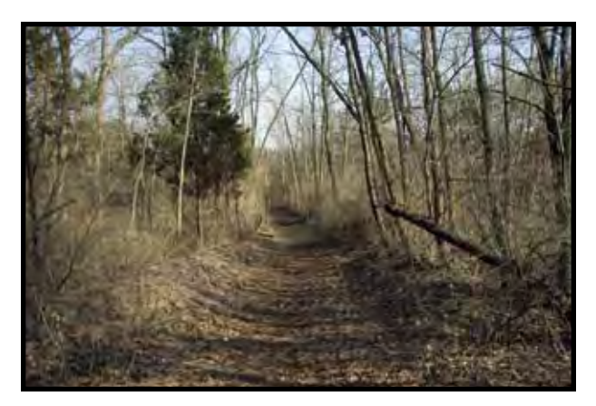
SP 66+500: Former railroad corridor north of Gorge Road. The Taughannock railroad station was located on the left side. Remnants of the station foundation still exist.

The trail will cross Taughannock Creek on an existing railroad bridge that is currently used as a creek crossing for the park's Upper Rim Trail. The bridge should undergo some decking repairs and a structural analysis to determine the condition of its abutments and its overall structural integrity. A new railing system will also be needed. The views of the gorge from this bridge are exceptional in both upstream and downstream directions. Design of the railing system should take the aesthetics into