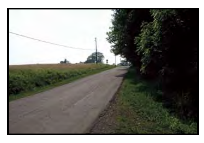
SP 41+300 W: View west at intersection of the trail crossing of Glenwood Heights Road. Site distance is adequate in the upslope direction from both north and south trail approaches.

Signs warning motorists of the trail crossing will be installed on the road in consultation with the Town of Ulysses Highway Departments.