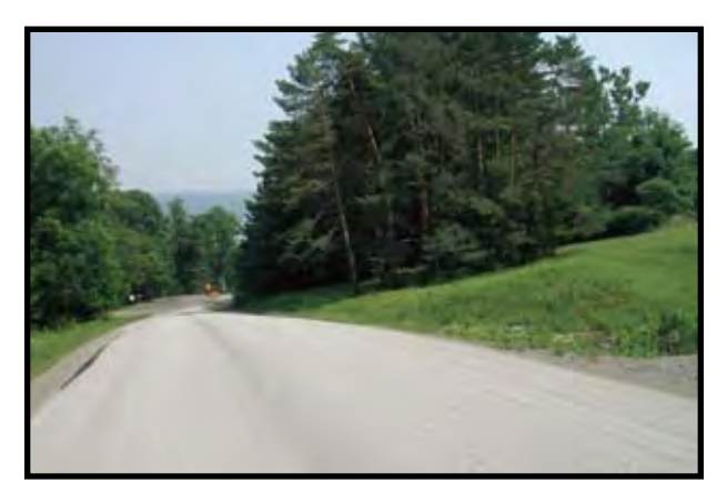
SP 43+700: Trail crossing of Perry City Road. View downslope to N.Y.S. Route 89. Visibility is good in both directions.

road steepens as it approaches N. Y. S. Route 89. The following photos illustrate the crossing conditions at Perry City Road.