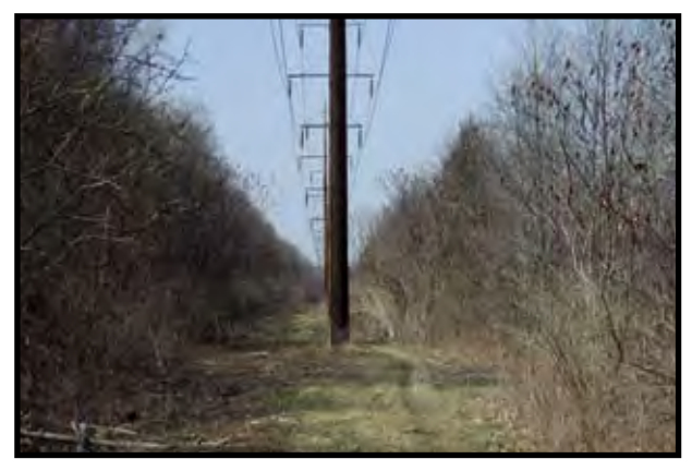
SP 24+000: Between the Cass Park Trailhead and approximately SP 32+500 the trail will co-exist in the corridor with an existing electric transmission line. The trail weave around the poles.