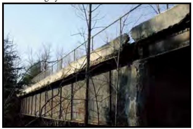
SP 67+200: Existing railroad bridge over Taughannock Creek gorge. The bridge is currently part of the state park's rim trail system. Upgrades to the structure will be needed.

The trail will cross Taughannock Creek on an existing railroad bridge that is currently used as a creek crossing for the park's Upper Rim Trail. The bridge should undergo some decking repairs and a structural analysis to determine the condition of its abutments and its overall structural integrity. A new railing system will also be needed. The views of the gorge from this bridge are exceptional in both upstream and downstream directions. Design of the railing system should take the aesthetics into