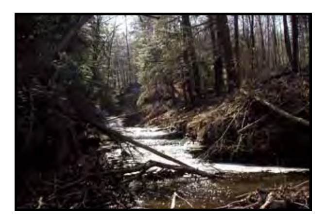
SP 42+250: View west of Glenwood Creek.

The scenic quality of the Glenwood Creek would be better supported by a bridge structure. In addition, if possible, some of the former trestle structure could be stabilized and saved for interpretation as it illustrates how trestle crossings were constructed in the 19th century. South of the creek, on the west, uphill side of the proposed trail, there is an access ramp down to the creek level that was likely constructed for maintaining the culvert pipes. The uphill views of the creek and falls, represented in the following photo, are very scenic and present a unique opportunity to develop a seating area in this location.