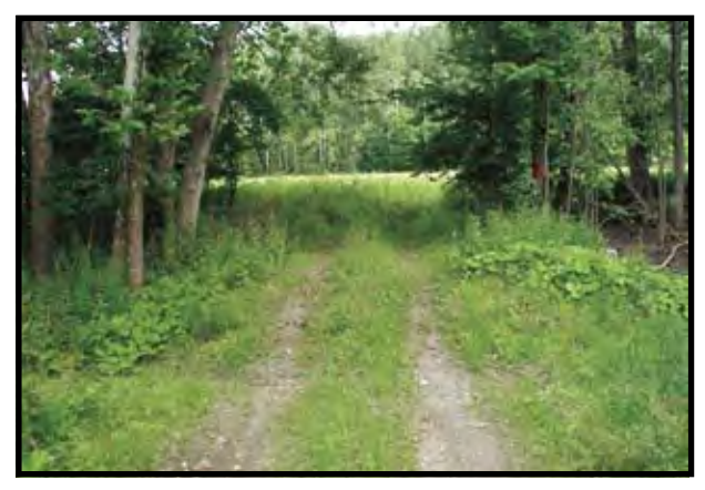
SP 3+600: Proposed trail to be located on gravel/dirt farm road that links small meadow (south) and long meadow (north.) This existing road provides a stable and cost effective base for stonedust trail surfacing.