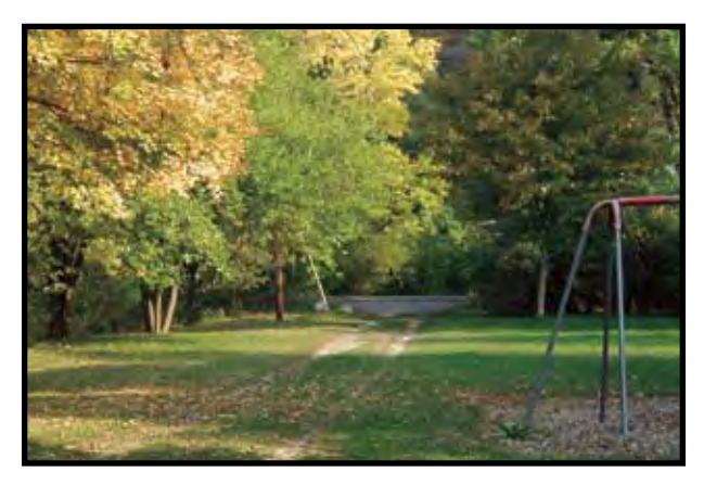
Spur Trail South: Proposed trail through the picnic area, following an existing service lane.