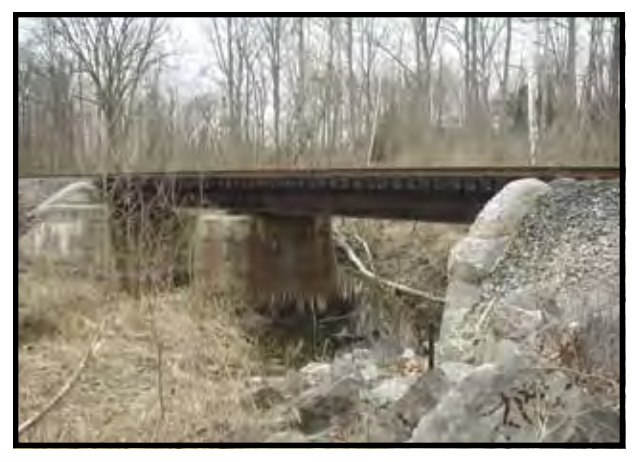
SP 9+000: The trail is proposed to cross the active railroad line under the east (right) bay of this bridge structure. The trail will have to be protected from above with metal or concrete box culvert.