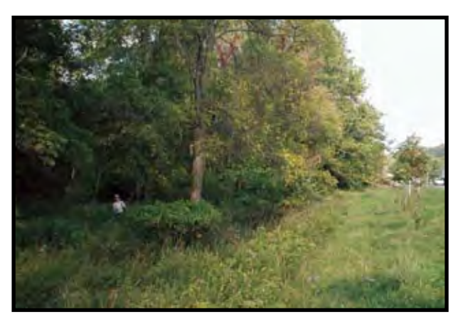
SP 10+800: Northeast of the fishing access parking area the trail will follow the shoulder of N. Y. S. Route 13 for a few hundred feet, then turn to the north through the woodland.