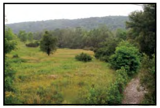
SP 1+600: View east from N. Y. S. Route 13 bridge of meadow between intermittent creek and terrace at adjacent property. Stonedust trail to be along the north edge of the parcel.