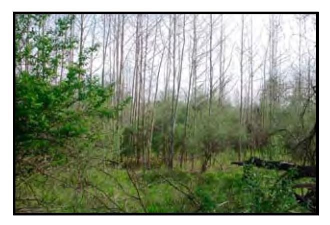
SP 11+800: North of Buttermilk Creek the proposed trail passes through a successional meadow/old field. Numerous invasive Russian olives should be removed in this area as the trail is developed.