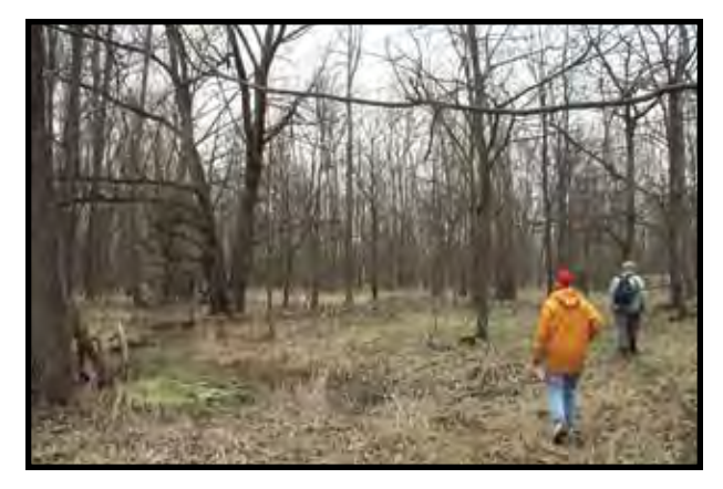
SP 6+500: The proposed trail passes through a triangular shaped forest bounded by the railroad on the east and N. Y. S. Route 13 on the west. One intermittent creek crossing is required.