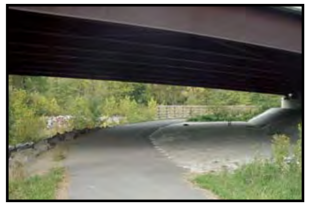
SP 9+800: View northeast of existing asphalt trail under N. Y. S. Route 13 between the Cayuga Inlet and the bridge abutment. Section of trail built by NYSDOT as part of highway reconstruction.