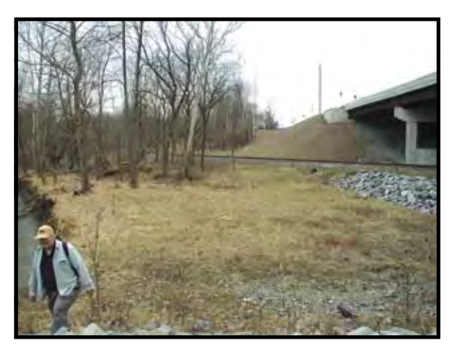
SP 9+500: View south of area between active railroad line and Cayuga Inlet. An earthern trail ramp will be constructed to the top of the rip-rap mound adjacent to concrete bridge abutments.