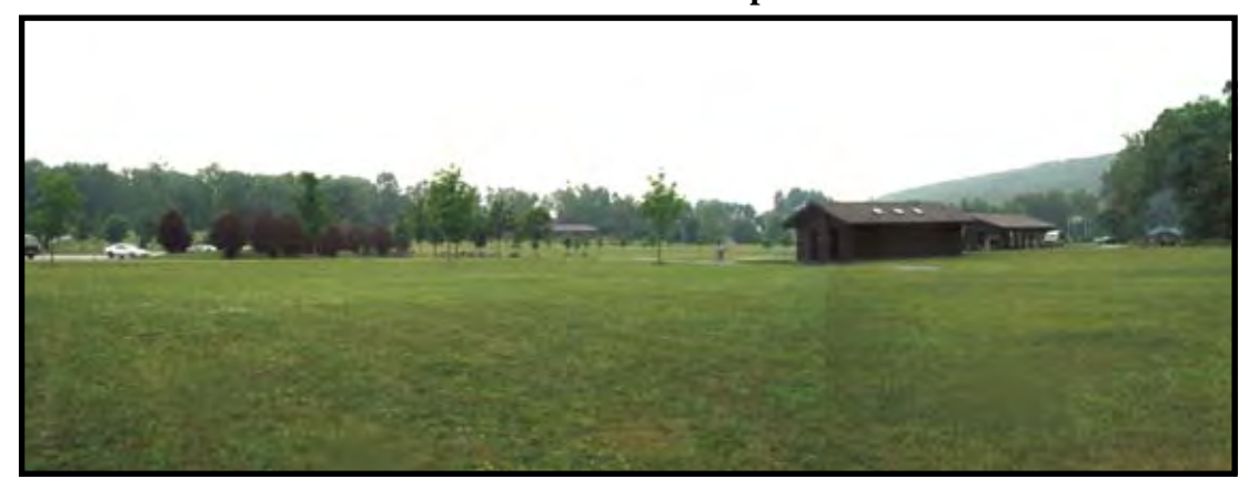
SP 0+000: View northeast of day-use area. The southern-most trailhead for the Black Diamond Trail is located in Robert H. Treman State Park. In 1999, an enclosed pavilion, restrooms and large parking area were constructed at the east end of the park. An trail orientation/information kiosk, bicycle parking and seating will be constructed near the building complex.