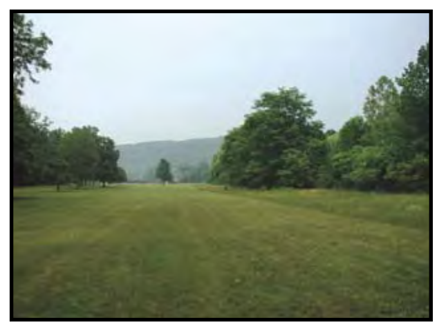
Spur Trail: Trail spur will follow south (right) edge of meadow and end at the swimming-area parking lot. Cyclists can use internal park road system to access camping areas south of Enfield Creek.