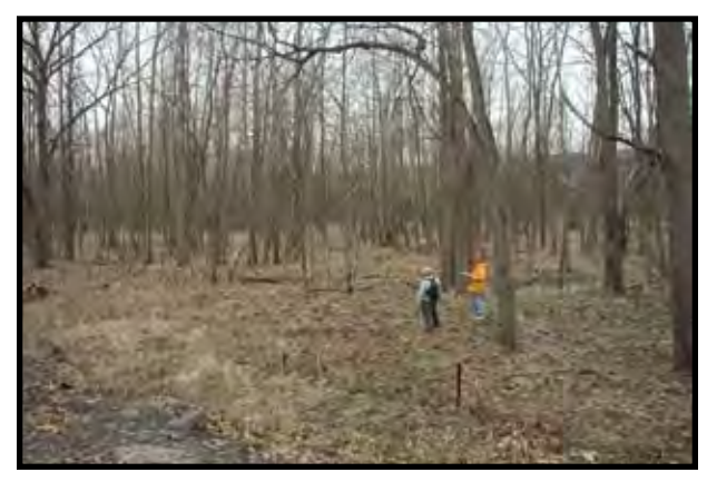
SP 8+800: View south of forest from Norfolk Southern Railroad. Proposed trail route that minimizes tree removal and avoids wetland areas has been marked with orange tape.