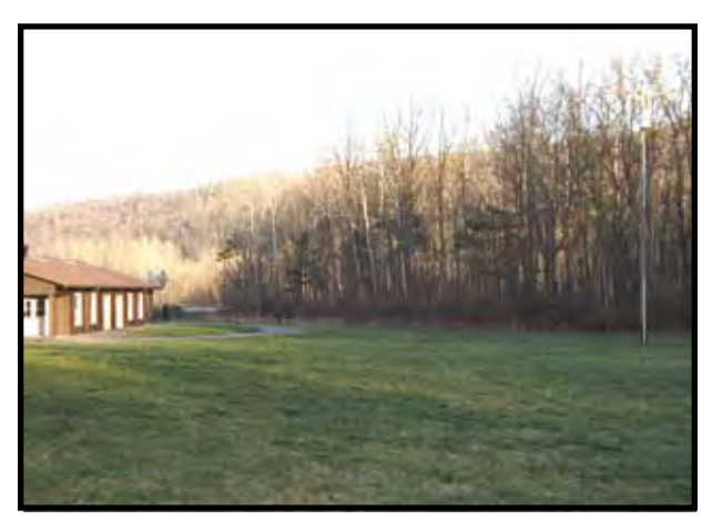
SP 0+000: View east where trail will pass south of the pavilion through the existing electric line utility corridor.