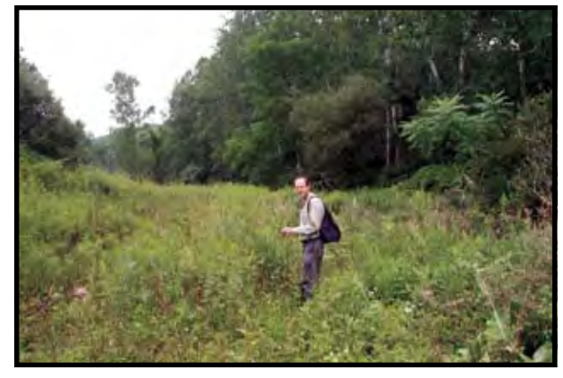
SP 3+000: View north of meadow between terrace bank to west (left) and woodland on east. Proposed trail is to be located in the middle of the space.