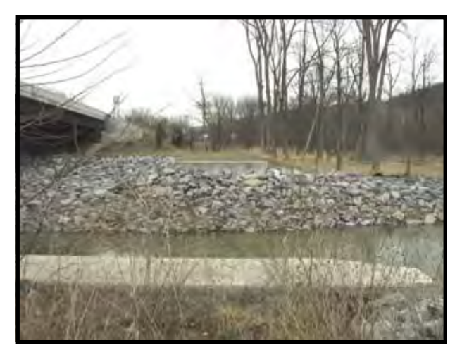
SP 9+700: Concrete bridge abutments were constructed for the Black Diamond Trail by NYSDOT when N. Y. S. Route 13, to the west (left) was reconstructed.

the underpass structure to Norfolk-Southern's standards.