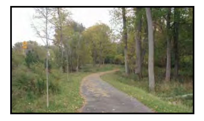
Spur Trail South: View northeast on existing asphalt trail constructed by NYSDOT as part of the N.Y. S. Route 13 project. This trail links the future bridge over the Cayuga Inlet to the Larch Meadow Trail.