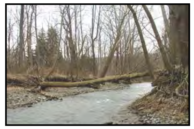
SP 11+400: The trail will cross Buttermilk Creek approximately 500 feet northwest of N. Y. S. Route 13. The bridge will be approximately 80 feet in length.