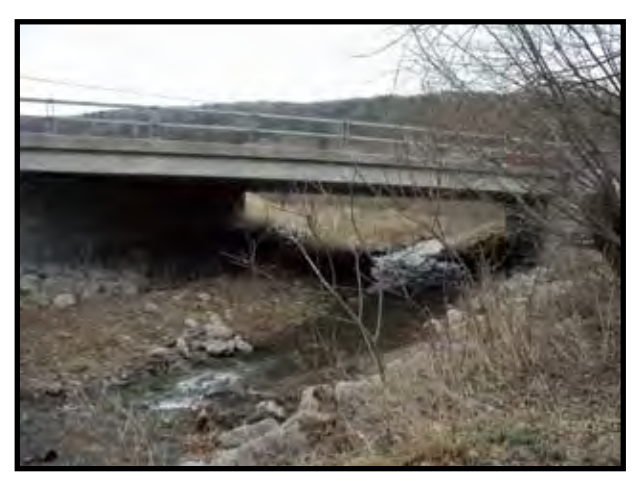
SP 1+500: The trail will cross the intermittent creek on a new trail bridge, then pass under N. Y. S. Route 13 on north side of creek. Trail surface will be concrete under the bridge.