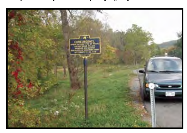
SP 10+200: View northeast along parking area. A state historic marker is located here commemorating the Coreogonal Indian village destroyed by the Sullivan Campaign in 1778.