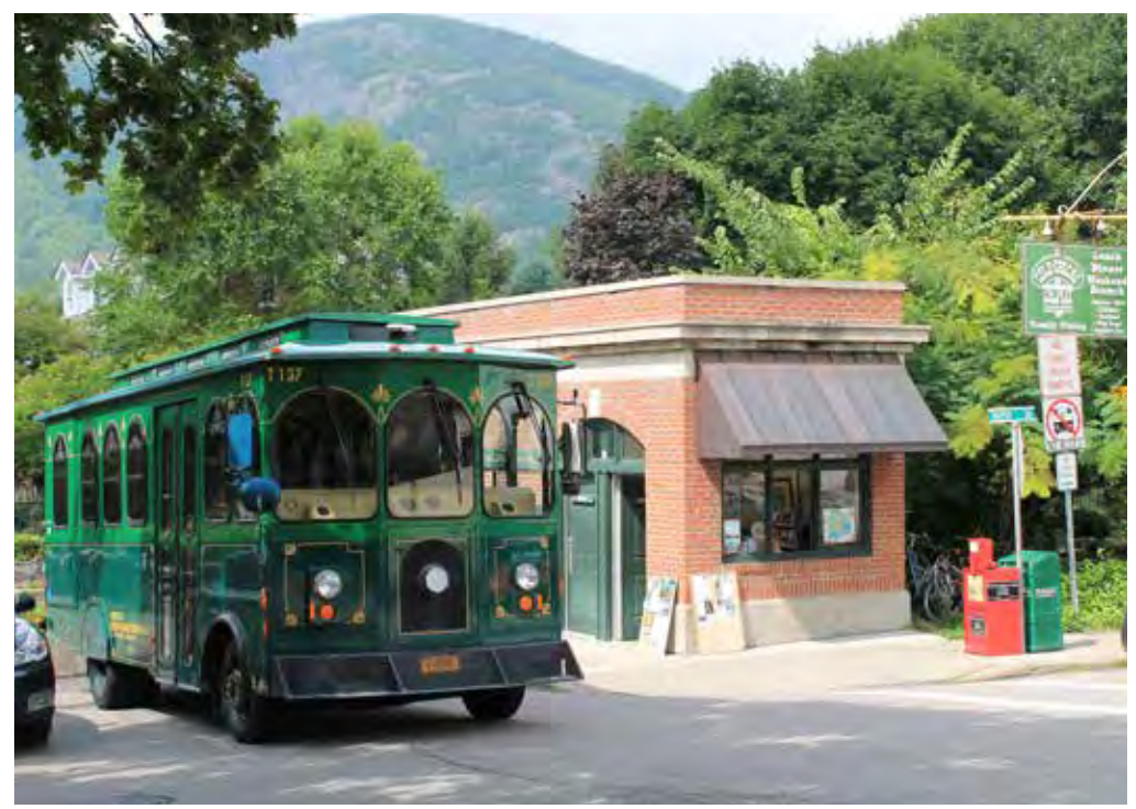
Trolley in Cold Spring, NY

The trolley that serves downtown Cold Spring and the Boscobel Historic House and Gardens, could be expanded during peak hiking season to travel as far north as Dutchess Junction Park to pick up hikers and bring them down Route 9D to the Hudson Highlands State Park Preserve trailheads. Hikers setting out for extended days are best suited to take advantage of this welcome area.