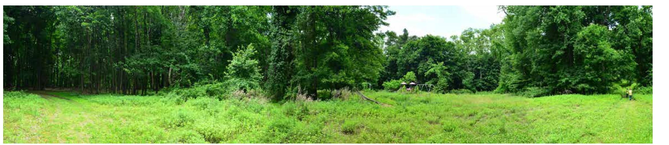
Dutchess Junction Park panoramic view