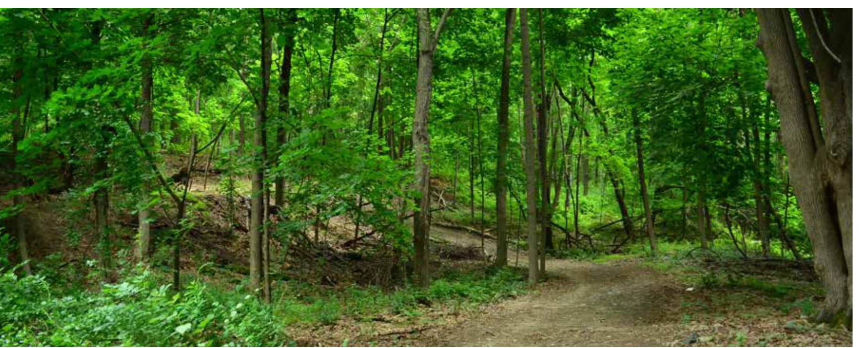
Graded roadway in the Brickyards Parkland