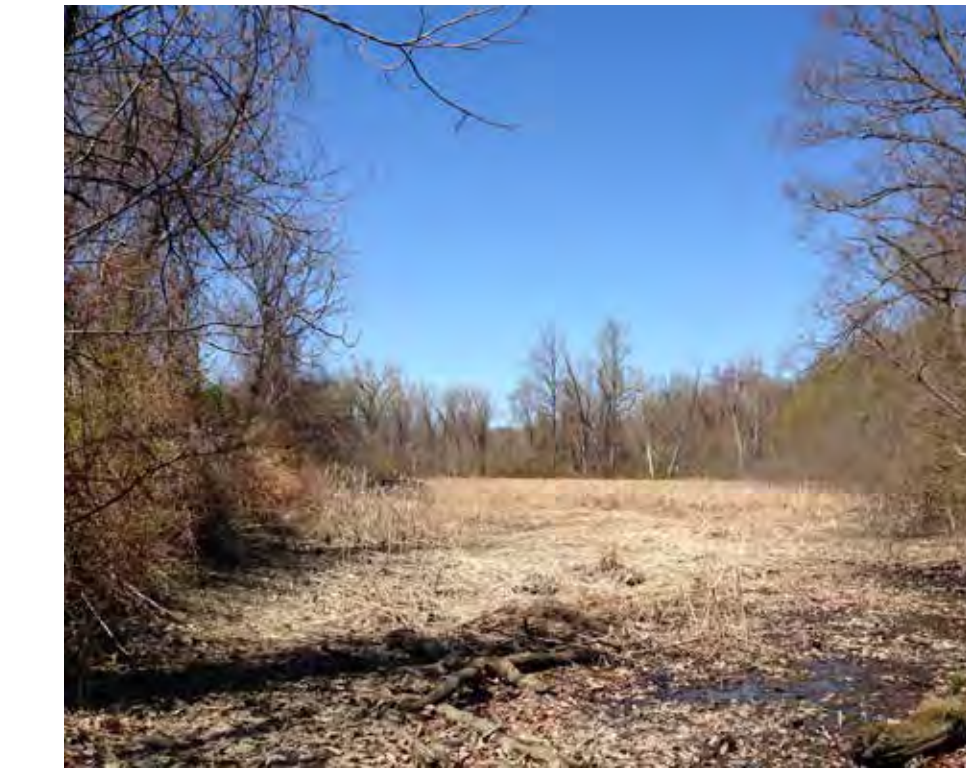
Wetlands in the Brickyards Parkland

Once the second brook is crossed, the trail would follow an old graded roadway and connect to Dutchess Junction Park. This connection is largely in place, with some additional grading and site preparation needed to address steep sections of roadway and to smooth smaller ditches and gullies formed by water runoff.