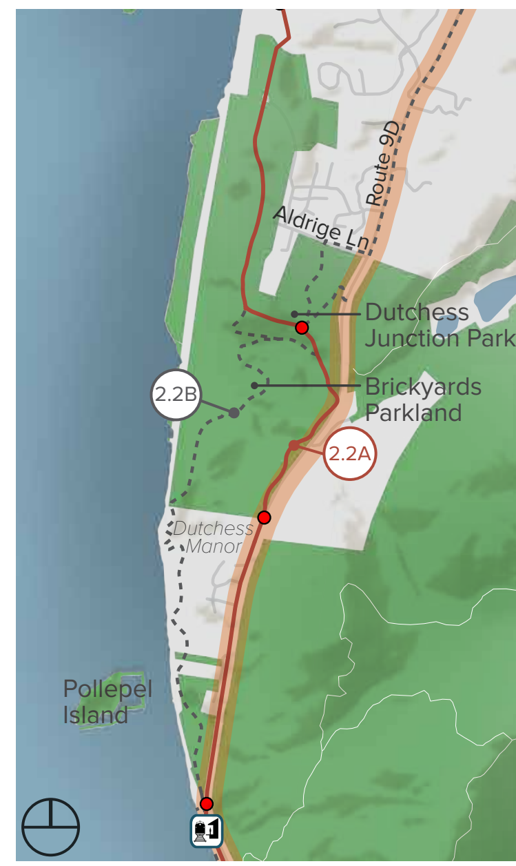
Map 2.2 - Brickyards Parkland to Dutchess Junction Park

Significantly more infrastructure (longer bridges and structures over wet areas) would make the overall cost significantly higher and result in greater disturbance to the surrounding natural environment. As this is a low lying area and mapped as potential historic fill, there are many areas that are wet for part or all of the year. Accessing the site with construction vehicles would also increase the cost in comparison to the preferred route. The likelihood of encountering historic artifacts is also greater in this