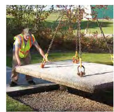
Installation of Storm-crete™ permeable unit pavers

Educating trail users will instill a sense of environmental consciousness. Educational information on maps and trailhead kiosks can be combined with the NY-NJ Trail Conference Trail Stewards that are currently stationed at major trailheads during peak season.