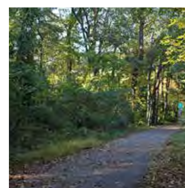
Asphalt trail at-grade

Trail blazing maintenance may be required at times when trail signage is damaged. Trail signage type and placement will be determined under the Signage and Wayfinding plan and will be implemented as portions of the trail are built. Replacement trail markers should be installed by the sponsor/owner or appointed agency.