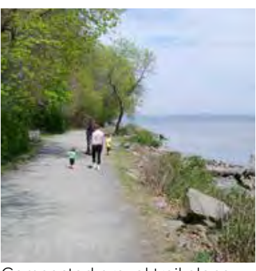
Compacted gravel trail along the Hudson River, Haverstraw State Park