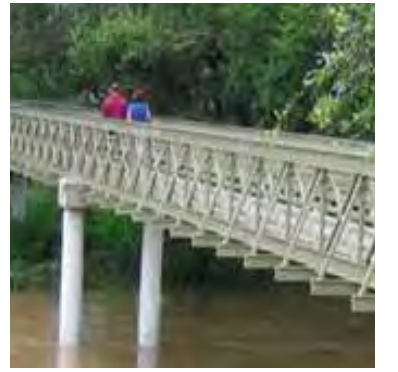
Fiberglass trail over a wetland