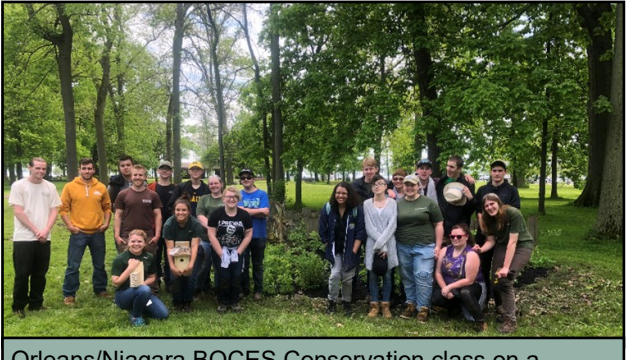
Orleans/Niagara BOCES Conservation class on a work–based–learning field trip at Beaver Island State Park.

the Jr. Conservation Steward positions. We had three students participate, and I am happy to say this led all of them to seasonal positions with the Horticulture Department at Niagara Falls State Park!