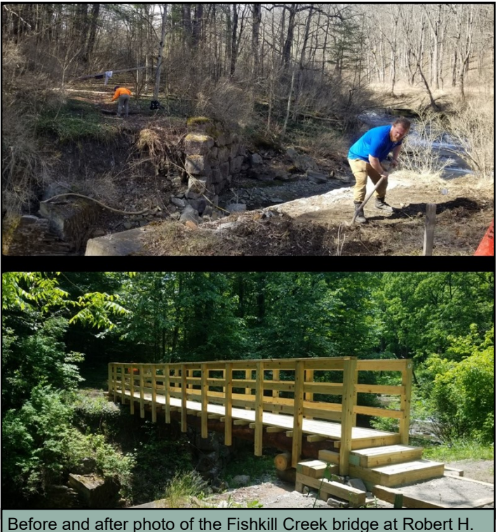
Before and after photo of the Fishkill Creek bridge at Robert H. Treman State Park. This bridge was a collaboration between the Regional Trail Crew, the Cayuga Trails Club, FORCES, and The Student Conservation Association.

Here in the Finger Lakes, one of the best ways to access the natural beauty of the area is by taking a hike on the many trails that can be found within the region's State Parks. Each year thousands of hikers set out to experience a variety of environments including mature forests, meadows, lake shores, and wetlands, along with the deep gorges and dramatic cascades and waterfalls the region is famous for. This large volume of foot traffic, combined with the erosive effects of weather and time, can cause significant damage to a trail corridor. Eventually, as trail erosion increases and hikers begin to meander off established trails, damage spreads to the ecosystems through which the trail passes. Trails can be viewed as an area of focused impact; by planning, building, and maintaining sustainable trail systems, the Finger Lakes Trail Crew creates a place where we can focus and manage human impact in order to preserve the surrounding area.