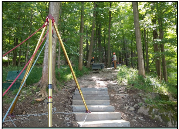
Regional Trail Crew and FORCES Trail Stewards setting up rigging equipment to move stone treads for a staircase at Taughannock Falls SP. Each tread weighs upwards of 300 pounds!

2017 the Finger Lakes Regional Trail Crew has collaborated with FORCES Stewards to achieve this goal. FORCES Stewards provide much needed support to the Finger Lakes Regional Trail Crew through on the ground support for trail construction projects, helping build staircases, retaining walls, boardwalks, bridges, and other trail infrastructure throughout the region. FORCES Stewards also serve in the critical role of on the ground educators, teaching park patrons about Leave No Trace ethics and responsible trail use. These types of in person interactions are a valuable way of encouraging park patrons to help protect the unique natural resources found in our state parks.