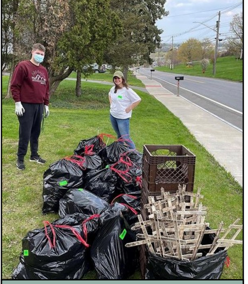
Le Moyne FORCES club members with garbage and debris collected from a campus clean up.