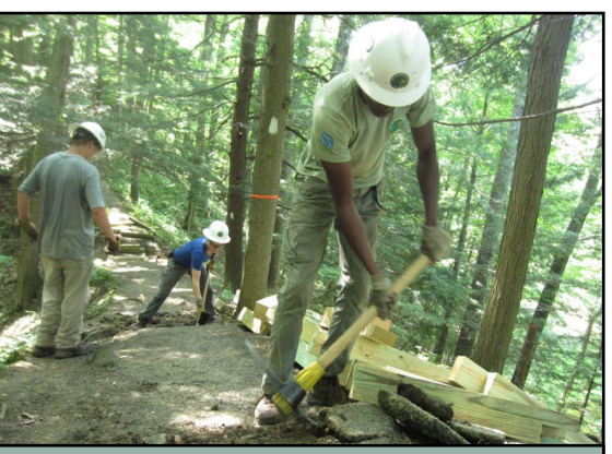
The Excelsior Conservation Corps working with the Finger Lakes Trail Crew and FORCES Stewards to rebuild a timber staircase at Buttermilk Falls State Park.