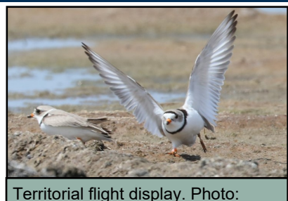
Territorial flight display.