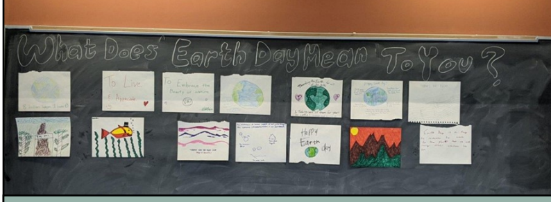
Hartwick College Earth Day Event participants discussed "what Earth Day meant for you" expressed it through drawings.