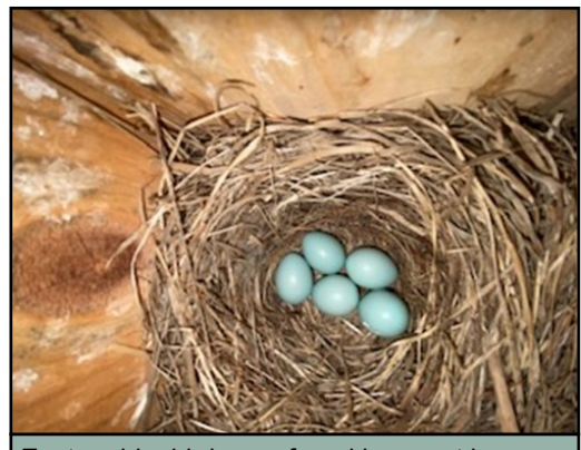
Eastern bluebird eggs found in a nest box.

Woody invasive species and garlic mustard removals have also been a part of the spring field season. In total, eighteen honeysuckle and five autumn olive stems were removed from immediate trail sides in the Green Lakes grassland and 2,879 garlic mustard stems have been removed from the interior of Green Lakes. Garlic mustard removals will continue until mid-June when pale swallow-wort will become the primary focus. By early June, a comprehensive survey of Green Lakes State Park is expected to be completed and efforts will be focused to high priority areas. Invasive Species Control Plans (ISCP) are being written and submitted for Chenango, Glimmerglass,