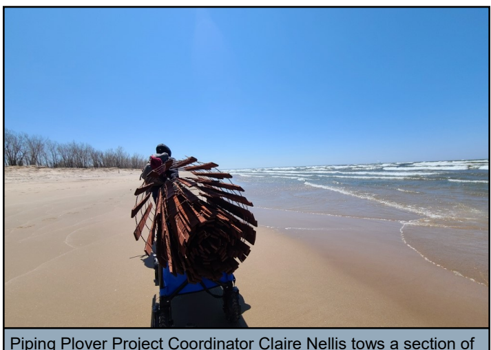
barrier fencing at Sandy Island Beach.

Throughout this issue of our FORCES newsletter, you'll learn about all the projects, events and Stewards that have made our program brighter and more brilliant than ever. Hopefully, as you turn the pages of this issue, its contents will bring you many smiles...perhaps maybe even until your face turns blue:)