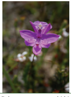
Calopogon, a rare orchid inhabiting the cranberry bog.