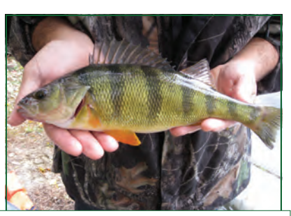
This colorful yellow perch was among the fish captured. Its age was later interpreted to be 16 years!

Tom Hughes, NRS Central and Finger Lakes