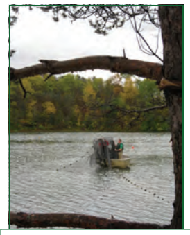
The scenic waters of the reservoir provided a unique learning experience.