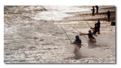
the fish, wildlife and the local people. (That strengthens the interconnections part too!)

Take involvement of the public for example. Say you're doing a water quality project with the objective of cleaning the water to improve fish and wildlife habitat. Do people get their drinking water from here? Do they fish here? Talk to them and find out. Incorporating their needs will probably strengthen your cause – this water needs to be clean for