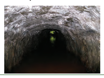
Overwintering\ Location-Sunk\ Mine

to a sample of the hibernating bats in a hibernaculum in Clarence Fahnestock Memorial State Park site in an effort to better understand the normal body temperature fluctuations of healthy bats as compared to bats with WNS.