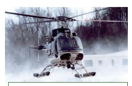
Aerial deer survey with State Police Aviation Unit -Batavia

herbaceous and shrub layers of the forest are mostly eliminated except for non-native invasive plant species. In order to document the deer impacts, standard point counts, deer trail mapping, and an aerial deer survey were all completed along with the designation of six vegetation monitoring plots. These plots will be evaluated in the spring and summer for plant abundance and diversity. These plots are situated in the three different ecologically significant forest community types in both the hunting and no hunting zones of the park. With all the data gathered this winter and the upcoming field season, a natural resource management plan will