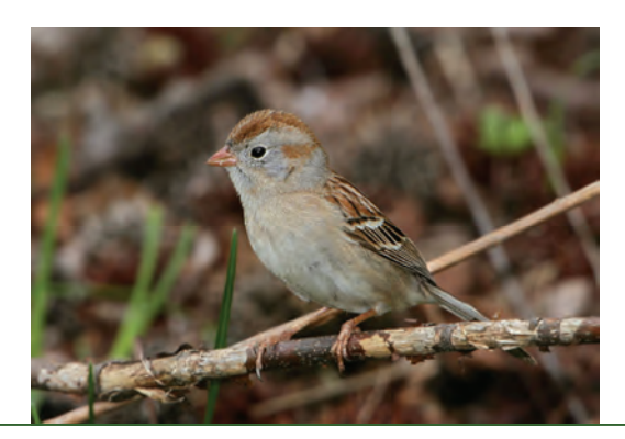
The restoration project will enhance habitat for shrubland-dependent birds such as the Field Sparrow.