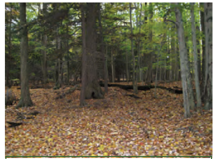
Vegetation monitoring plot

This winter at Letchworth State Park various steps have been taken for a biodiversity and deer impact assessment. Inside the no hunting zones of the park, extreme deer browse is prevalent, causing a loss of biodiversity. The