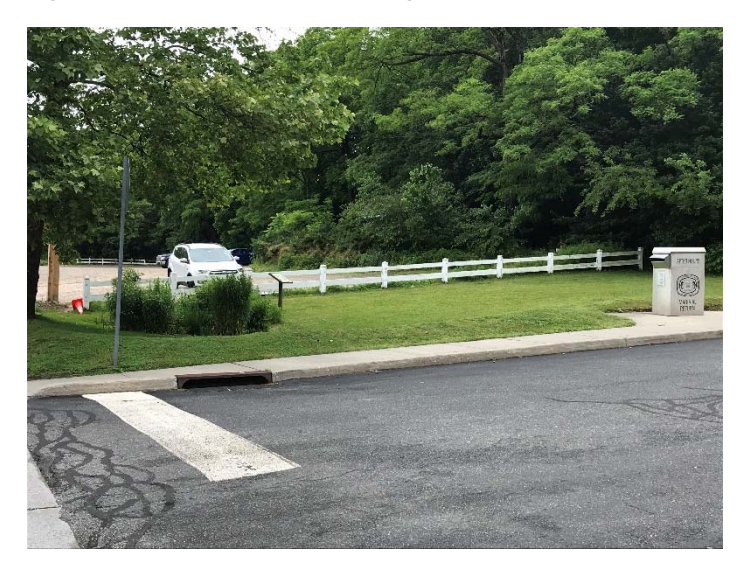
Figure 5 – View of site and CSHSP parking lot.