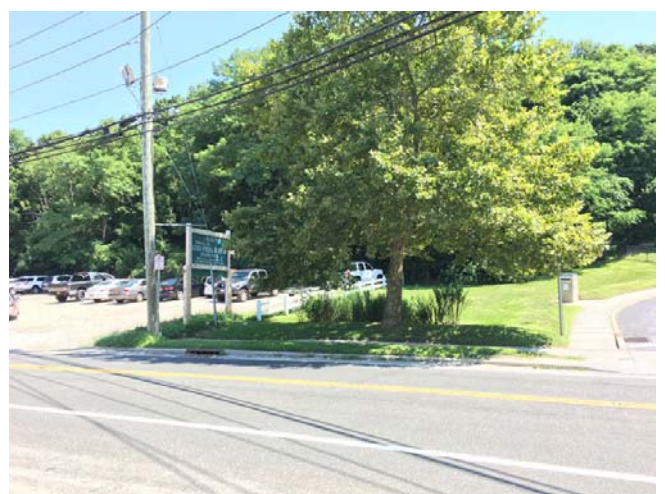
View of monument site from street.

The artist and their sub-contractors (herein known as "Bidder") will be responsible for conducting site research as needed and is expected to provide a conceptual site design plan which will be developed and implemented by the OPRHP Long Island Regional staff. Site Plan and additional site photos may be found in Exhibit 1.