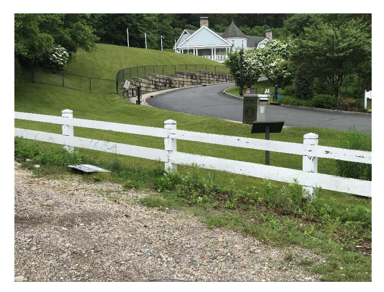
Figure 7 – View of slope towards the Library from parking lot.