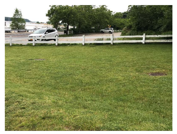
Figure 7 – View from sidewalk along Library driveway.