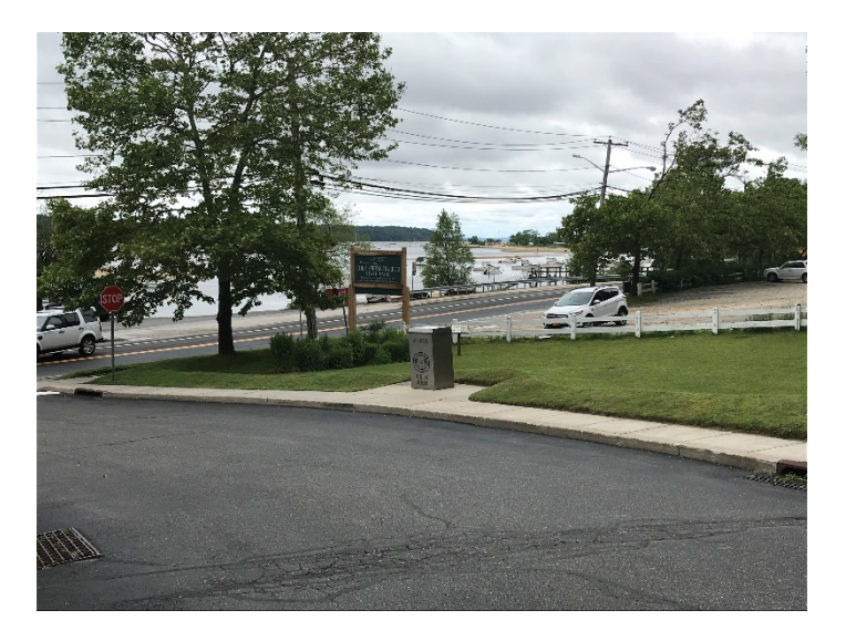
Figure 3 – View towards Cold Spring Harbor.