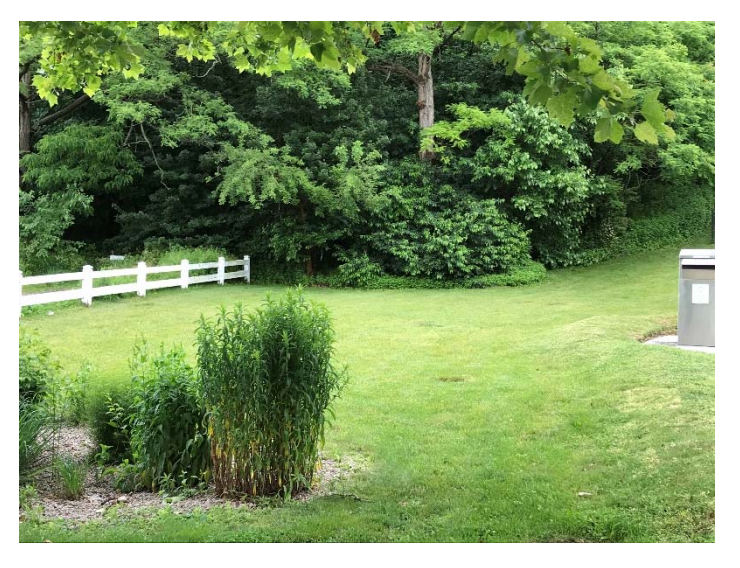
Figure 6 – View of proposed monument location from sidewalk.