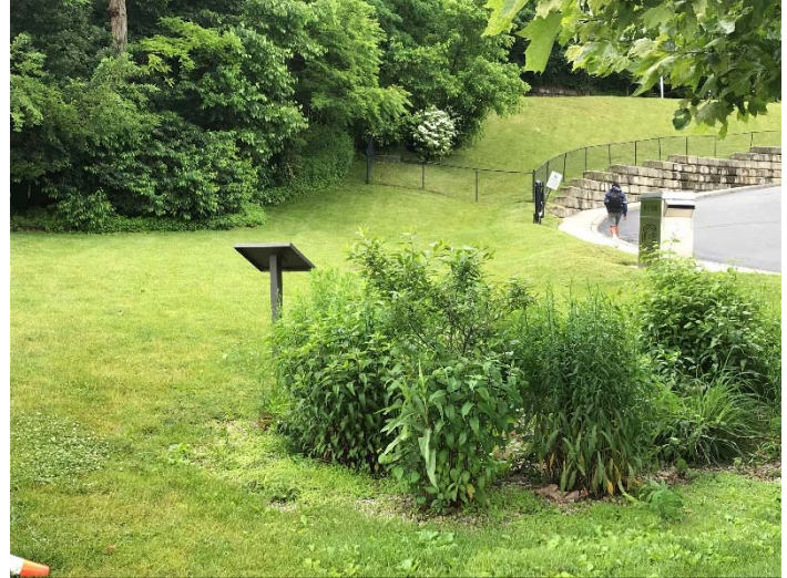
Figure 4 – View of rain garden.