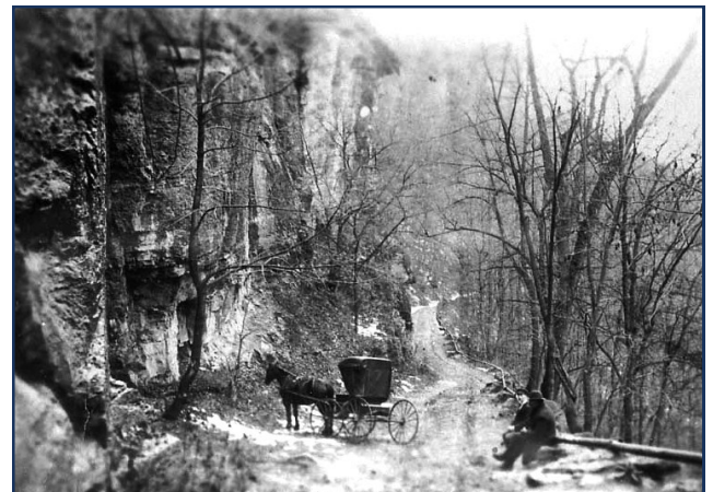
Indian Ladder Road, built in the early nineteenth century to connect farms atop the escarpment to communities below, undated.